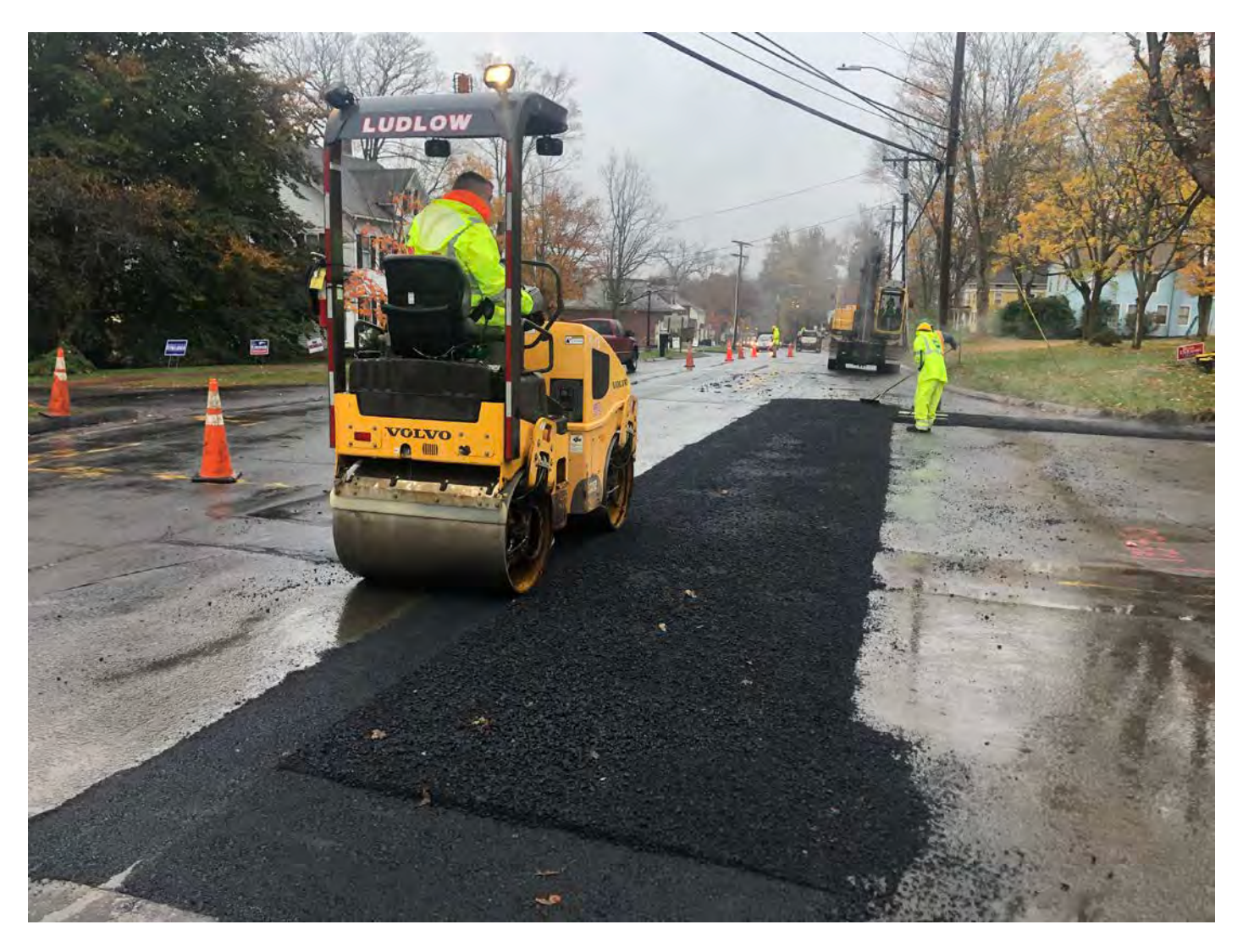
Picture 5: Ludlow compacting the third of three 3" lifts of asphalt between Stations 195+30 to 195+85 as part of permanent paving activities on the southbound lane of Main Street, Durham. View to the south.