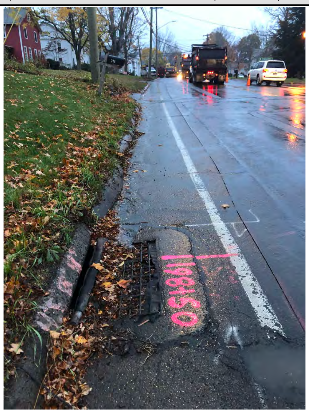
Picture 1: Catch basin with installed silt sock located at Station 198+50 located downstream and south of where Ludlow is placing permanent paving between Stations 195+30 to 195+85 on the southbound lane of Main Street, Durham. View to the north.