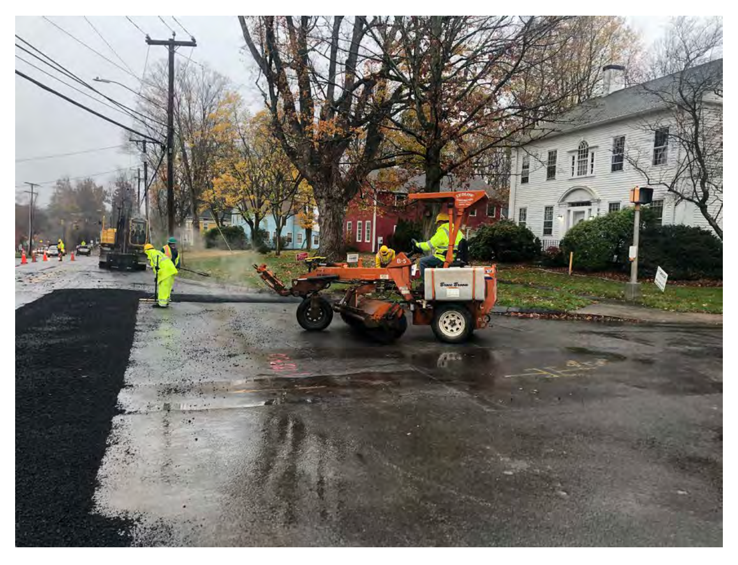
Picture 6: Ludlow cleaning up work zone between Stations 195+30 to 195+85 as part of permanent paving activities on the southbound lane of Main Street, Durham. View to the south.