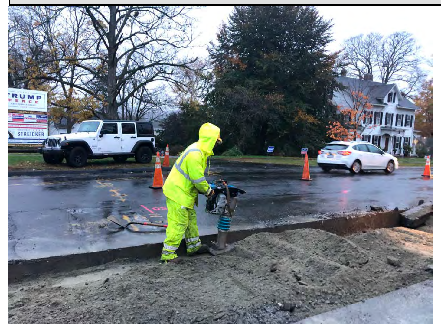
Picture 3: Ludlow compacting 1.5" processed gravel between Stations 195+30 to 195+85 as part of permanent paving activities on the southbound lane of Main Street, Durham. View to the southeast.

Project #:AECOM: 6061487Report No:189Contractor:Ludlow ConstructionPage:6 of 10