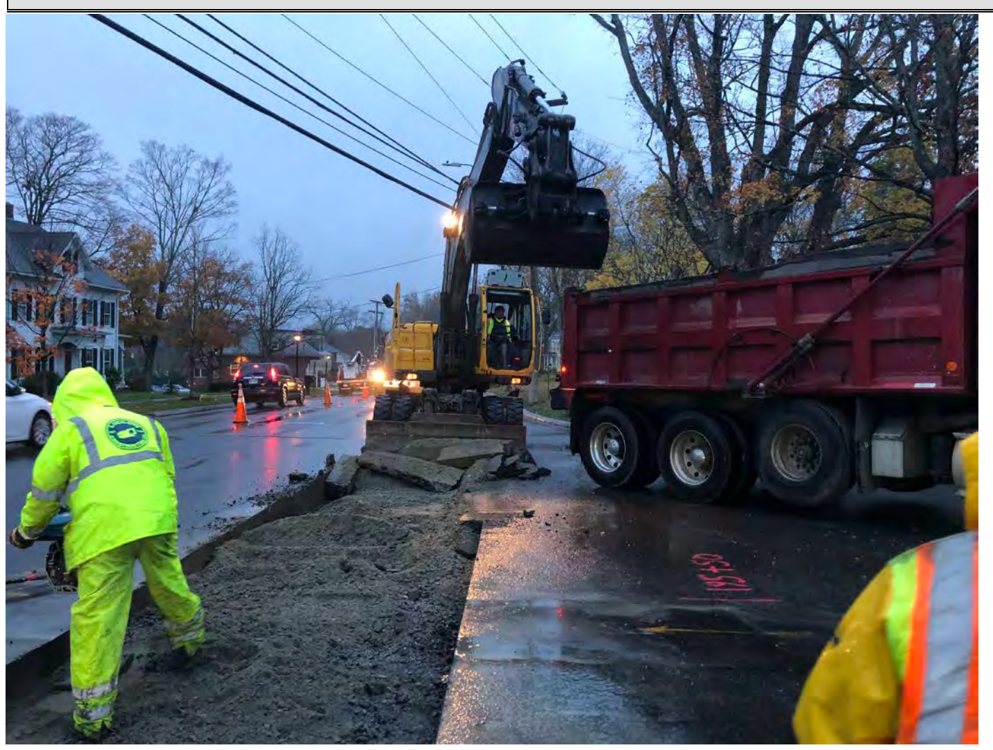
Picture 2: Ludlow stripping pavement away from trench overcuts between Stations 195+30 to 195+85 on the southbound lane of Main Street, Durham, as part of permanent paving activities. View to the south.

Project #:AECOM: 6061487Report No:189Contractor:Ludlow ConstructionPage:5 of 10