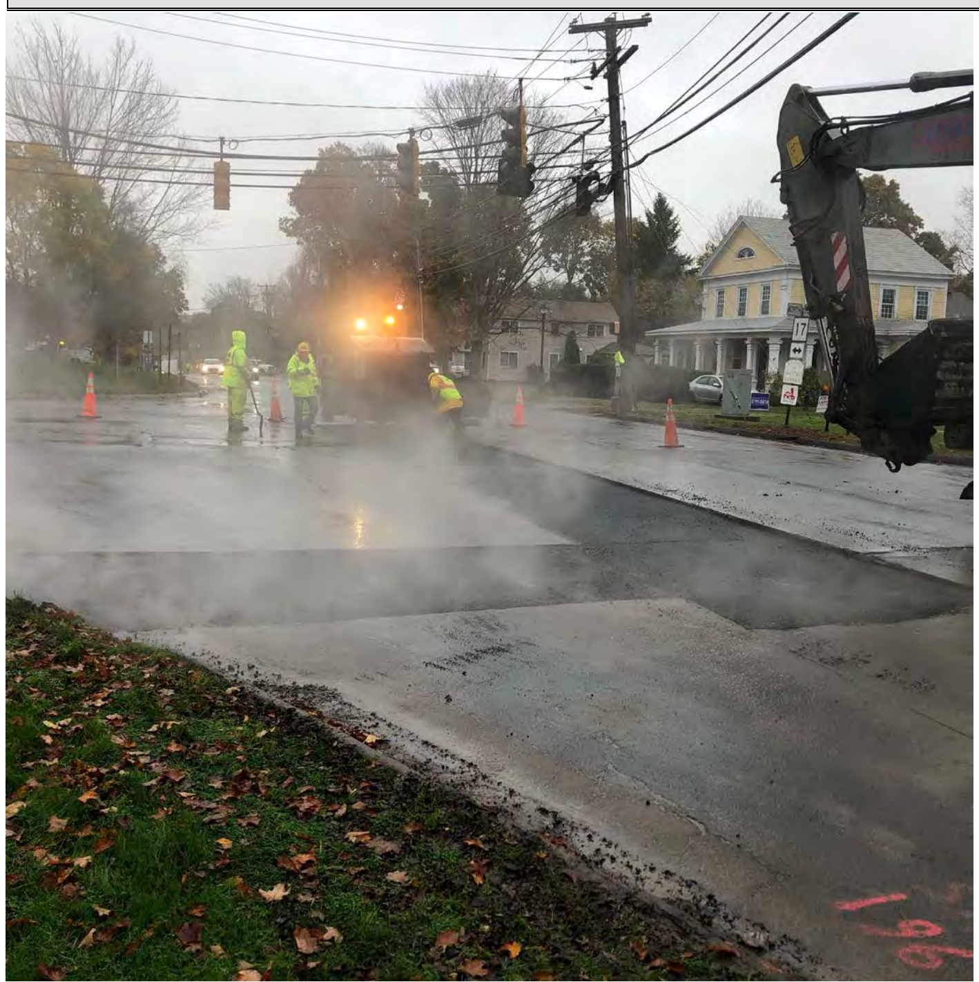
Picture 4: Ludlow placing asphalt on trench overcut between Stations 195+30 to 195+85 on the southbound lane of Main Street, Durham, as part of permanent paving activities. View to the north.

Report No: 189 Project #: AECOM: 6061487 Contractor: Ludlow Construction Page: 7 of 10