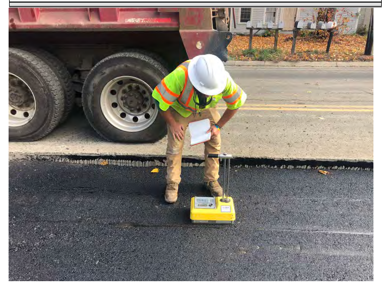
Picture 5: JTC collecting compaction data from the first lift of asphalt that Ludlow placed and compacted between Stations 192+70 and 195+30 on the southbound lane of Main Street, Durham. View to the east.