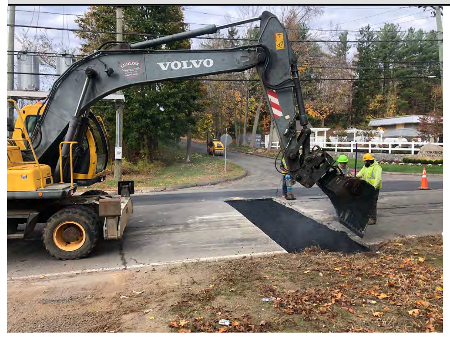
Picture 4: Ludlow applying a second lift of asphalt on a curb stop overcut on the northbound lane of Main Street, Durham, as part of permanent paving activities. View to the west.