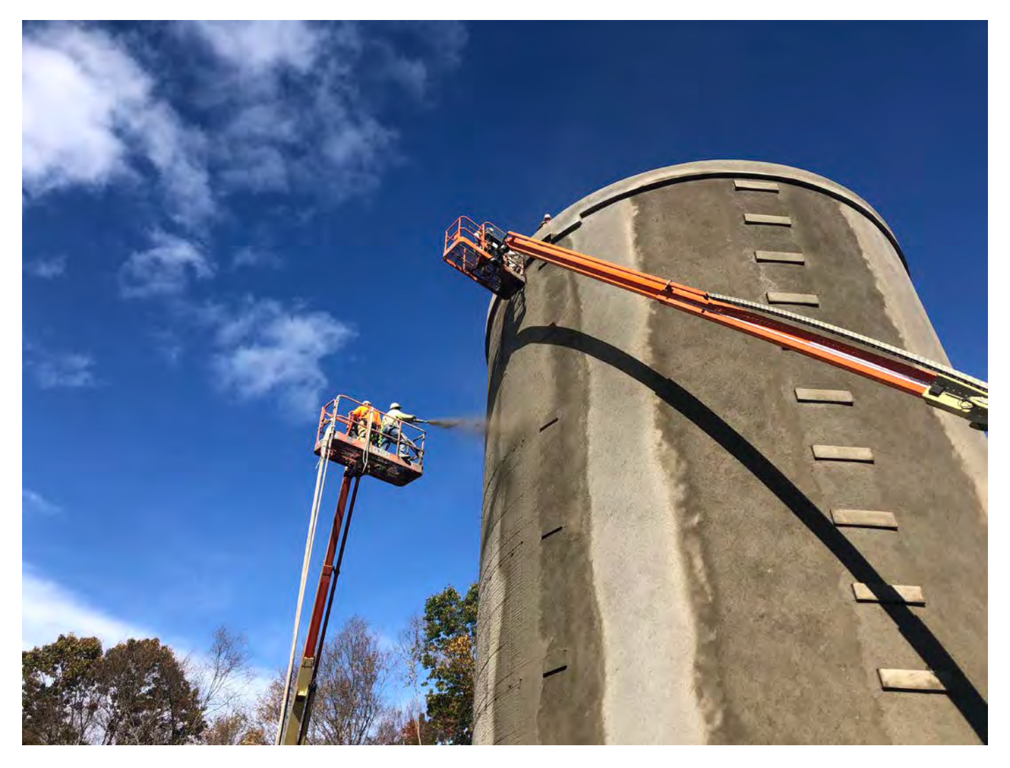
Picture 10: DN Tanks applying shotcrete to the west side of the water tank, east of the Shared Access Driveway, Middletown. View to the north.