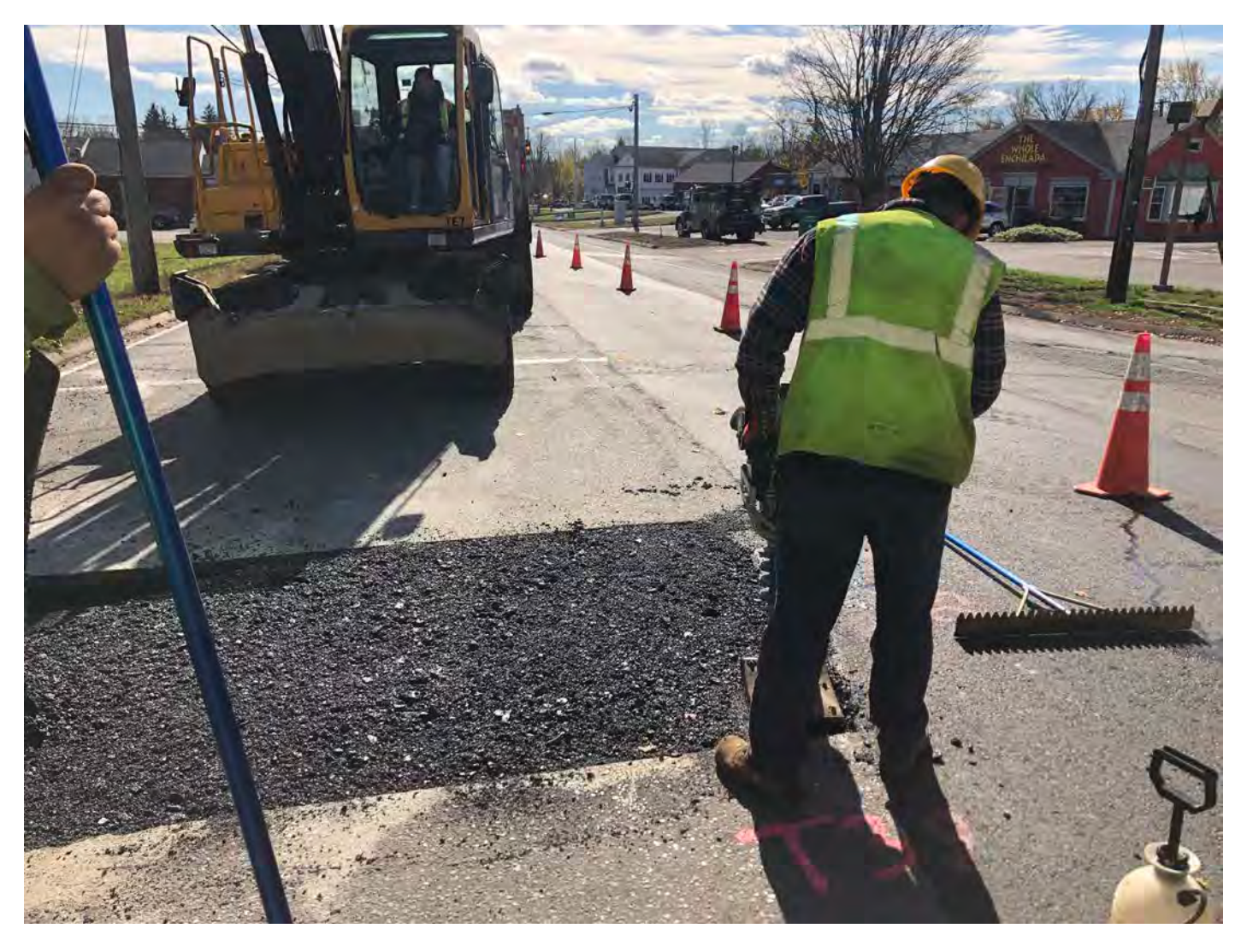
Picture 8: Ludlow compacting a second lift of asphalt on a curb stop overcut located on the northbound lane of Main Street, Durham as part of permanent paving activities. View to the south.