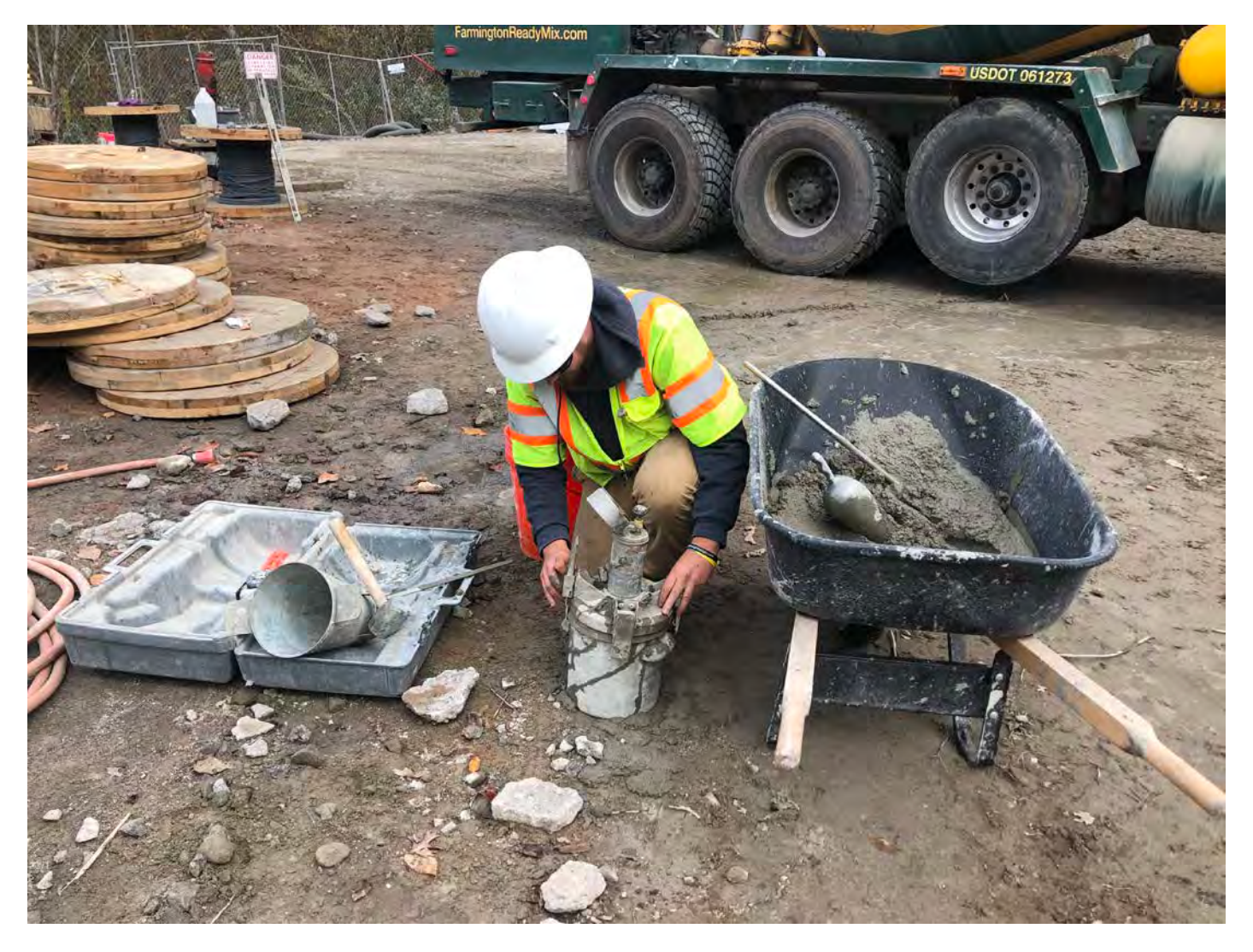
Picture 9: JTC preparing an air entrainment test from the first load of shotcrete delivered to the water tank work zone today, east of the Shared Access Driveway, Middletown. View to the northeast.