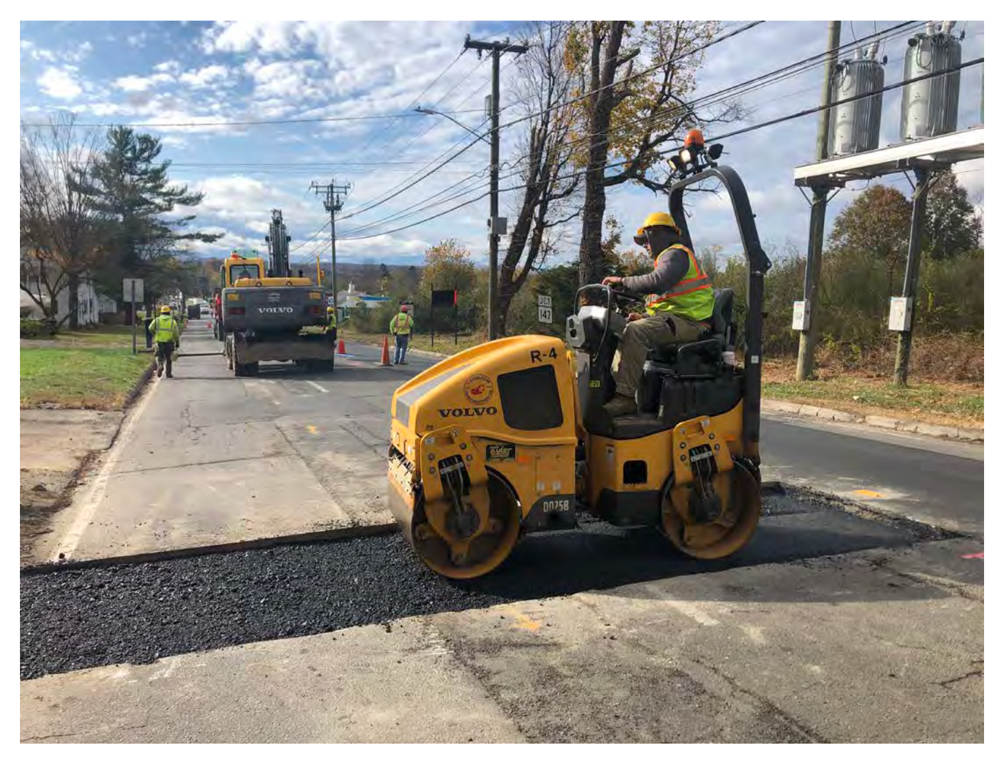
Picture 7: Ludlow compacting a second lift of asphalt on a curb stop overcut located on the northbound lane of Main Street, Durham as part of permanent paving activities. View to the south.