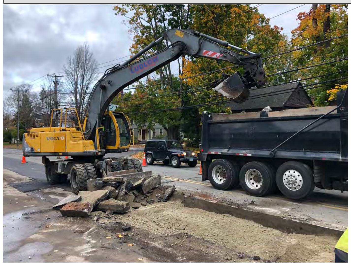
Picture 2: Ludlow stripping pavement away from trench overcuts between Stations 192+70 and 195+30 on the southbound lane of Main Street, Durham, as part of permanent paving activities. View to the northeast.