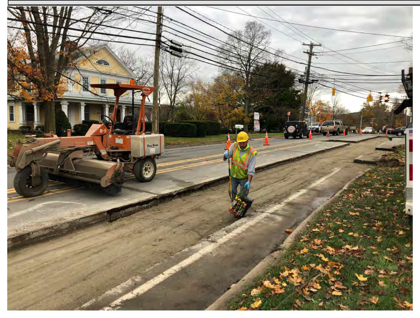
Picture 3: Ludlow applying tack coat to the edge of cut pavement between Stations 192+70 and 195+30 as part of permanent paving activities on the southbound lane of Main Street, Durham. View to the southeast.