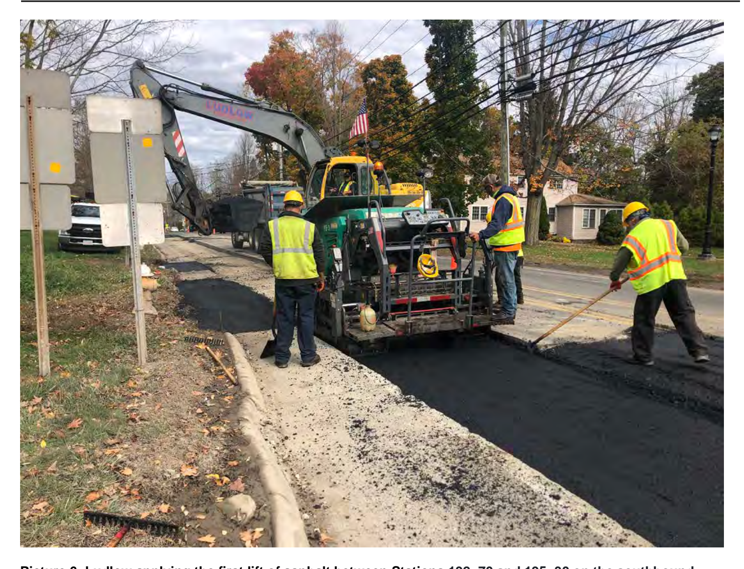
Picture 6: Ludlow applying the first lift of asphalt between Stations 192+70 and 195+30 on the southbound lane of Main Street, Durham as part of permanent paving activities. View to the northeast.