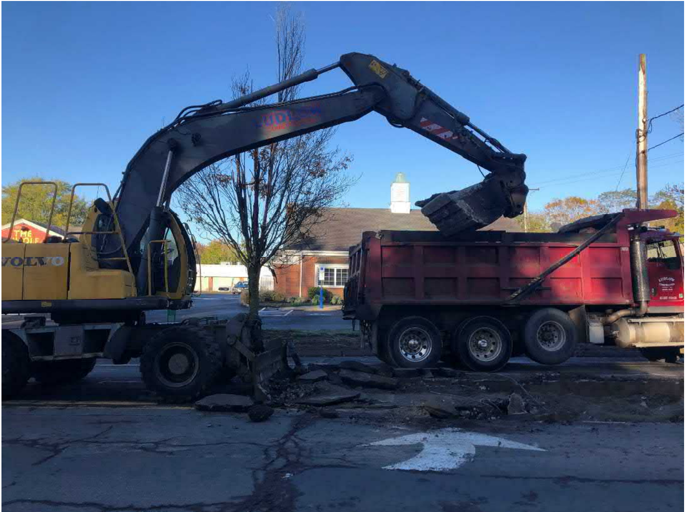
Picture 1: Ludlow excavating pavement on the trench overcuts for permanent paving on the southbound lane of Main Street, Durham, between Stations 164+25 to 167+30. View to the west.