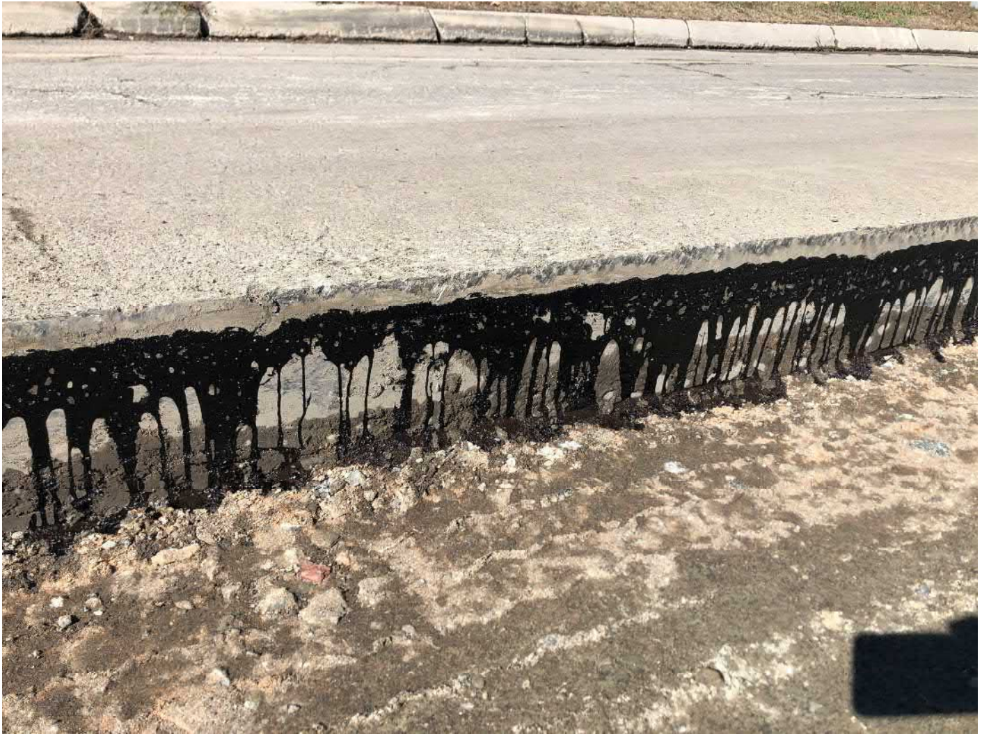
Picture 3: Tack coat that Ludlow has applied to the edge of cut pavement on the trench overcuts for permanent paving on the southbound lane of Main Street, Durham, between Stations 164+25 to 167+30.