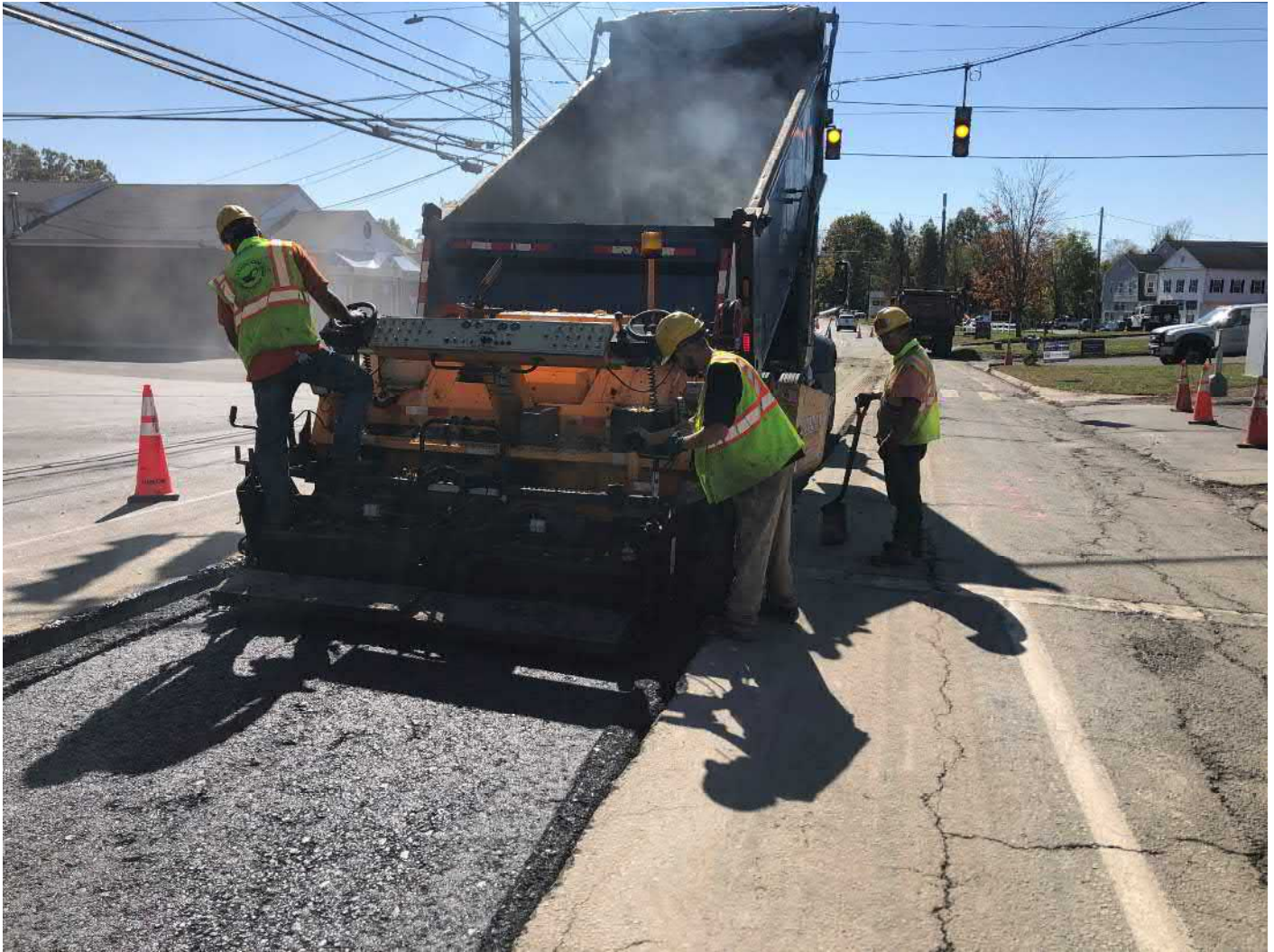
Picture 5: Ludlow placing the first of three 3" lifts on the southbound lane of Main Street, Durham between Stations 164+25 to 167+30. View to the south.