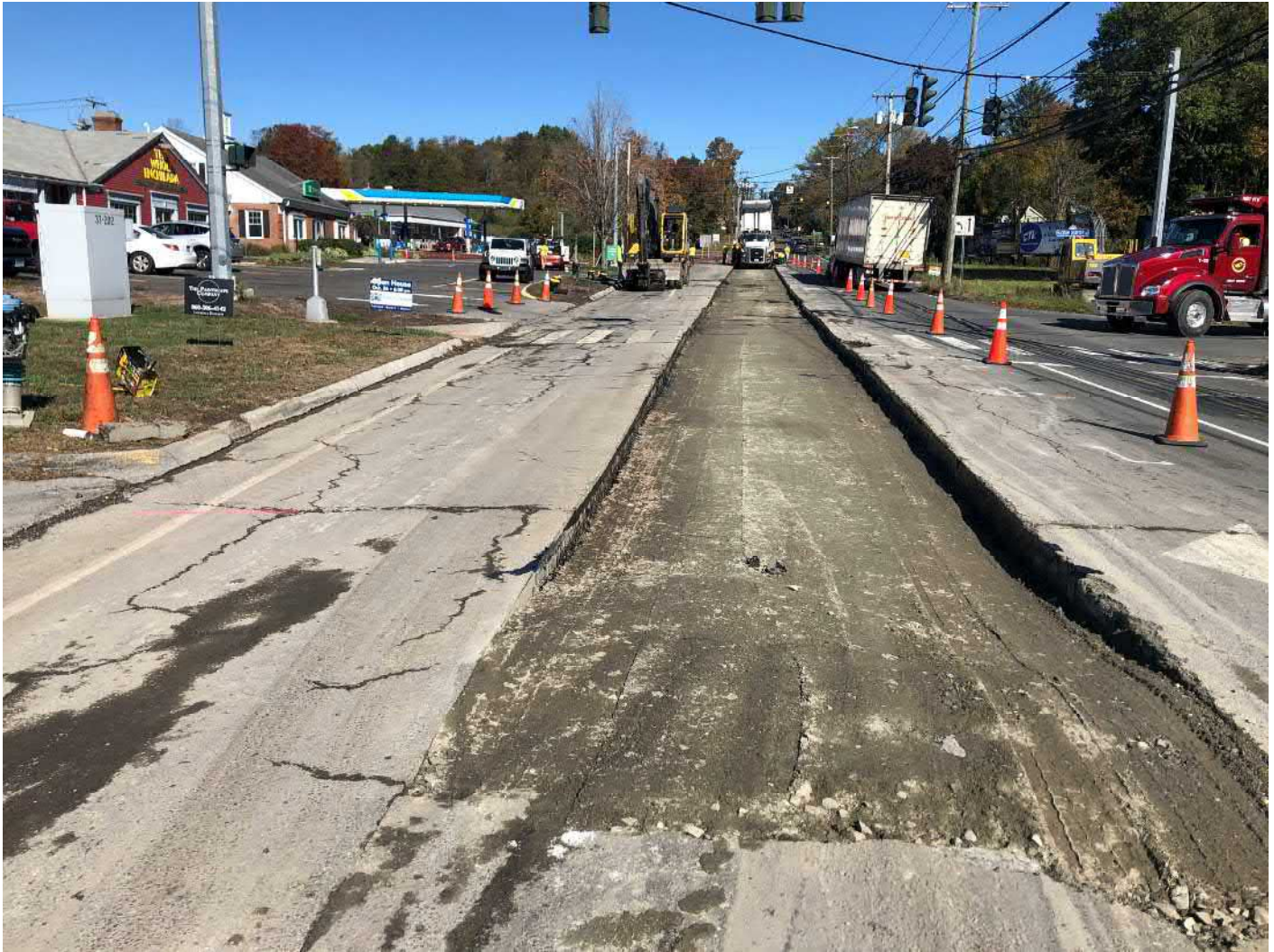
Picture 4: Pavement stripped back between Stations 164+25 to 167+30 as part of trench overcut permanent paving activities on the southbound lane of Main Street, Durham, between. View to the north.