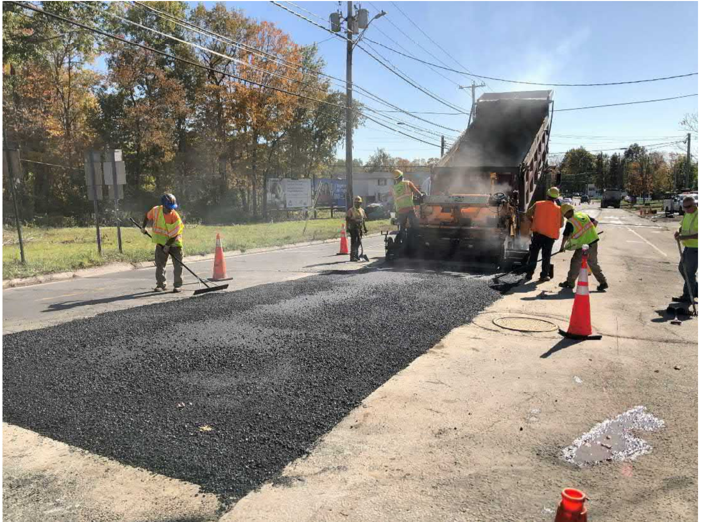
Picture 6: Ludlow placing the third of three 3" lifts on the southbound lane of Main Street, Durham between Stations 164+25 to 167+30. View to the southeast.