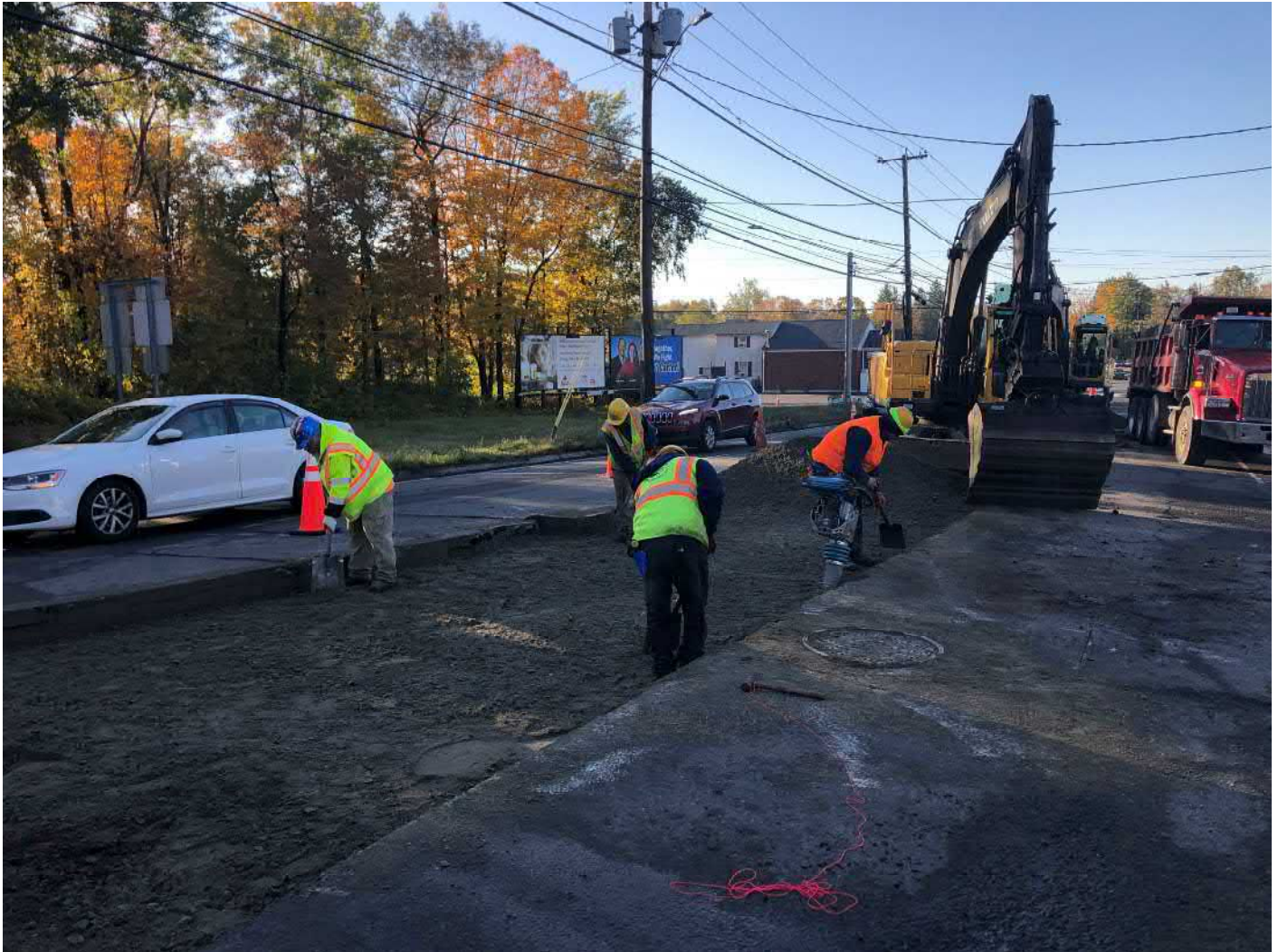
Picture 2: Ludlow grading 1.5" processed gravel as part of trench overcut permanent paving activities on the southbound lane of Main Street, Durham, between Stations 164+25 to 167+30. View to the south.