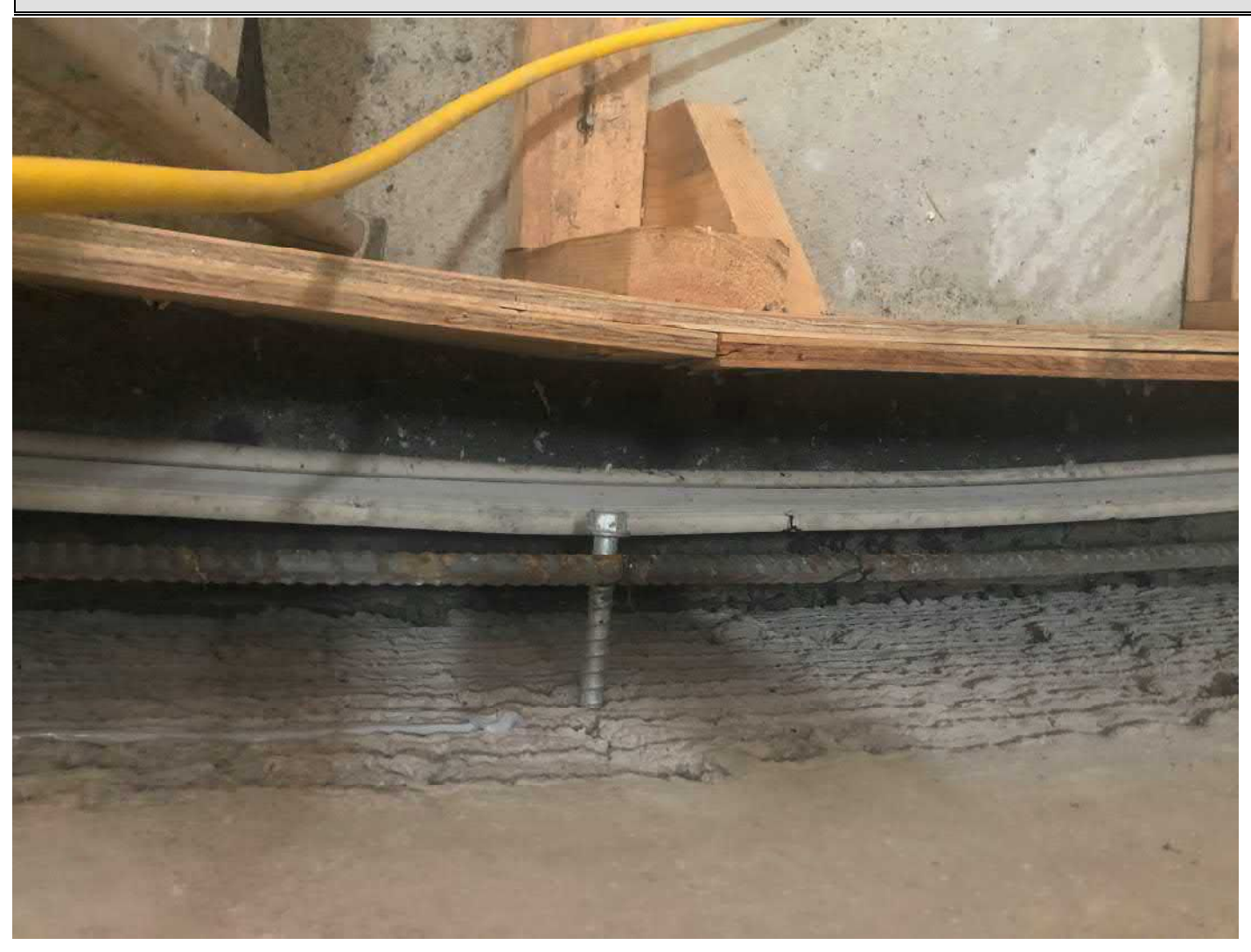
Picture 3: Concrete form for the C.I.P cove on the inside of the water tank with rebar set in place. Water tank work zone located to the east of the Shared Access Driveway, Middletown.