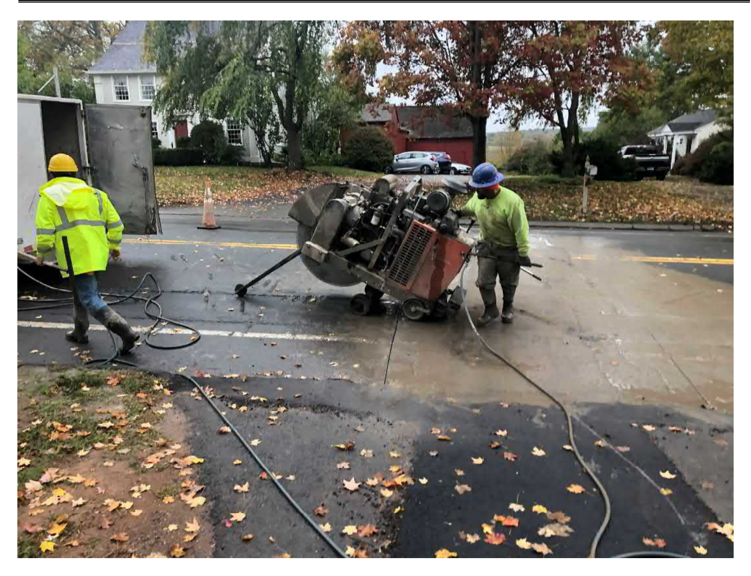
Picture 7: Veilleux saw cutting curb stop cutbacks on the northbound lane of Main Street. View to the southeast.