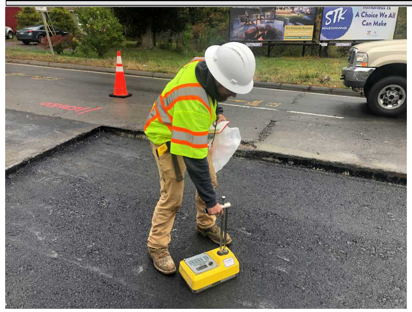
Picture 5: JTC collecting compaction data from permanent paving at trench cutbacks at Station 163+60 on the southbound lane of Main Street, Durham. View to the northeast.

Project #:AECOM: 6061487Report No:177Contractor:Ludlow ConstructionPage:8 of 12