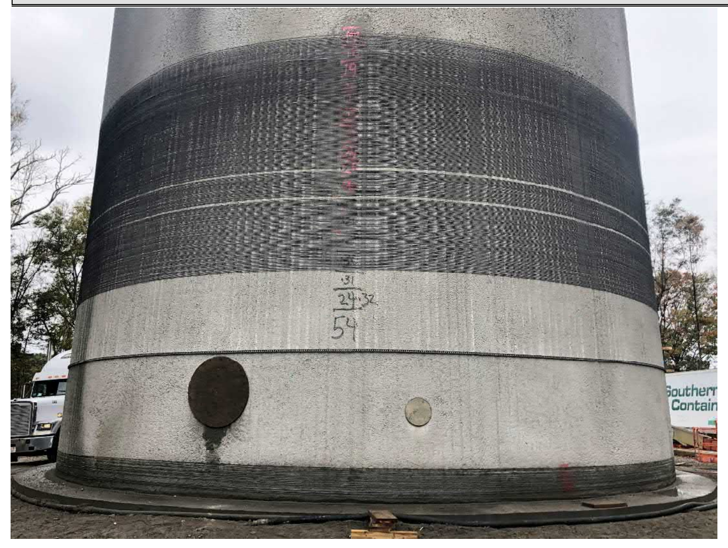
Picture 1: Prestressed wire that DN Tanks has wrapped around the exterior of the water tank located to the east of the Shared Access Driveway, Middletown. View to the east.