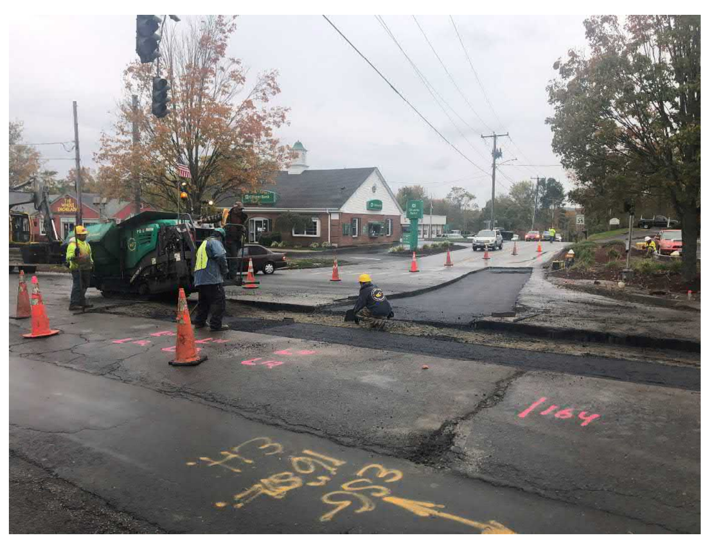
Picture 6: Overview of Route 147 permanent paving on trench cutbacks. View to the southwest.