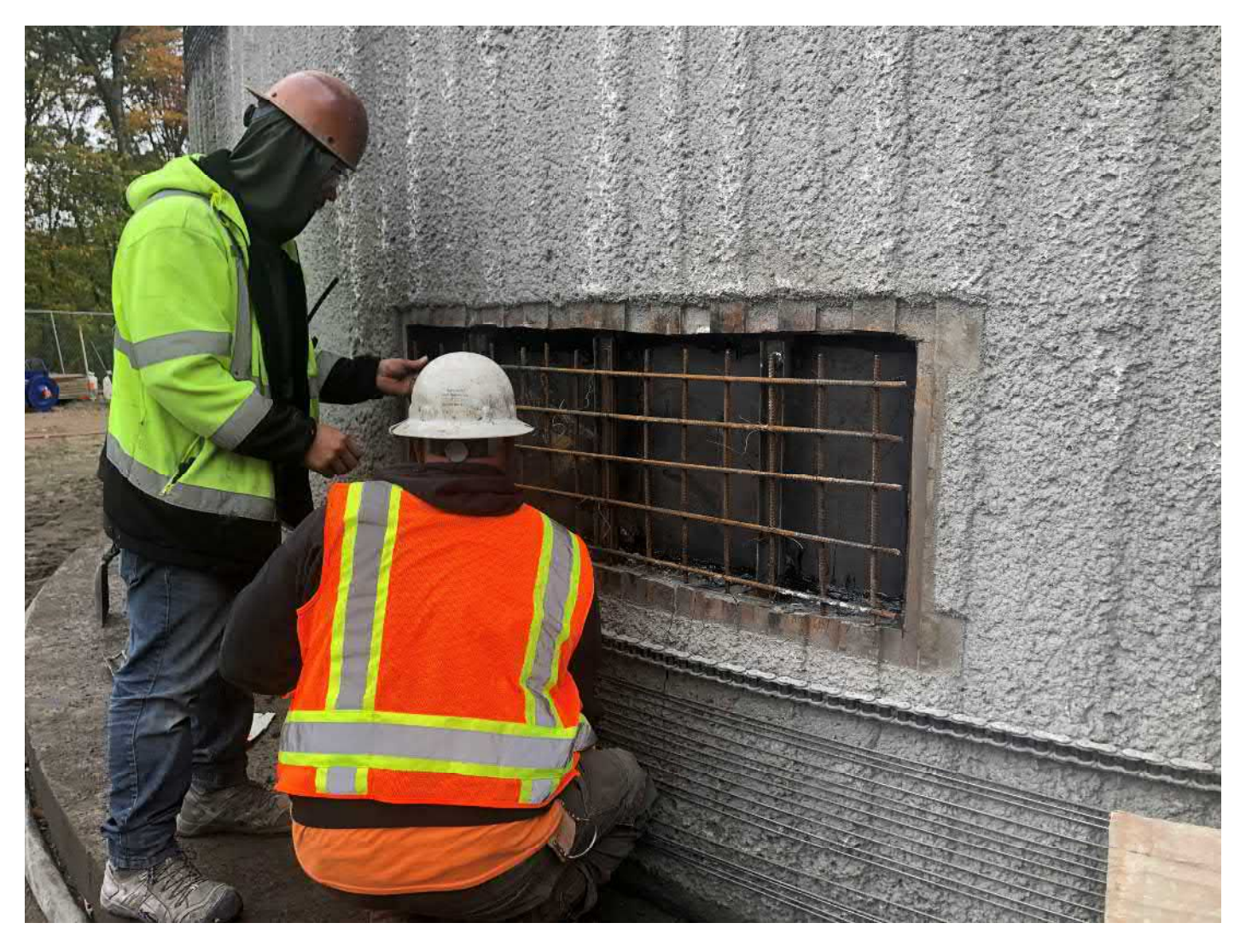
Picture 8: DN Tanks preparing to seal off a temporary entrance to the water tank. Water tank work zone located to the east of the Shared Access Driveway, Middletown.