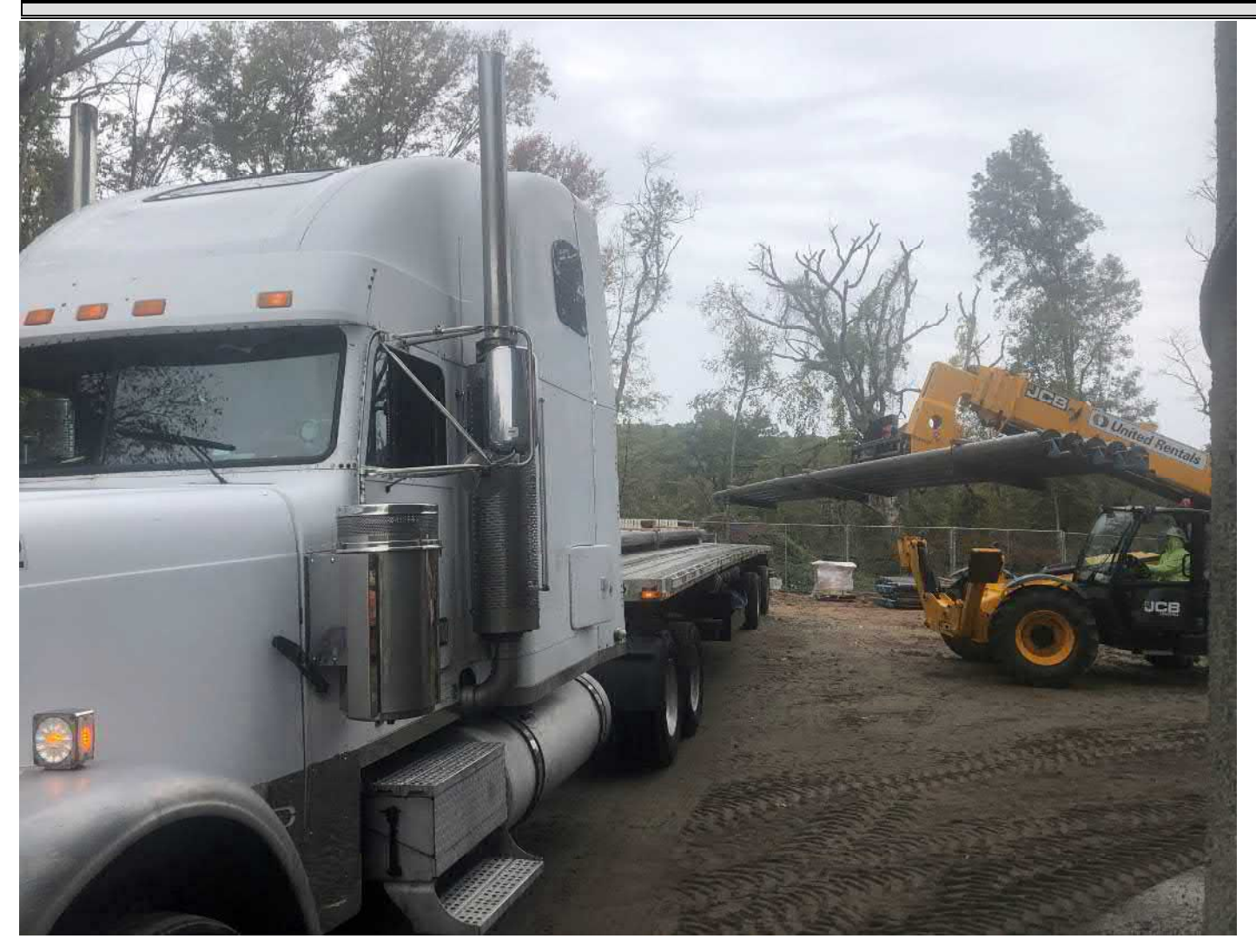
Picture 2: DN Tanks demobilizing knee braces from the water tank work zone located to the east of the Shared Access Driveway, Middletown. View to the east.