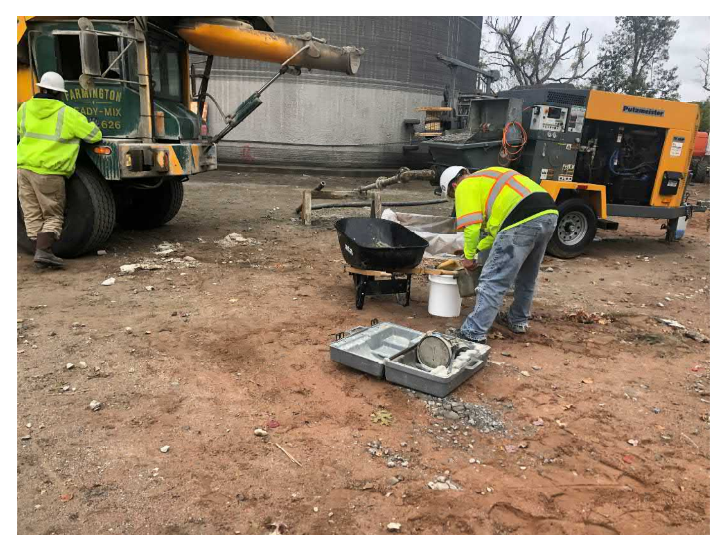
Picture 9: JTC preparing an air entrainment sample from a truckload of shotcrete that DN Tanks is about to apply to exposed prestressed wire on the exterior of the water. Water tank work zone located to the east of the Shared Access Driveway, Middletown.