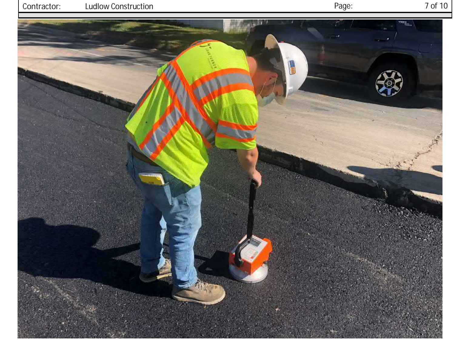
Picture 5: JTC collecting compaction data from permanent paving at trench cutbacks between Stations 160+25 and 163+55 on the southbound lane of Main Street, Durham. View to the northeast.