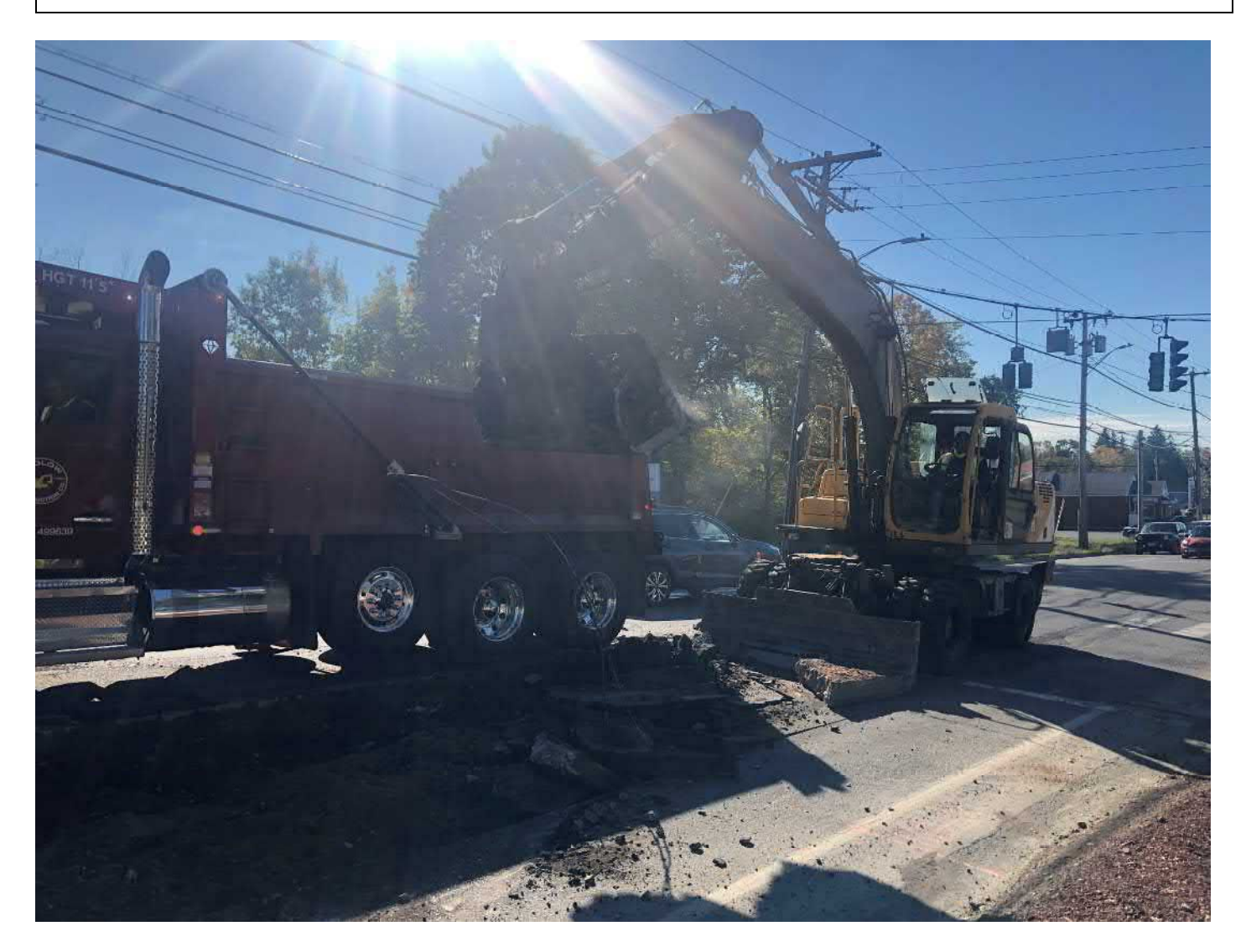
Picture 1: Ludlow stripping back asphalt as they prepare to place permanent paving between Stations 160+25 to 163+55 the southbound lane of Main Street, Durham. View to the southeast.