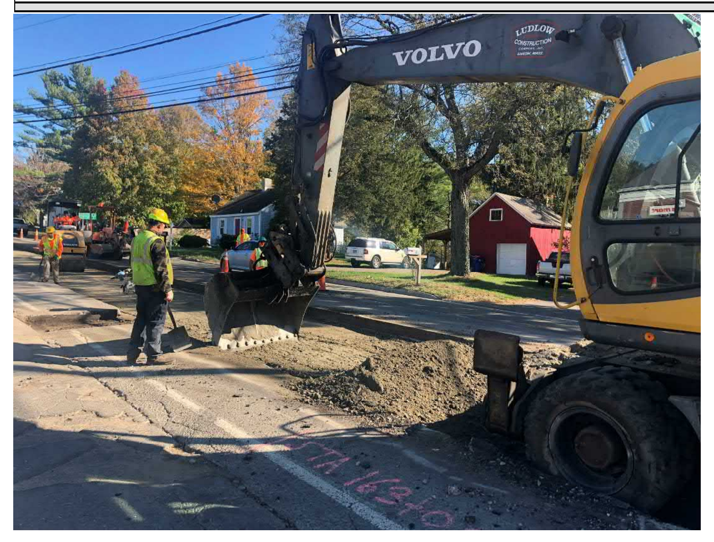
Picture 2: Ludlow grading and compacting 1.5" processed gravel between Stations 160+25 to 163+55 as they prepare to place permanent paving on the southbound lane of Main Street, Durham. View to the northeast.

Project #:AECOM: 6061487Report No:176Contractor:Ludlow ConstructionPage:4 of 10