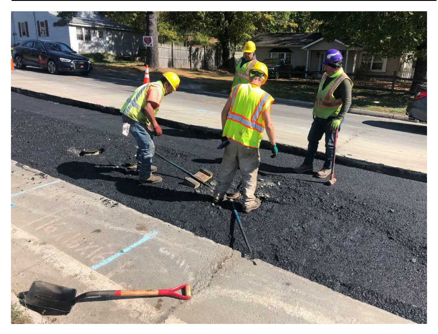
Picture 6: Ludlow raising a road box during permanent paving at trench cutbacks between Stations 157+25 and 160+25 on the southbound lane of Main Street, Durham. View to the east.