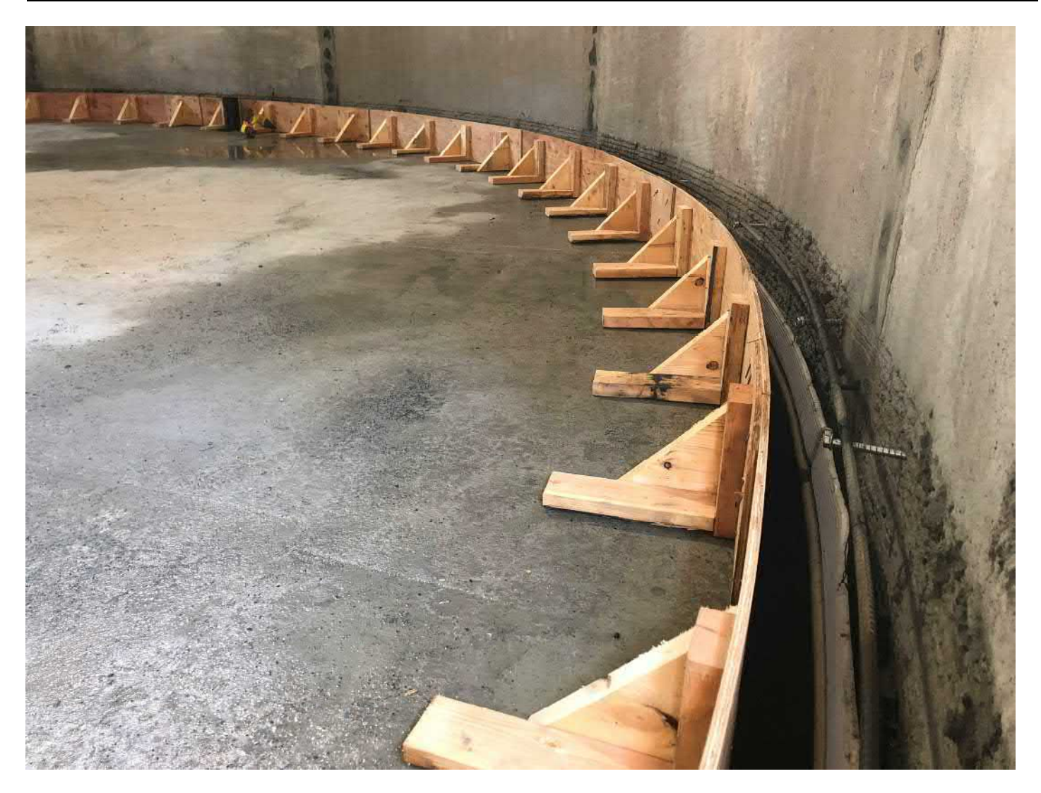
Picture 8: Concrete form for the C.I.P cove on the inside of the water tank. Water tank work zone located to the east of the Shared Access Driveway, Middletown.