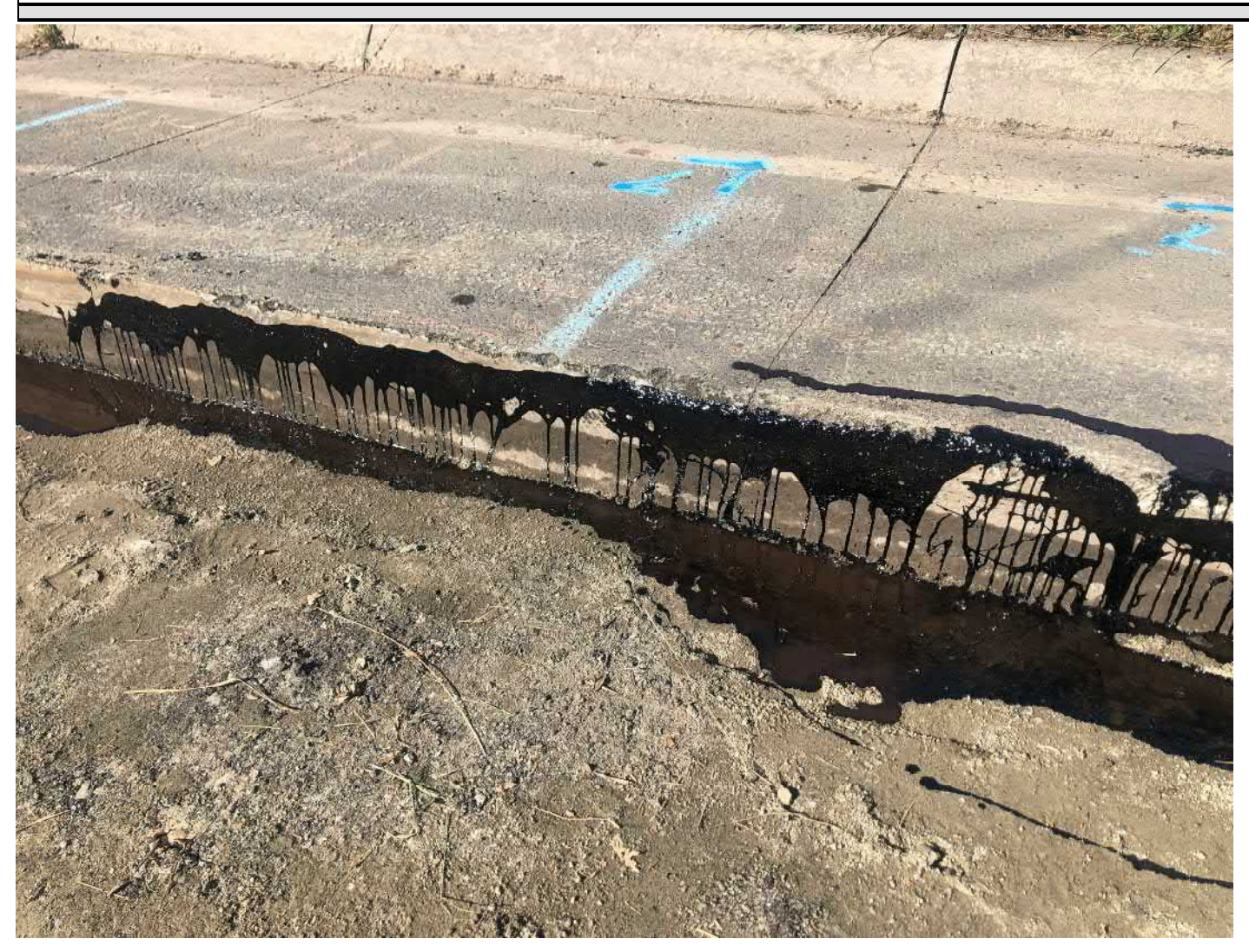
Picture 3: Tack coat that Ludlow has placed on the edges of cut pavement between Stations 160+25 to 163+55 as they prepare to place permanent paving on the southbound lane of Main Street, Durham. View to the west.

Project #:AECOM: 6061487Report No:176Contractor:Ludlow ConstructionPage:5 of 10