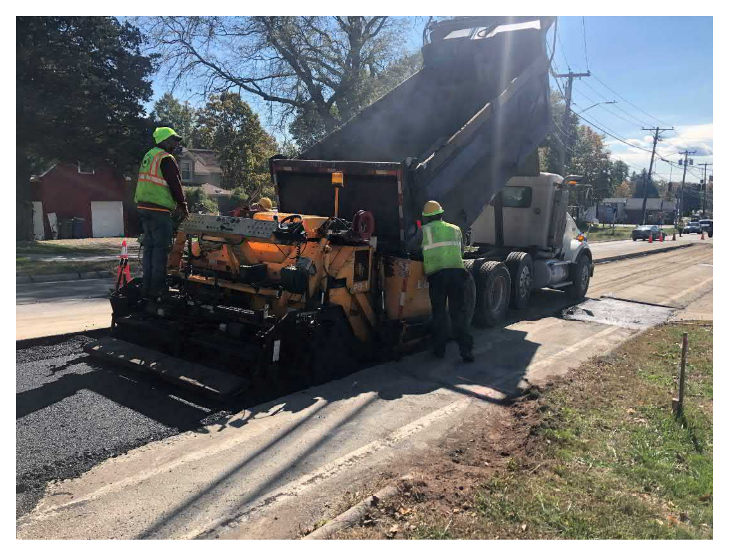
Picture 7: Ludlow placing and compacting the first of three 3" lifts of asphalt between Stations 160+25 to 163+55 as they prepare to place permanent paving on the southbound lane of Main Street, Durham. View to the southeast.