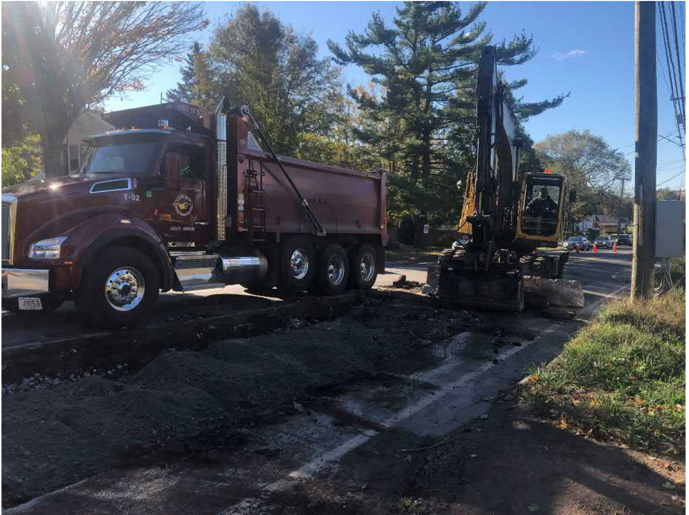
Picture 2: Ludlow stripping back asphalt as they prepare to place permanent paving on the southbound lane of Main Street, Durham. View to the southeast.