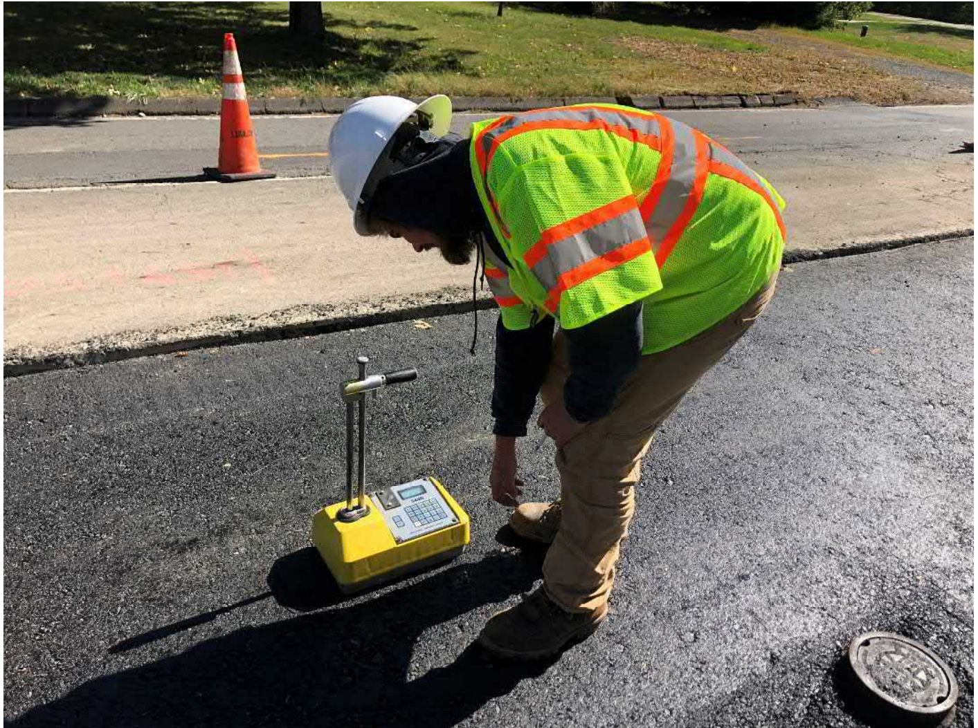
Picture 6: JTC collecting compaction data from permanent paving at trench cutbacks between Stations 157+25 and 160+25 on the southbound lane of Main Street, Durham. View to the southeast.