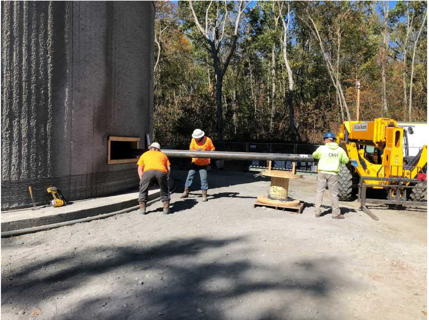
Picture 9: Knee brace being removed from inside of the water tank. Water tank work zone located to the east of the Shared Access Driveway, Middletown. View to the north.