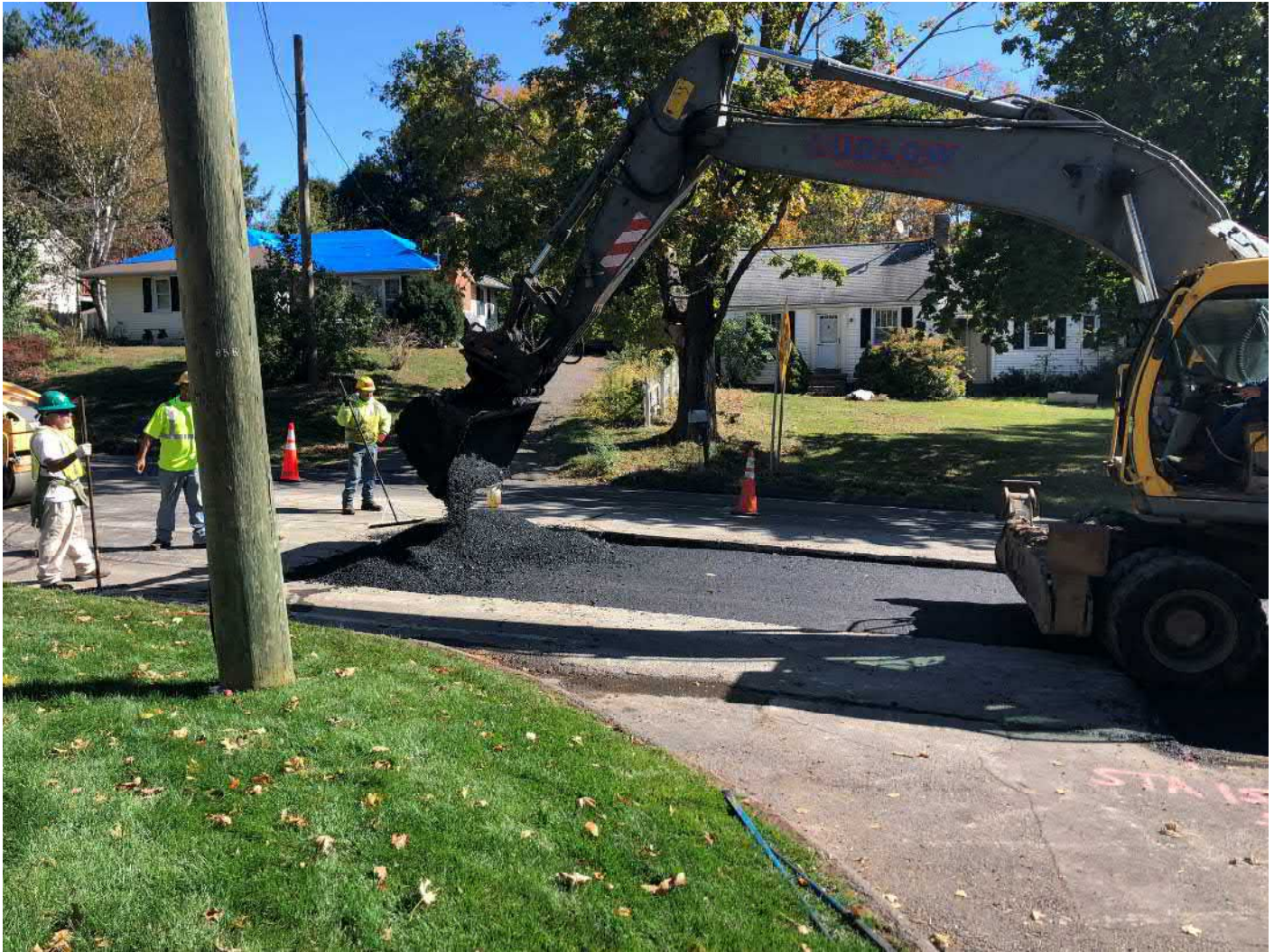
Picture 3: Ludlow placing the first of three 3" lifts of asphalt on the southbound lane of Main Street, Durham between Stations 157+25 and 160+25. View to the east.