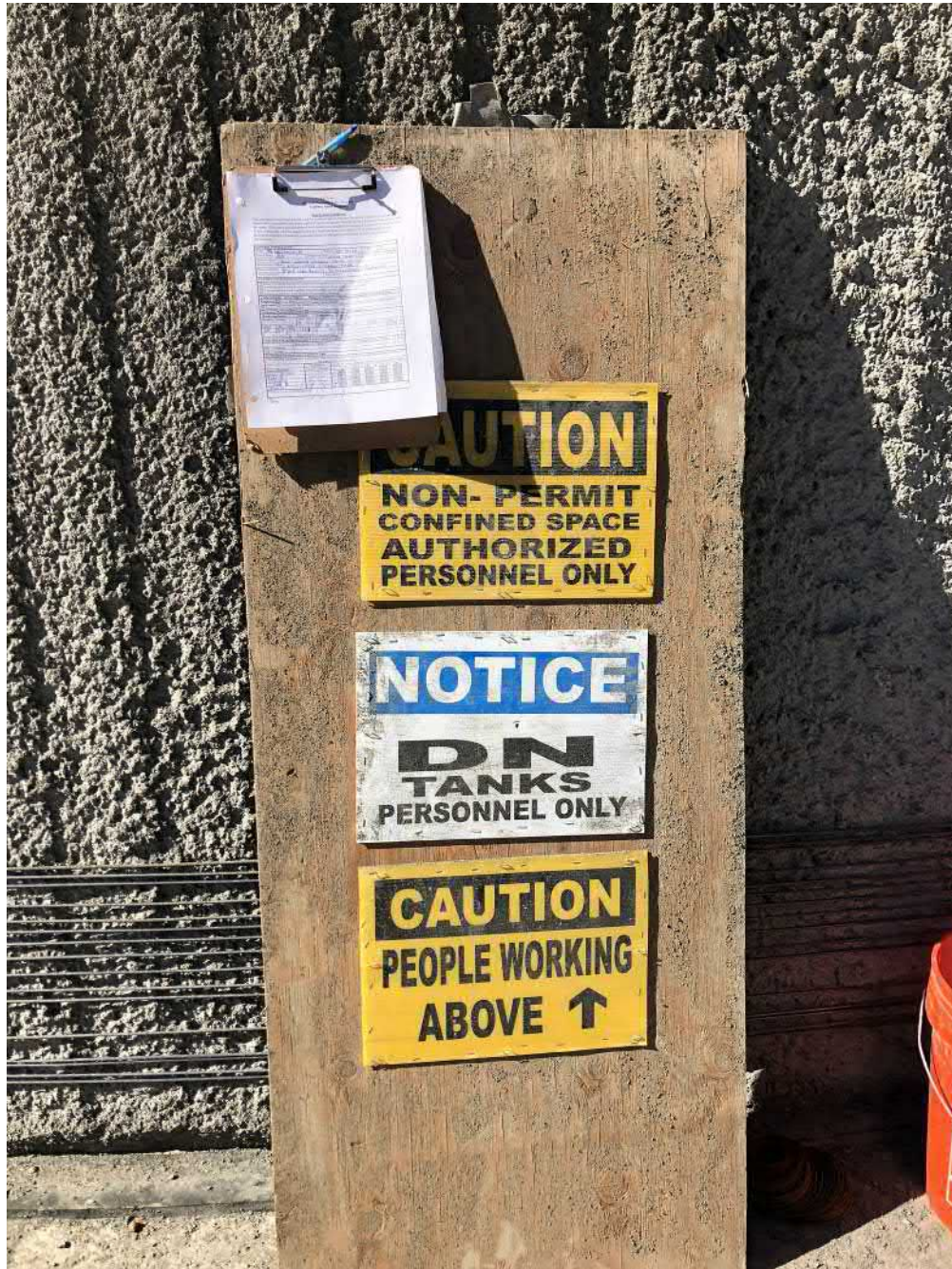
Picture 7: Signage posted outside of the water tank as they prepare to remove knee braces from the water tank. Water tank work zone located to the east of the Shared Access Driveway, Middletown. View to the west.