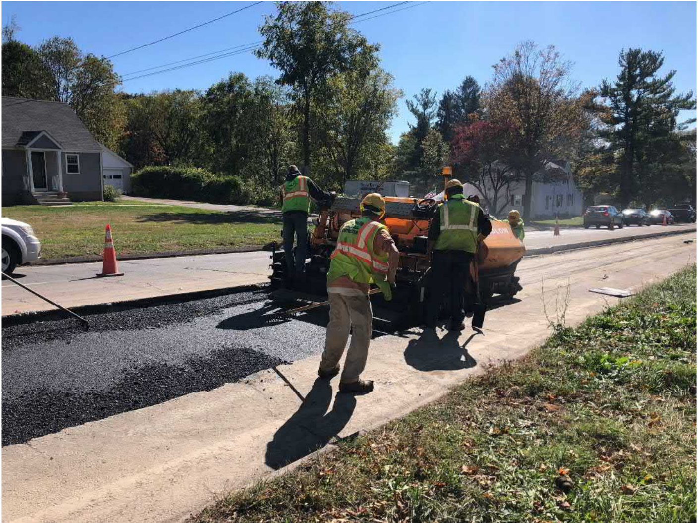
Picture 4: Ludlow placing the first of three 3" lifts of asphalt on the southbound lane of Main Street, Durham between Stations 157+25 and 160+25. View to the southeast.