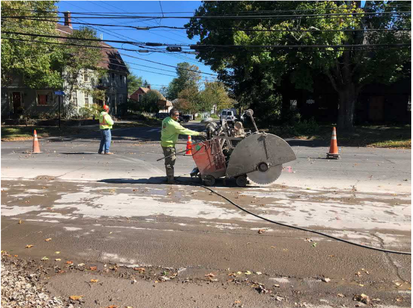
Picture 5: Veilleux setting up to saw cut at Station 192+50 on the southbound lane of Main Street, Durham. View to the east.