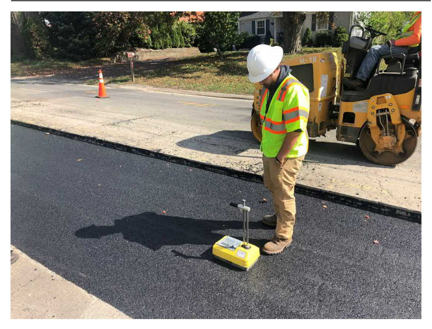
Picture 8: JTC is collecting compaction data from freshly placed and rolled asphalt between Stations 151+35 to 154+25 on the southbound lane of Main Street, Durham. View to the northeast.