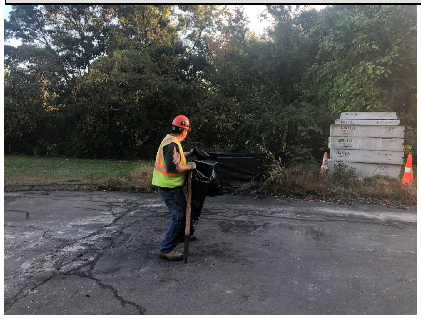
Picture 1: Ludlow removing silt fence from the Talcott Ridge Drive cul-de-sac and down along the Shared Access Driveway. View to the north.