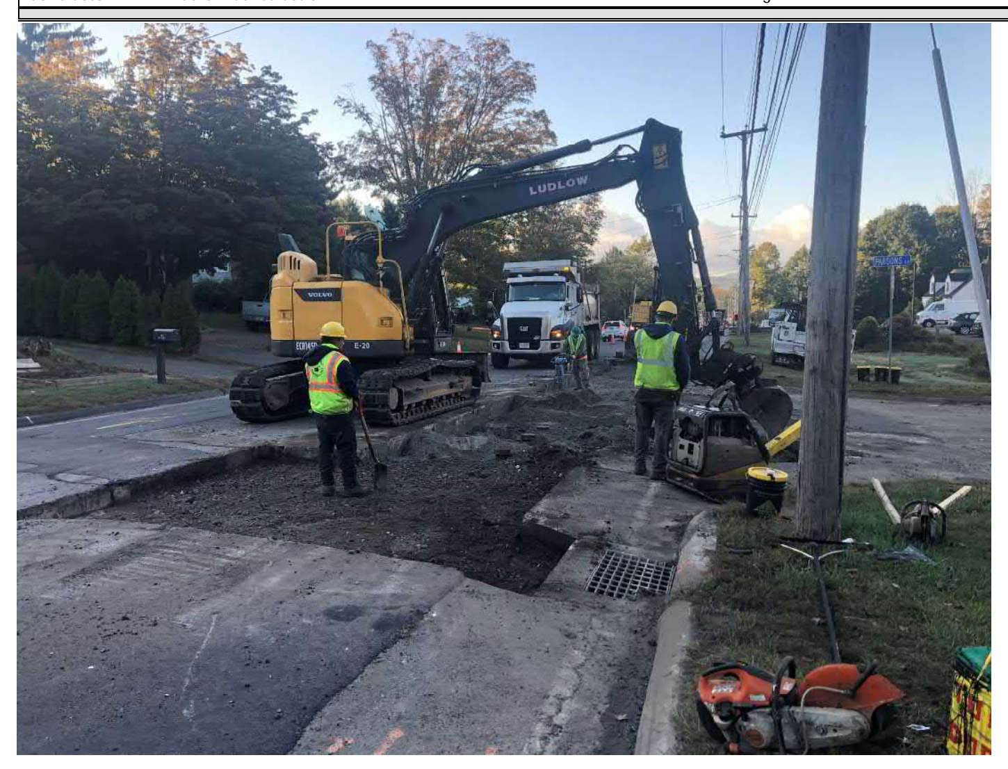
Picture 2: Ludlow stripping back asphalt as they prepare to place permanent paving on the southbound lane of Main Street, Durham from Stations 151+35 to 154+25. View to the south.