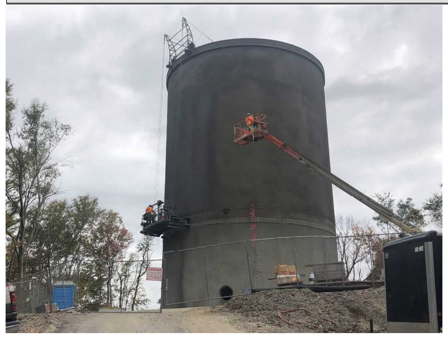
Picture 5: DN Tanks wrapping prestressed wire around the sides of the water tank. Water tank work zone located to the east of the Shared Access Driveway, Middletown. View to the east.