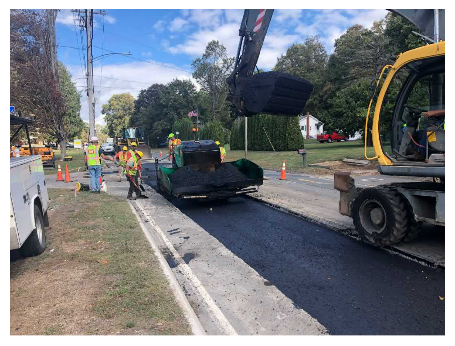
Picture 9: Ludlow placing the second of three 3" lifts of asphalt as part of permanent paving activities on the southbound lane of Main Street, Durham from Stations 151+35 to 154+25. View to the north.