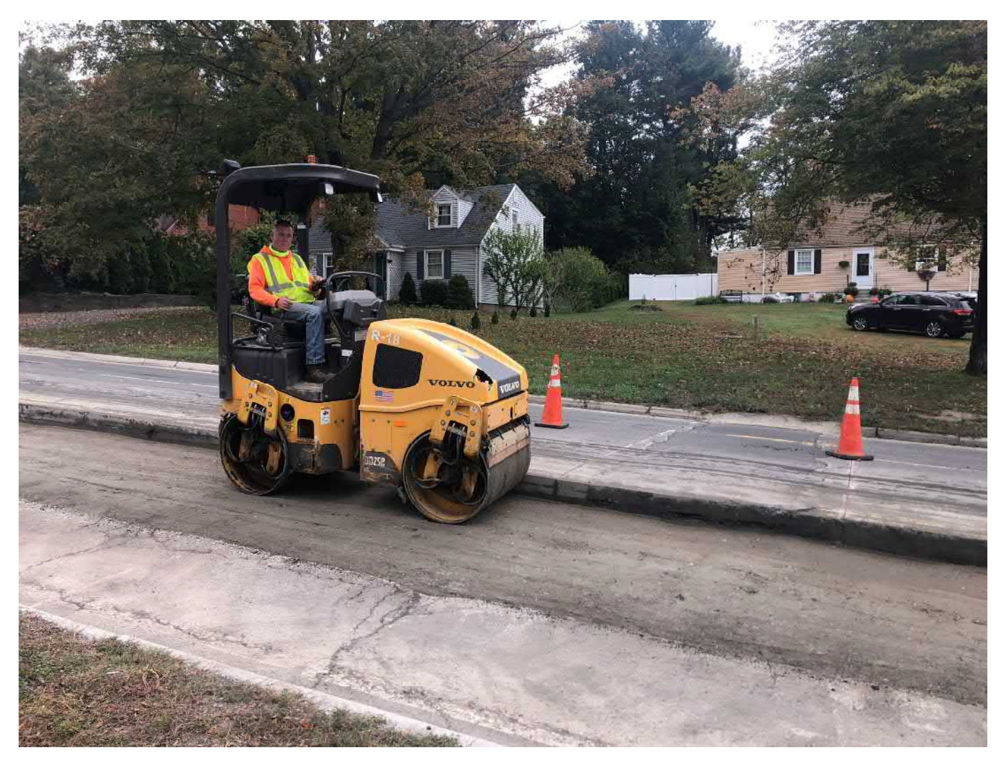
Picture 6: Ludlow is compacting 1.5" processed gravel as they prepare to place permanent paving on the southbound lane of Main Street, Durham from Stations 151+35 to 154+25. View to the east.