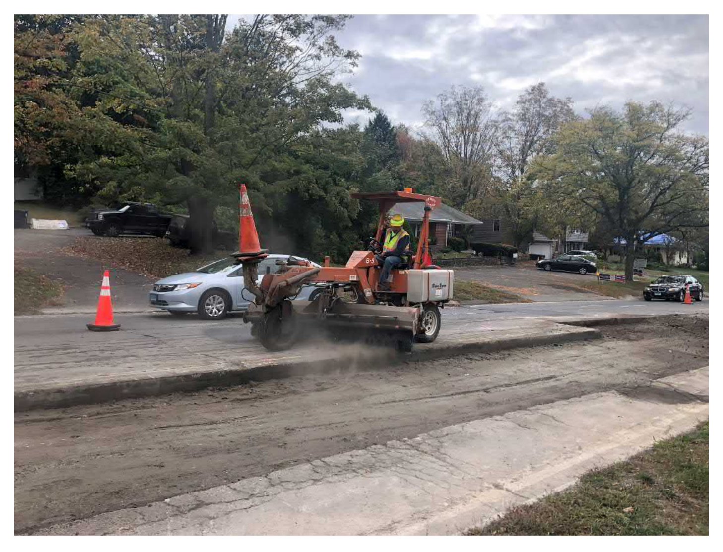
Picture 7: Ludlow cleaning work zone with the Broce Broom between Stations 151+35 to 154+25 as they prepare to place permanent paving on the southbound lane of Main Street, Durham. View to the southeast.