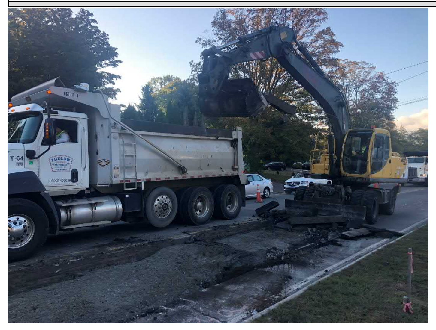
Picture 4: Ludlow loading asphalt and concrete into a dump truck as they strip back asphalt for permanent paving on the southbound lane of Main Street, Durham from Stations 151+35 to 154+25. View to the southeast.