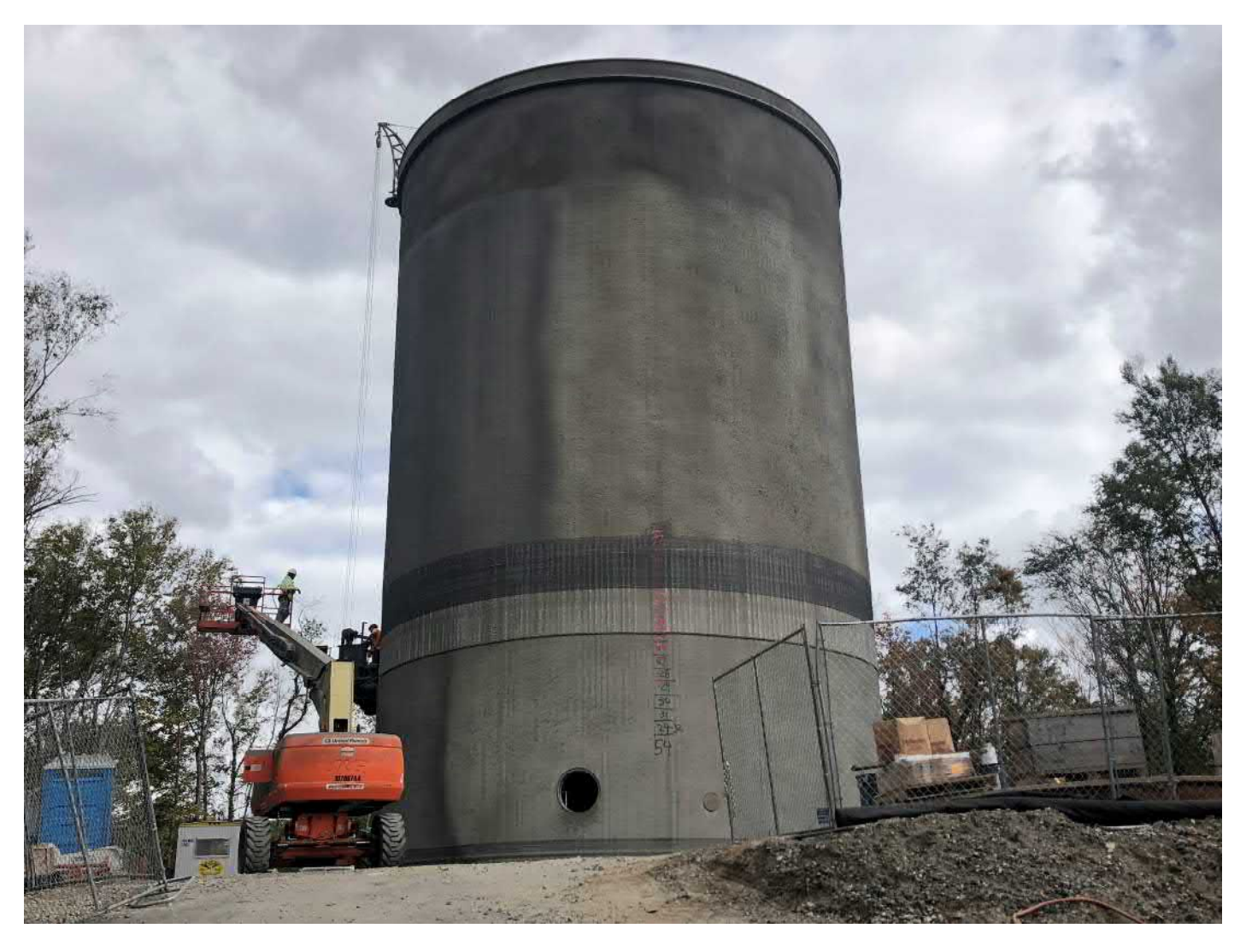
Picture 10: DN Tanks wrapping prestressed wire around the sides of the water tank. Water tank work zone located to the east of the Shared Access Driveway, Middletown. View to the east.