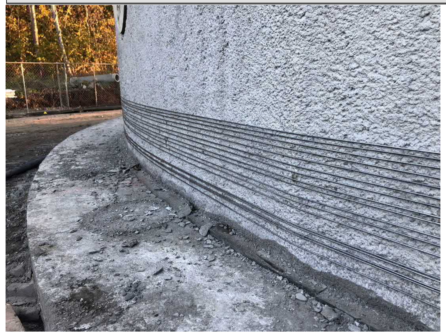
Picture 1: DN Tanks has wrapped prestressed wire abound the sides of the water tank at the bottom. Water tank work zone, east of the Shared Access Driveway, Middletown. View to the northeast.