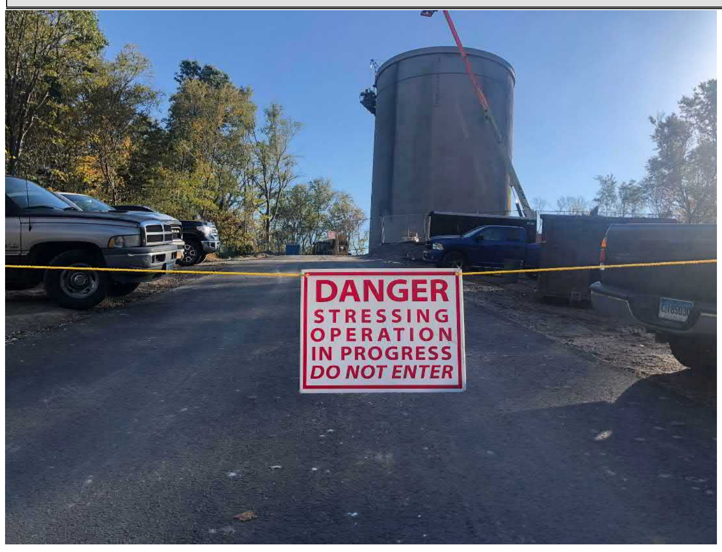
Picture 3: DN Tanks placed warning sign near the water tank work zone, east of the Shared Access Driveway, Middletown as they wrapped prestressed wire around the tank. View to the east.