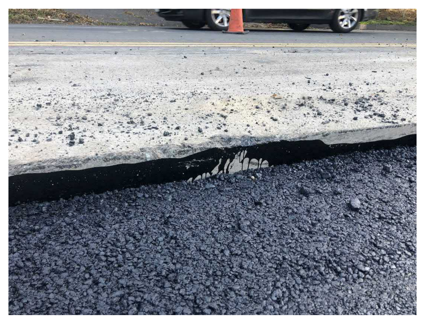
Picture 8: Tack coat applied to the sides of cut pavement as part of trench cutback paving activities on the southbound lane of Main Street, Durham from Stations 143+00 to 146+30.