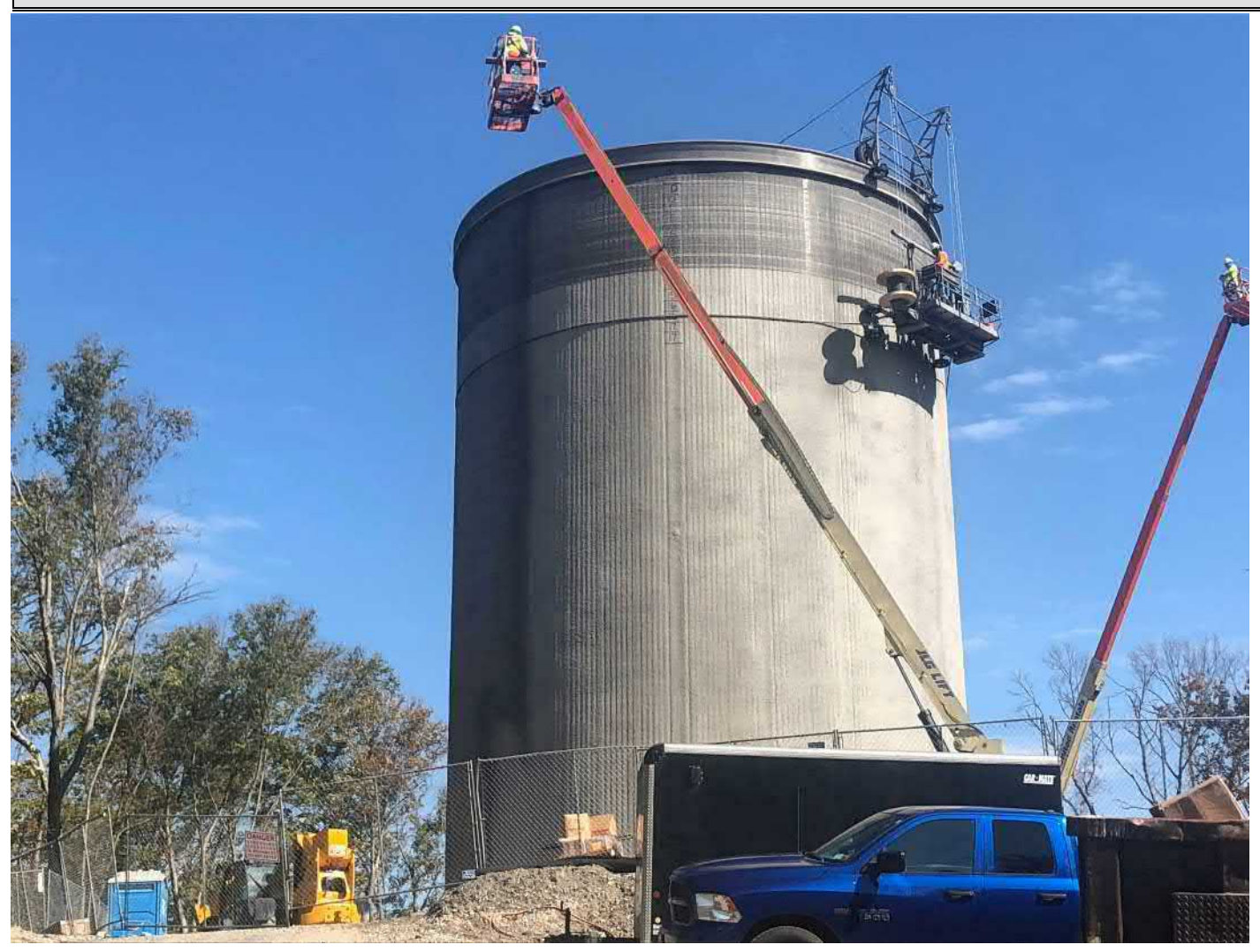
Picture 6: DN Tanks wrapping prestressed wire abound the sides of the water tank at the top of the tank. Water tank work zone, east of the Shared Access Driveway, Middletown. View to the northeast.