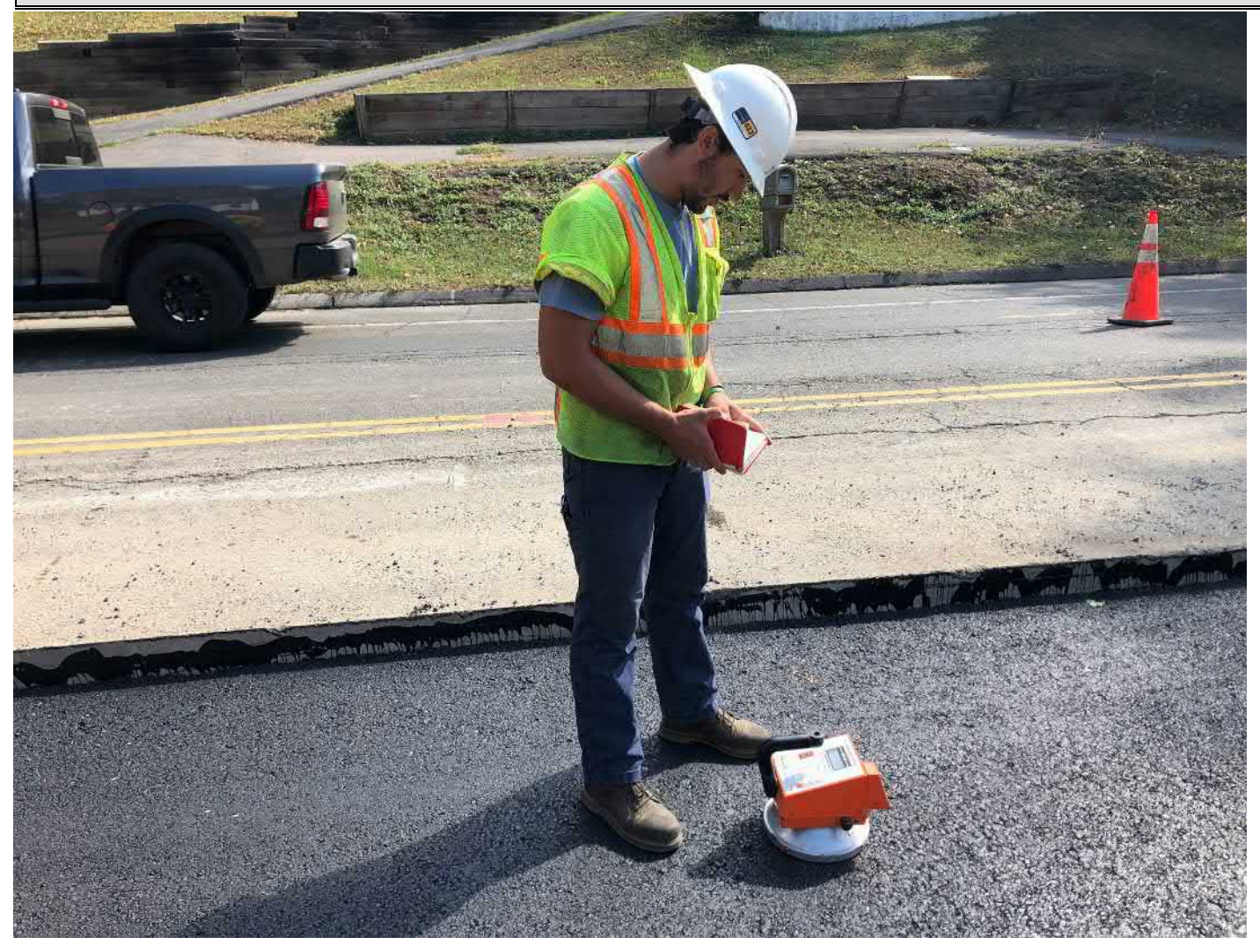
Picture 7: JTC collecting compaction data from the first of three 3" lifts of asphalt on the southbound lane of Main Street, Durham from Stations 143+00 to 146+30. View to the southeast.