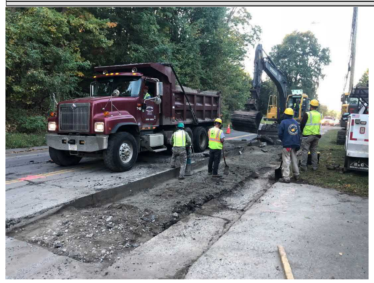
Picture 2: Ludlow stripping back asphalt as they prepare to place permanent paving on the southbound lane of Main Street, Durham from Stations 143+00 to 146+30. View to the south.