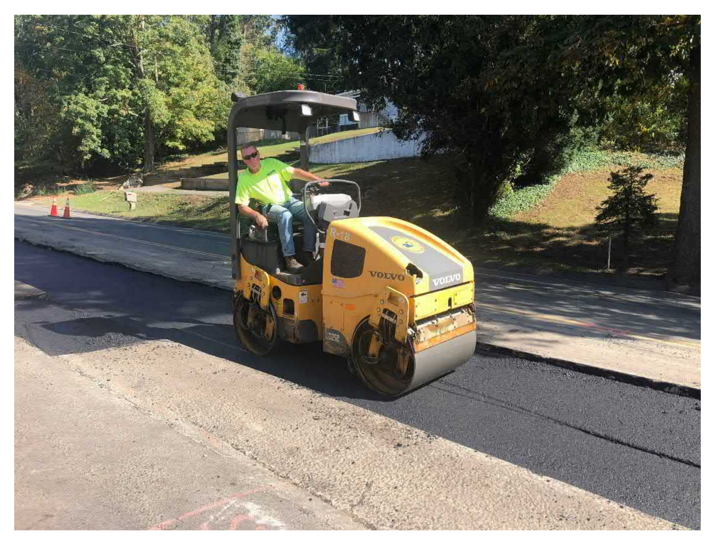
Picture 9: Ludlow compacting second lift of asphalt as part of trench cutback paving activities on the southbound lane of Main Street, Durham from Stations 143+00 to 146+30. View to the northeast.