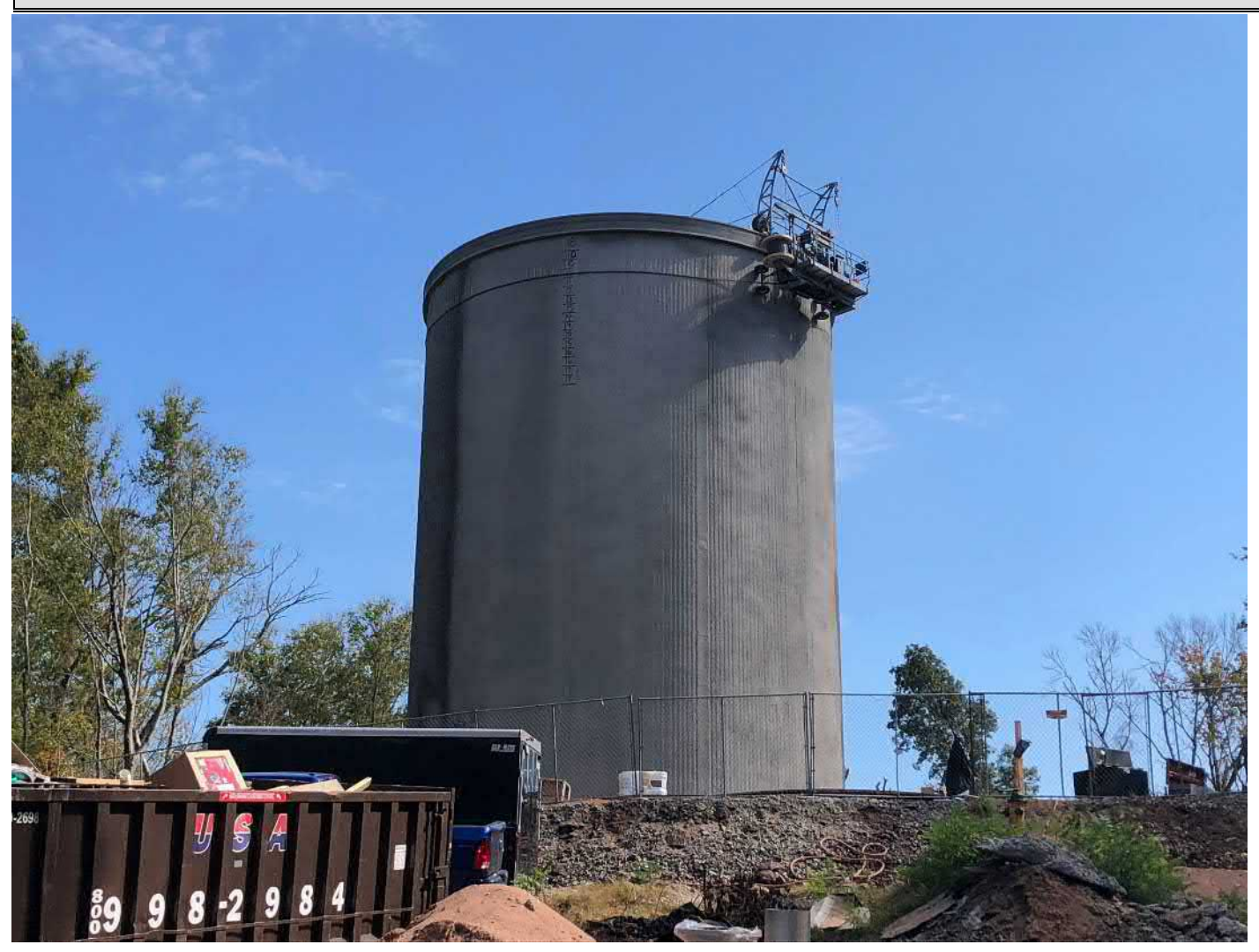
Picture 5: DN Tanks preparing to wrap prestressed wire abound the sides of the water tank at the top of the tank. Water tank work zone, east of the Shared Access Driveway, Middletown. View to the northeast.