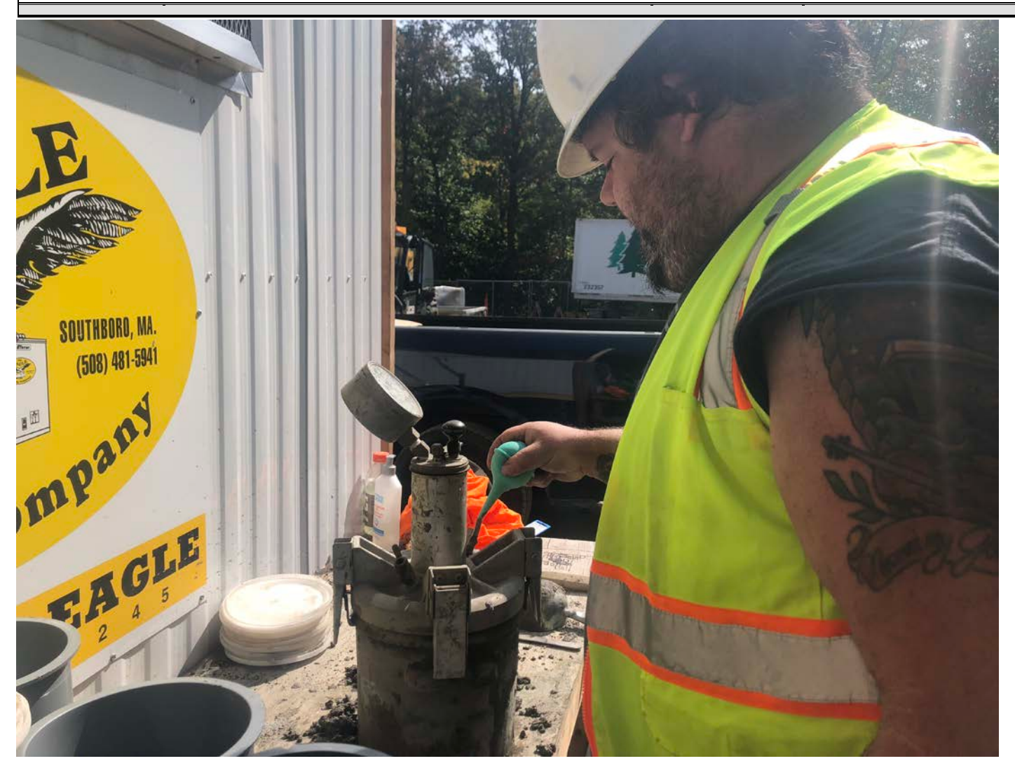
Picture 5: JTC performing air entrainment test on concrete brought to the site to be placed on top of the water tank today. Water tank work zone east of the Shared Access Driveway, Middletown.