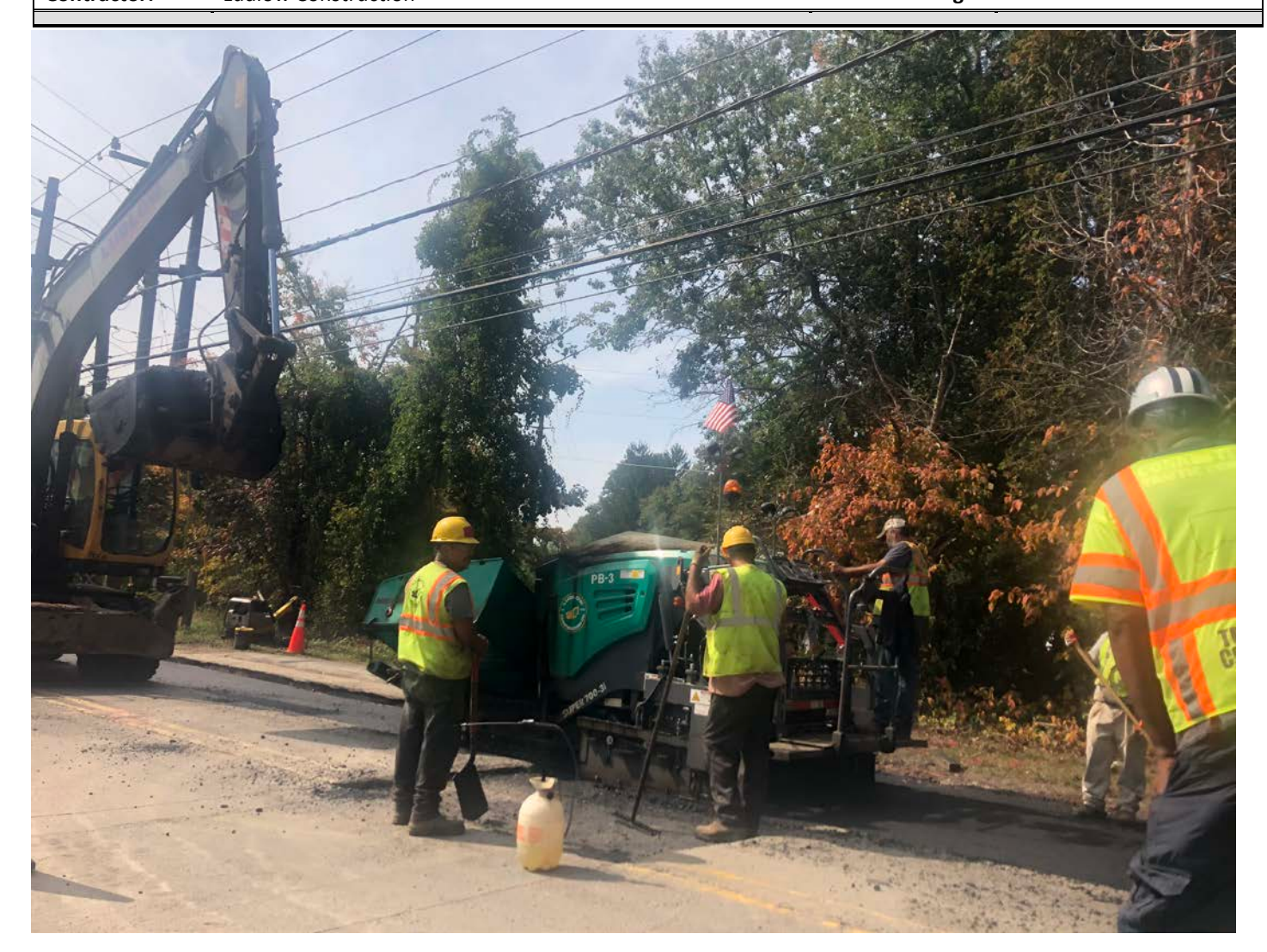
Picture 3: Ludlow placing the third of three 3" lifts of asphalt between Stations 130+00 and 134+00 as part of trench cutback paving activities on the southbound lane of S. Main Street, Middletown. View to the southwest.