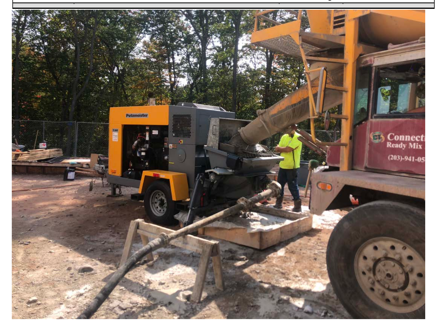
Picture 7: CT Ready Mix pumping concrete into a pump trailer that, in turn, is pumping concrete to the top of the water tower for a dome pour. Water tank work zone east of the Shared Access Driveway, Middletown. View to the south.

Project #:AECOM: 6061487Report No:167Contractor:Ludlow ConstructionPage:10 of 13