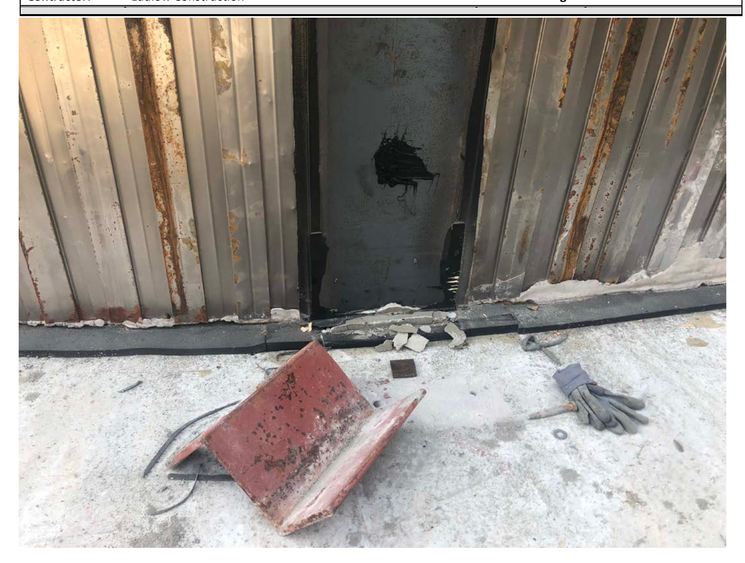
Picture 4: Brace removed from the toe of a slot panel on the water tank a day after grout was poured. Water tank work zone, east of the Shared Access Driveway, Middletown.

Project #:AECOM: 6061487Report No:167Contractor:Ludlow ConstructionPage:7 of 13