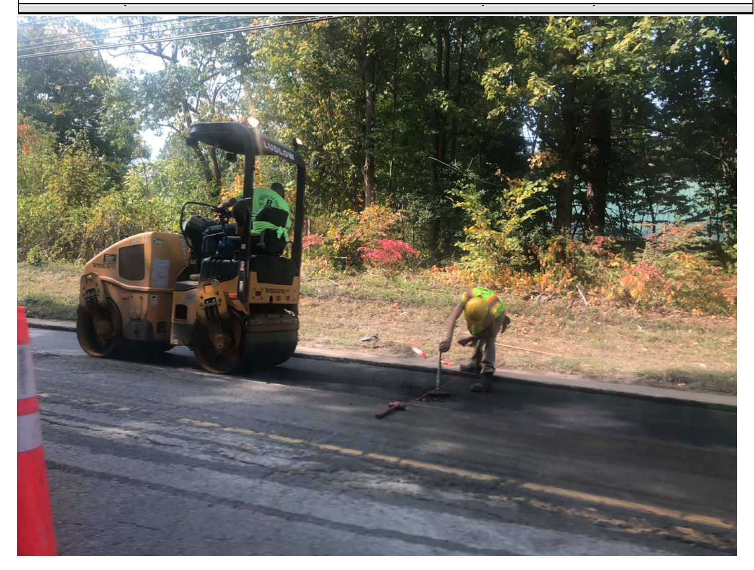
Picture 2: Ludlow raising a road box as they compact pavement between Stations 130+00 and 134+00 on the southbound lane of S. Main Street, Middletown. View to the southwest.

Project #:AECOM: 6061487Report No:167Contractor:Ludlow ConstructionPage:5 of 13