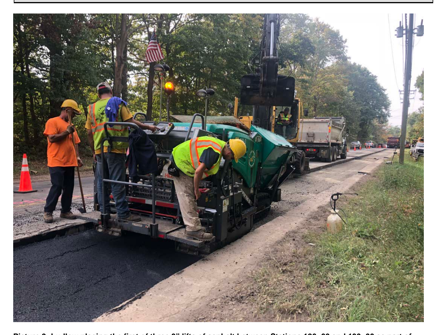
Picture 9: Ludlow placing the first of three 3" lifts of asphalt between Stations 126+00 and 130+00 as part of trench cutback paving activities on the southbound lane of S. Main Street, Middletown. View to the south.