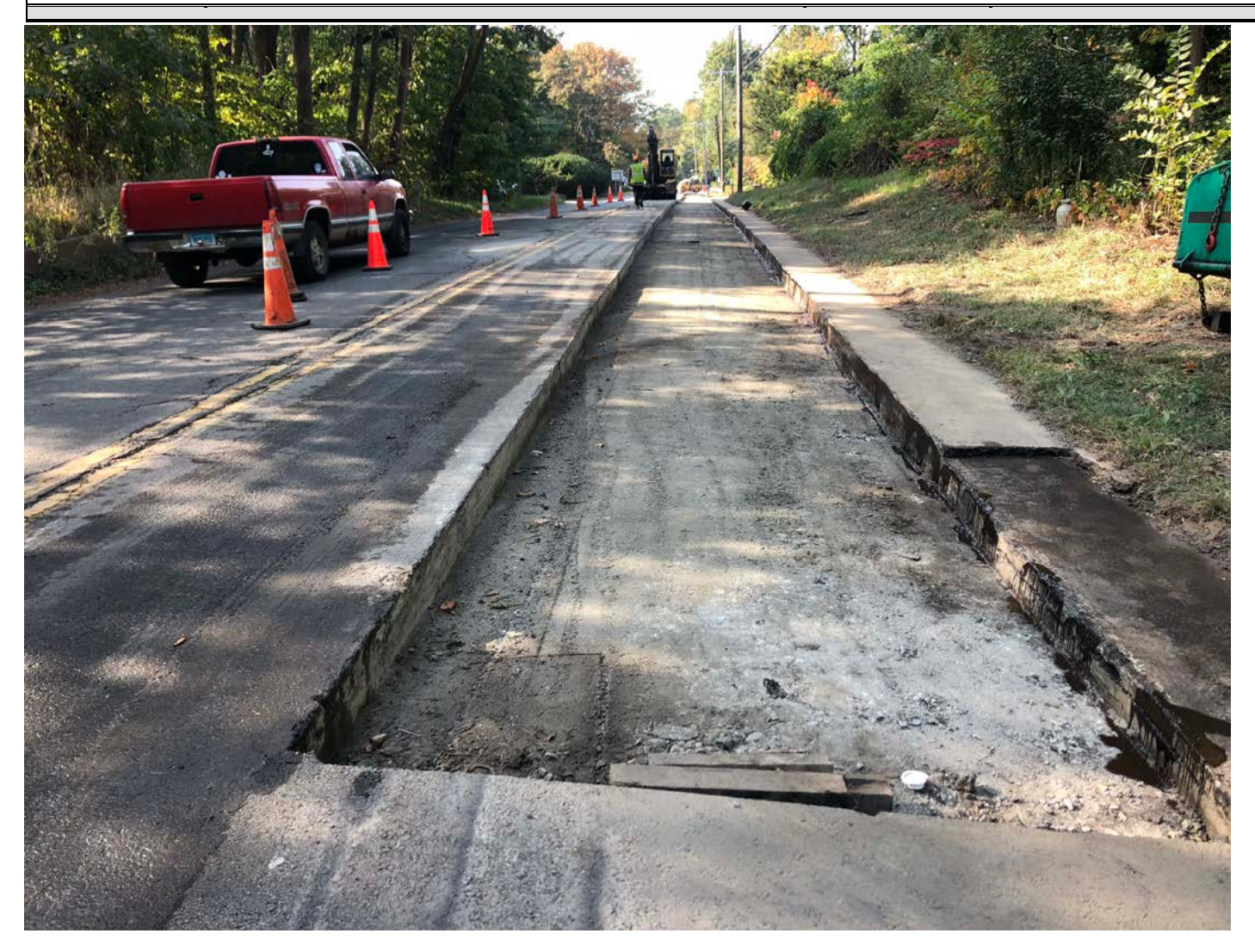
Picture 1: Ludlow removing pavement from the trench cutback zone on the southbound lane of S. Main Street, Middletown where they will pave later today. View to the south.

Project #:AECOM: 6061487Report No:167Contractor:Ludlow ConstructionPage:4 of 13