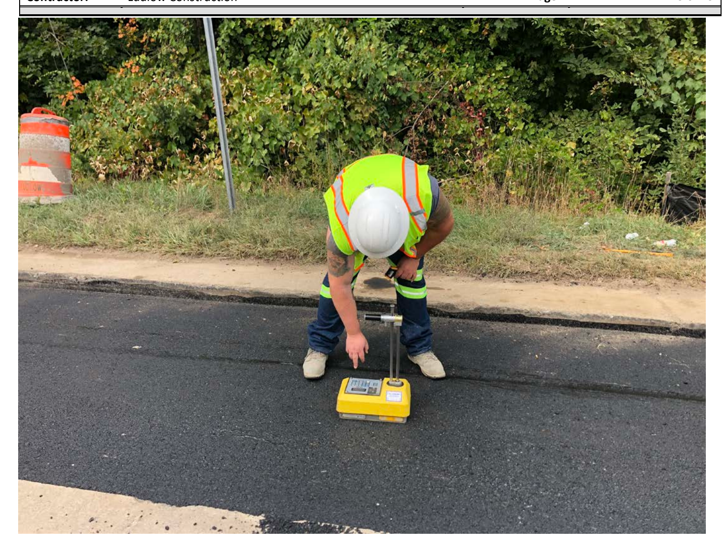
Picture 10: JTC collecting compaction data from the second of three 3" lifts of asphalt between Stations 126+00 and 130+00 on the southbound lane of S. Main Street, Middletown. View to the west.

Project #:AECOM: 6061487Report No:167Contractor:Ludlow ConstructionPage:13 of 13