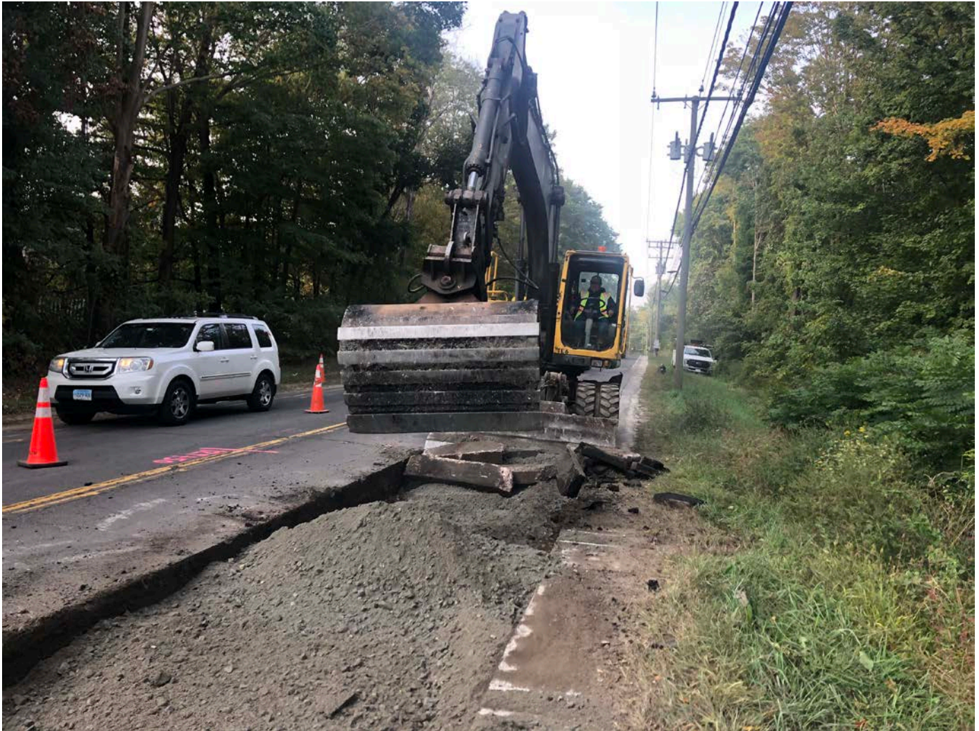
Picture 2: Ludlow removing pavement from Stations 126+00 to 130+00 as part of trench cutback paving activities on the southbound lane of S. Main Street, Middletown. View to the west.