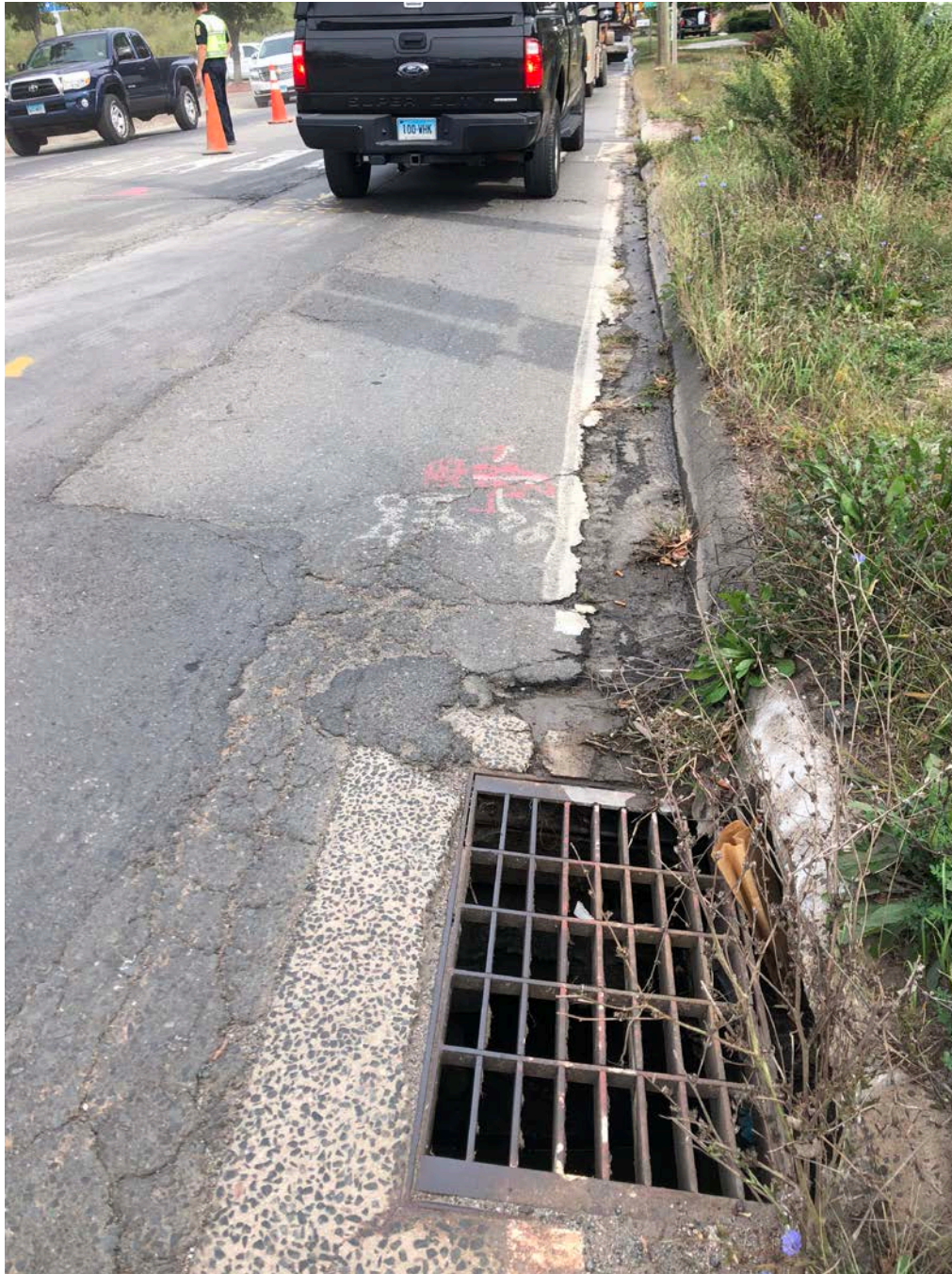
Picture 6: Unprotected catch basin at Station 164+30 located downgradient of pavement saw cutting activities. Ludlow was notified of this condition and placed a silt sock into the catch basin. View to the north.