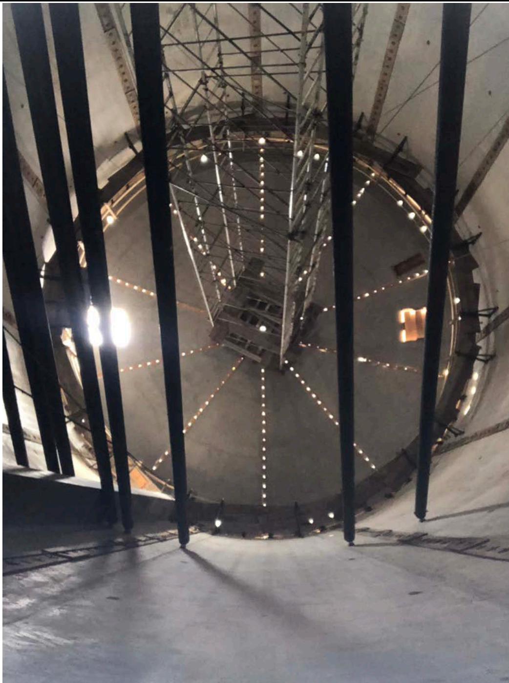
Picture 3: The water tank roof, viewed from the inside looking up. Water tank work zone, east of the Shared Access Driveway, Middletown.