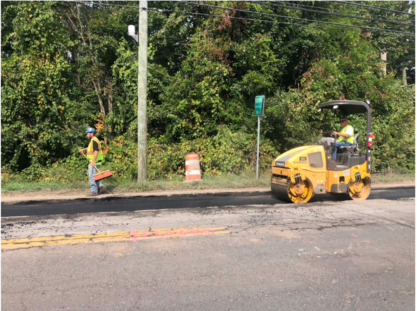
Picture 8: Ludlow compacting the first of three 3" lifts of asphalt between Stations 126+00 and 130+00 as part of trench cutback paving activities on the southbound lane of S. Main Street, Middletown. View to the west.