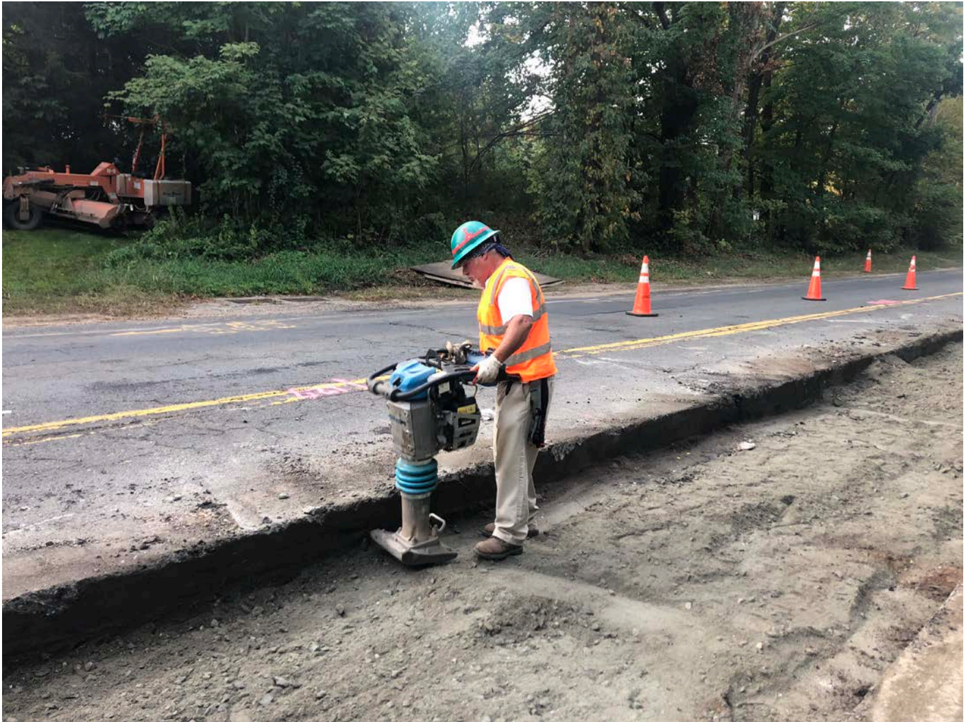
Picture 1: Ludlow using a jumping jack to compact 1.5" processed gravel along the edge of cut pavement as part of trench cutback paving activities on the southbound lane of S. Main Street, Middletown. View to the southeast.