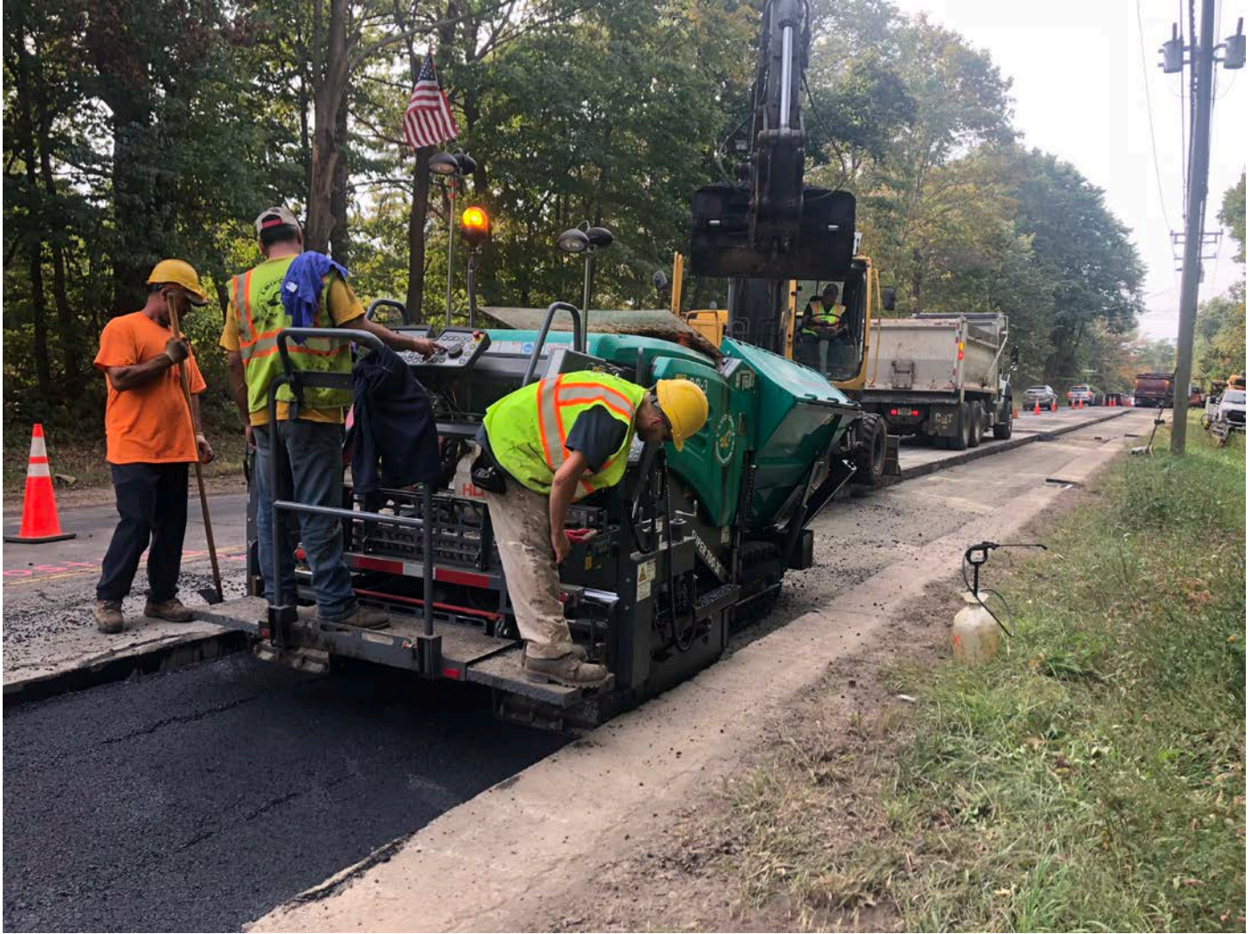
Picture 9: Ludlow placing the first of three 3" lifts of asphalt between Stations 126+00 and 130+00 as part of trench cutback paving activities on the southbound lane of S. Main Street, Middletown. View to the south.