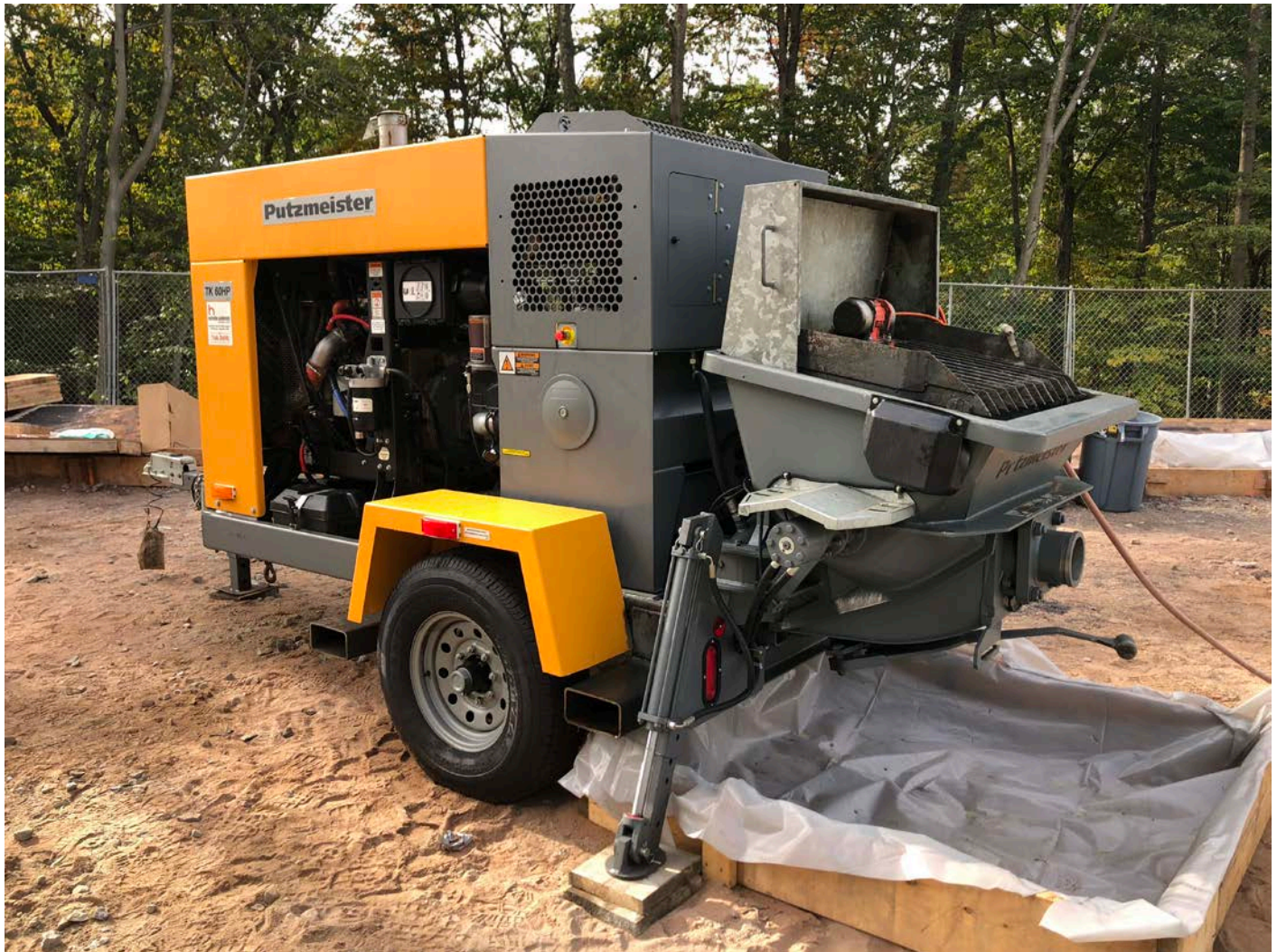
Picture 5: Pump trailer mobilized to the water tank work zone east of the Shared Access Driveway, Middletown in preparation of pumping grout into slot panels. View to the south.