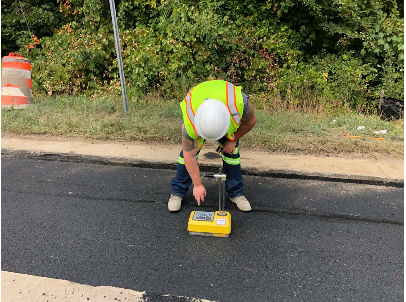
Picture 10: JTC collecting compaction data from the second of three 3" lifts of asphalt between Stations 126+00 and 130+00 on the southbound lane of S. Main Street, Middletown. View to the west.