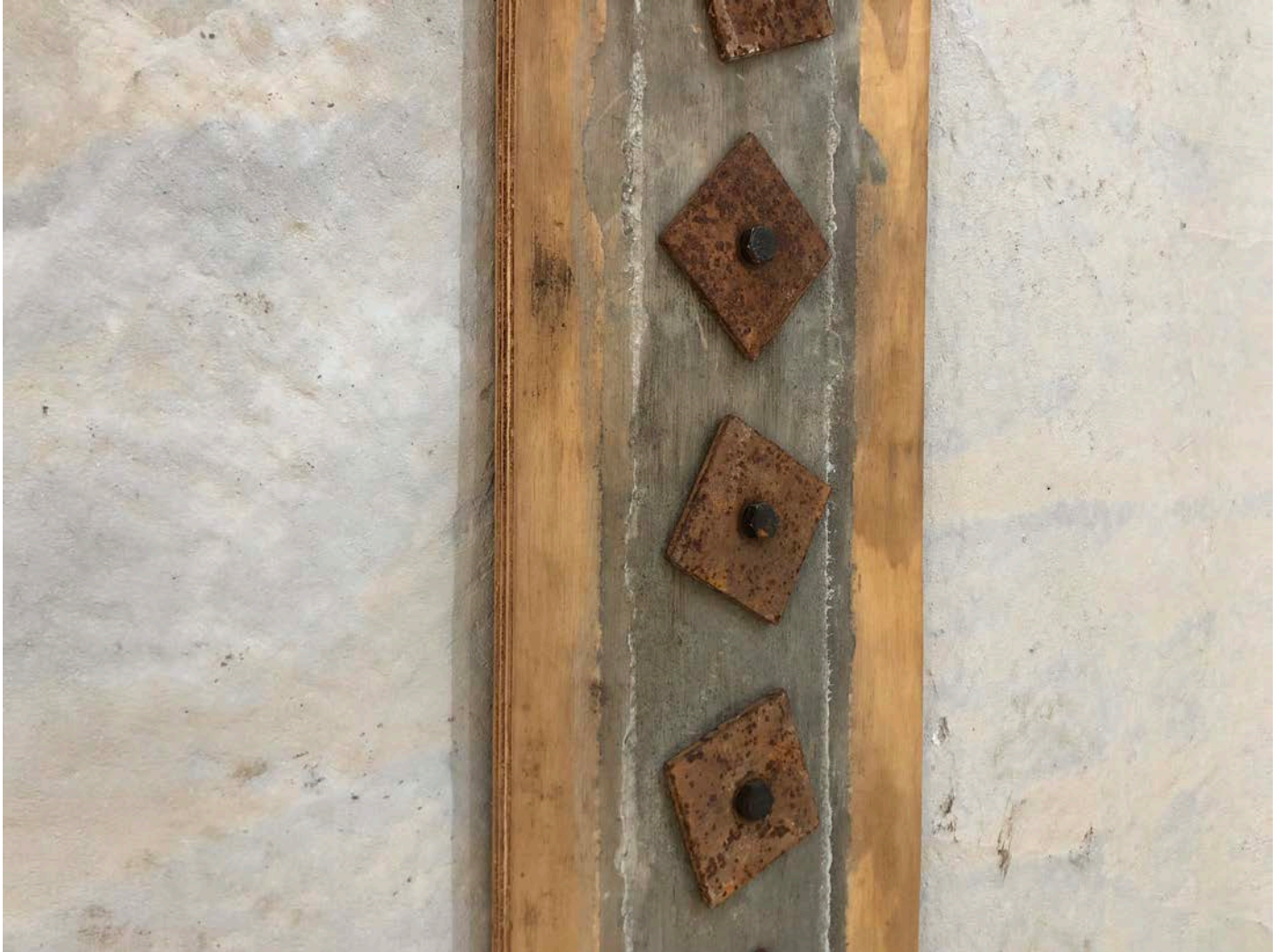
Picture 4: Closeup of plywood bolted to the back of a slot panel from the inside of the water tank. Water tank work zone, east of the Shared Access Driveway, Middletown.