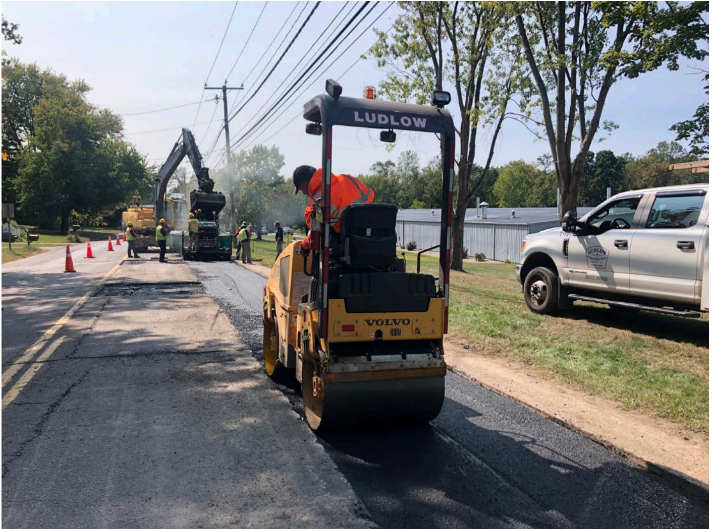
Picture 9: Ludlow compacting the third 3" lift of asphalt at Station 176+50 as part of trench cutback paving activities on S. Main Street, Middletown. View to the south.