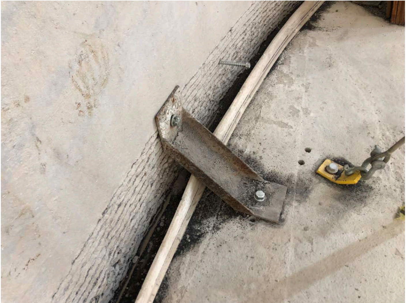
Picture 5: Brace anchoring water tank side panel to the base of the water tank. Water tank work zone, east of the Shared Access Driveway, Middletown.