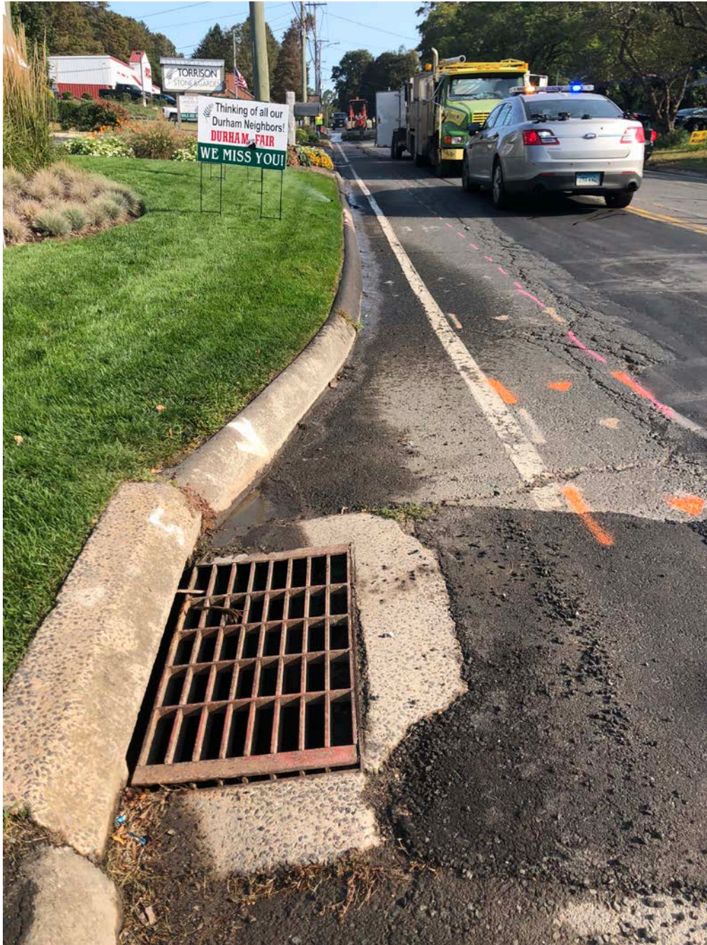
Picture 7: Catch basin without a silt sock located on the west side of Main Street, Durham, that is located downgradient of saw cutting activities being performed at Station 155+00. View to the north.