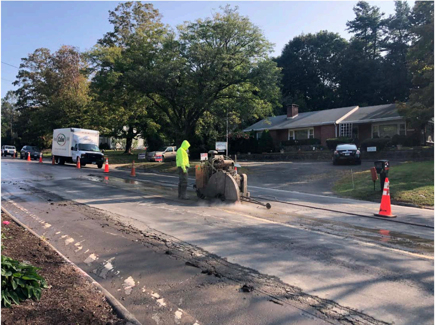
Picture 6: Veilleux saw cutting pavement at Station 155+00 on Main Street, Durham. View to the northeast.