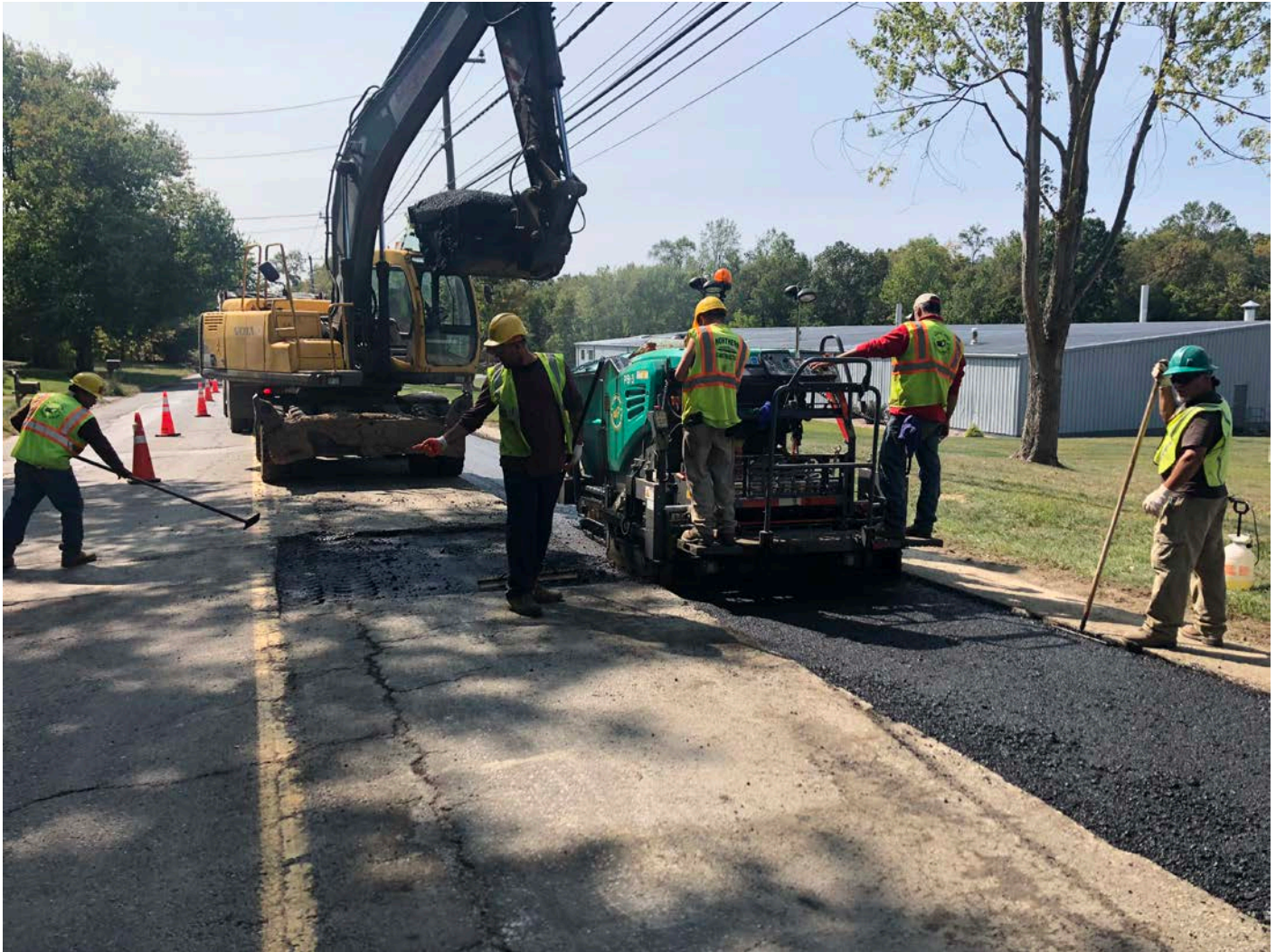
Picture 8: Ludlow applying the third 3" lift of asphalt at Station 177+00 as part of trench cutback paving activities on S. Main Street, Middletown. View to the south.