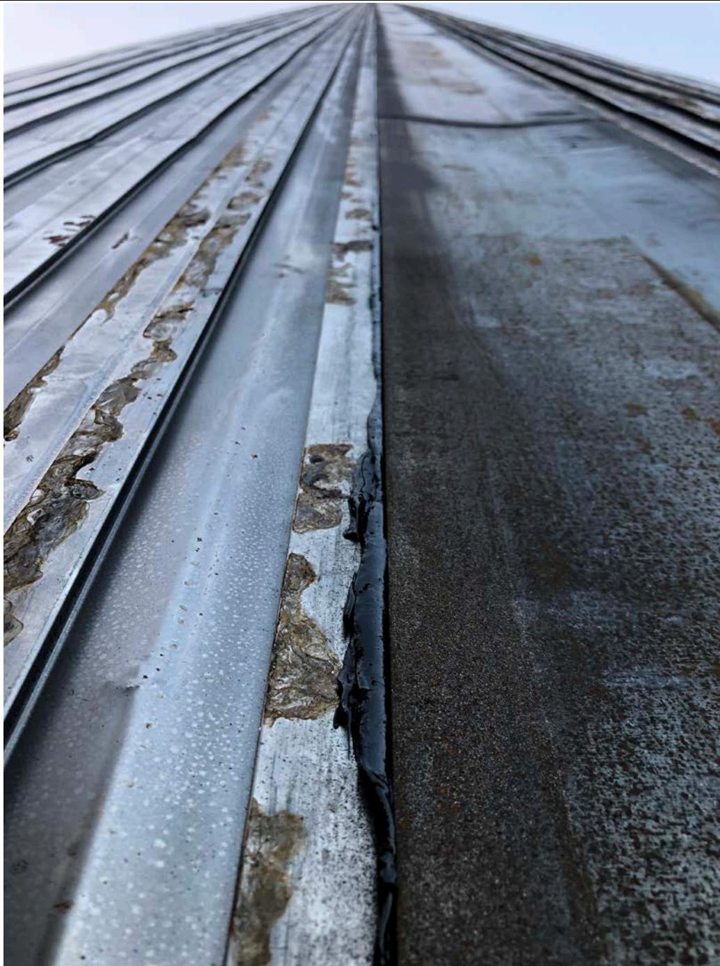
Picture 2: Closeup of caulk applied to seal a slot panel to the exterior of the water tank. Water tank work zone, east of the Shared Access Driveway, Middletown.