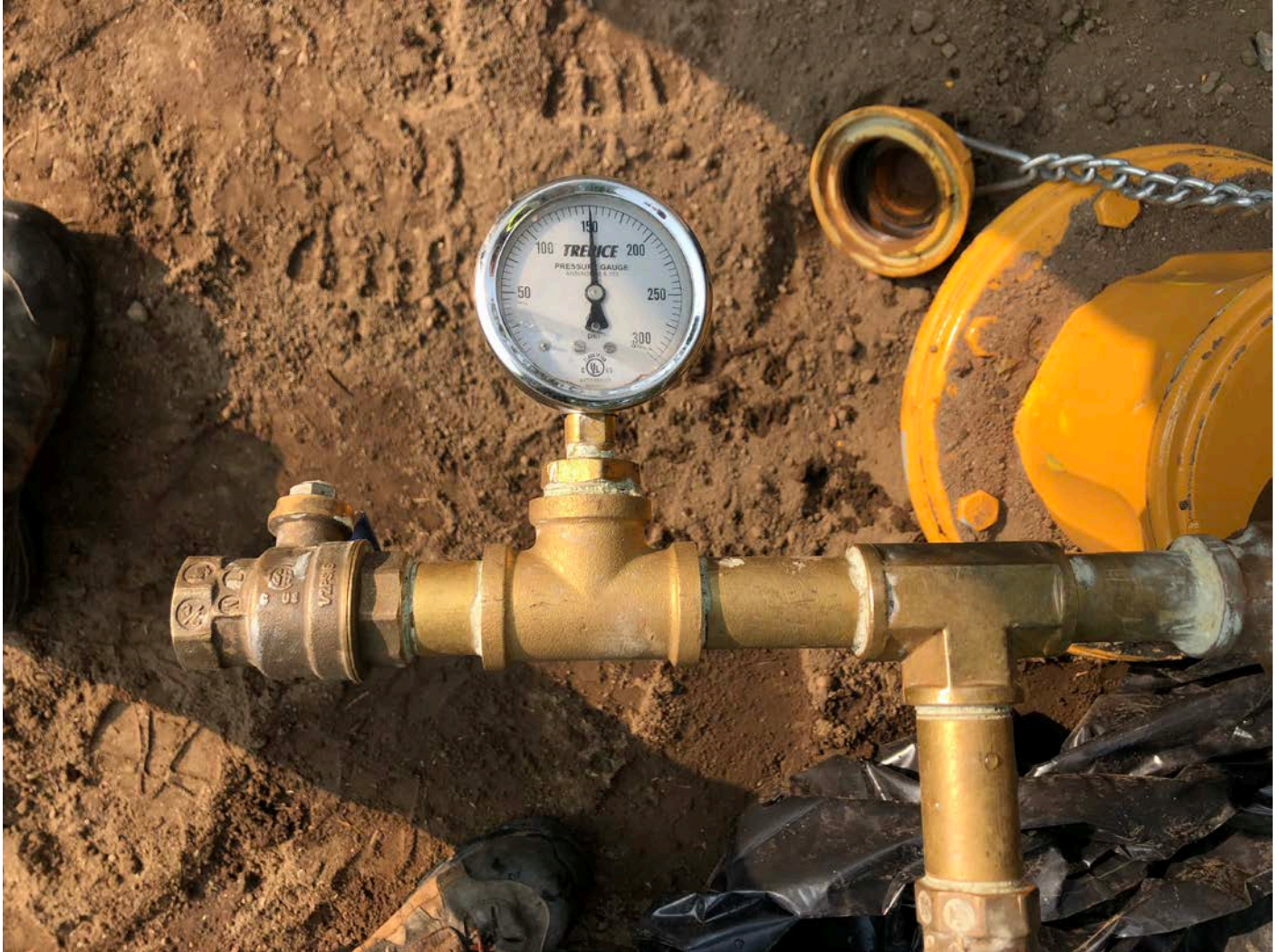
Picture 5: Starting pressure for the pressure test performed on the water line on Talcott Lane, Durham.