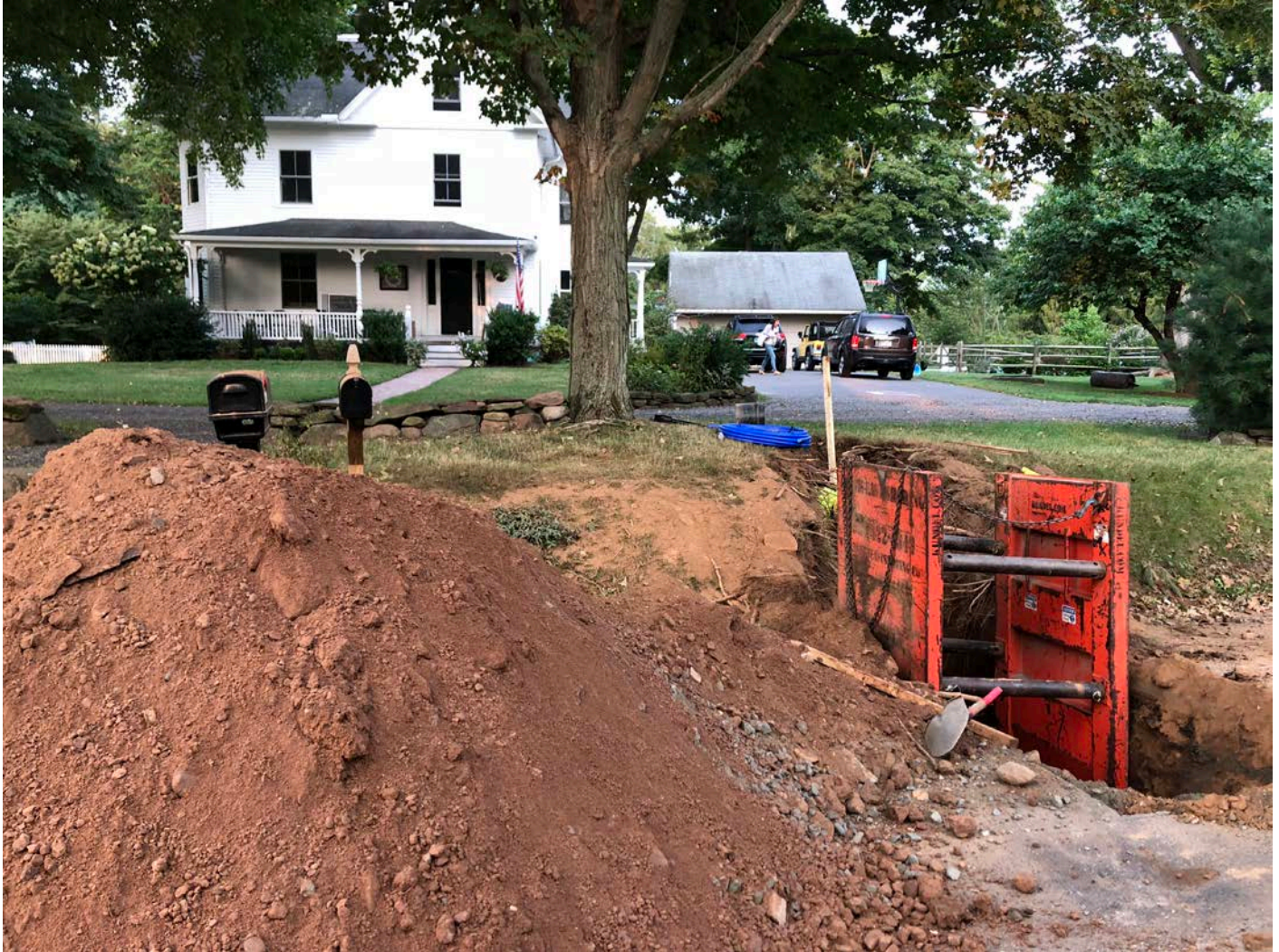
Picture 3: Ludlow installing a corporation stop at Station 940+82 for service to 254 Maple Avenue, Durham. View to the northeast.