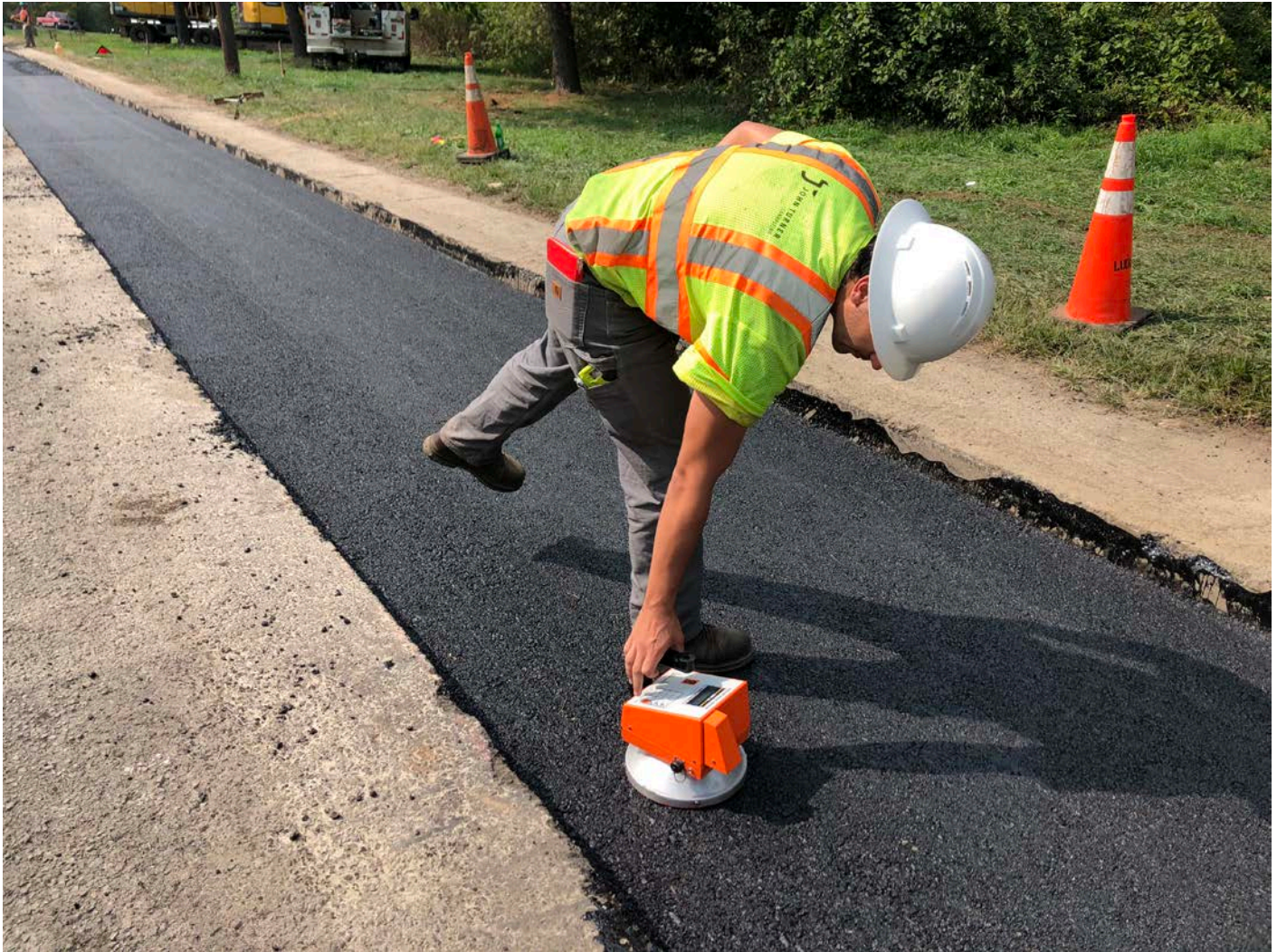
Picture 9: JTC collecting compaction data from the top of compacted asphalt on S. Main Street, Middletown as part of trench cutback repaving activities. View to the southwest.