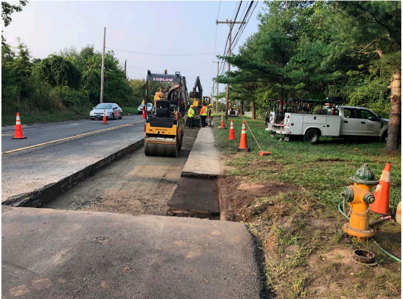
Picture 4: Ludlow compacting 1.5" processed gravel as part of the trench cutback repaving activities on S. Main Street, Middletown. View to the south.