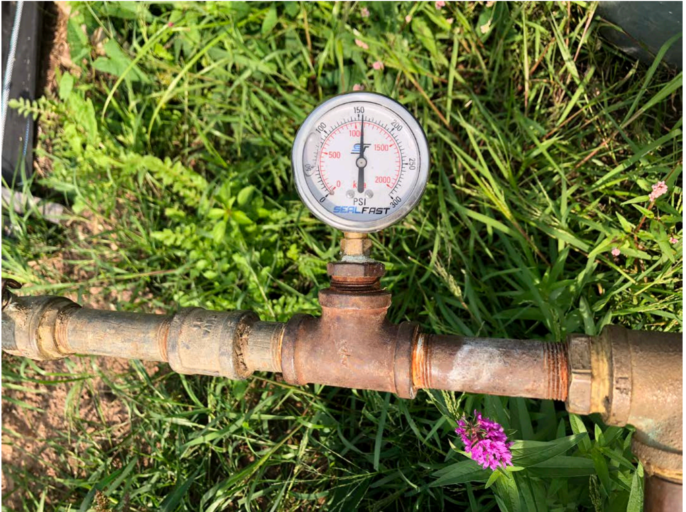
Picture 8: End pressure for the pressure test performed on the section of water line on Maiden Lane between the intersection of Main Street and Brick Lane, Durham.