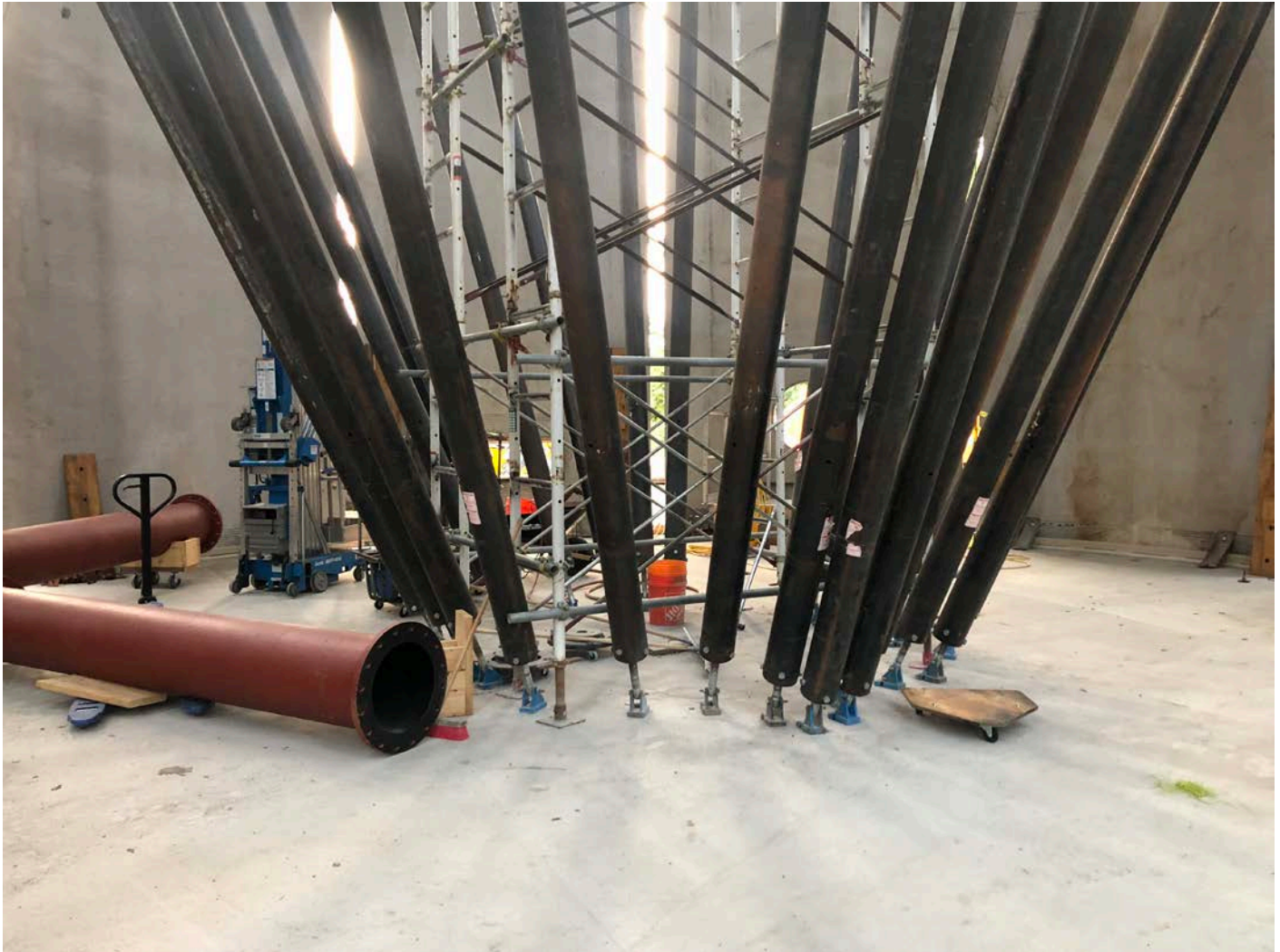
Picture 2: View of the knee braces that are supporting the water tank side panels. Water tank work zone, east of the Shared Access Driveway, Middletown.