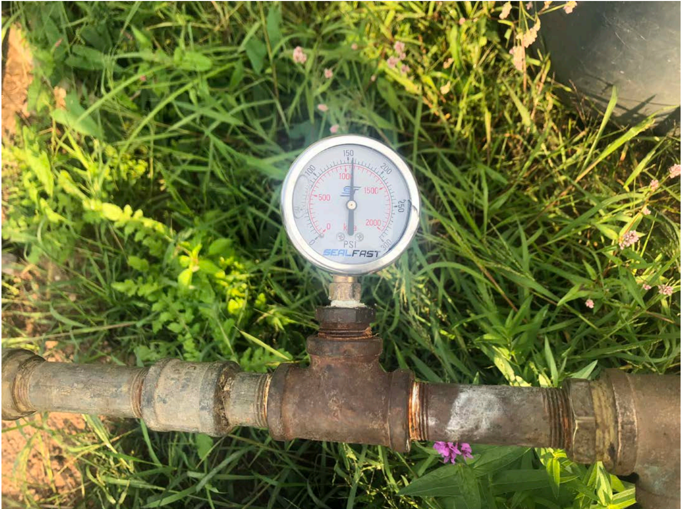
Picture 6: Starting pressure for the pressure test performed on the section of water line on Maiden Lane between the intersection of Main Street and Brick Lane, Durham.