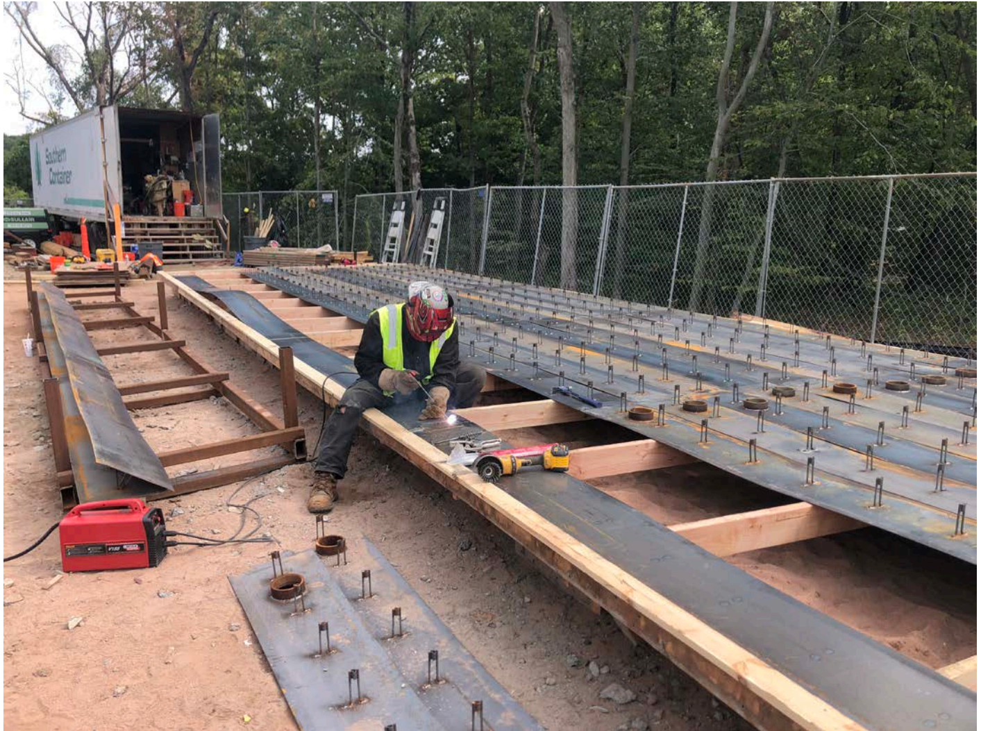
Picture 10: DN Tanks welding slot panels together. Water tank work zone, east of the Shared Access Driveway, Middletown. View to the southeast.