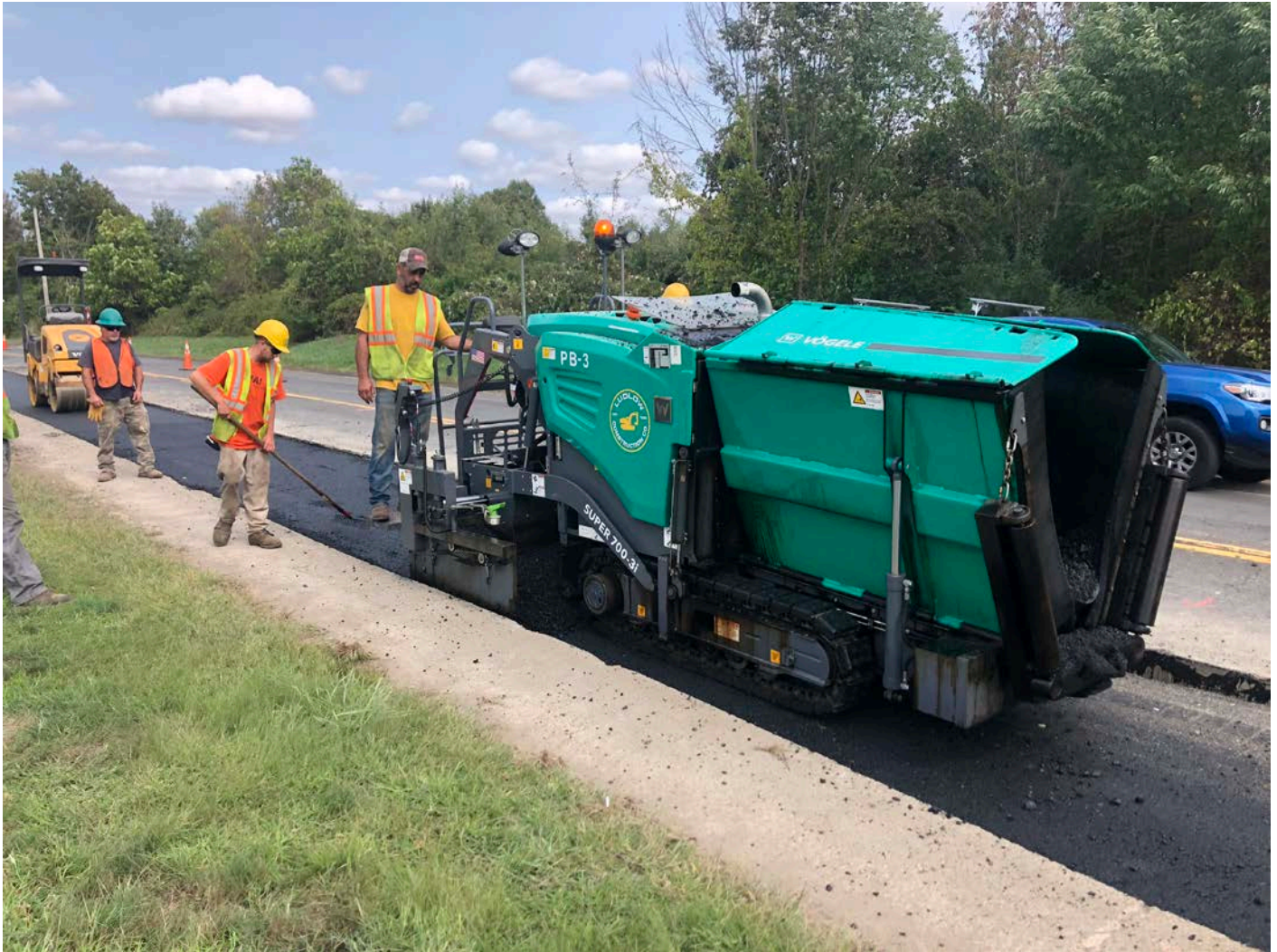
Picture 11: Ludlow applying the third 3" lift of asphalt during trench cutback paving activities. S. Main Street, Middletown. View to the northeast.