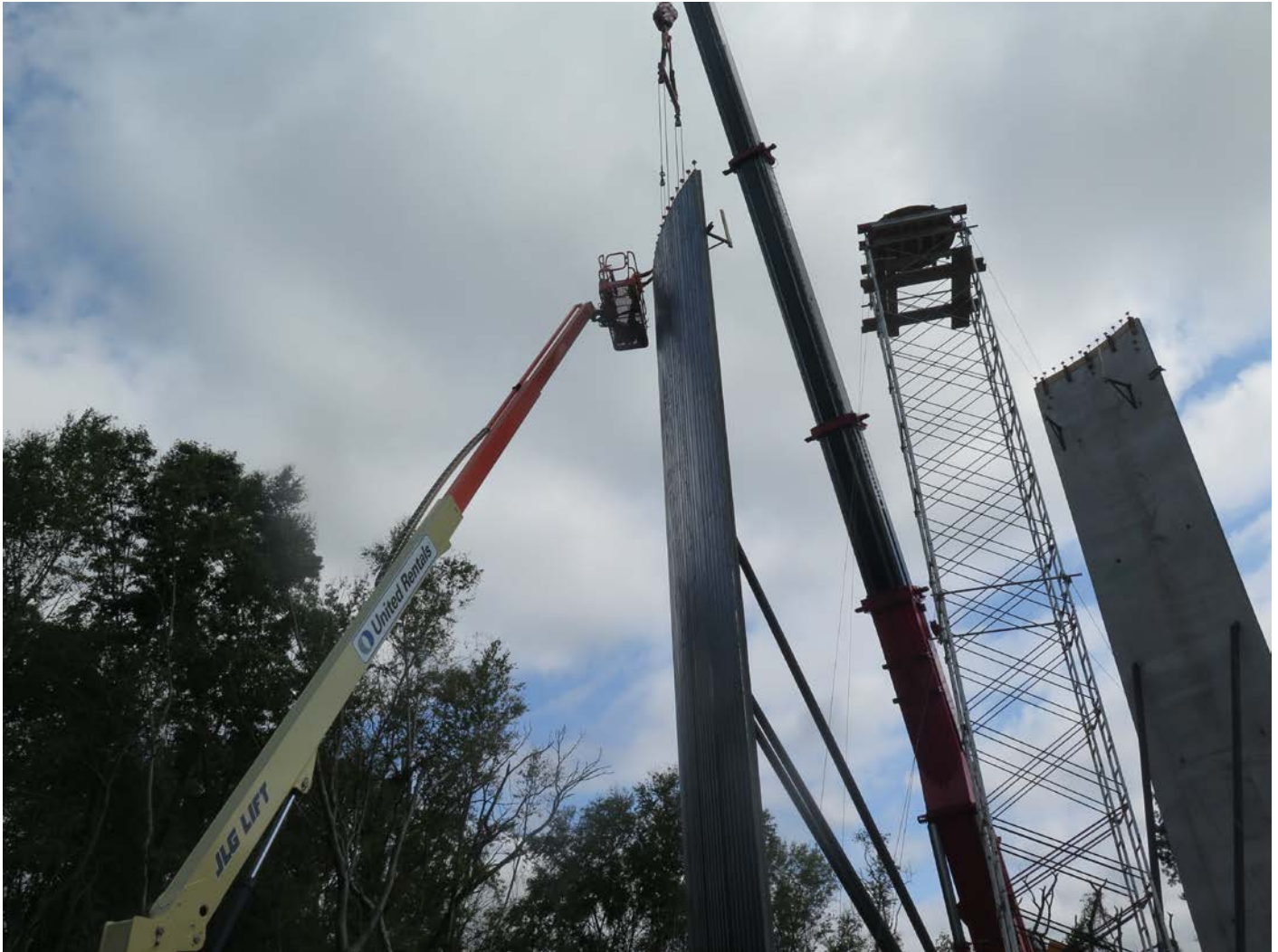
Picture 10: Worker on raised platform tying upper edges of second and third panels together. Shared access driveway, Middletown; view to the northeast.