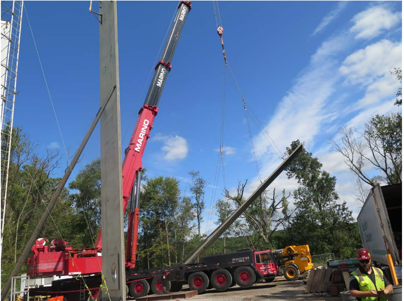
Picture 13: Lifting fifth tank wall panel. Shared access driveway, Middletown; view to the east.