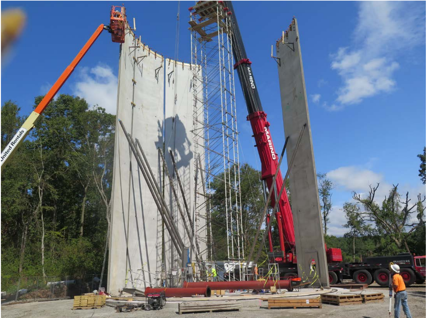
Picture 12: Fourth tank wall panel in place, preparing to secure upper edges to third panel. Note three bar clamps between second and third panels. Shared access driveway, Middletown; view to the northeast.