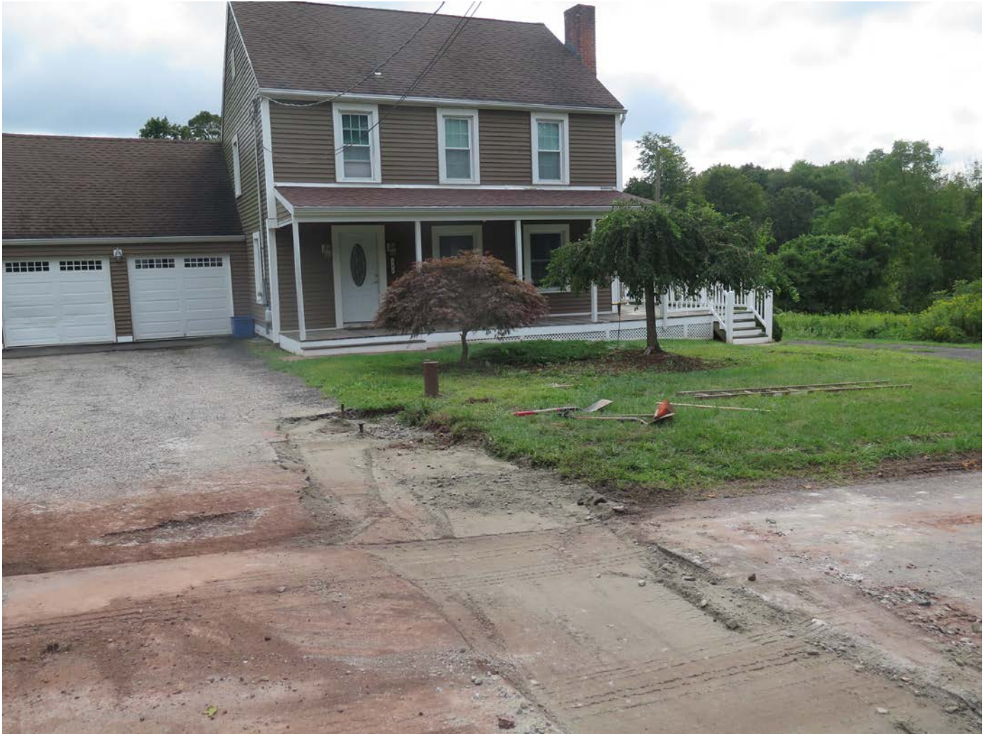
Picture 3: Backfilled curb stop at #245 Maple Street, Durham. View to the east.