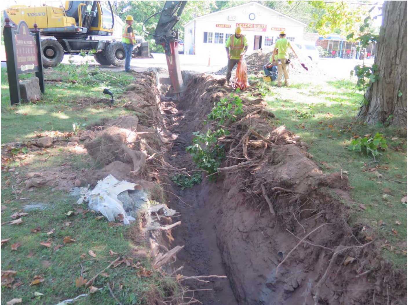
Picture 2: Installing curb stop at #328 Main Street, Durham, using hammer attachment to remove ledge. View to the east.