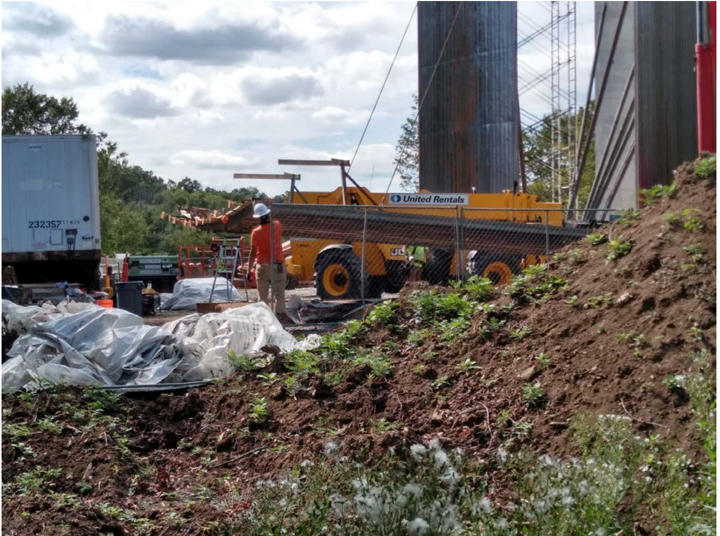
Picture 18: Hammering off loose flakes of concrete from edges of sixth tank wall panel. Shared access driveway, Middletown; view to the west.