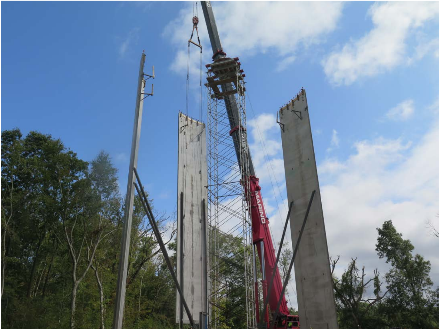
Picture 8: Moving third tank wall panel to tank base slab. Shared access driveway, Middletown; view to the northeast.