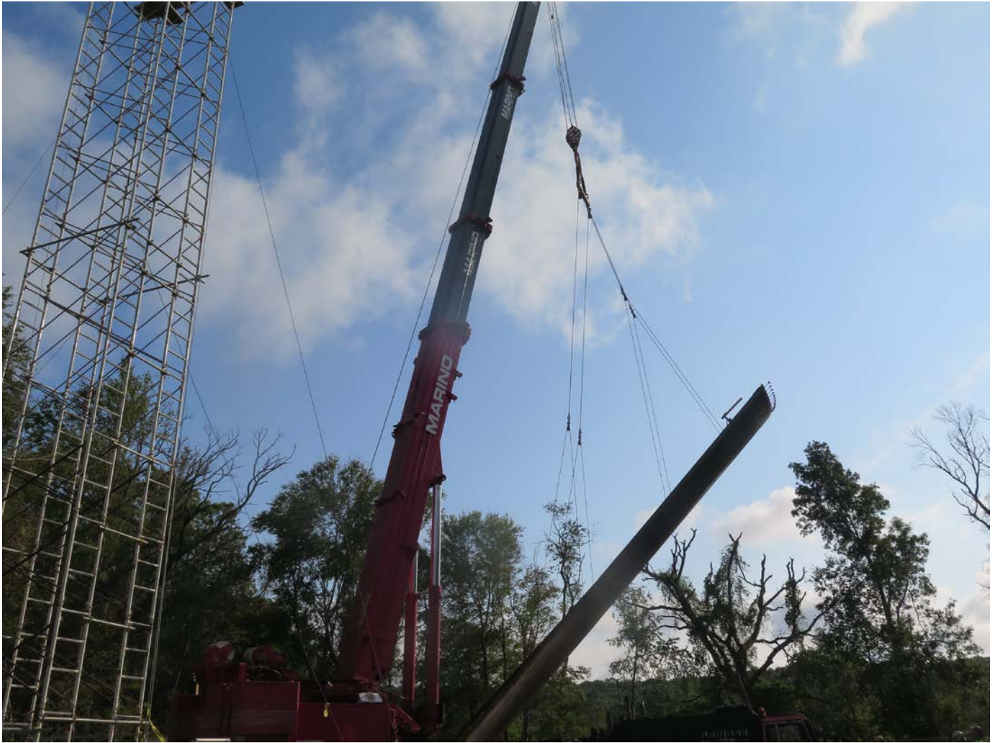
Picture 5: Lifting first tank wall panel. Shared access driveway, Middletown; view to the east.