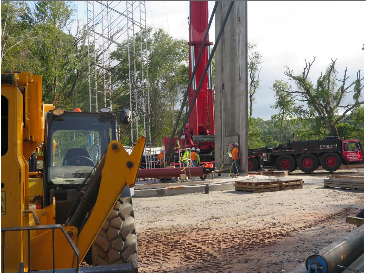
Picture 6: DN Tanks securing first tank wall panel. Note bracing poles tied into tank base slab. Shared access driveway, Middletown; view to the east.