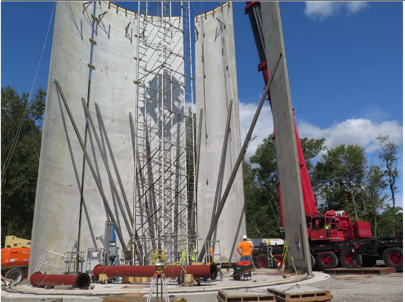
Picture 14: Placing fifth tank wall panel. Shared access driveway, Middletown; view to the northeast.