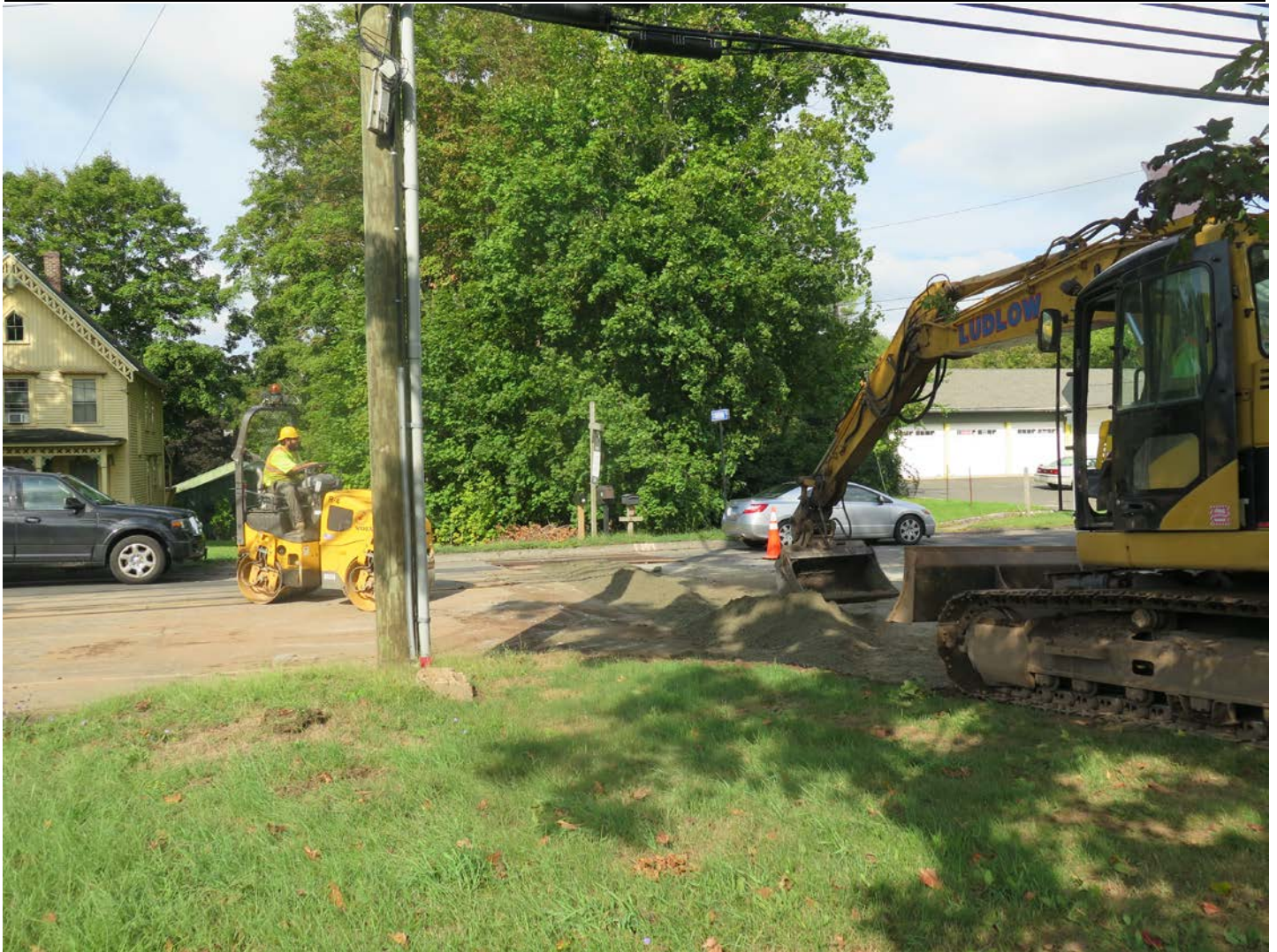
Picture 1: Backfilling curb stop at Station 1174+00 on Main Street, east side. View to the west.