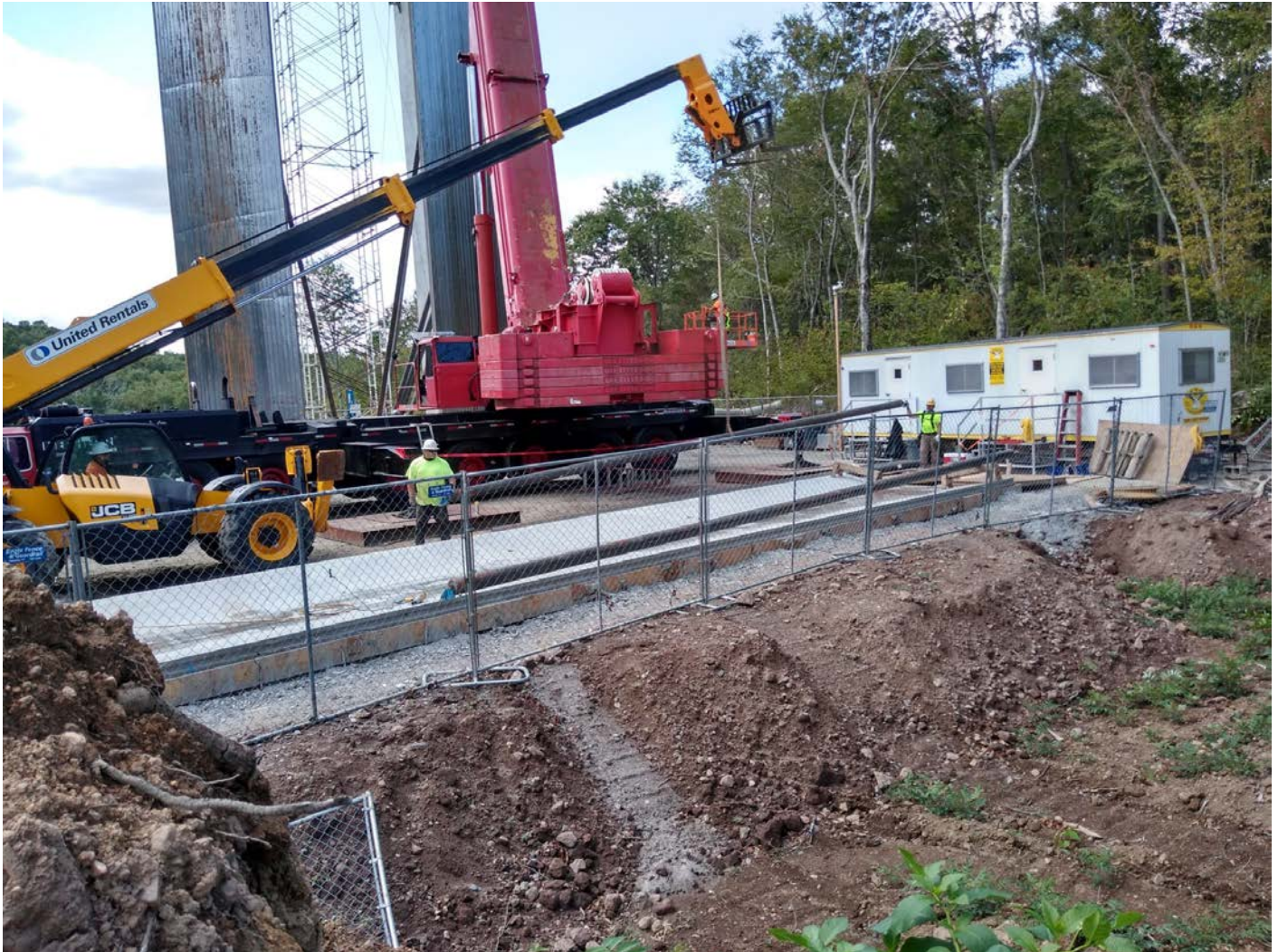
Picture 16: Attaching bracing poles to sixth tank wall panel. Shared access driveway, Middletown; view to the Northwest.