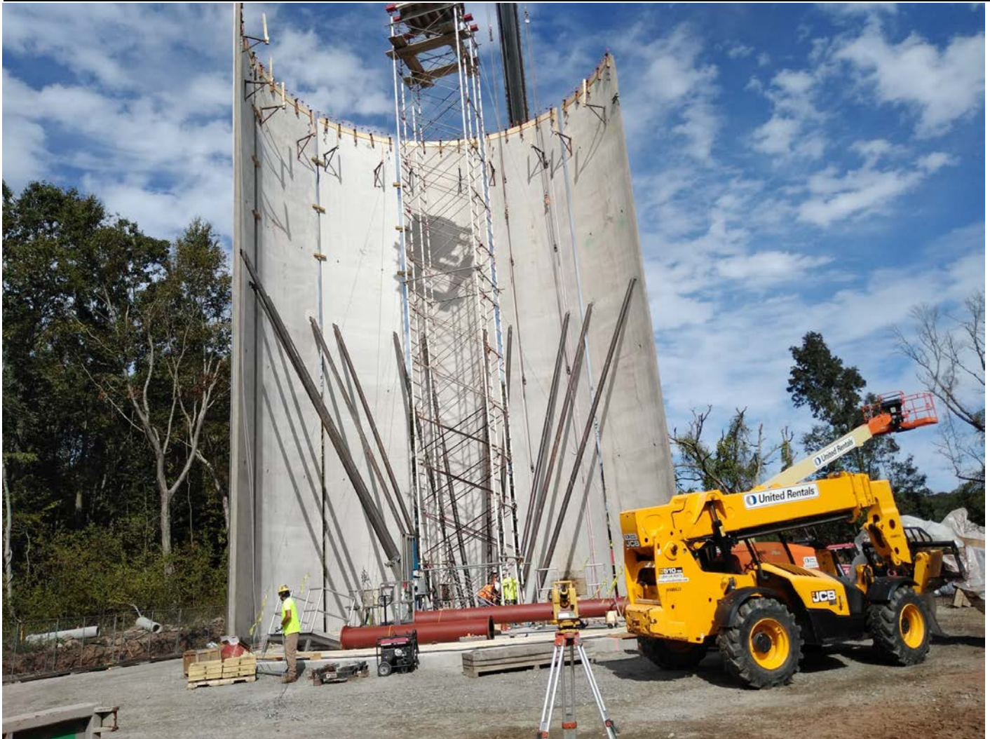
Picture 21: Securing bracing poles of sixth tank wall panel to tank slab. Shared access driveway, Middletown; view to the northeast.