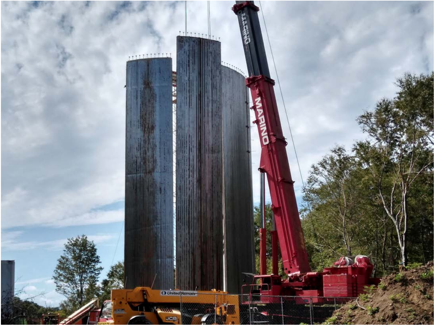
Picture 20: Positioning sixth tank wall panel on tank slab. Shared access driveway, Middletown; view to the west.