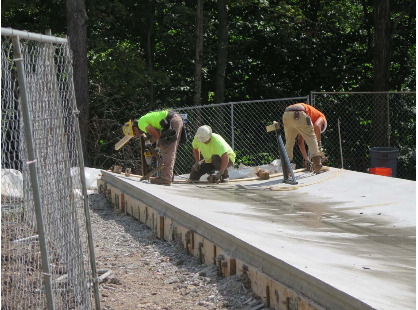
Picture 15: Adding supports to upper end of sixth tank wall panel. Shared access driveway, Middletown; view to the south.