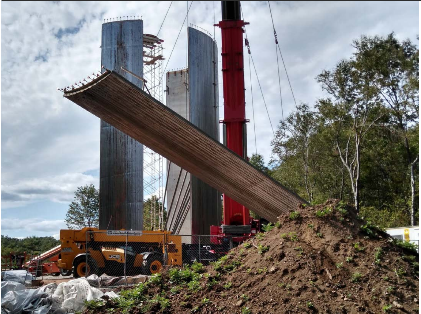
Picture 19: Beginning to lift sixth tank wall panel. Shared access driveway, Middletown; view to the west.