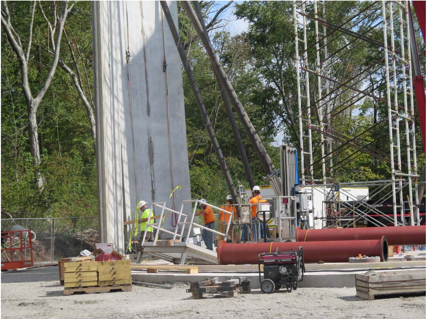
Picture 9: Securing base of third tank wall panel. Shared access driveway, Middletown; view to the northeast.