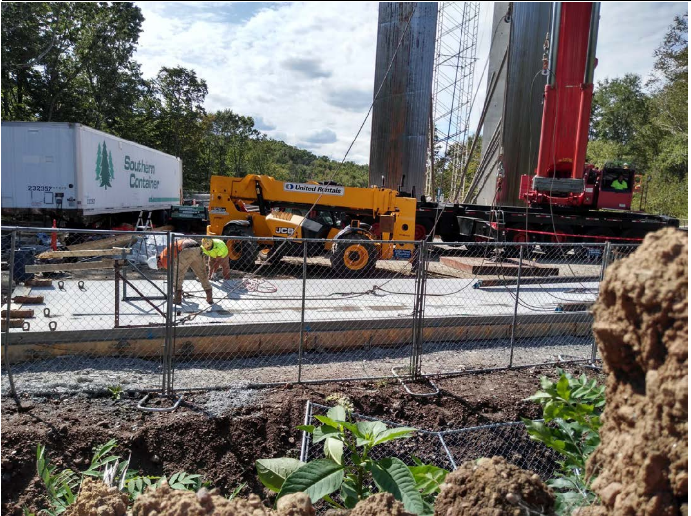
Picture 17: Attaching lifting cables to sixth tank wall panel. Shared access driveway, Middletown; view to the west.