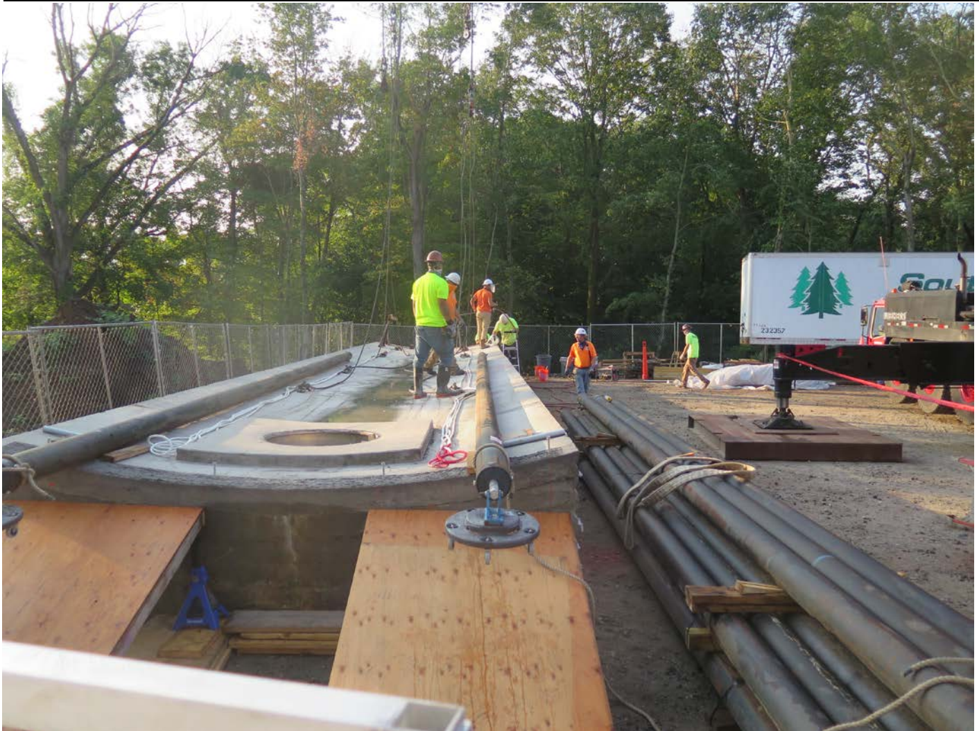
Picture 4: DN Tanks preparing the first tank wall panel for installation. Note rolling bases and guide ropes attached to bottoms of bracing poles, attached lifting cables with ropes for pulling release levers, and more bracing poles staged to the right of the stack of panels. Shared access driveway, Middletown; view to the south.