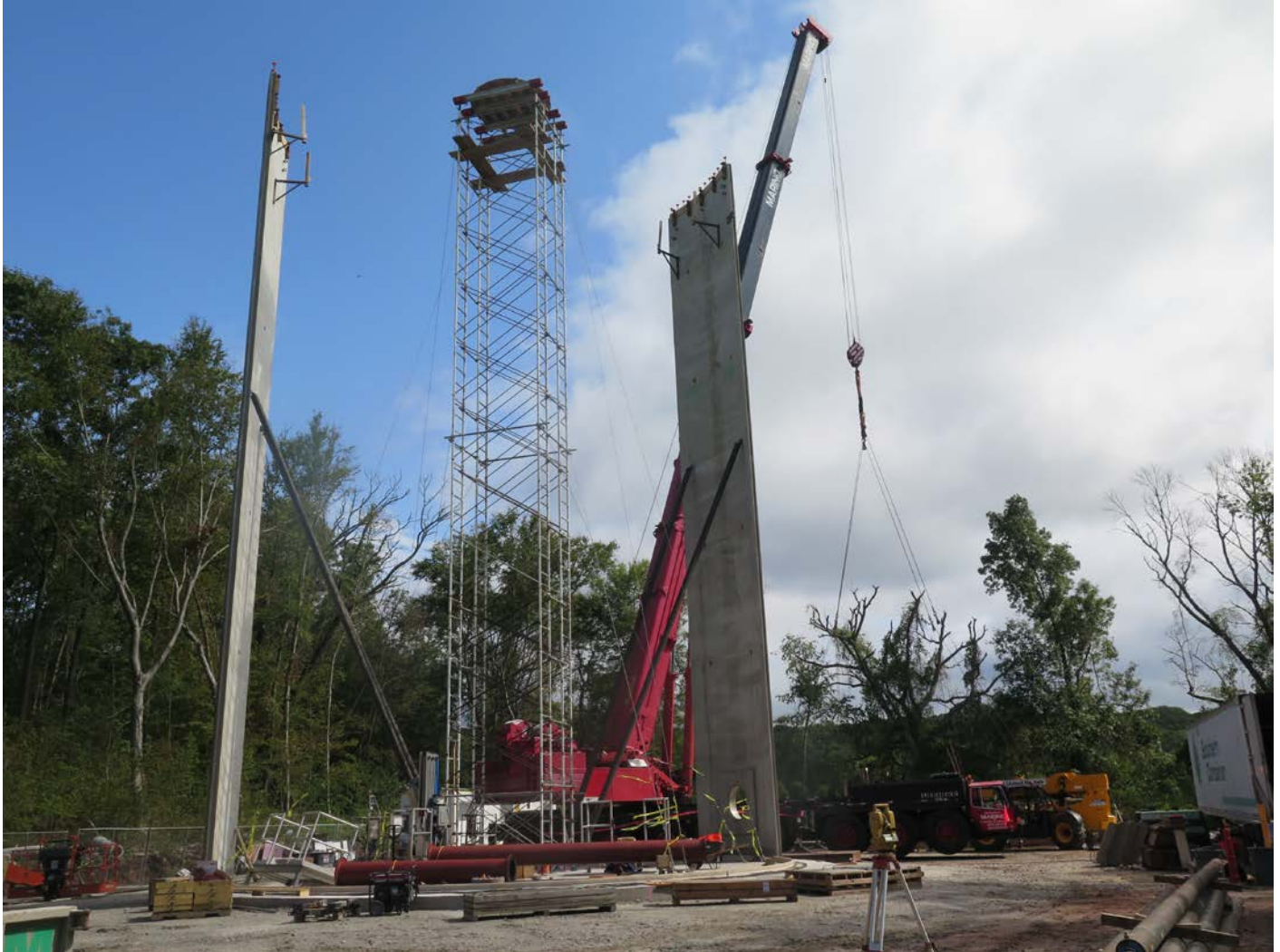
Picture 7: Second tank wall panel in place, DN Tanks preparing to lift third tank wall panel. Shared access driveway, Middletown; view to the east.