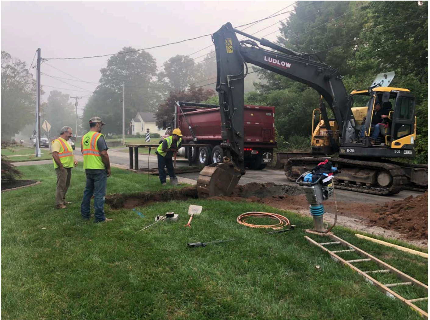
Picture 1: Ludlow excavating for the installation of a curb stop at 166 Maple Avenue, Durham. View to the northeast.