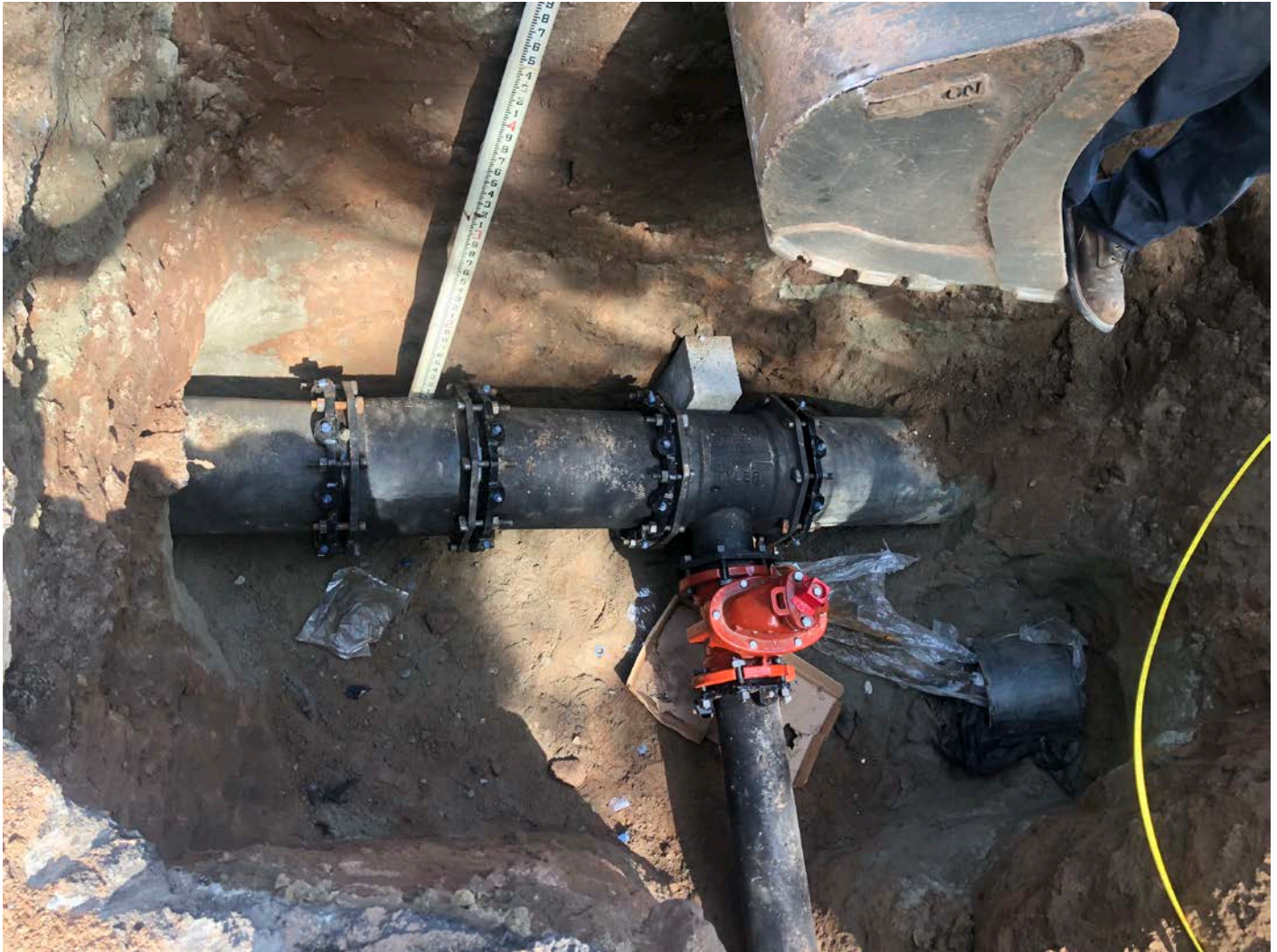
Picture 9: 6" 12"x12"x6" TEE with 6" gate valve and gate box installed at Station 401+37, where Ludlow is in the process of installing a new hydrant. Maiden Lane, Durham.