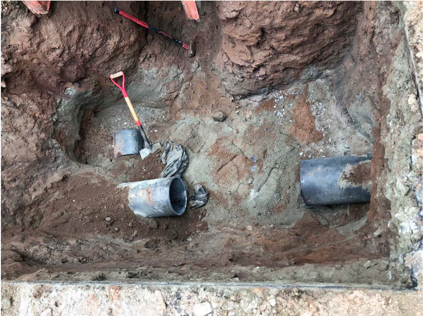
Picture 5: 12" DIP located at Station 401+37, where Ludlow is in the process of installing a new hydrant TEE/gate valve assembly for the hydrant they are in the process of installing. Maiden Lane, Durham.