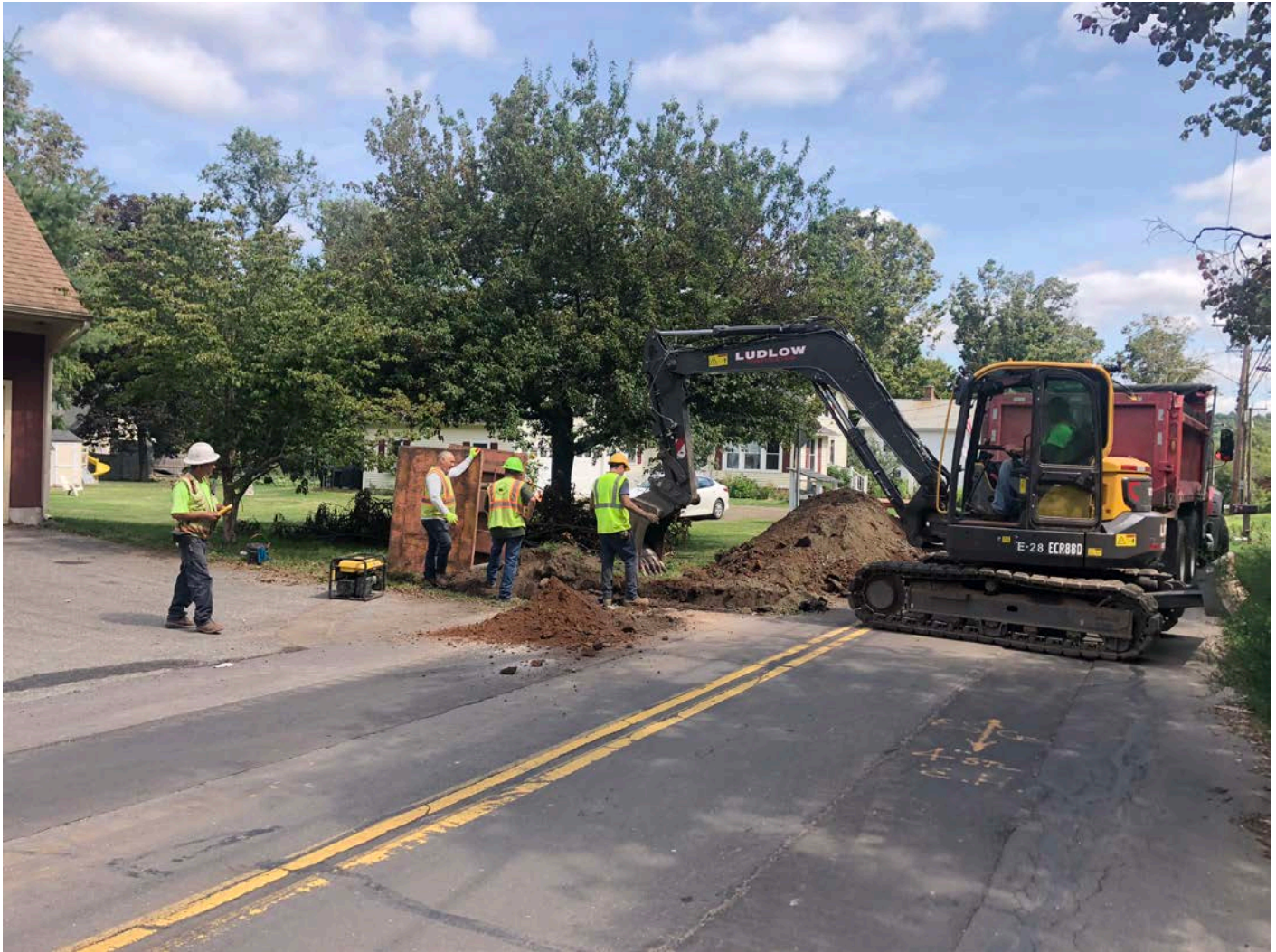
Picture 11: Ludlow excavating a trench at Station ~402+50, Maiden Lane, for the installation of a curb stop. View to the northwest.