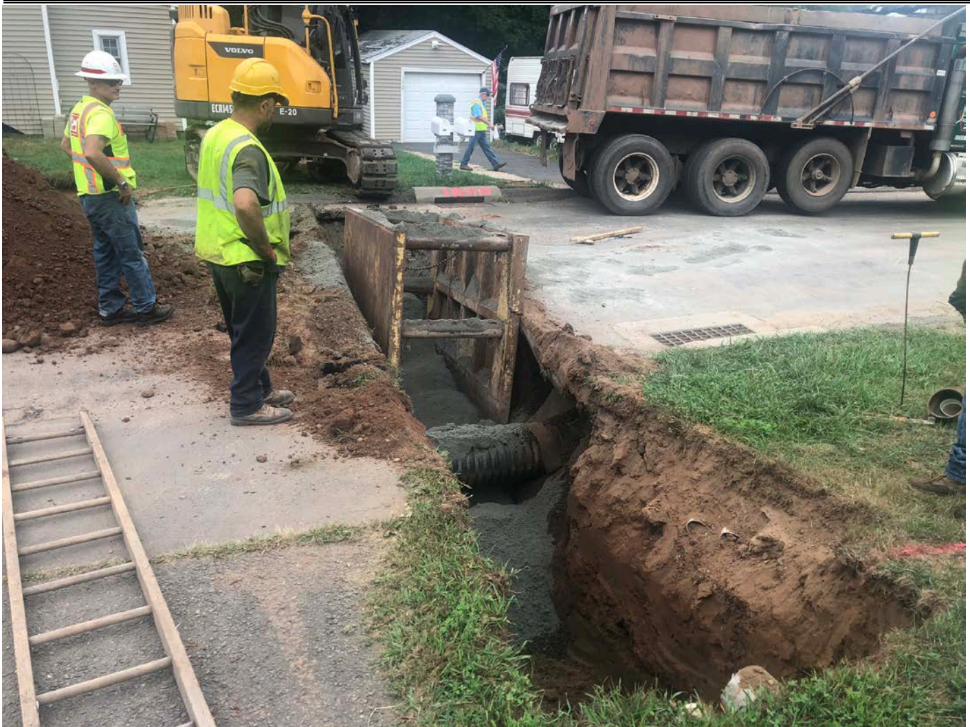
Picture 2: Ludlow installing a curb stop at 173 Maple Avenue, Durham. View to the west.