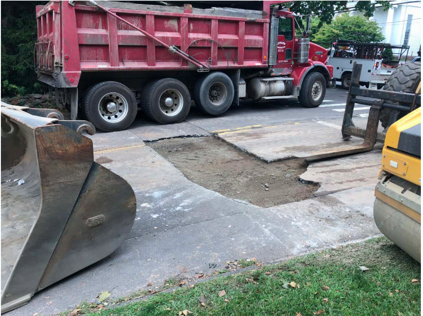
Picture 4: Patch in asphalt where Ludlow blanked off the existing 6" gate valve for the hydrant that was going to be installed at Station 400+85. View to the southwest.