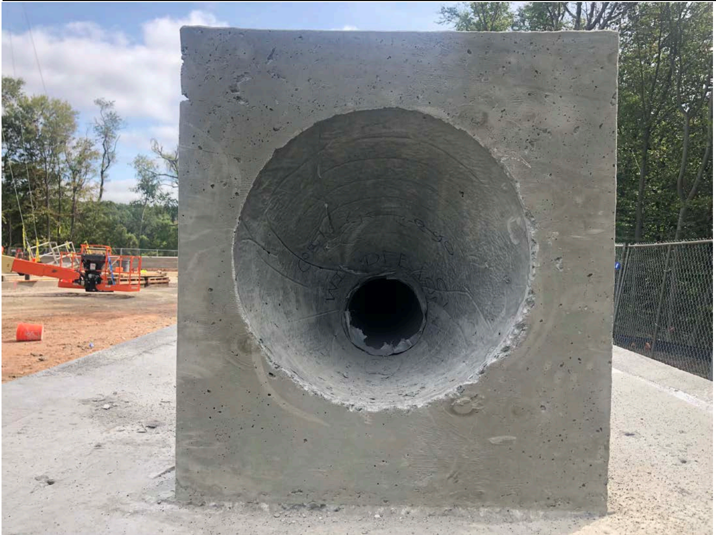
Picture 7: 8" DIP overflow pipe on water tank after being cast onto the wall of one of the narrow water tank side panels. Water tank work zone, east of the Shared Access Driveway, Middletown. View to the east.