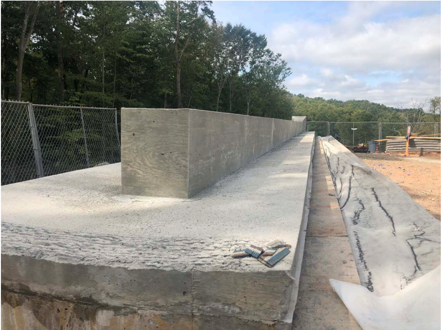
Picture 8: 8" DIP overflow pipe on water tank after being cast onto the wall of one of the narrow water tank side panels. Water tank work zone, east of the Shared Access Driveway, Middletown. View to the west.