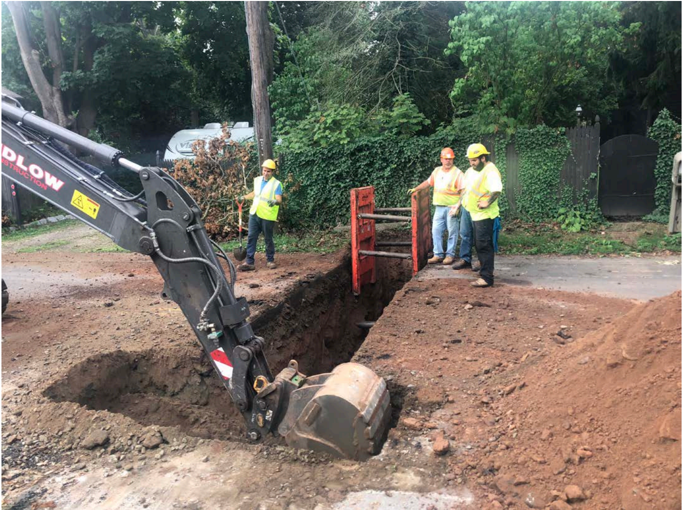
Picture 3: Ludlow excavating for the installation of a hydrant at Station 401+37, Maiden Lane, Durham. The residence at 239 Main Street is in the background. View to the south.