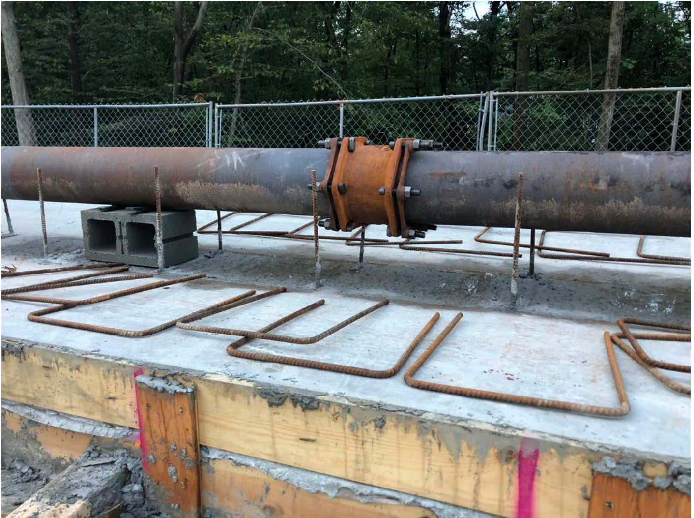
Picture 2: Solid sleeve on 8" DIP for the water tank overflow that was installed on one of the narrow water tank side panels. Water tank work zone, east of the Shared Access Driveway, Middletown. View to the south.