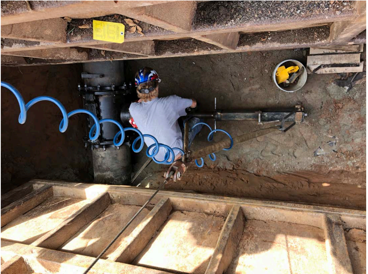
Picture 7: JMS Connections tapping 16" main water line at Station 171.83.5, 350 Main Street, Durham.