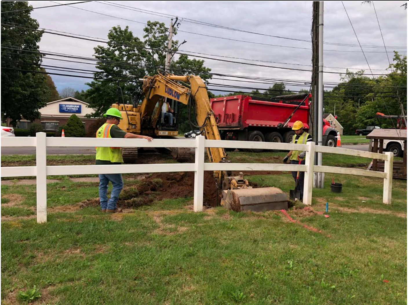
Picture 3: Ludlow begins to excavate for the installation of a curb stop and an 8" DIP fire service line at Station 171+83.5. Main Street, Durham. View to the east.