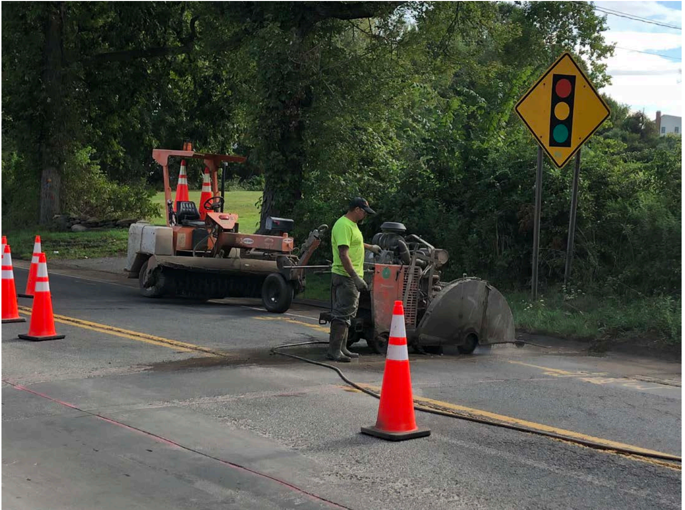
Picture 5: Veilleux saw cutting pavement on Main Street, Durham for the installation of a curb stop. View to the southwest.