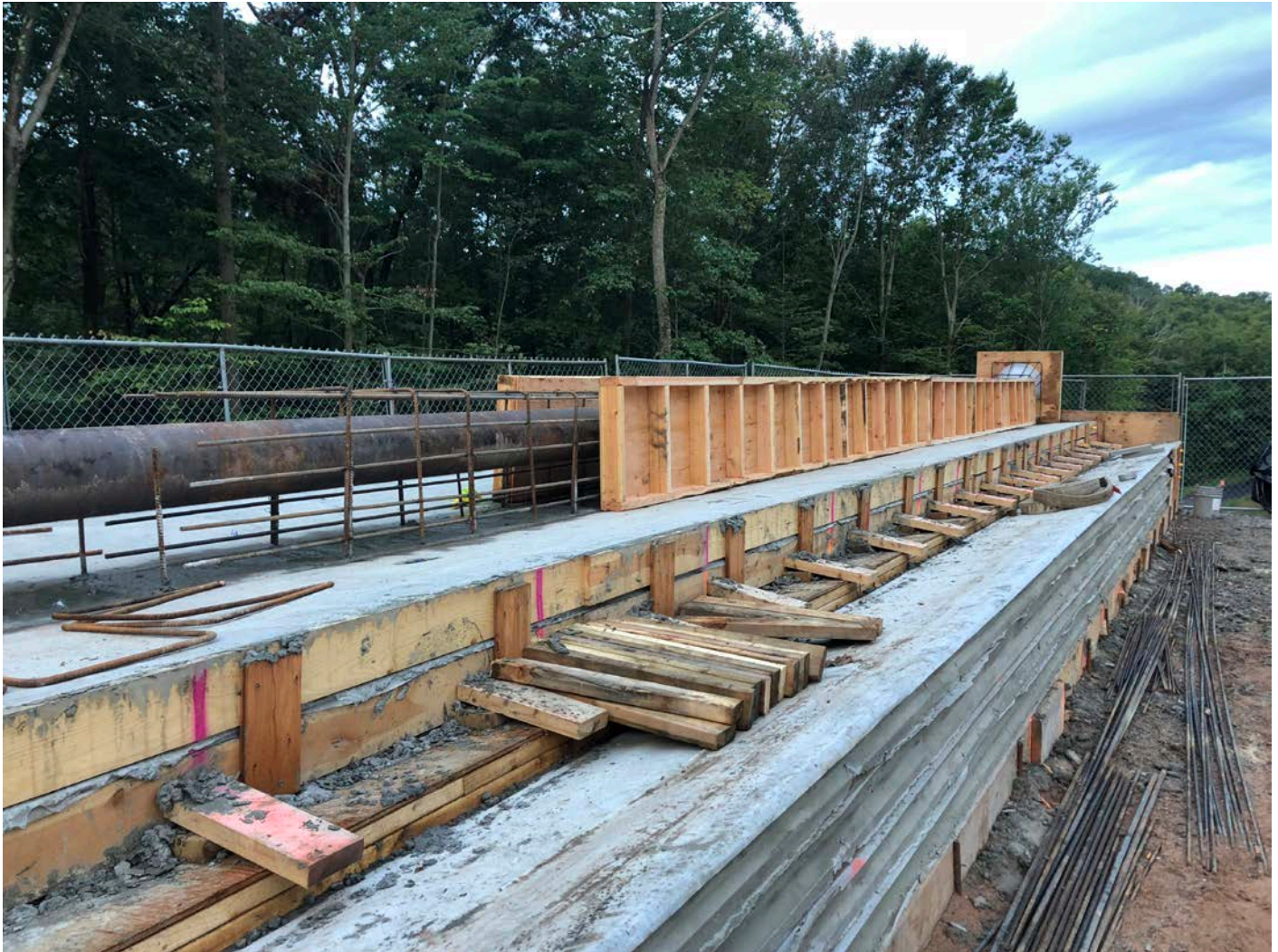
Picture 1: DN Tanks building a concrete form around the 8" DIP overflow pipe that was installed on one of the narrow water tank side panels. Water tank work zone, east of the Shared Access Driveway, Middletown. View to the west.