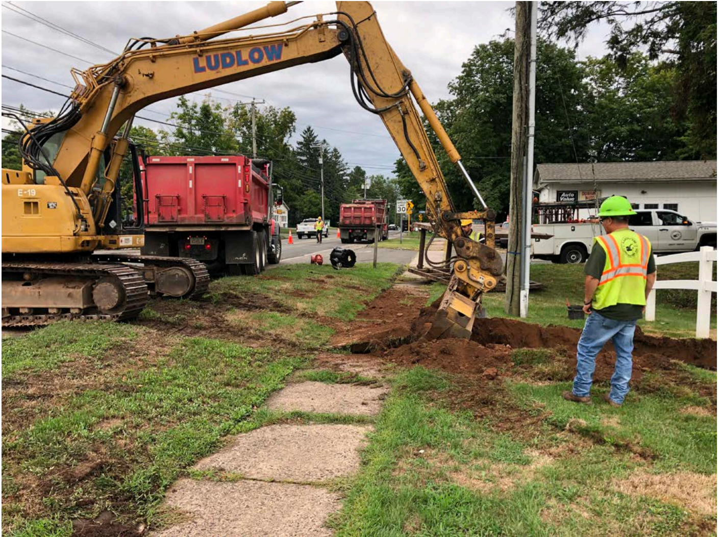
Picture 4: Ludlow removing a panel from concrete sidewalk as they excavate for the installation of a curb stop and an 8" DIP fire service line at Station 171+83.5. Main Street, Durham. View to the south.