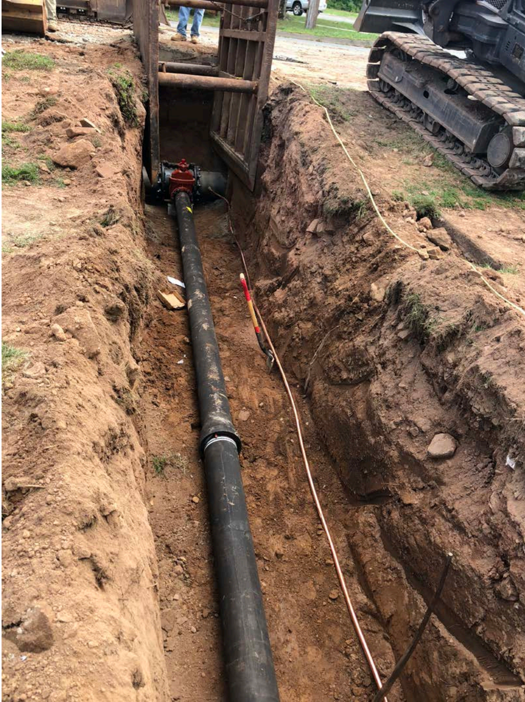
Picture 8: 8" DIP fire service line and 1" curb stop installed at Station 171+83.5. Main Street, Durham. View to the east.