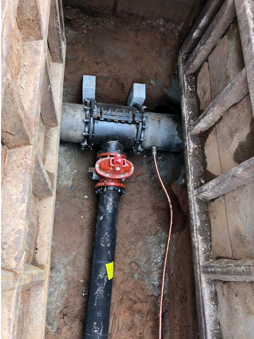
Picture 9: Tapping sleeve, 8" gate valve, 8" DIP fire service line, 1" corporation stop, and 1" copper water service line at Station 171+83.5. Main Street, Durham.