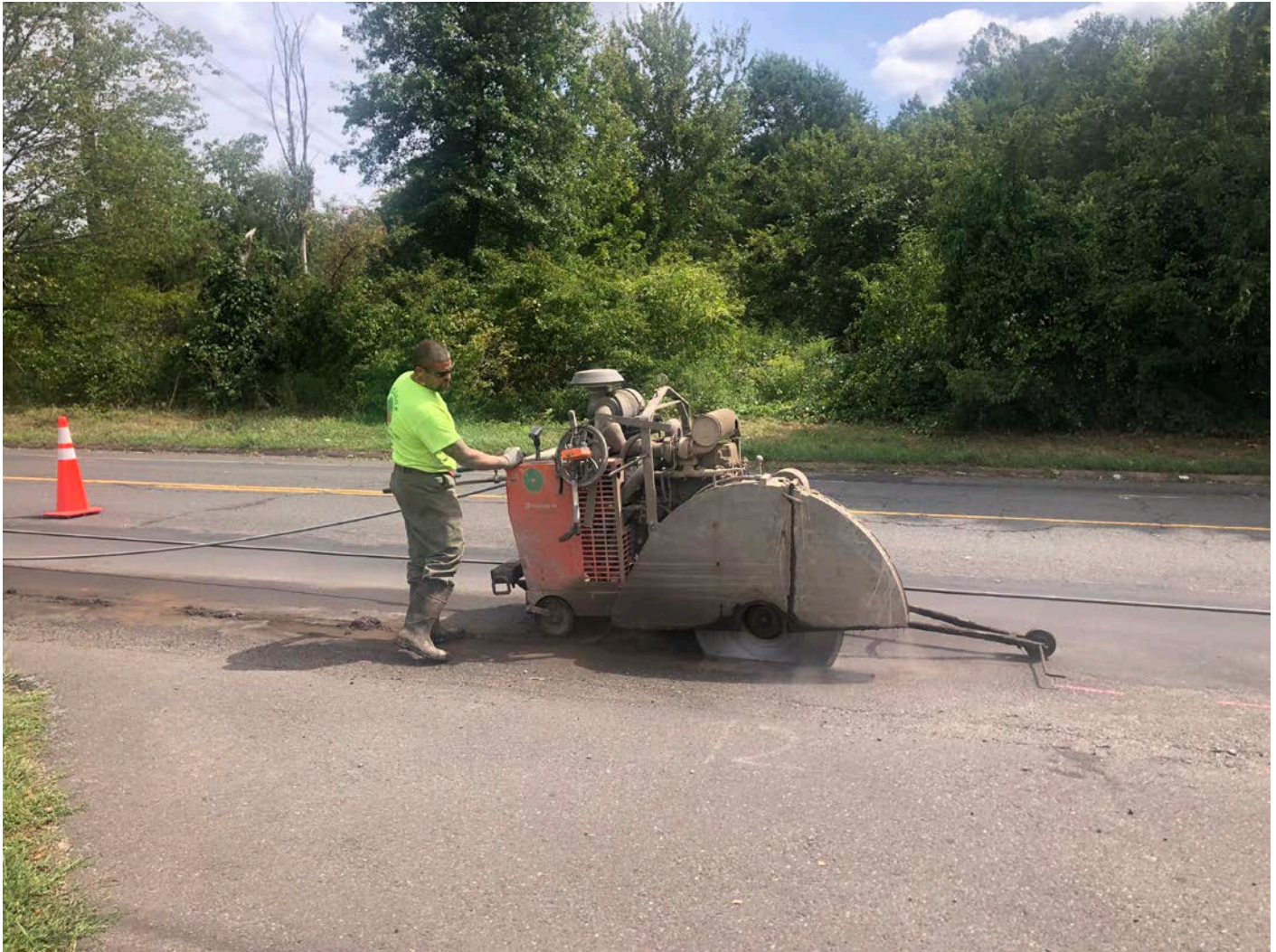
Picture 9: Ludlow contractor saw cutting pavement on S. Main Street, Middletown near Station 114+00. View to the east.