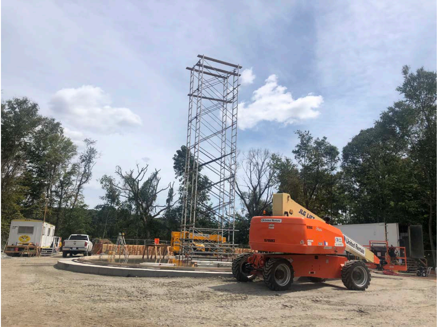
Picture 8: DN Tanks has erected approximately 30' of the ~71 foot center tower on the center of the water tank base. Water tank work zone, east of the Shared Access Driveway, Middletown. View to the northwest.