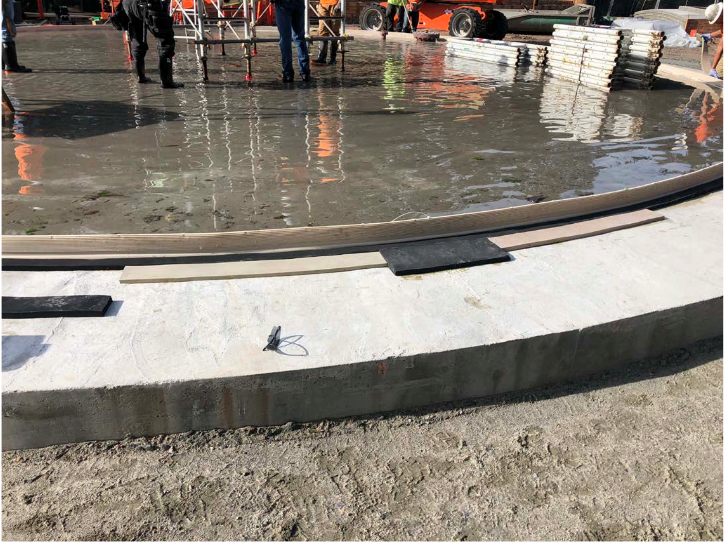
Picture 4: Overview of water tank base with foam pads glued around the perimeter of the PVC water stop. Water tank work zone, east of the Shared Access Driveway, Middletown. View to the east.