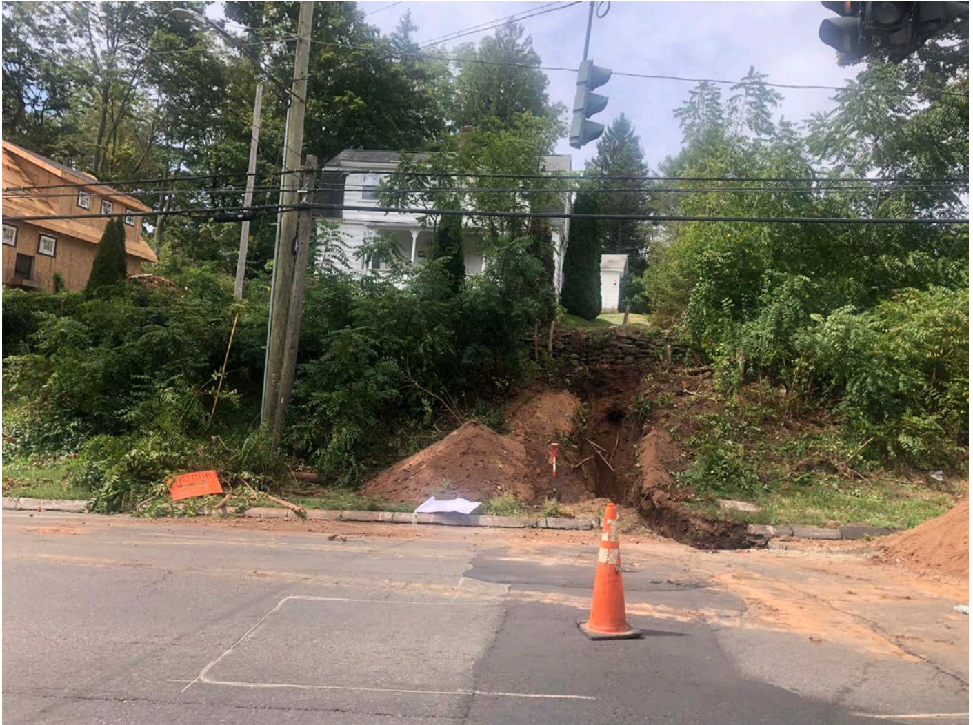
Picture 7: Trench Ludlow excavated for the installation of a curb stop to service 176 Main Street, Durham. View to west.