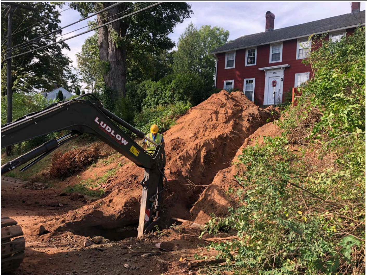
Picture 5: Ludlow beginning to excavate a trench for the installation of a curb stop to service 186 Main Street, Durham. View to the southwest.