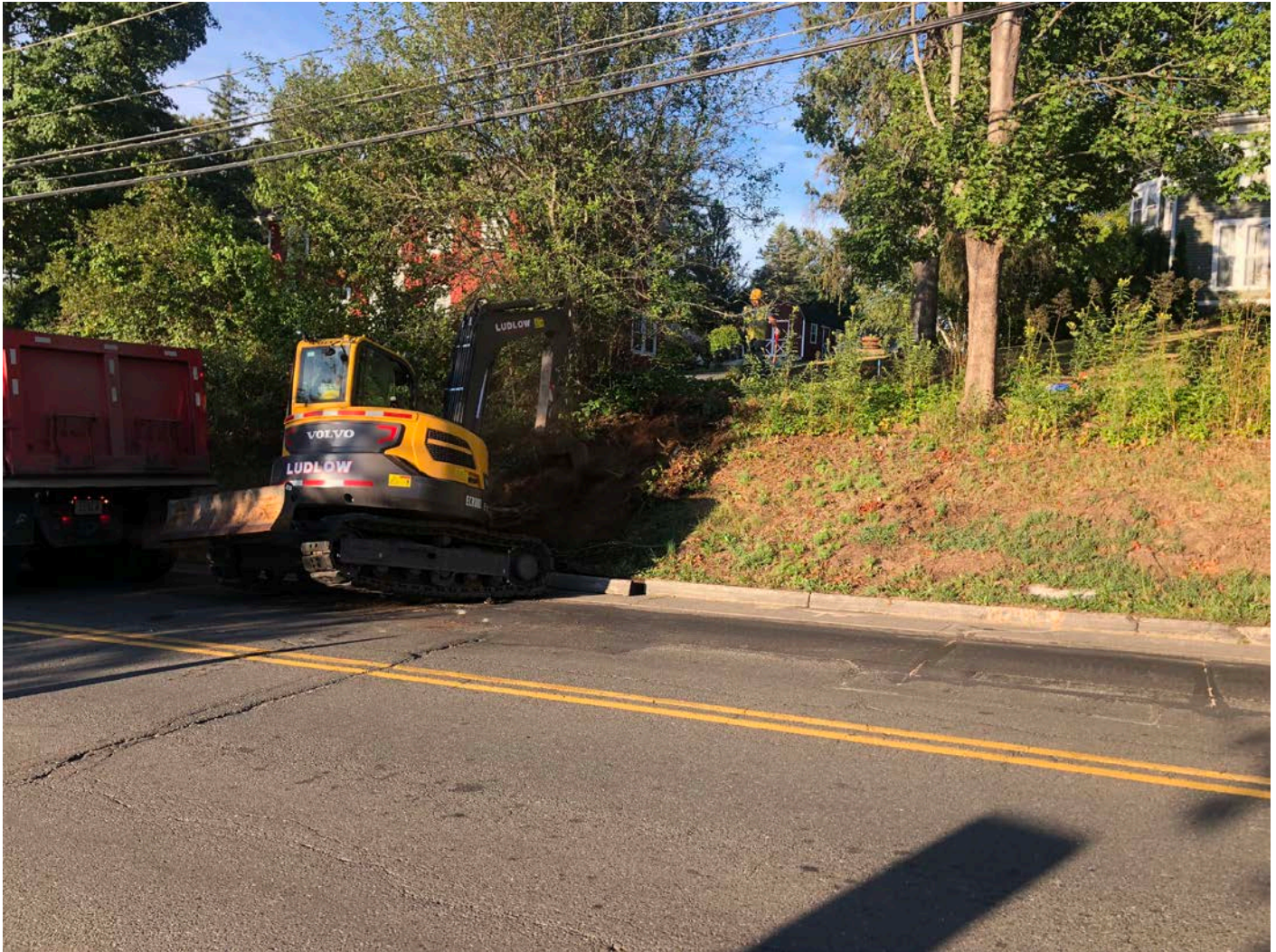
Picture 2: Ludlow beginning to excavate a trench for the installation of a curb stop to service 188 Main Street, Durham. View to the west.