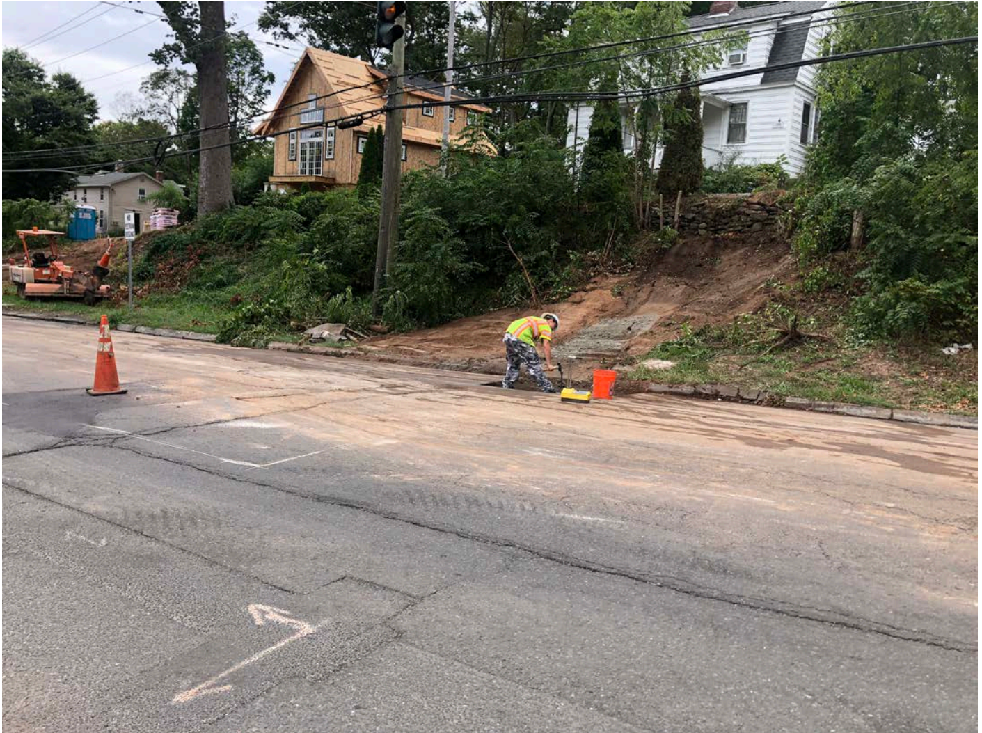
Picture 10: JTC collecting soil compaction data due west of 176 Main Street, Durham. View to the west.