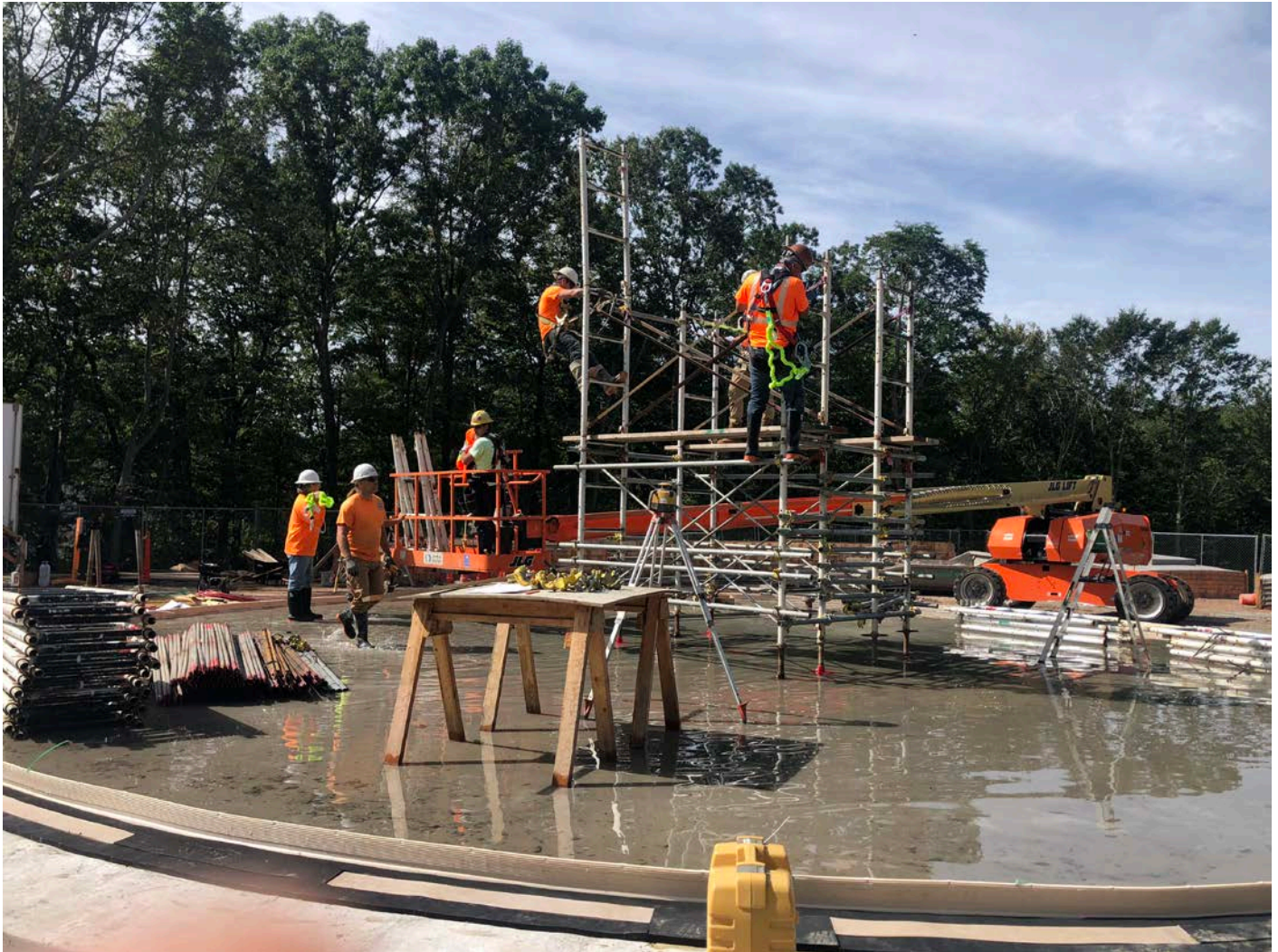
Picture 6: DN Tanks erecting the center tower on the center of the water tank base. Water tank work zone, east of the Shared Access Driveway, Middletown. View to the southwest.