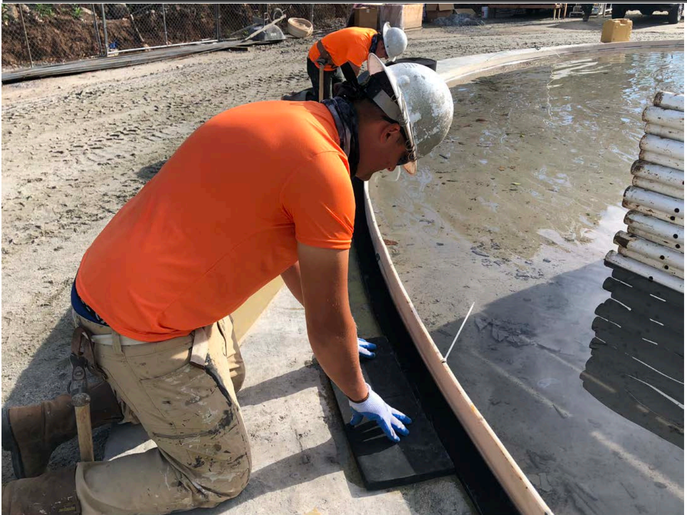
Picture 3: DN Tanks gluing foam sections along the outer perimeter of the PVC water stop on the water tank base. Water tank work zone, east of the Shared Access Driveway, Middletown. View to the northeast.