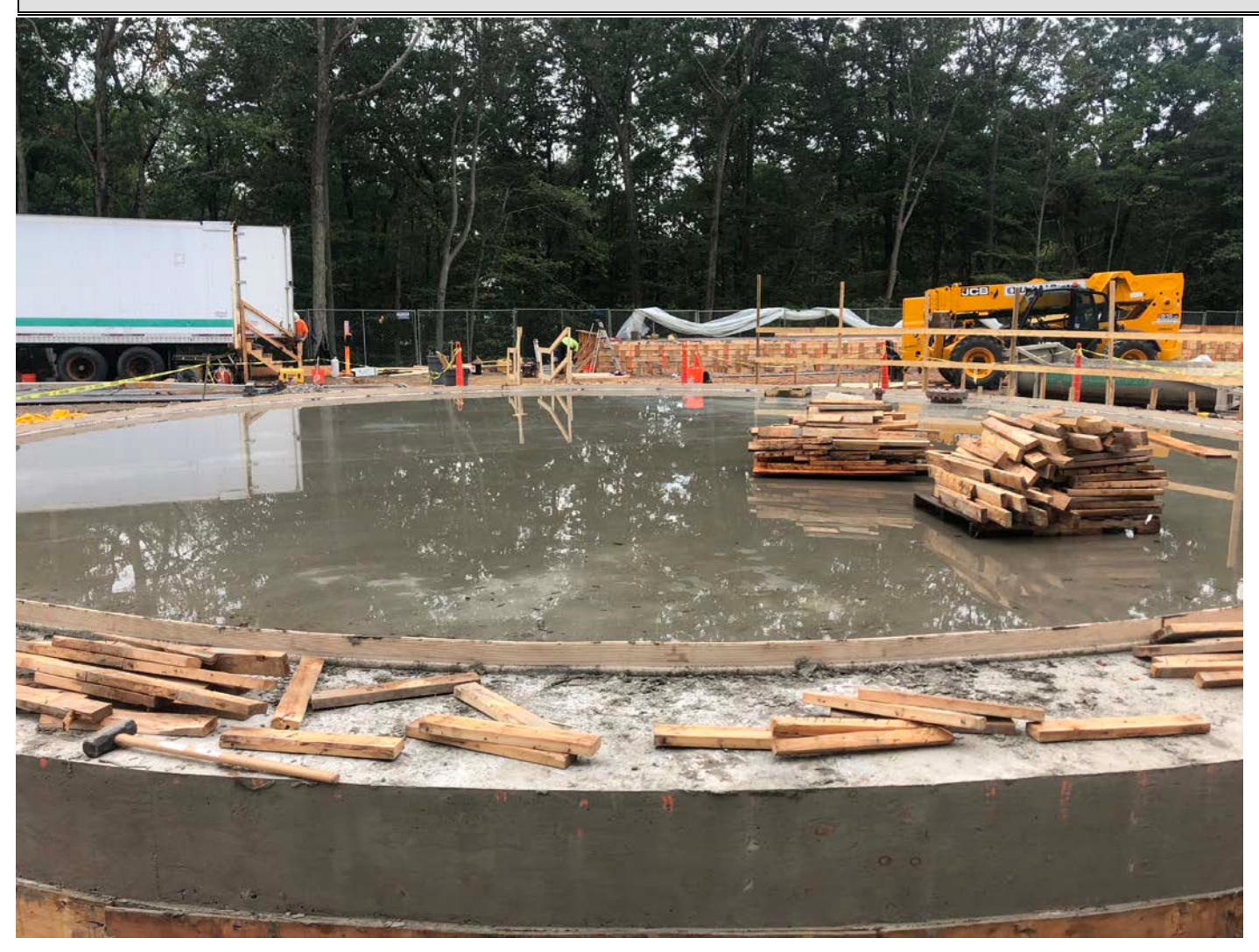
Picture 3: The top of the water tank base with a layer of water on top of it to slow the cure of the concrete. Water tank work zone, east of the Shared Access Driveway, Middletown. View to the south.

Report No: Project #: AECOM: 6061487 147 Contractor: Ludlow Construction Page: 6 of 13