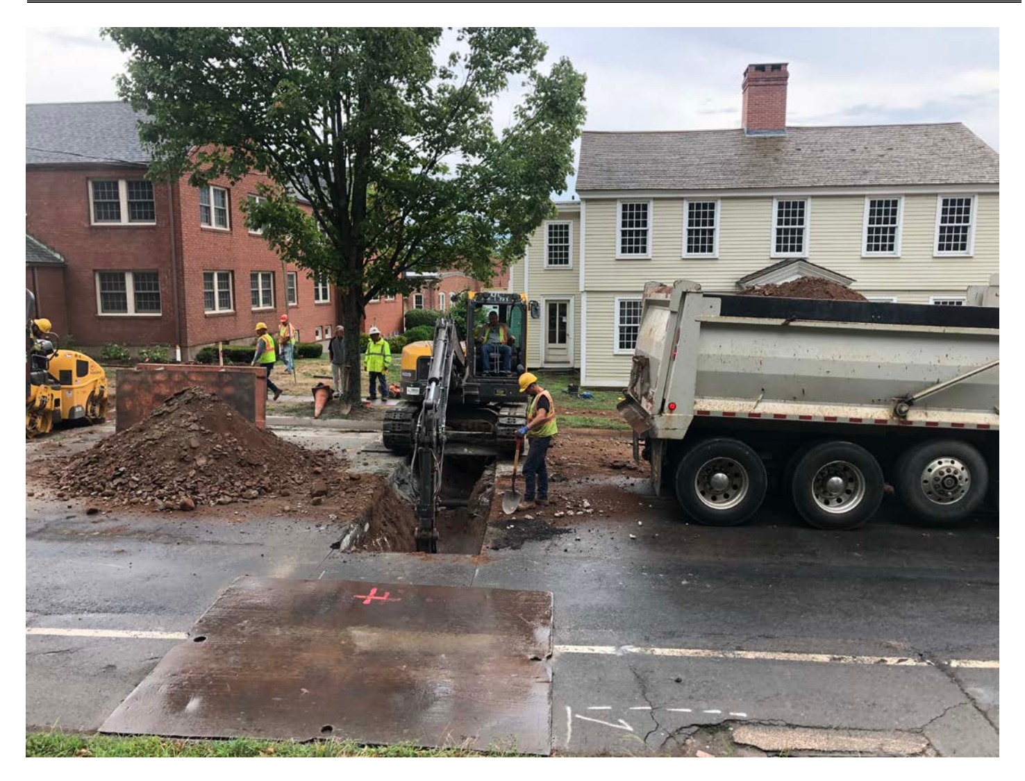
Picture 2: Ludlow installing a curb stop at Station 200+22 (199 Main Street, Durham). View to the east.