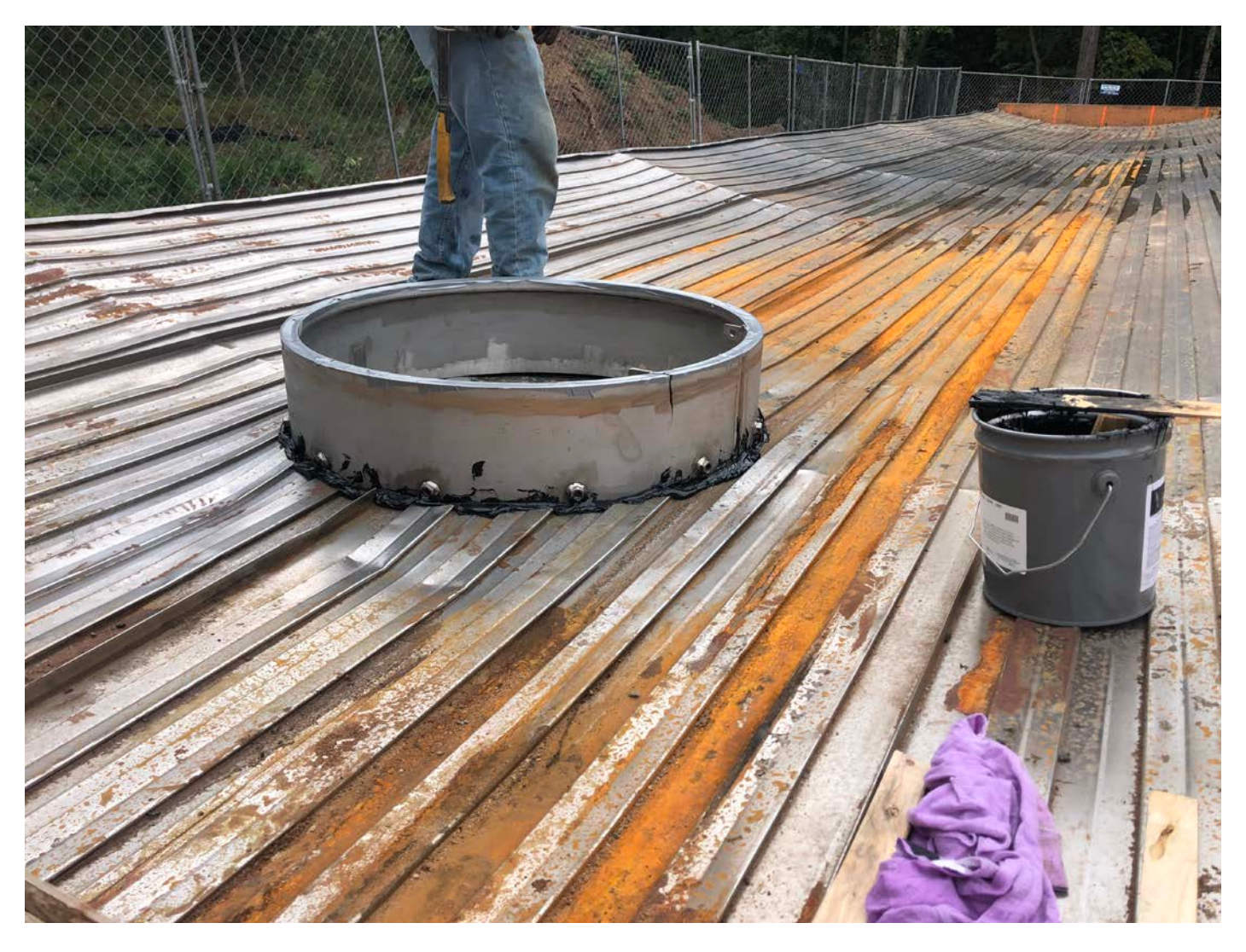
Picture 4: DN Tanks placing a manway on the wide side panel concrete form. Water tank work zone, east of the Shared Access Driveway, Middletown.