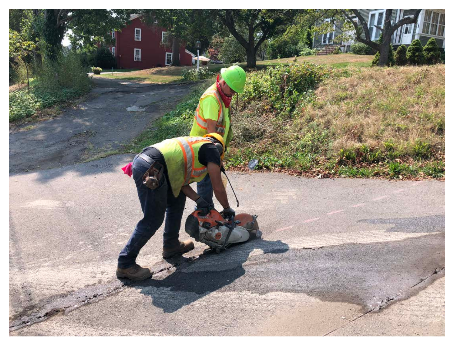
Picture 9: Ludlow saw cutting pavement at 196 Main Street, Durham (Station 201+36) for the installation of a curb stop. View to the southeast.