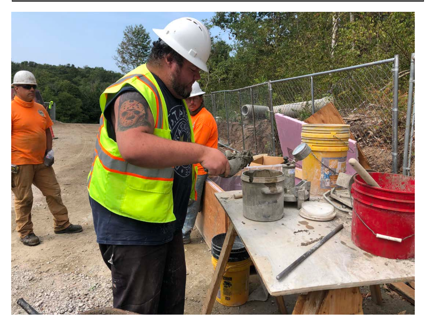
Picture 6: JTC collecting an air sample from the one truck of concrete brought to the water tank work zone today for placement on the water tank dome panels. Water tank work zone, east of the Shared Access Driveway, Middletown. View to the west.