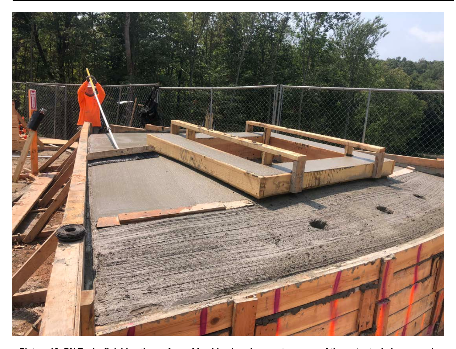
Picture 10: DN Tanks finishing the surface of freshly-placed concrete on one of the water tank dome panel forms. Water tank work zone, east of the Shared Access Driveway, Middletown. View to the south.