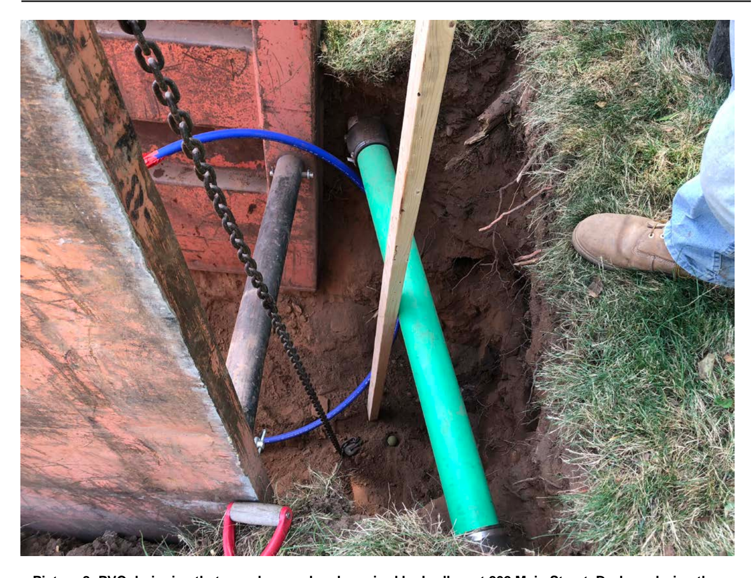
Picture 8: PVC drainpipe that was damaged and repaired by Ludlow at 202 Main Street, Durham during the installation of a curb stop.