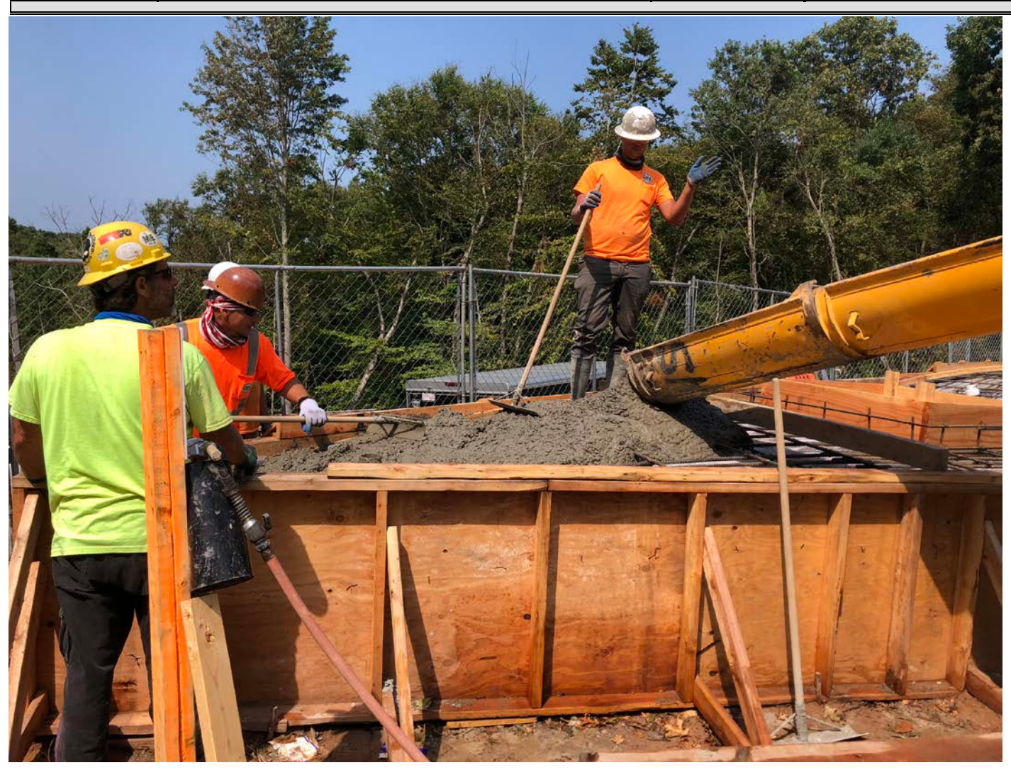
Picture 7: DN Tanks placing concrete on one of the water tank dome panel forms. Water tank work zone, east of the Shared Access Driveway, Middletown.