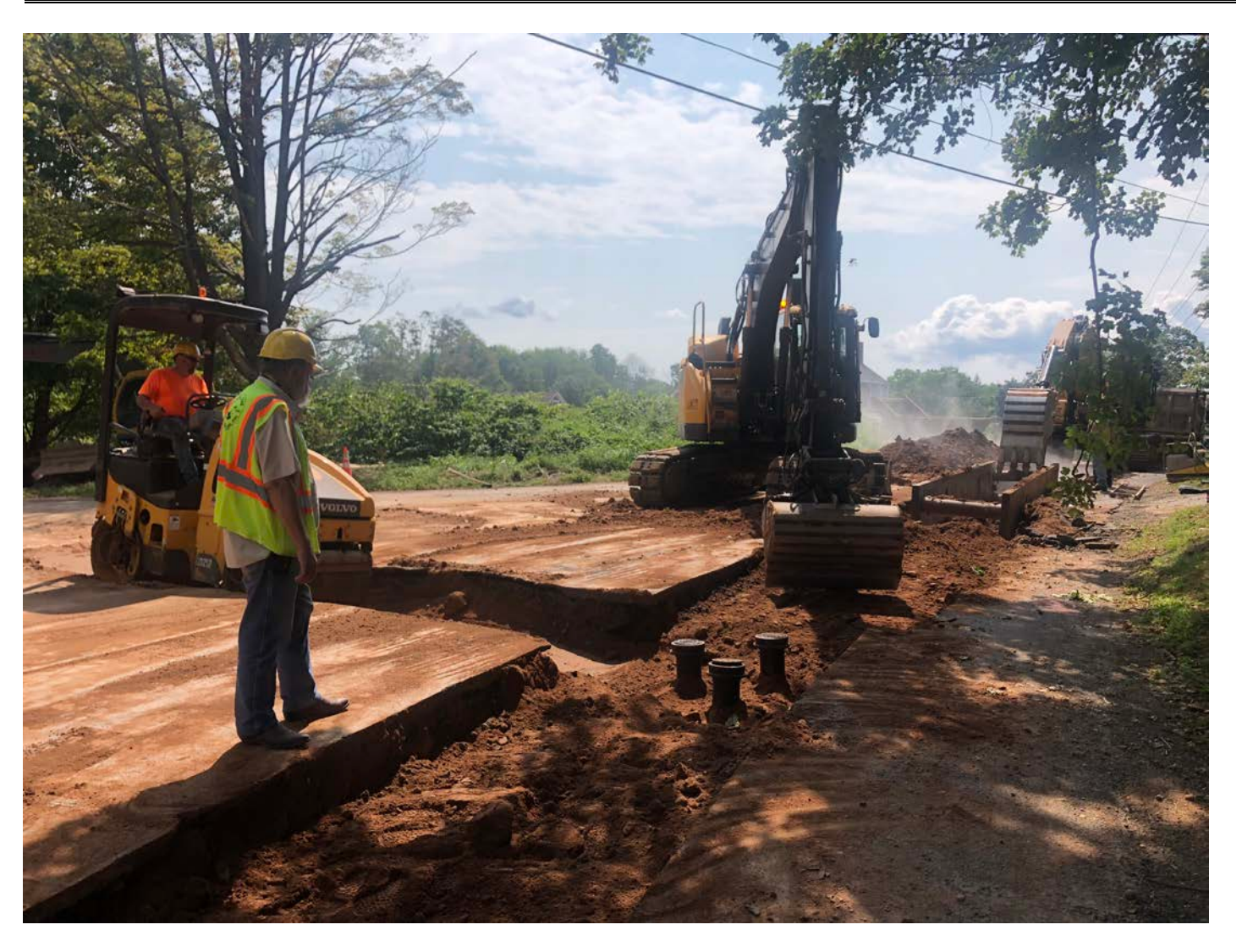
Picture 6: View of placement of 8" DIP on Maple Avenue, Durham at Station 940+52. View to the south.