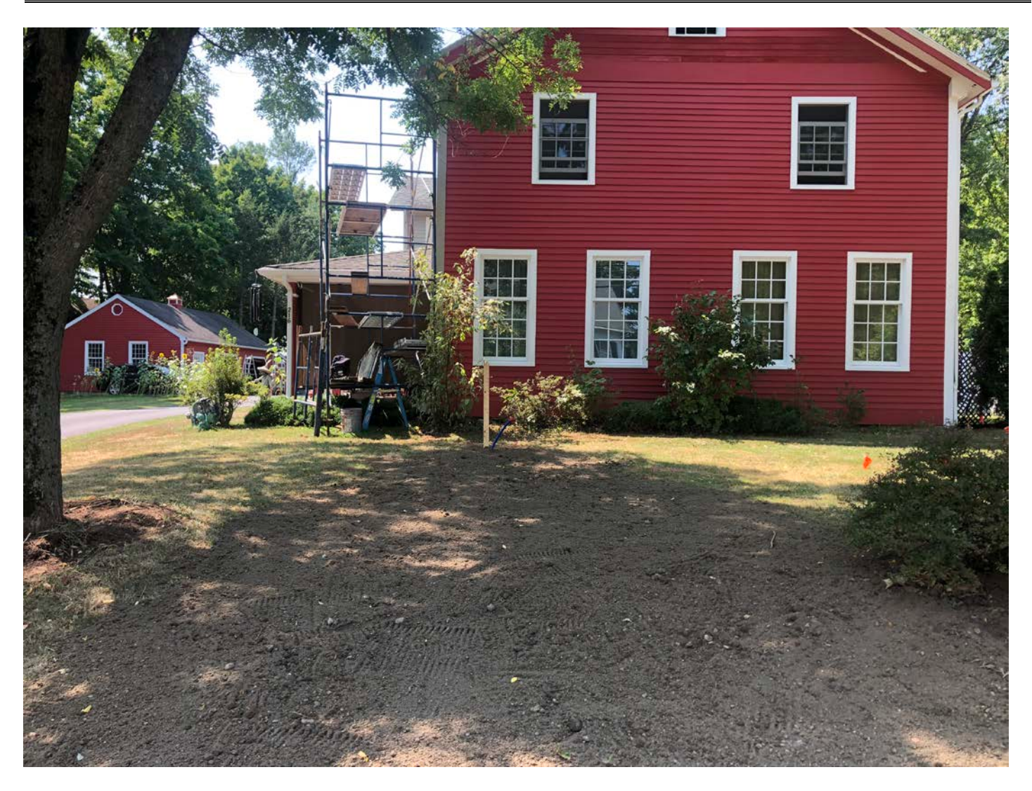
Picture 8: View of the completed installation of a curb stop at 216 Main Street, Durham. View to the west.