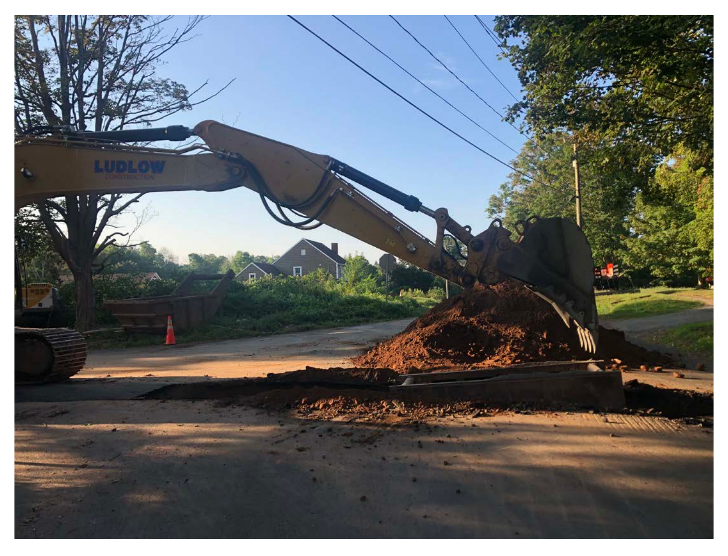
Picture 2: Ludlow excavating at the intersection of Talcott Lane and Maple Avenue, Durham for the installation of three 8" gate valves and gate boxes at Station 940+52. View to the south.