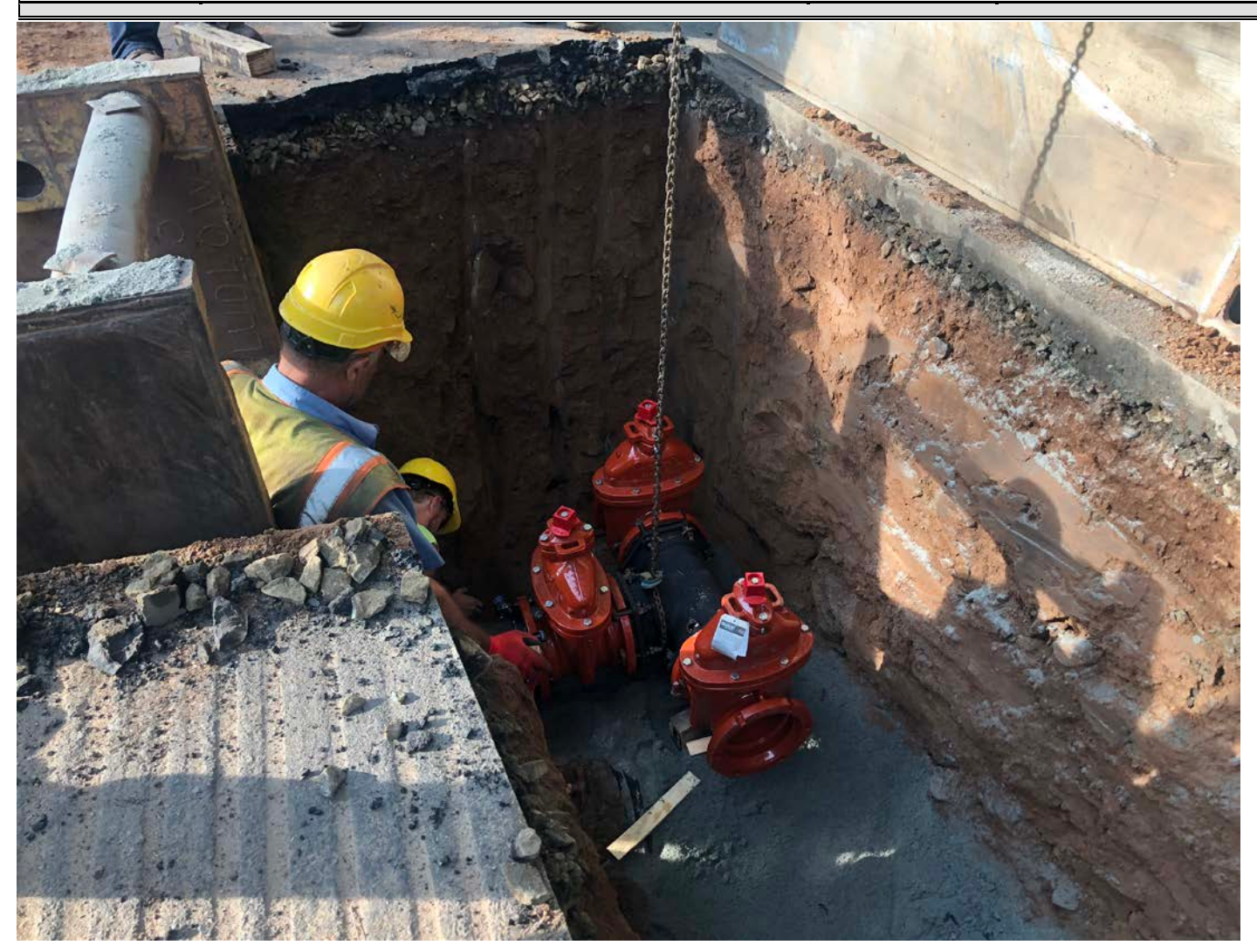
Picture 3: Ludlow installing three 8" gate valves and gate boxes at Station 940+52. View to the south.