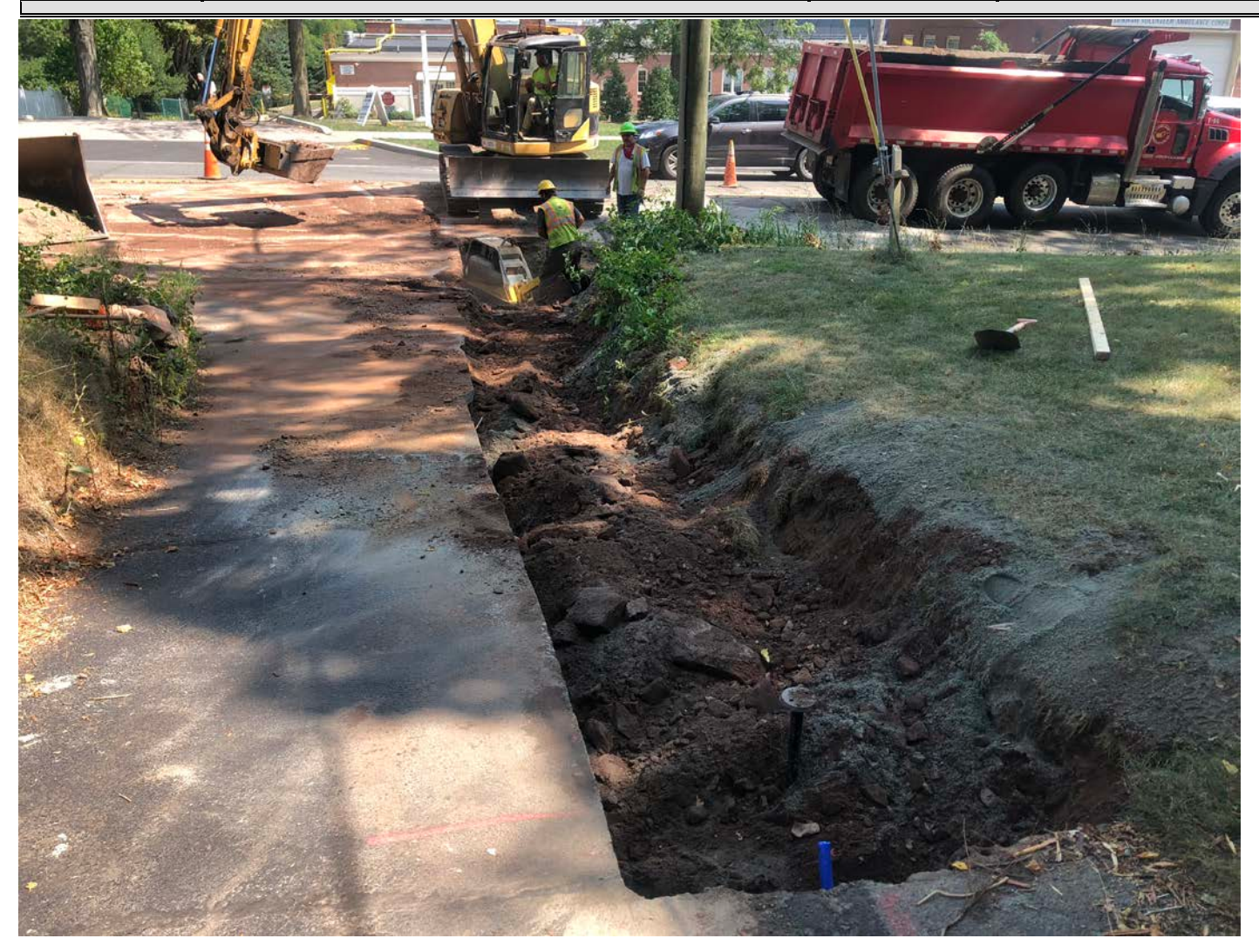
Picture 7: Ludlow installing curb stop at 208 Main Street, Durham. View to the east.

Project #:AECOM: 6061487Report No:145Contractor:Ludlow ConstructionPage:10 of 11