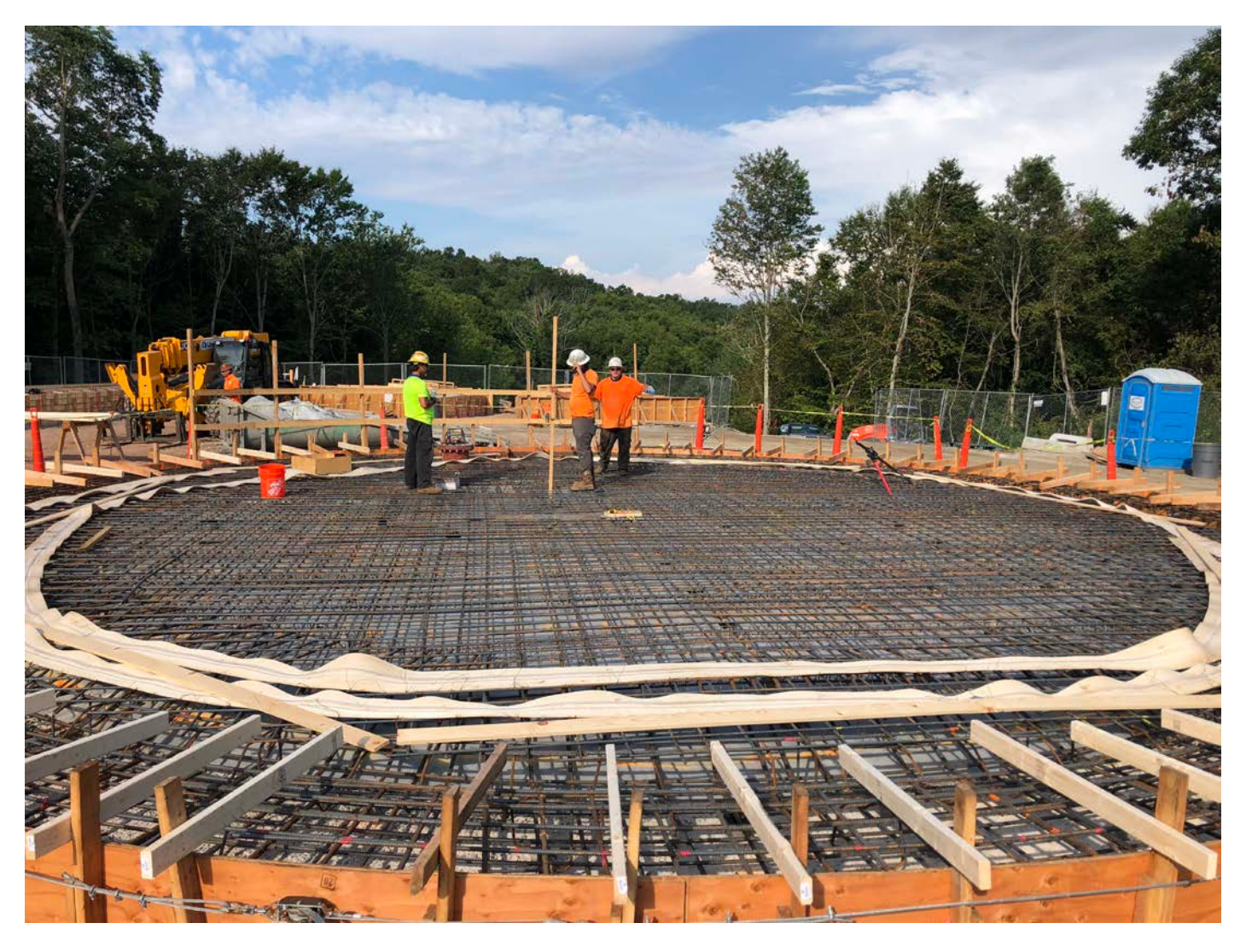
Picture 4: Ludlow preparing the water tank footprint for the pouring of concrete for the water tank base tomorrow morning. East of the Shared Access Driveway, Middletown. View to the west.