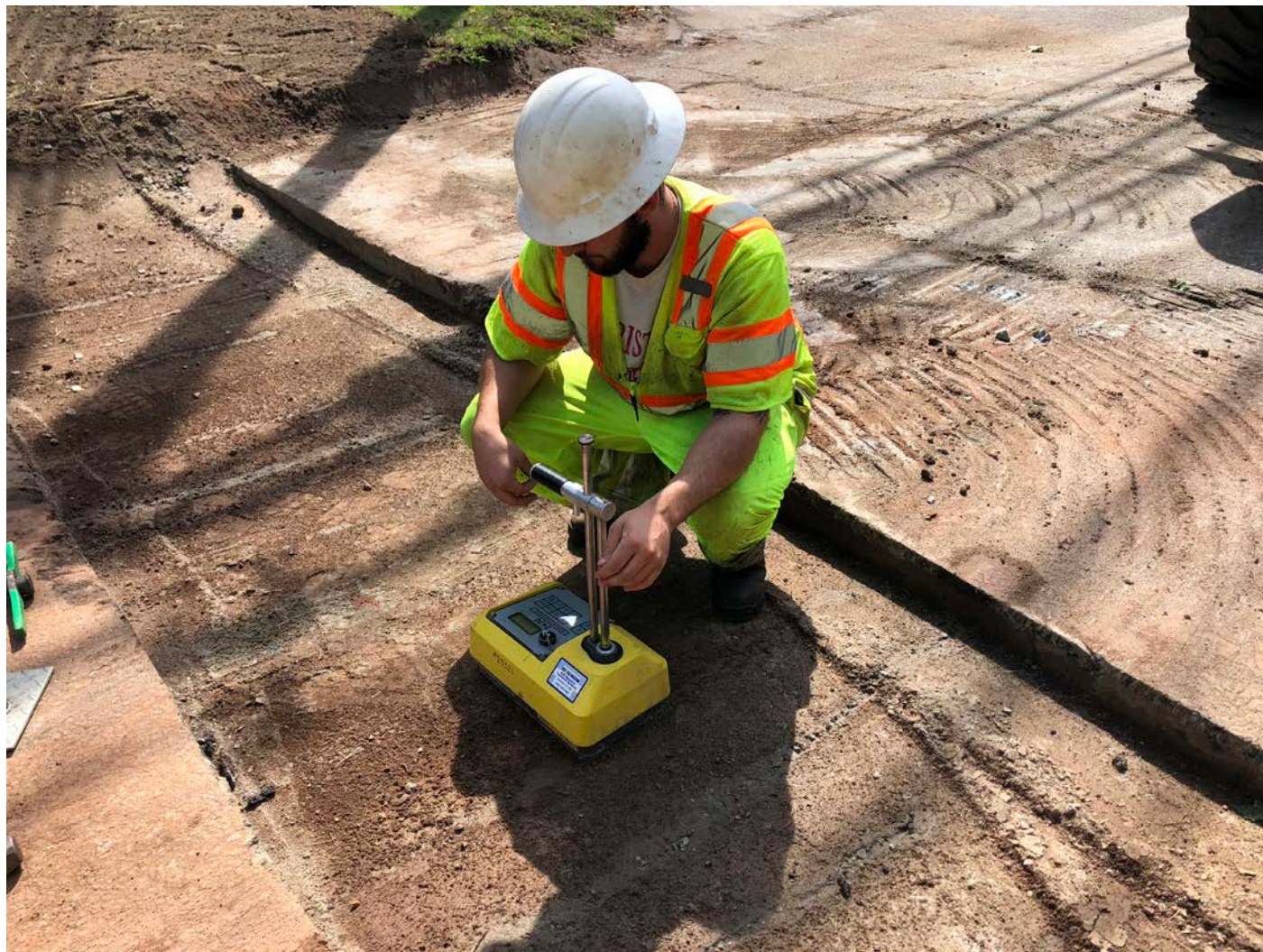
Picture 6: JTC performing soil compaction test at Station 192+37 (239 Main Street, Durham).