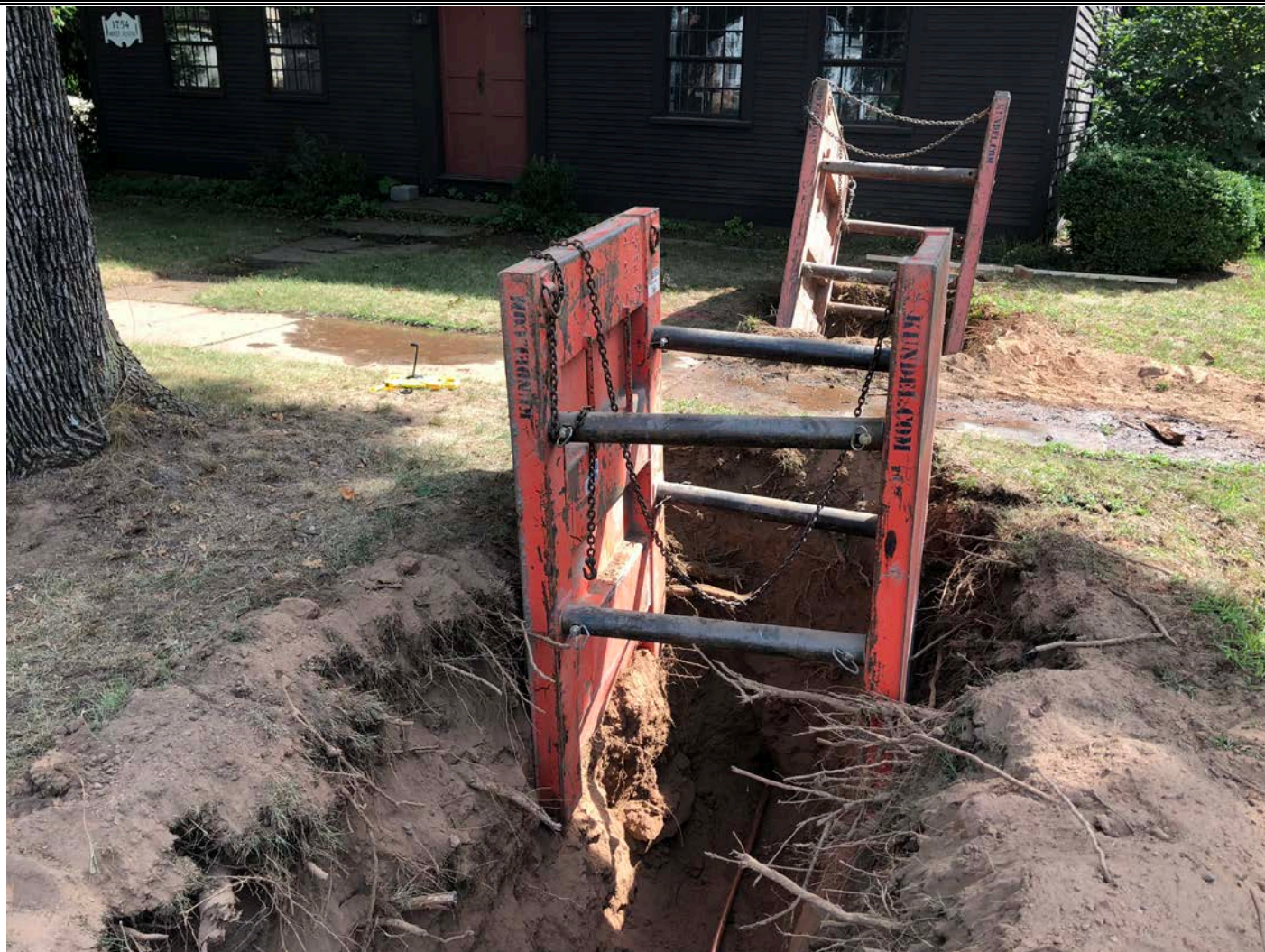
Picture 7: Trench with trench boxes in place during the installation of a curb stop at Station 192+37 (239 Main Street, Durham). View to the east.