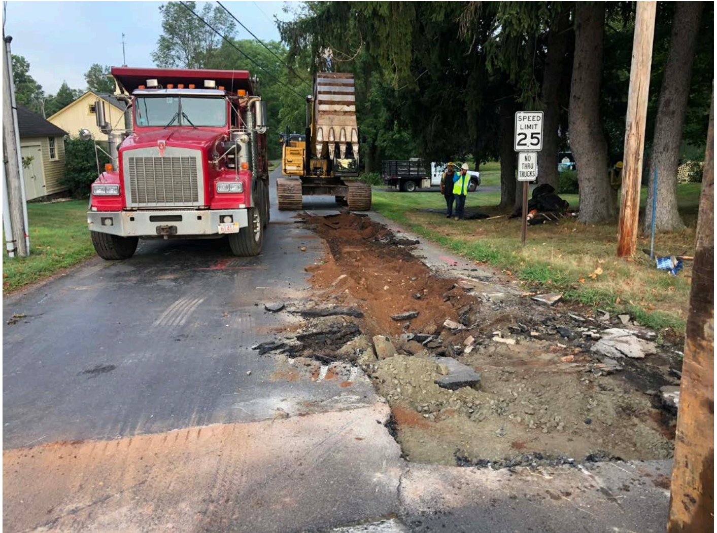
Picture 1: Ludlow installing 8" DIP on Talcott Lane, Durham, starting at Station 300+34. View to the west.