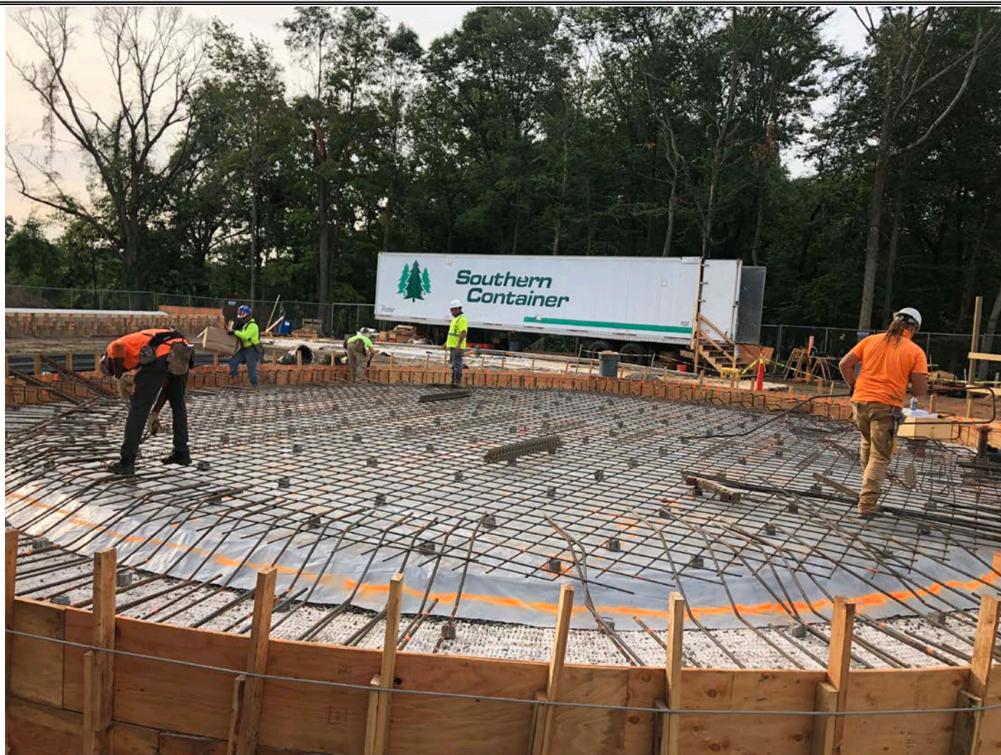
Picture 3: Northeastern Steel placing rebar on the water tank base. Water tank work zone, east of the Shared Access Driveway, Middletown. View to the southwest.