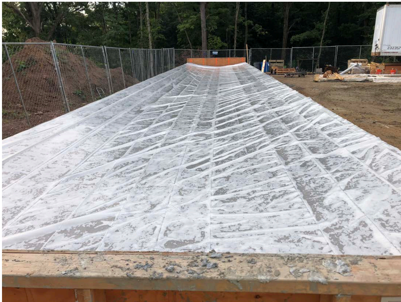
Picture 4: Concrete form at the water tank work zone with poly sheeting placed over concrete after being pouring yesterday. Water tank work zone, east of the Shared Access Driveway, Middletown. View to the west.