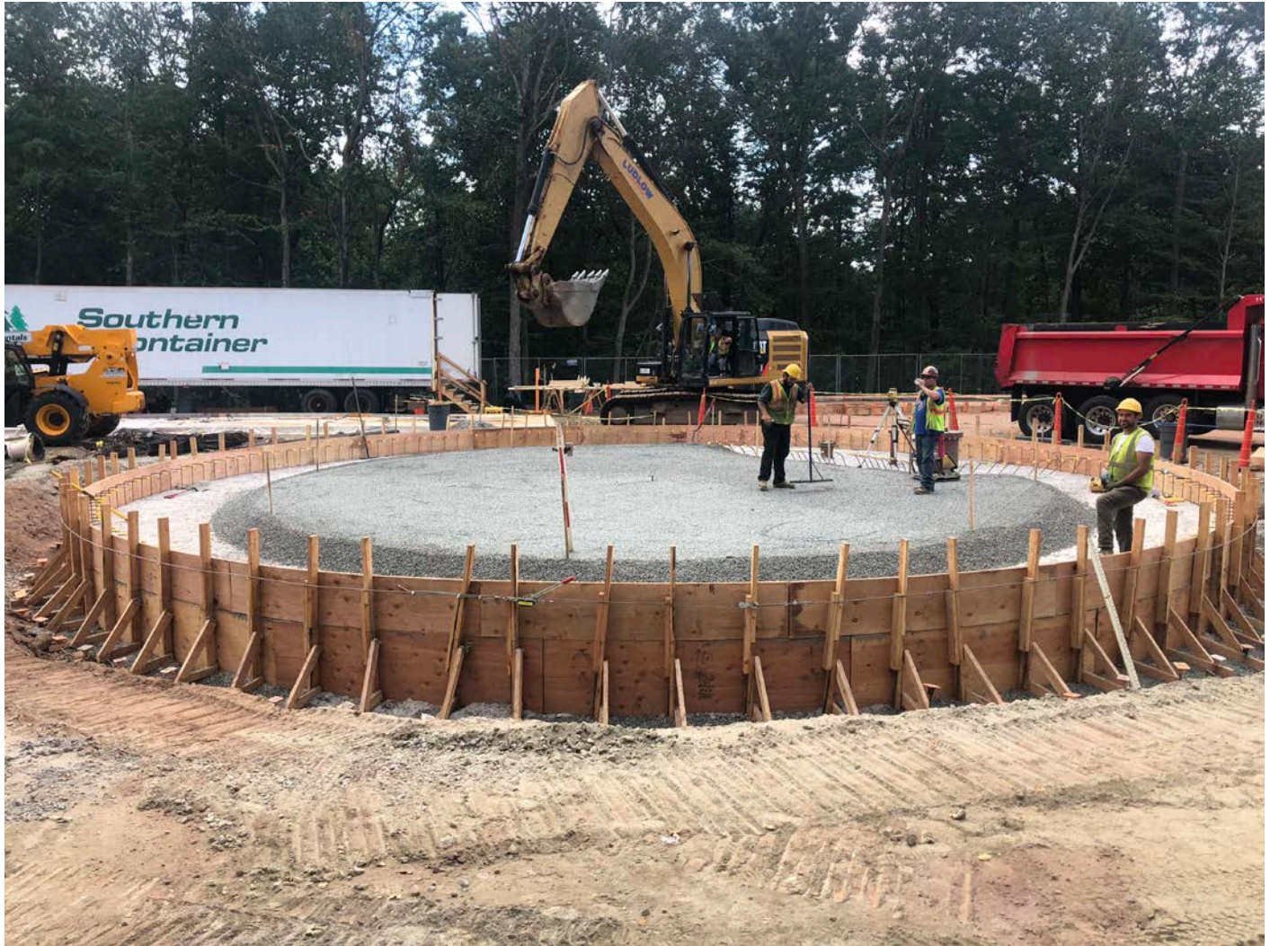
Picture 6: Ludlow finishing the placement and compaction of 1/2" gravel on the water tank footprint. East of Shared Access Driveway, Middletown. View to the south.