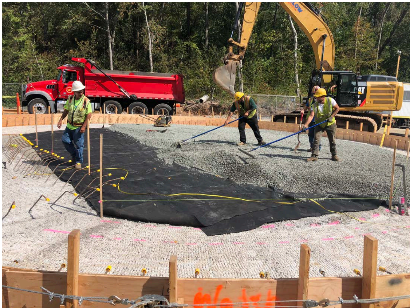
Picture 5: Ludlow placing and compacting ½" gravel on the water tank footprint. East of Shared Access Driveway, Middletown. View to the north.