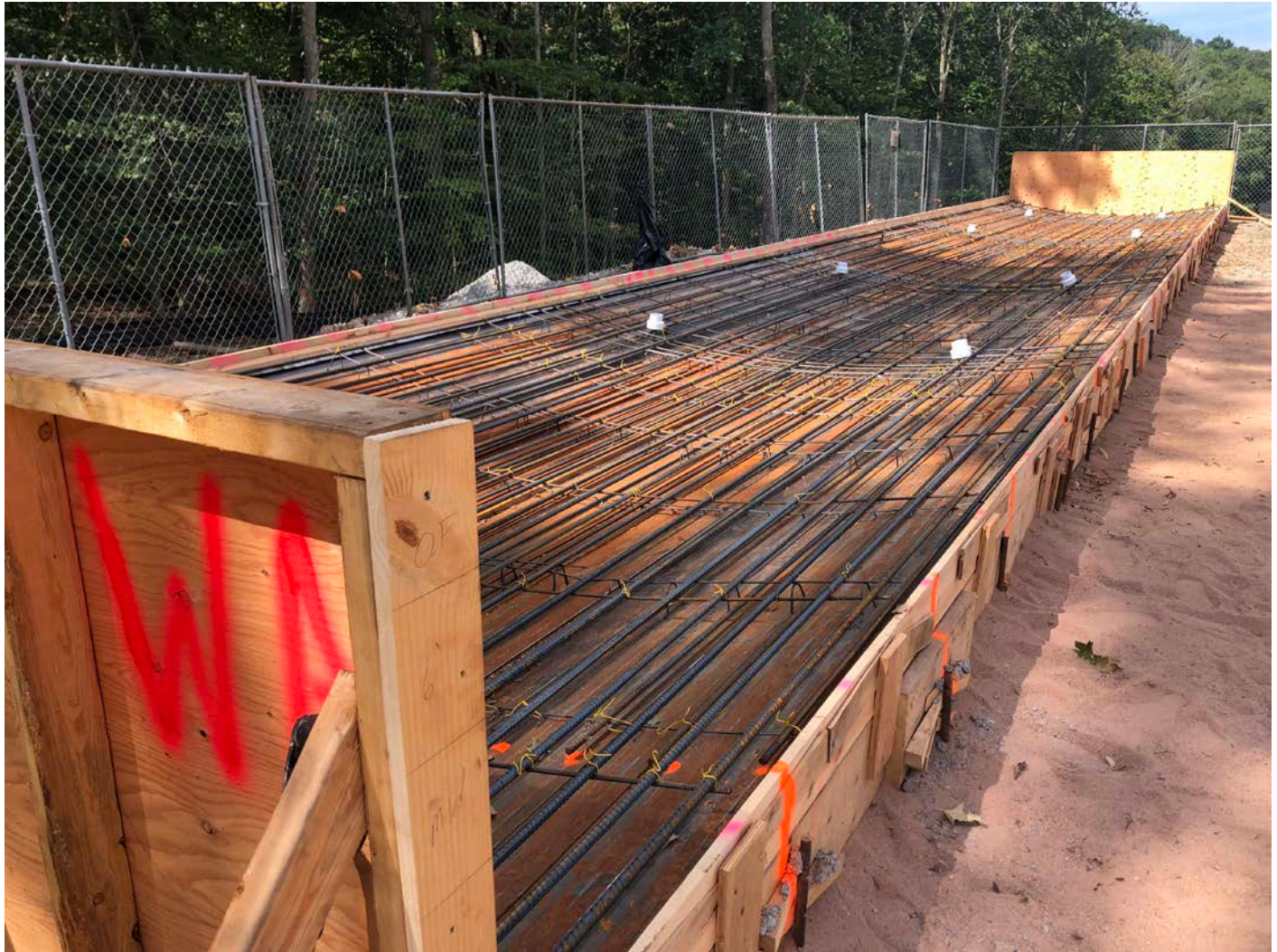
Picture 3: The first of two water tank side panel concrete forms where Northeastern Steel has finished fastening rebar to wire chairs in preparation of concrete being placed onto the form. Water tank work zone, east of the Shared Access Driveway, Middletown. View to the west.