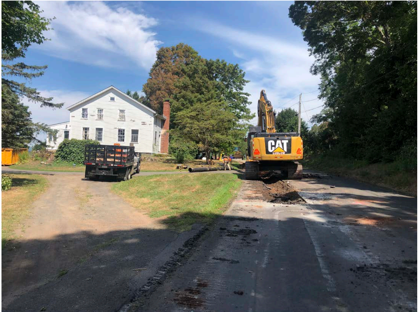
Picture 8: Ludlow trenching on the southbound lane of Maple Avenue, Durham (Station ~910+00) as they place 12" DIP while progressing in a southerly direction. View to the north.