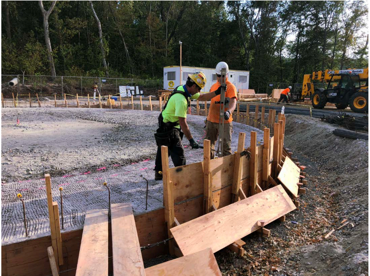
Picture 4: DN Tanks adding plywood to the form surrounding the water tank footprint. East of the Shared Access Driveway, Middletown. View to the northeast.