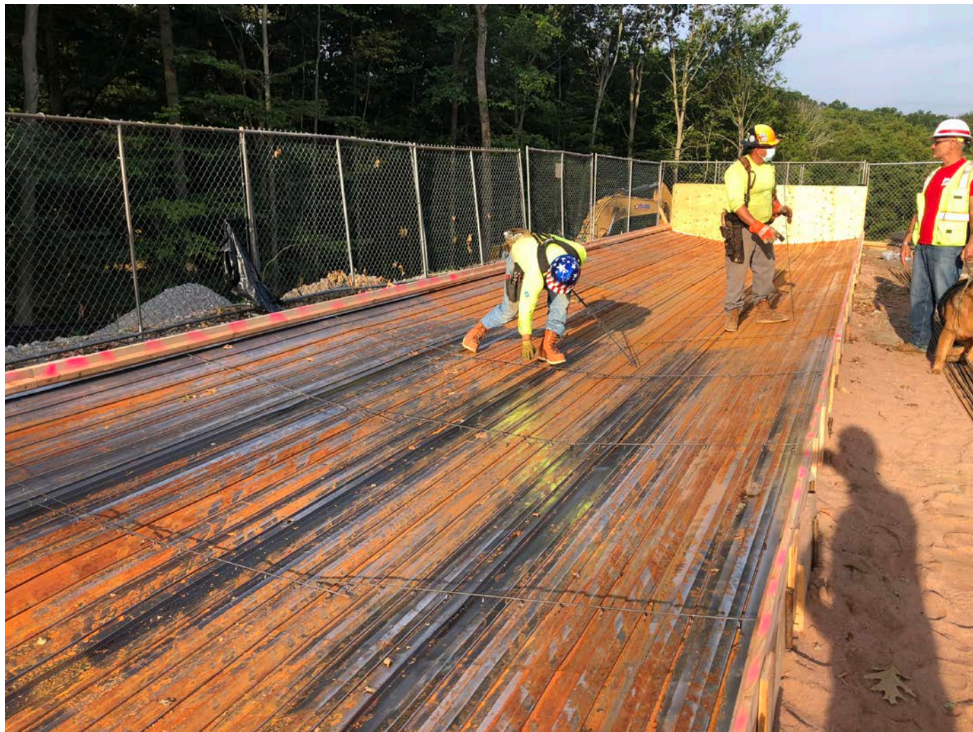
Picture 1: Northeastern Steel begins to lay out chairs on one of the water tank side panel concrete forms that rebar will be fastened onto. Water tank work zone, east of the Shared Access Road, Middletown. View to the west.