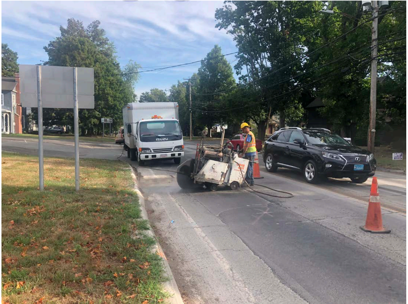
Picture 7: Ludlow saw cutting pavement on the southbound lane of Main Street, Durham, in front of 228 Main Street. View to the north.