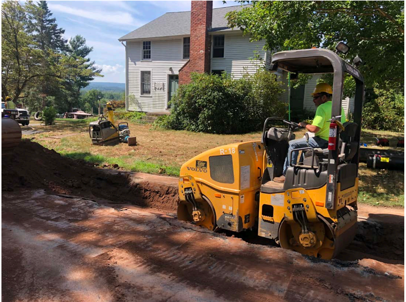
Picture 9: Ludlow compacting fill in trench at Station ~910+50 on the southbound lane of Maple Avenue, Durham. View to the southwest.