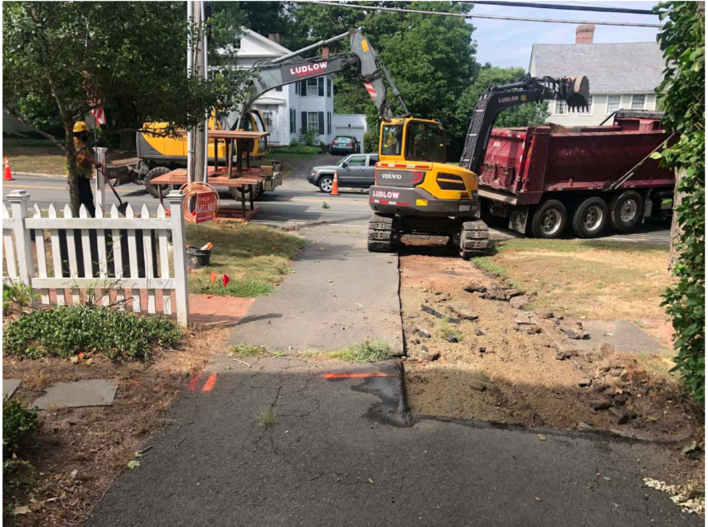
Picture 7: Ludlow beginning to install a curb stop at 253 Main Street at Station 189+22. View to the west.