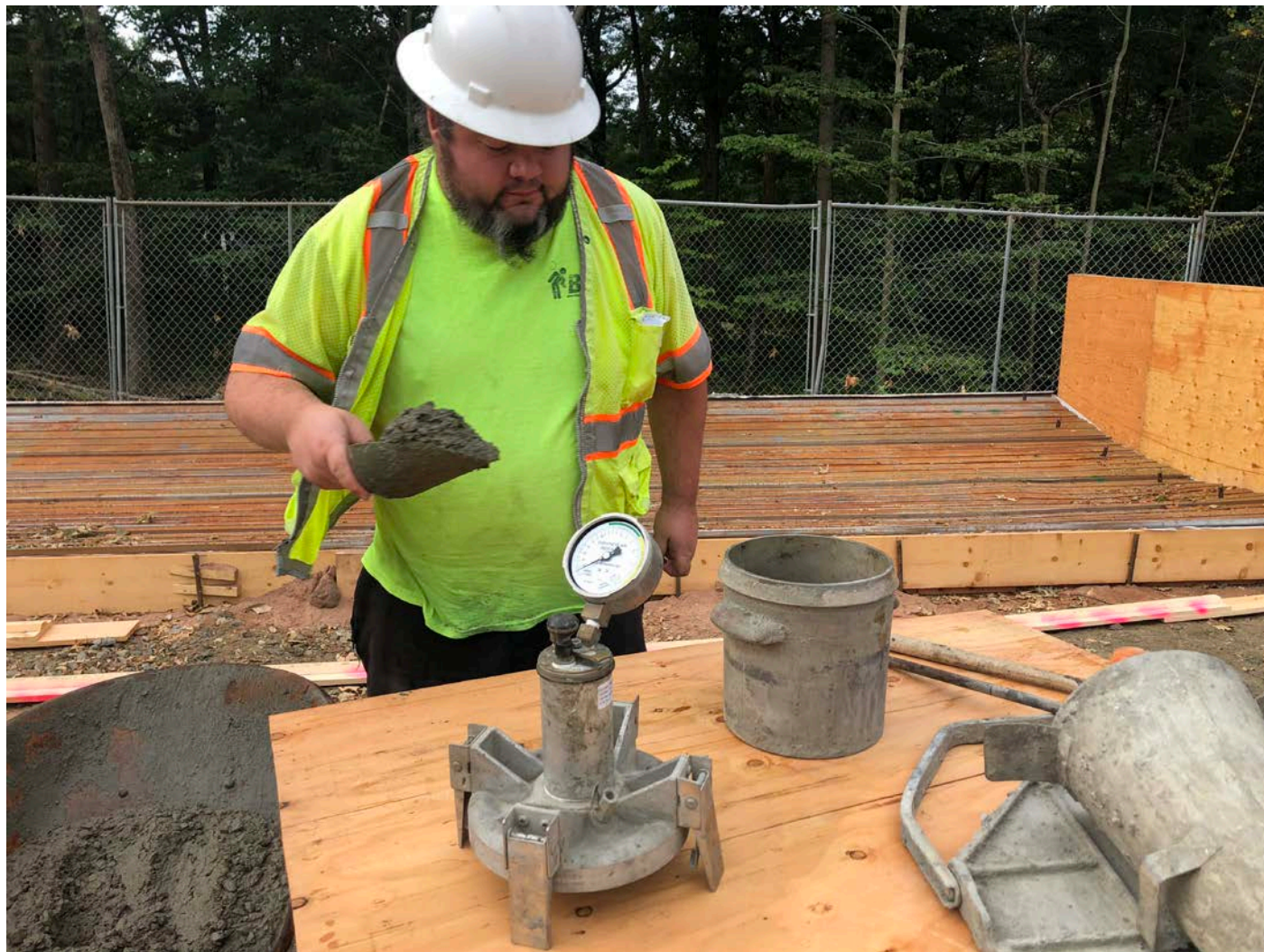
Picture 2: JTC preparing a concrete sample that was collected from the first of six truckloads of lean concrete delivered to the water tank footprint work zone, east of Shared Access Driveway, Middletown.