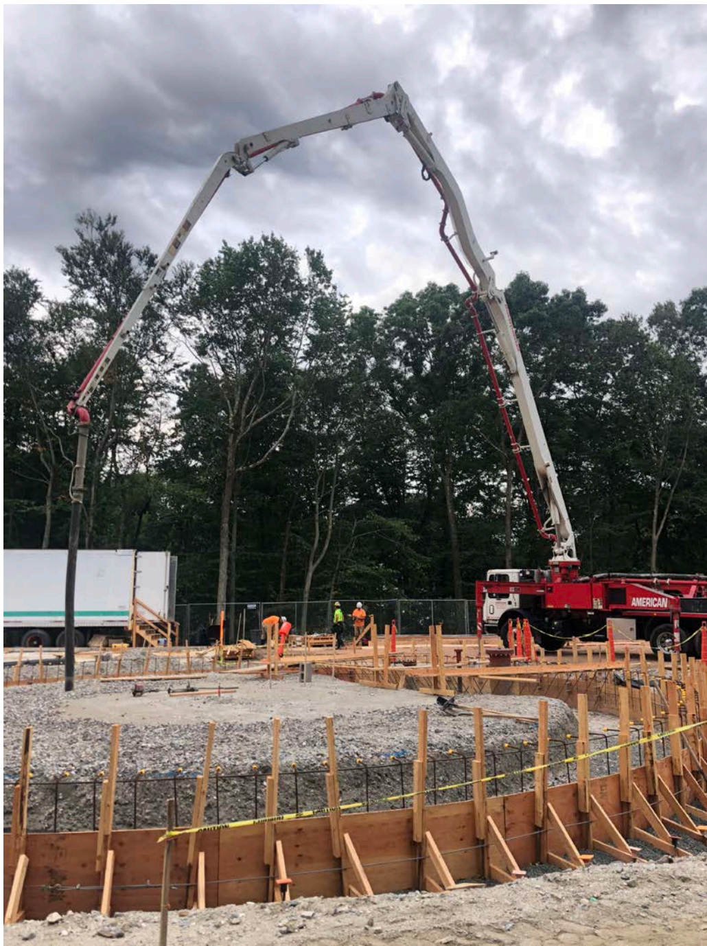
Picture 1: American Concrete Pumping Inc. concrete pumping truck staged at the water tank footprint east of Shared Access Driveway, Middletown. View to the south.