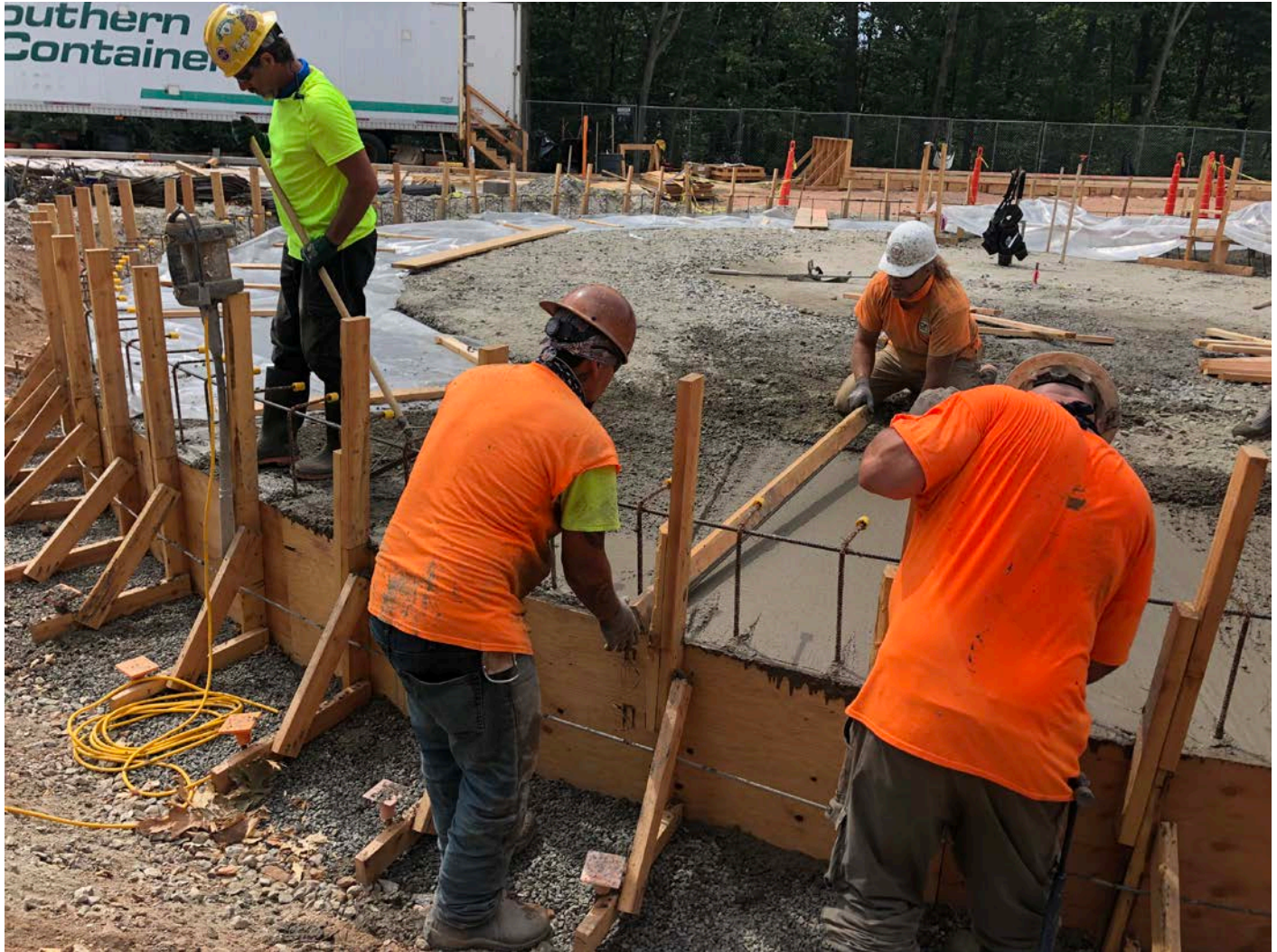
Picture 5: DN Tanks leveling the lean concrete that was just placed at the water tank footprint. East of Shared Access Driveway, Middletown. View to the south.