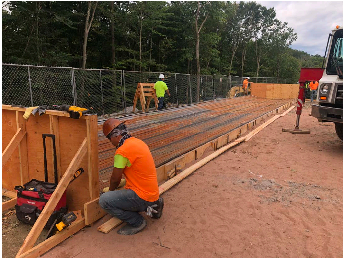
Picture 6: DN Tanks working on one of the concrete side panel forms. East of Shared Access Driveway, Middletown. View to the west.