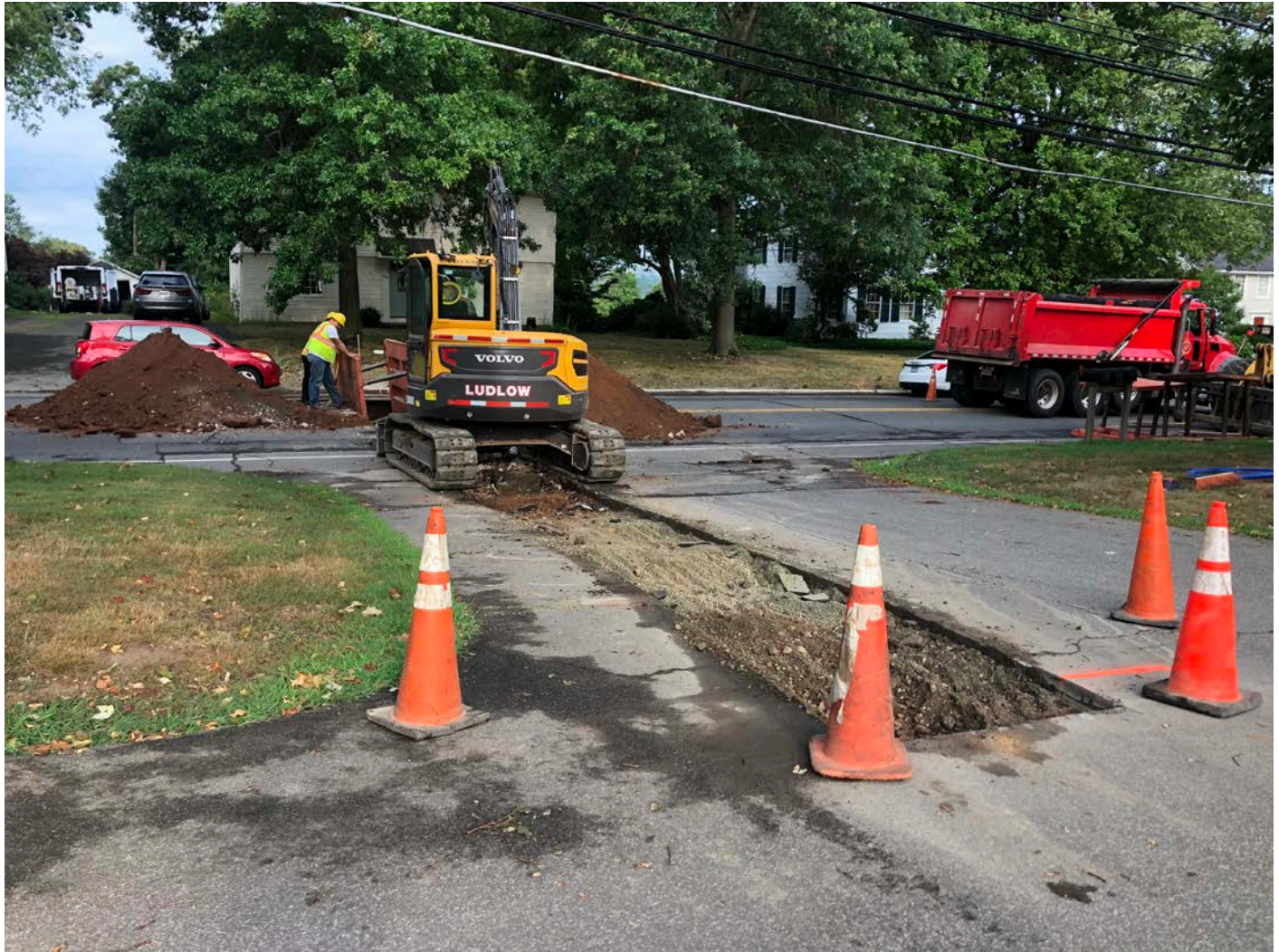
Picture 8: Ludlow beginning to install a curb stop at 243 Main Street at Station 190+52. View to the west.