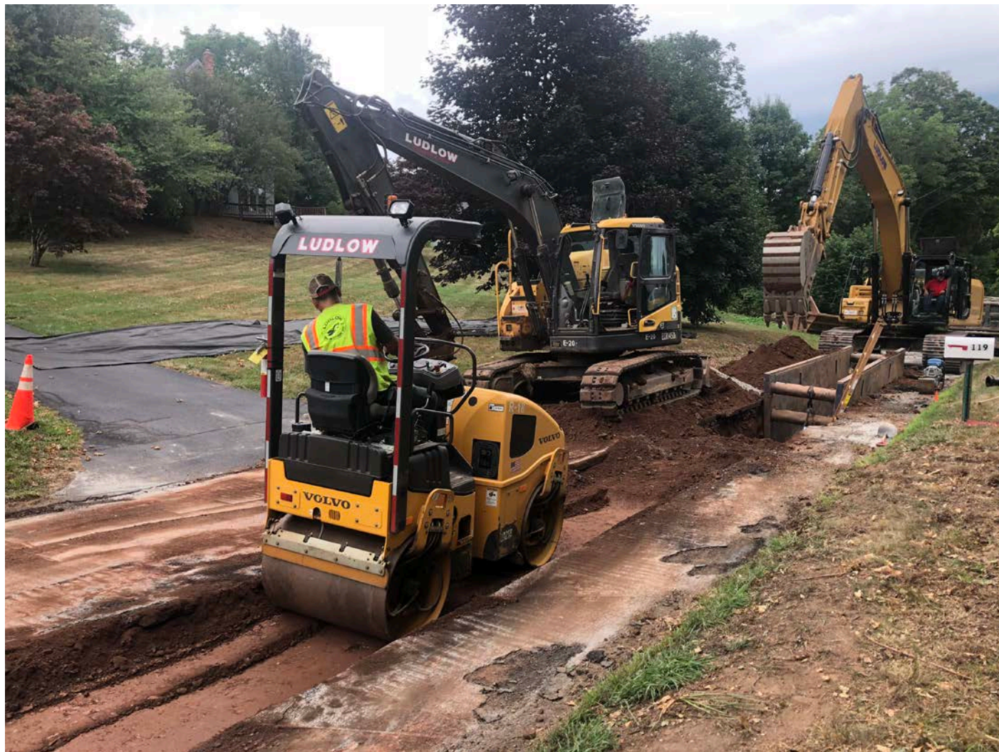
Picture 9: Ludlow compacting fill as they prepare to close up trench on Maple Avenue, Durham after installing 12" DIP. View to the south.