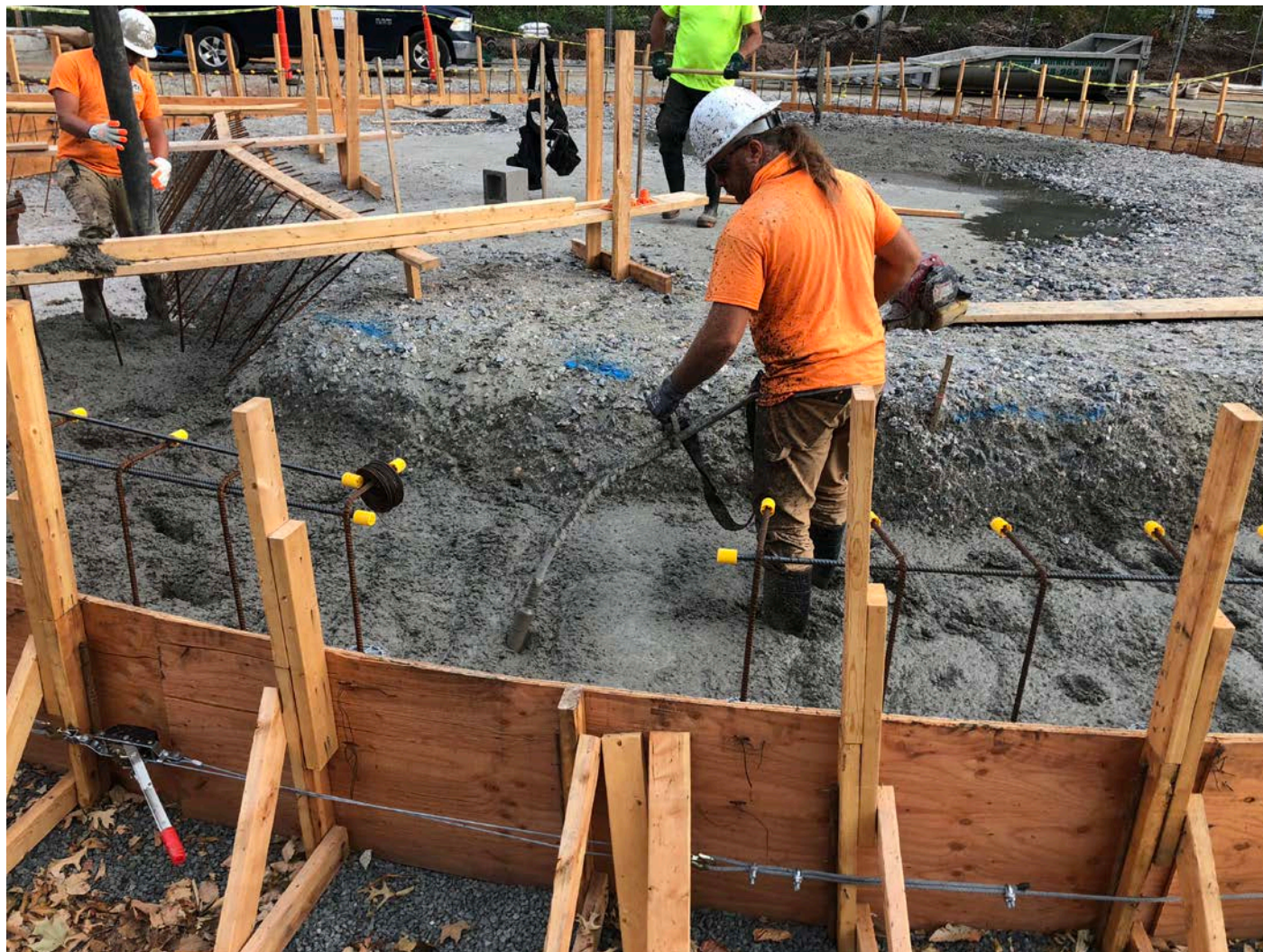
Picture 4: DN Tanks using a hand-held vibrator to consolidate the freshly placed lean concrete. East of Shared Access Driveway, Middletown. View to the north.