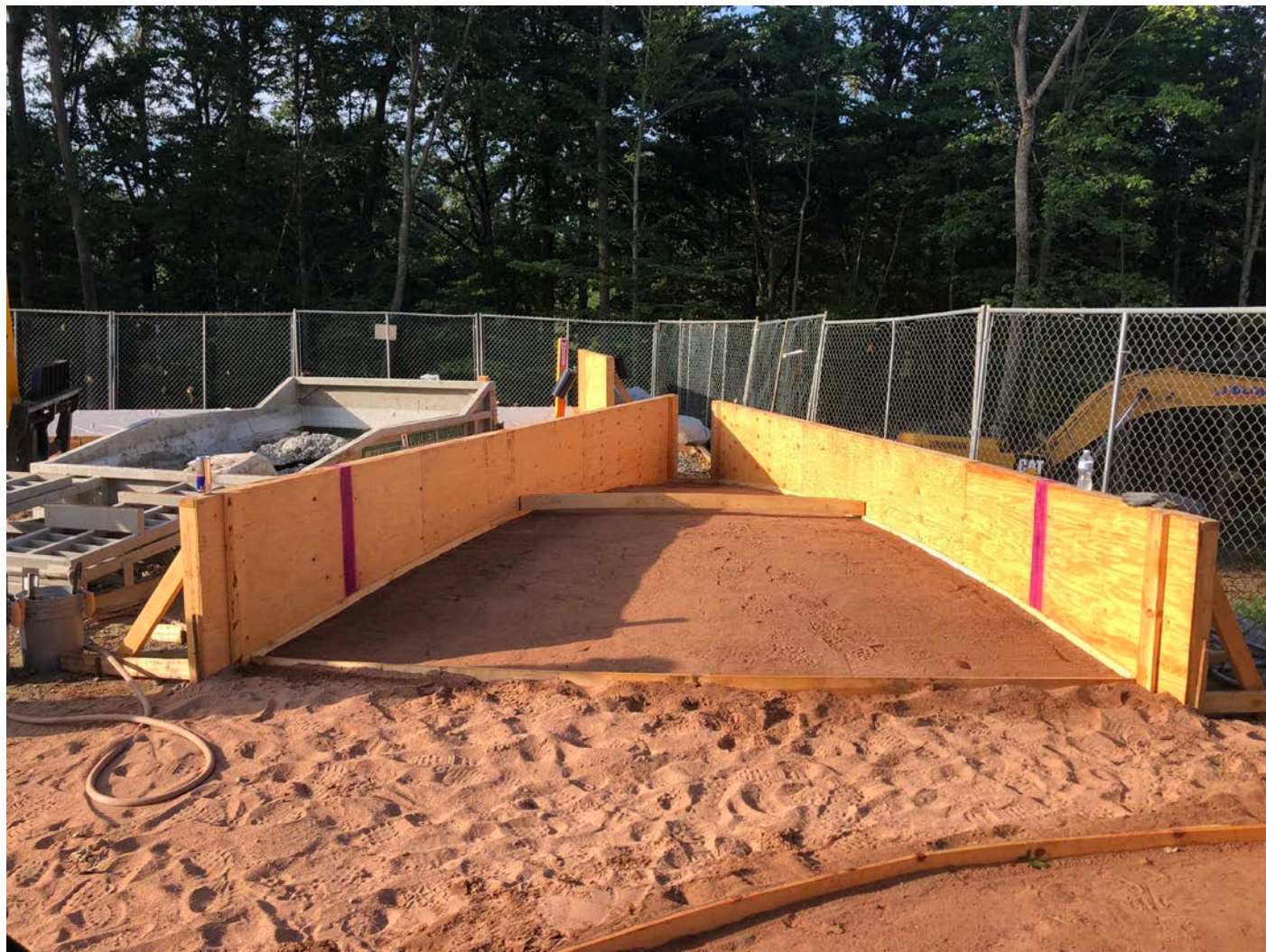
Picture 1: Concrete form for one of the water tank's top panels ready to receive a layer of grout. Water tank work zone, east of Shared Access Driveway, Middletown. View to the south.