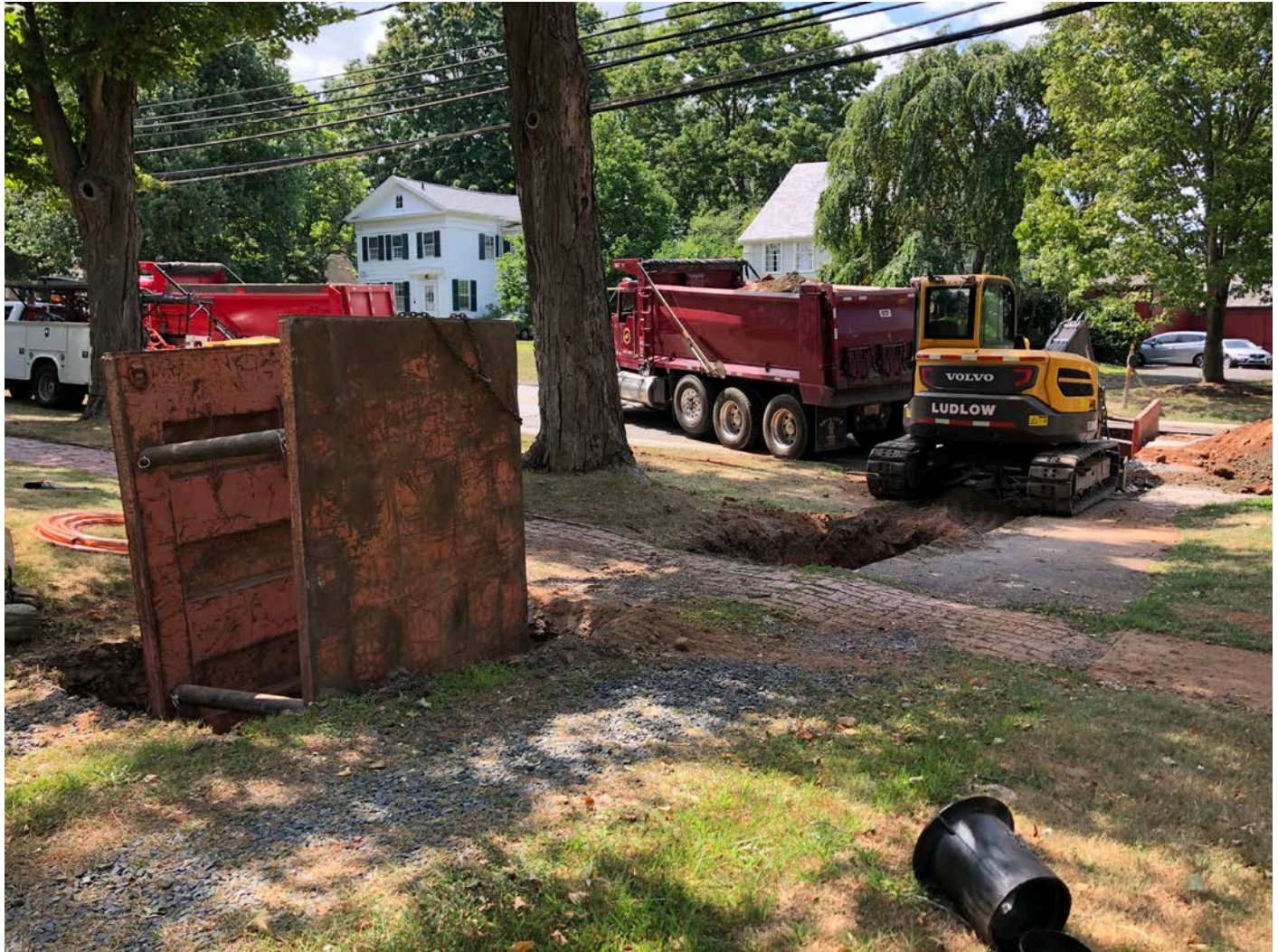
Picture 6: Curb stop installation for 257 Main Street in Durham (Station 188+22). View to the west.