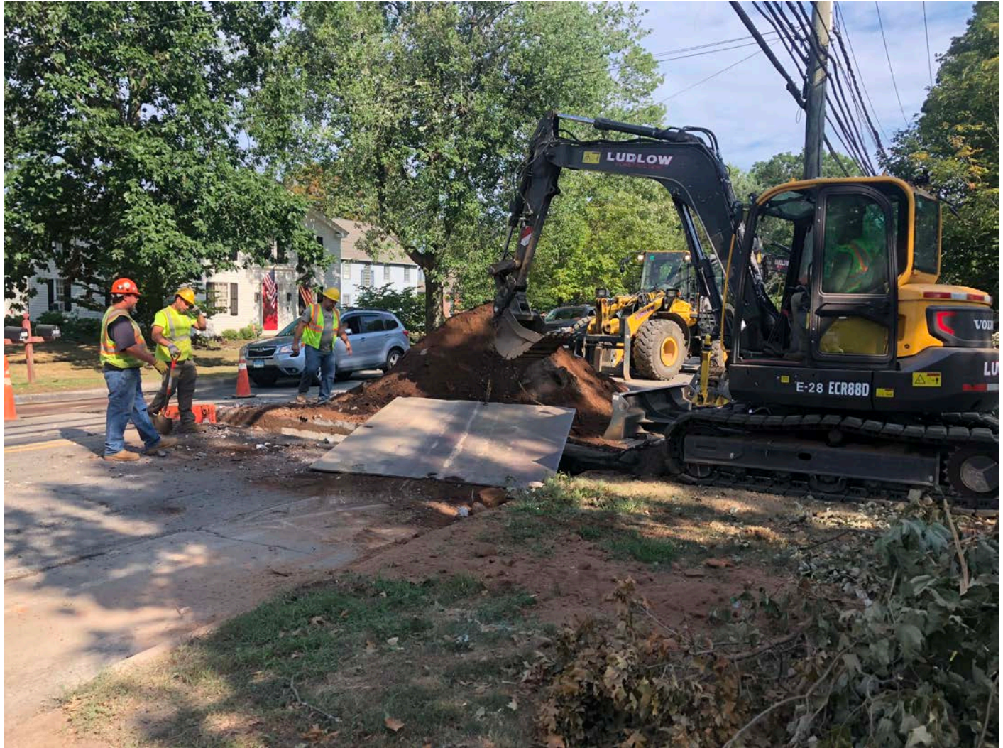
Picture 5: Ludlow placing steel plate over the curb stop trench at 261 Main Street, Durham. View to the northwest.