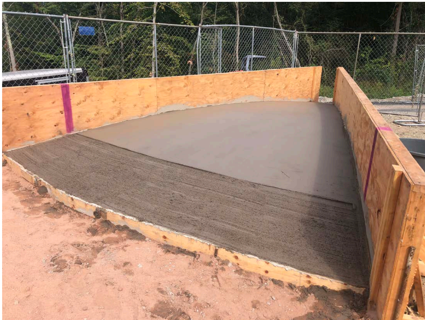
Picture 3: Concrete form for one of the water tank's top panels after grout was placed and spread over underlying layer of sand. Water tank work zone, east of Shared Access Driveway, Middletown. View to the north.