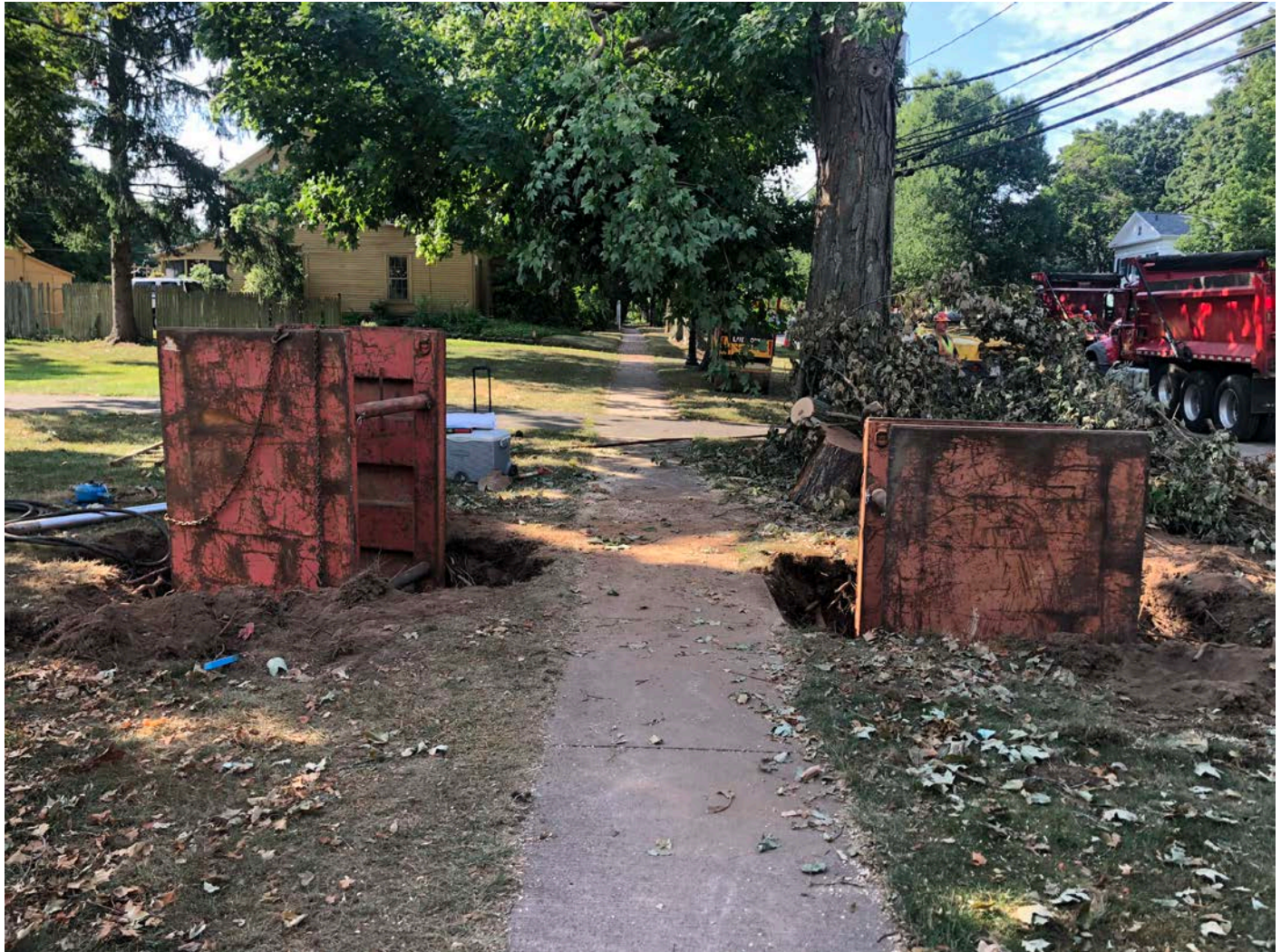
Picture 4: Installation of curb stop for 261 Main Street, Durham, residence, where 1.5" copper line was run beneath sidewalk. Station 187+26. View to the south.