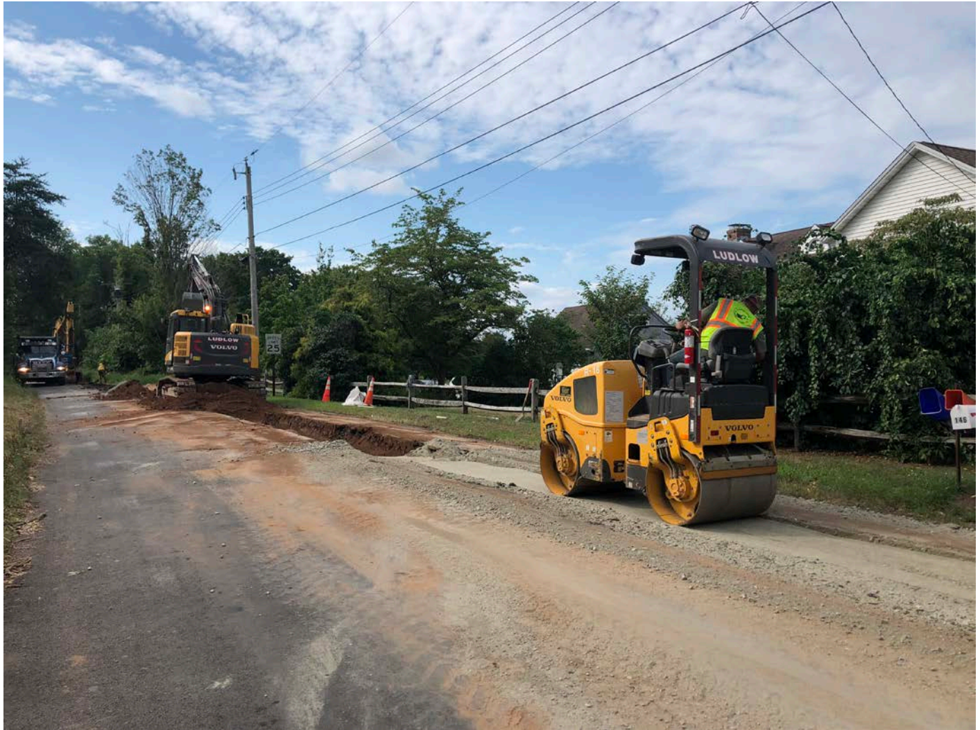
Picture 7: Ludlow cleaning up work zone on Maple Avenue, Durham after installing 12" DIP. View to the southwest.