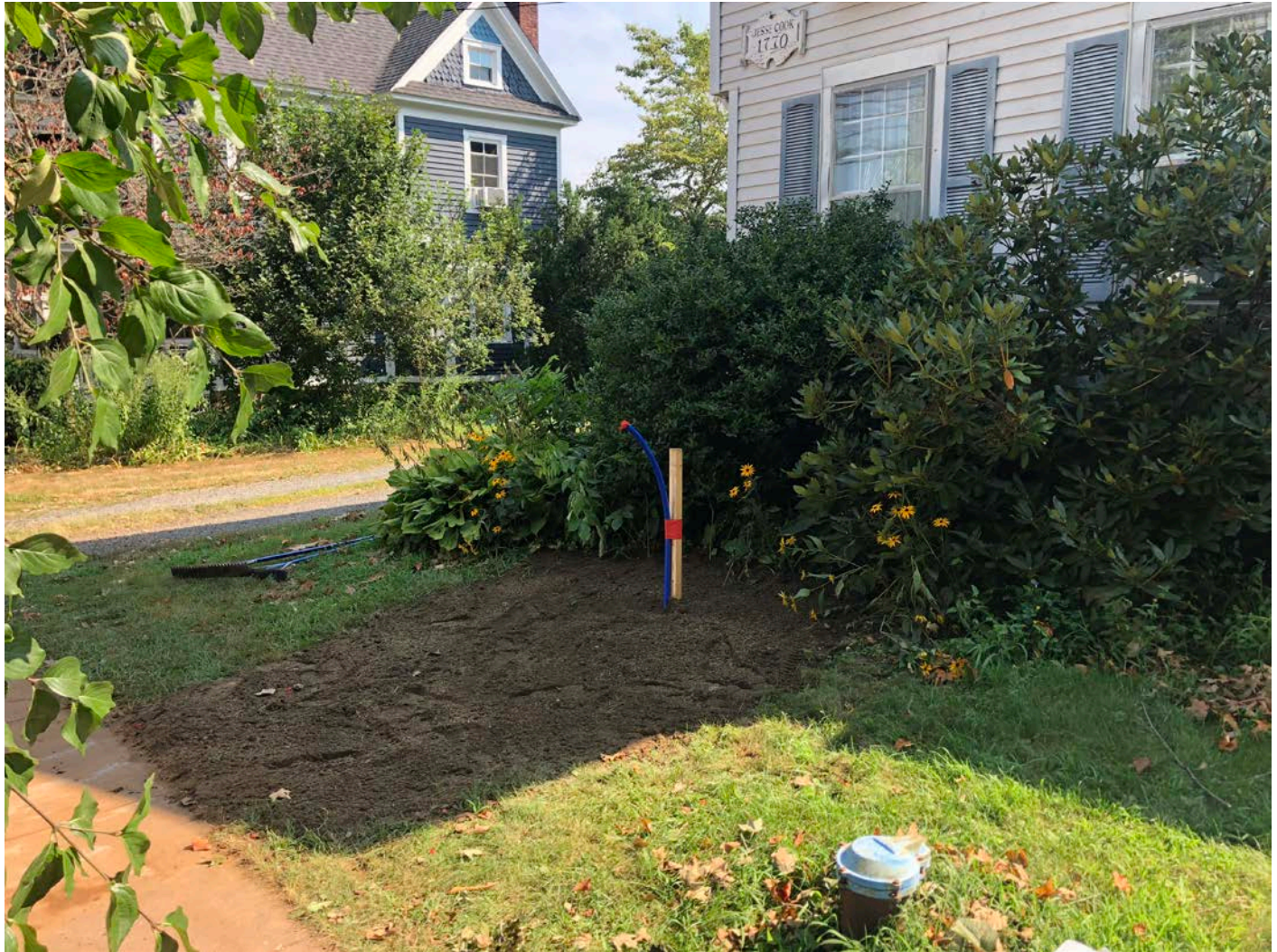
Picture 4: Curb stop installed at the 267 Main Street, Durham, residence. Station 186+44. View to the northeast.