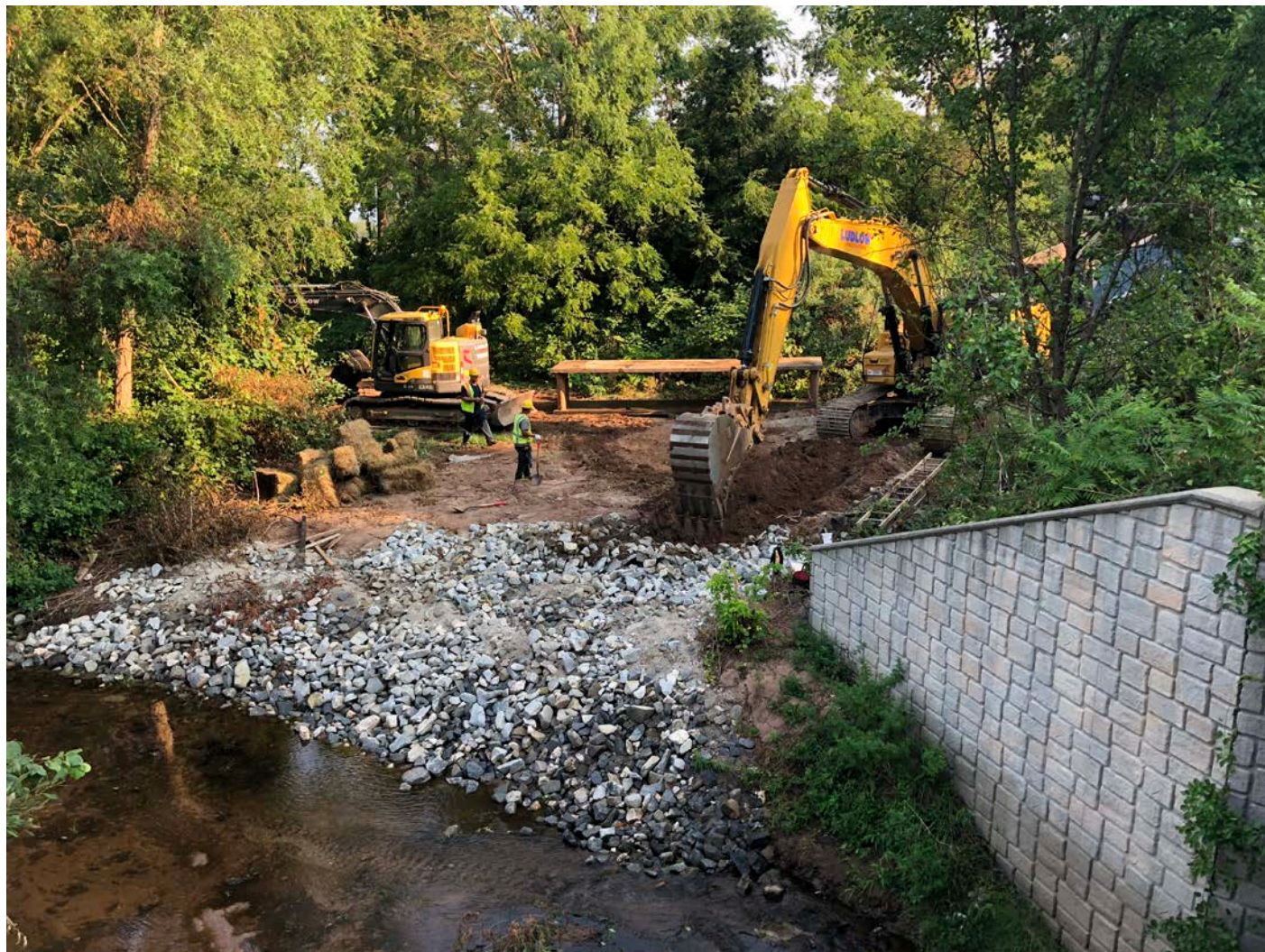
Picture 2: Ludlow excavating due north of the Maple Avenue stream crossing as they prepare to install 12" DIP. View to the north.