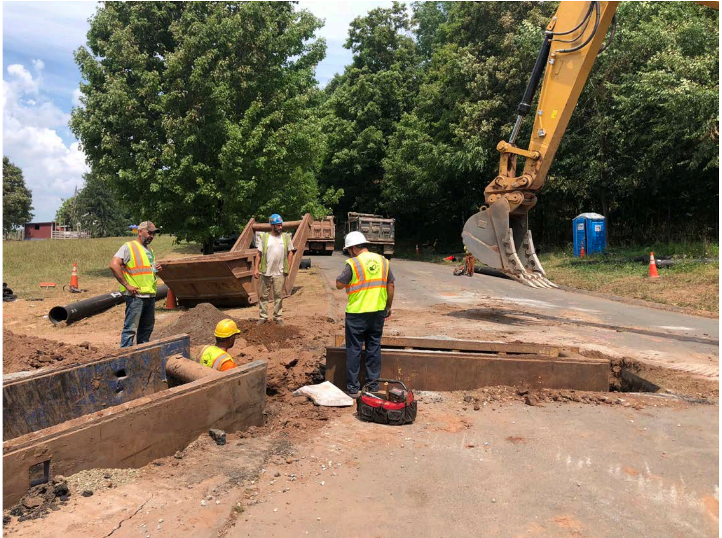
Picture 6: Ludlow has trenched and placed trench boxes for the installation of a 12"x12"x12" M.J. C.L.D.I. TEE, three 12" M.J. R.S. gate valves and gate boxes, and a 12" DIP plug at Station 906+56. View to the north.