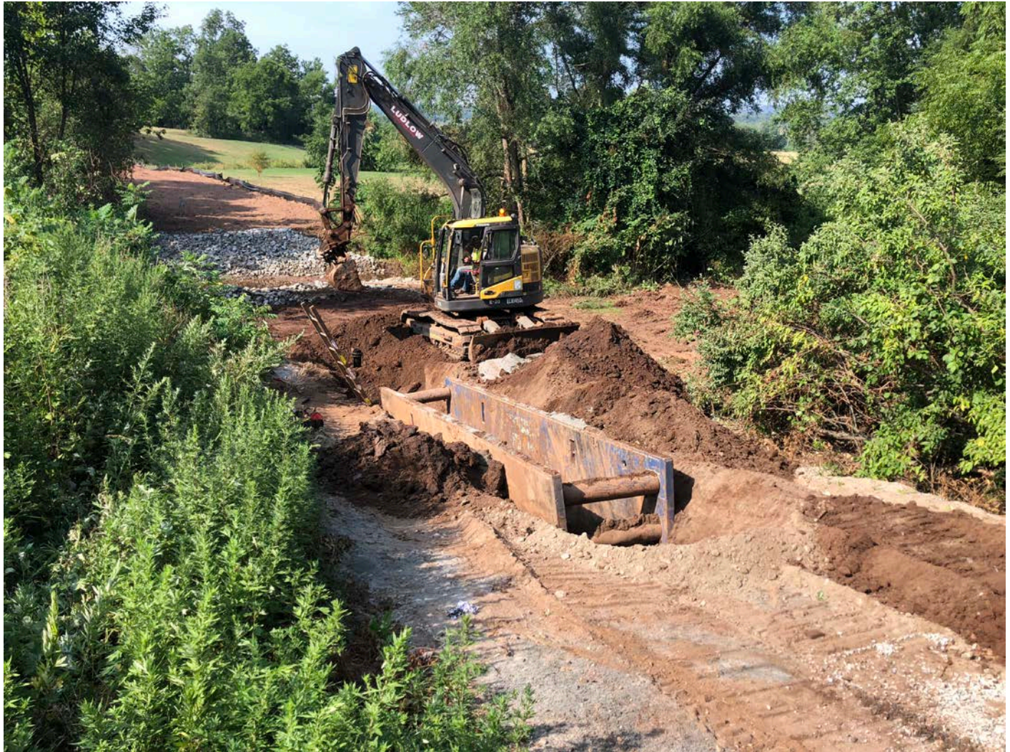
Picture 3: Trench box in place as Ludlow installs 12" DIP to the north of the Maple Avenue stream crossing. View to the south.