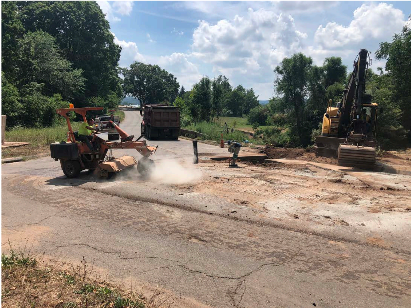
Picture 8: Ludlow cleaning up on Maple Avenue with the Bocce Broom after work was concluded at this work zone. View to the south.