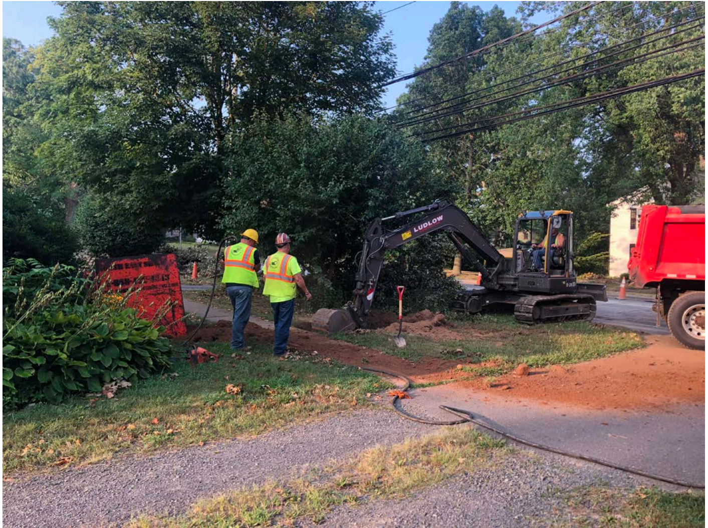
Picture 1: Ludlow excavating at Station 186+44 as they prepare to install a curb stop at 267 Main Street, Durham. View to the southwest.