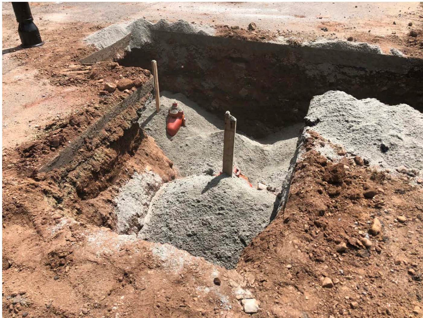
Picture 7: Ludlow in the process of backfilling over the 12"x12"x12" M.J. C.L.D.I. TEE, three 12" M.J. R.S. gate valves and gate boxes, and a 12" DIP plug at Station 906+56. View to the south.