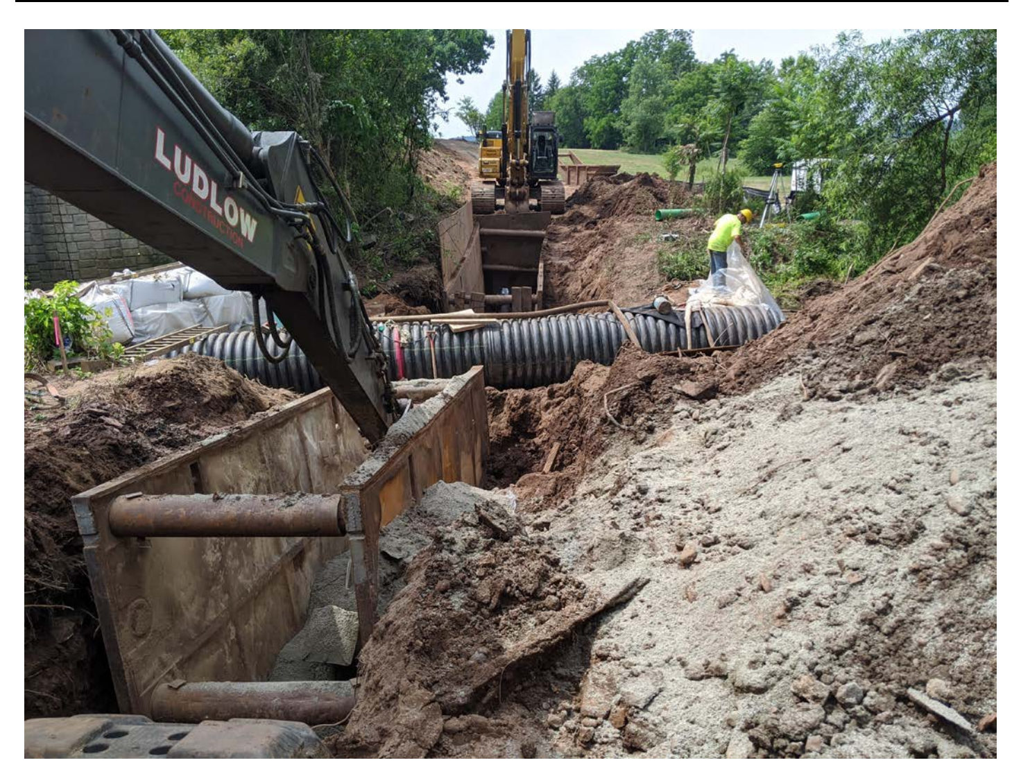
Picture 9: Ludlow Construction backfilling excavation with bedding, Maple Avenue, Station 905+00. View to the south.