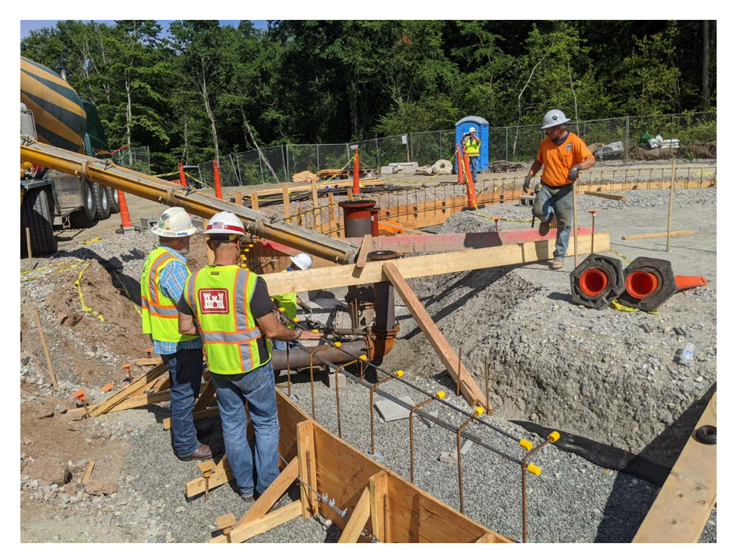
Picture 4: Concrete being placed around the pipes for the water tank, Shared Access Driveway. View to the north.