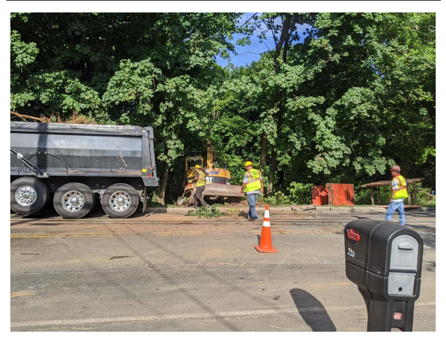
Picture 6: Ludlow Construction removing brush for the curb stop installation at Station 182+00, Main Street, Durham. View to the west.