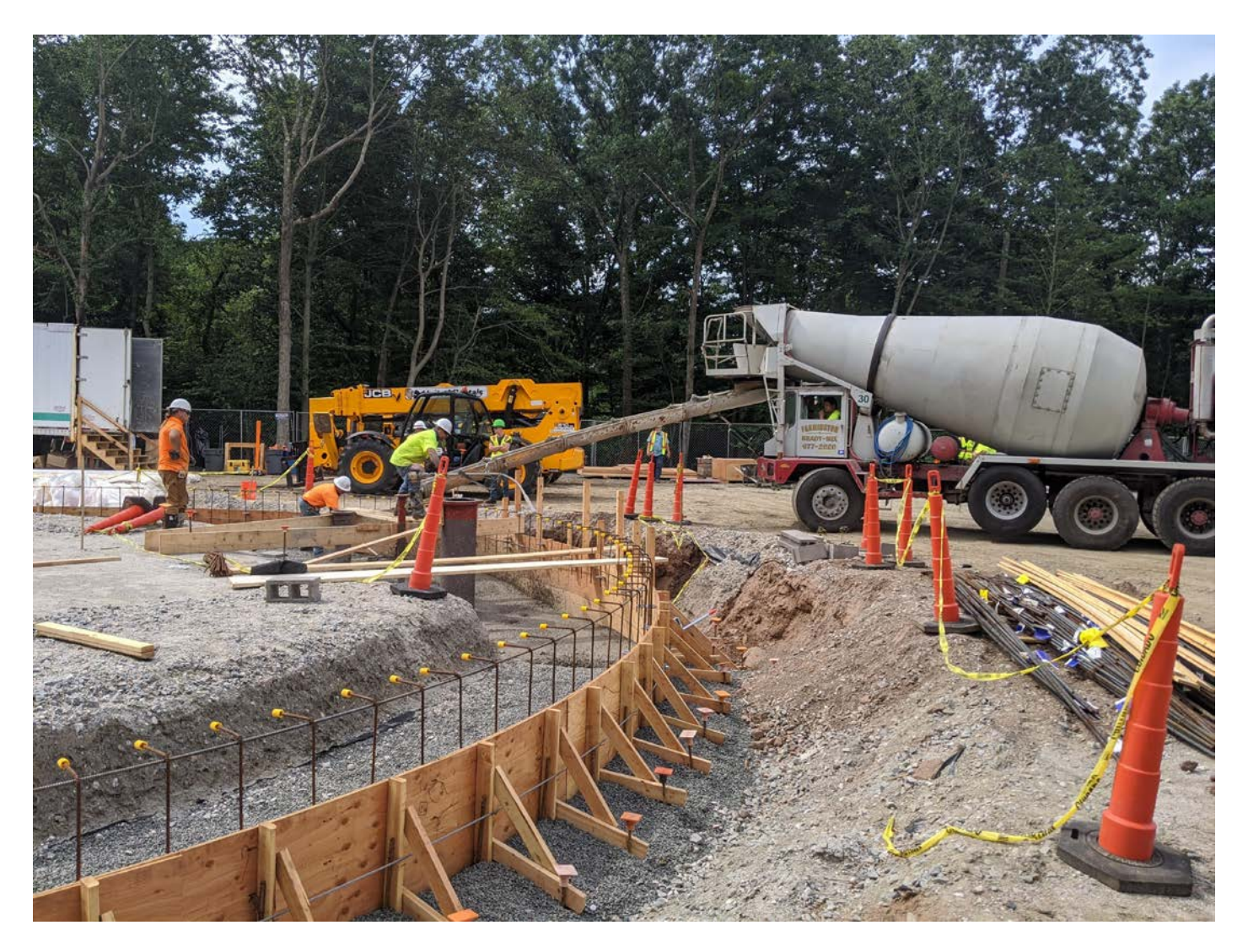
Picture 5: Concrete being placed around the pipes for the water tank, Shared Access Driveway. View to the south.