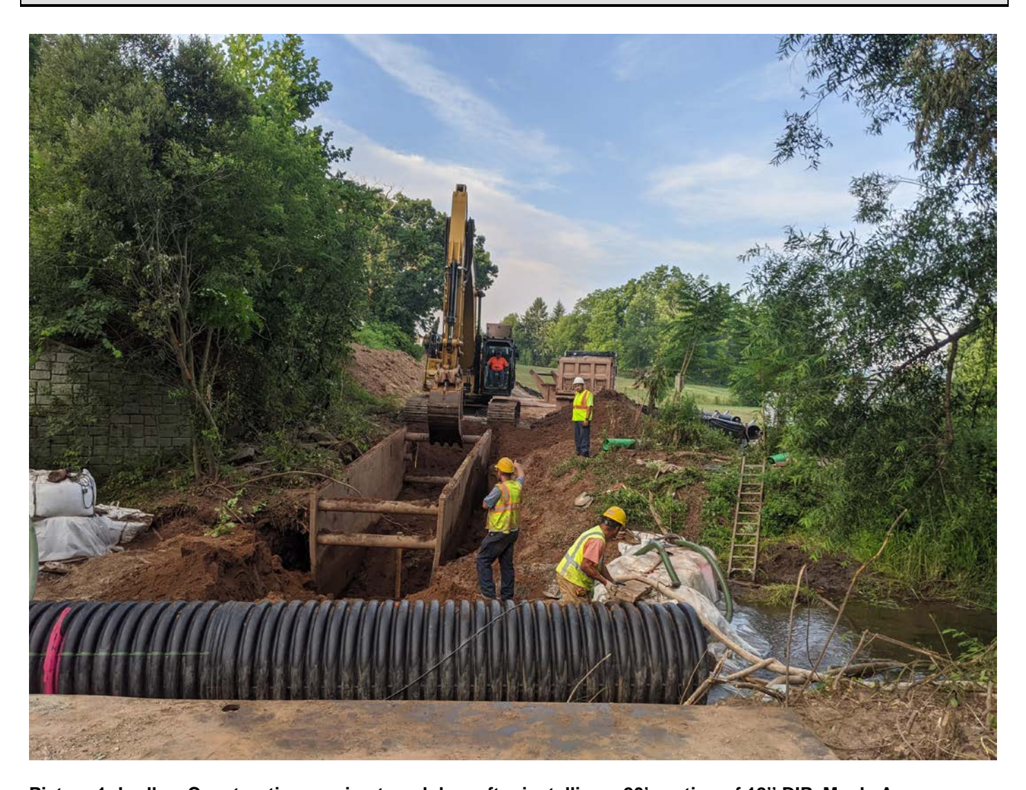
Picture 1: Ludlow Construction moving trench box after installing a 20' section of 12" DIP, Maple Avenue, Station 905 + 00. View to the south.