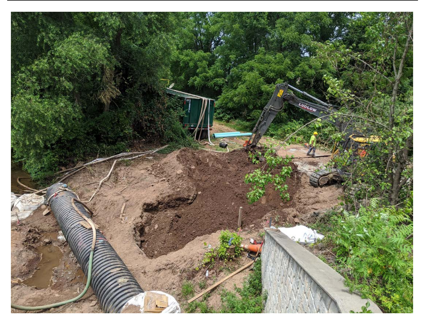
Picture 10: Ludlow Construction backfilling excavation near the stream bed, Maple Avenue, Station 905+00. View to the west.