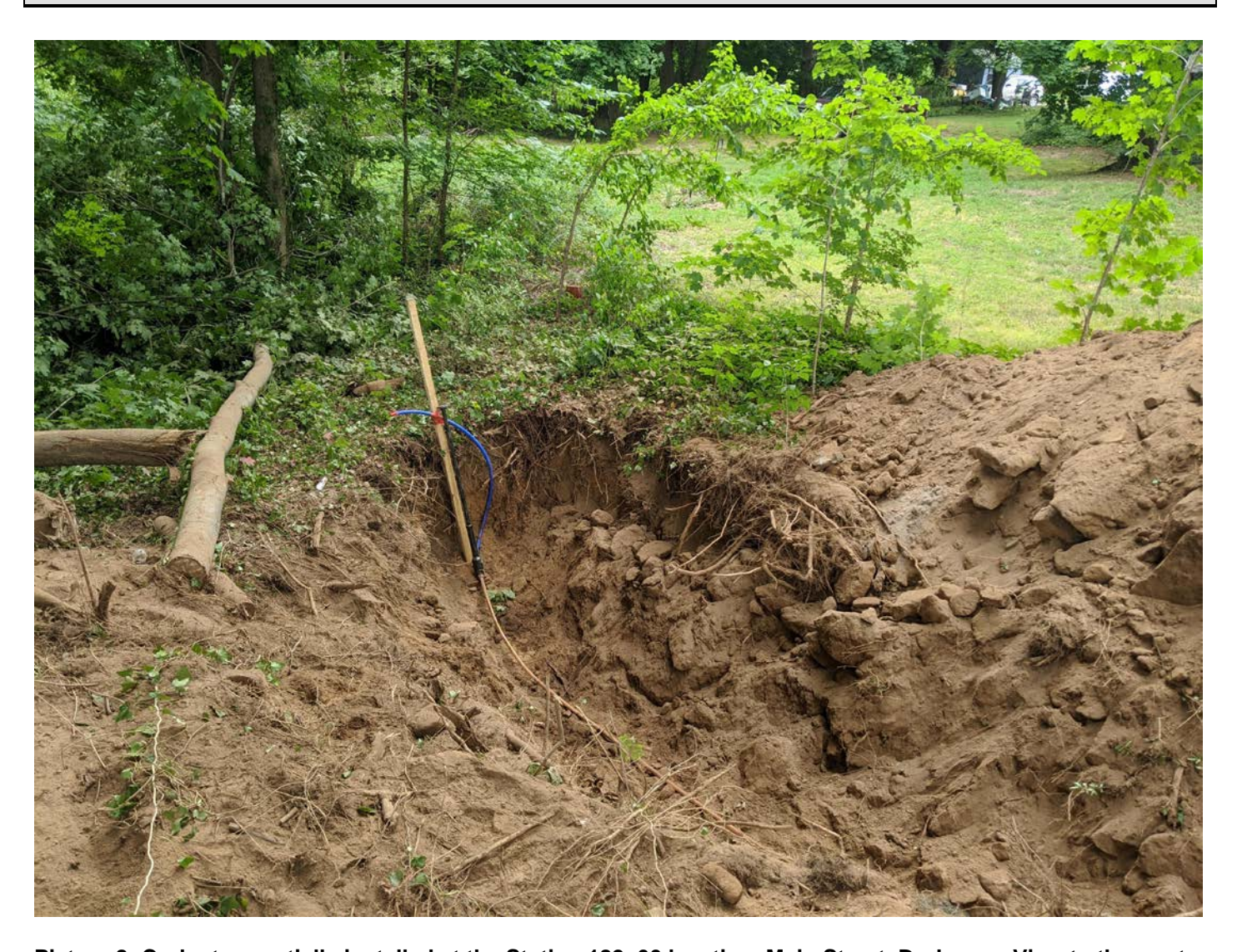
Picture 8: Curb stop partially installed at the Station 182+00 location, Main Street, Durham. View to the west.