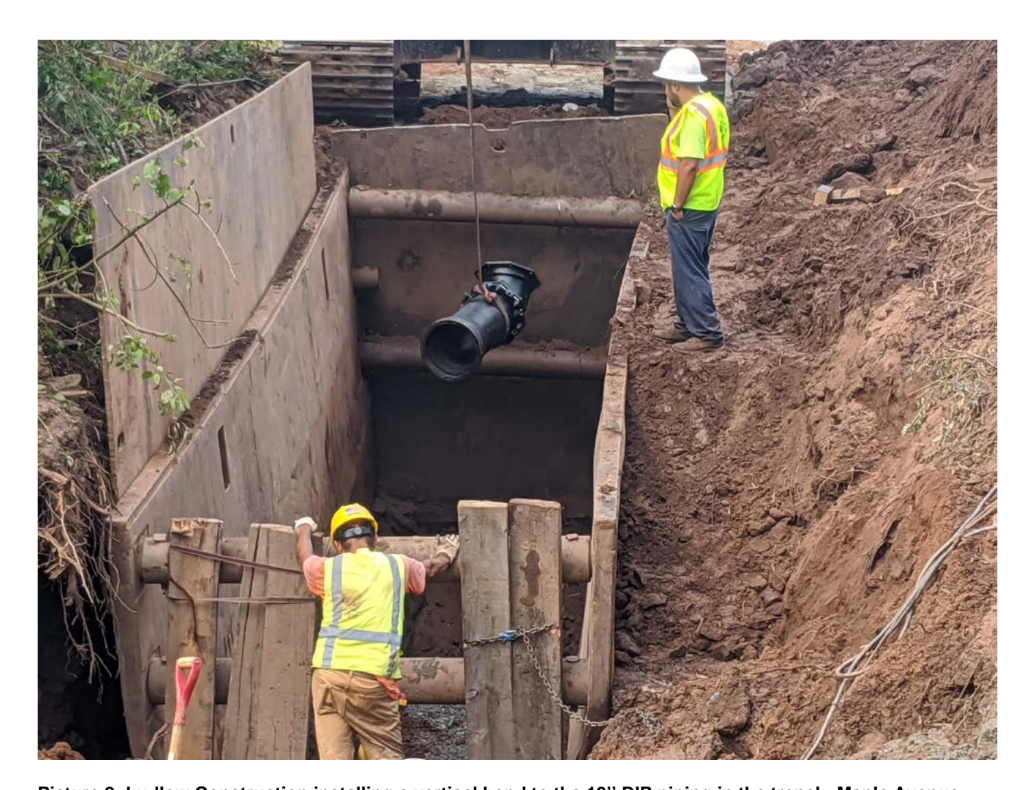
Picture 2: Ludlow Construction installing a vertical bend to the 12" DIP piping in the trench, Maple Avenue, Station 905 + 00. View to the south.