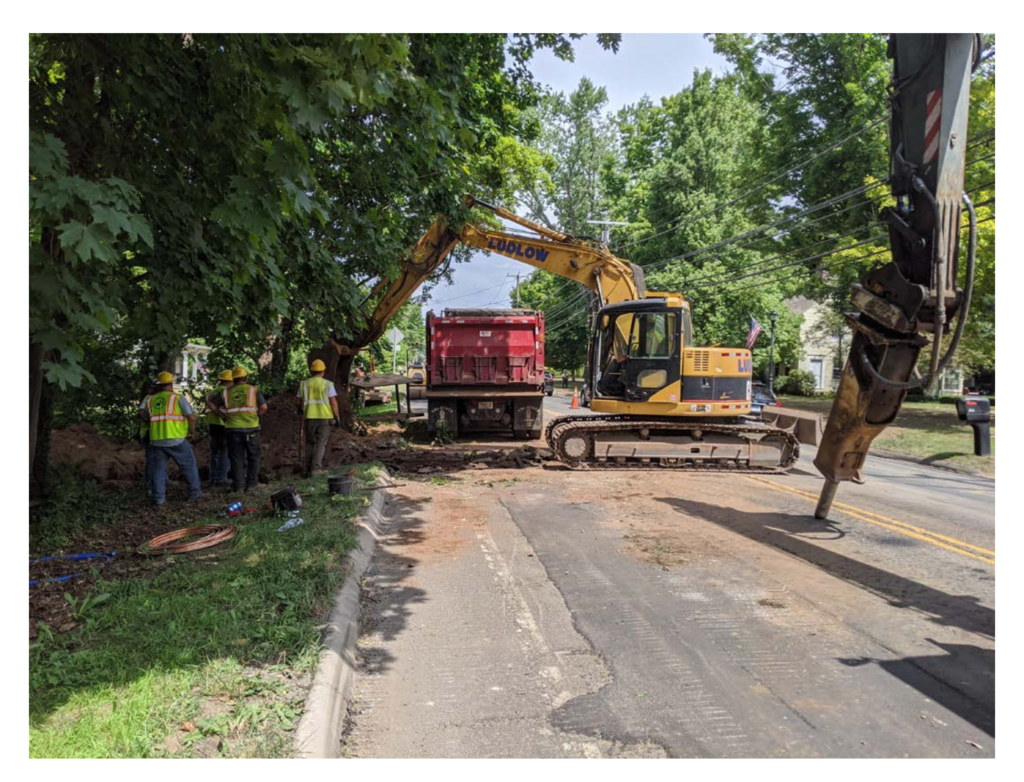
Picture 7: Ludlow Construction digging trench for the curb stop installation at Station 182+00, Main Street, Durham. View to the north.