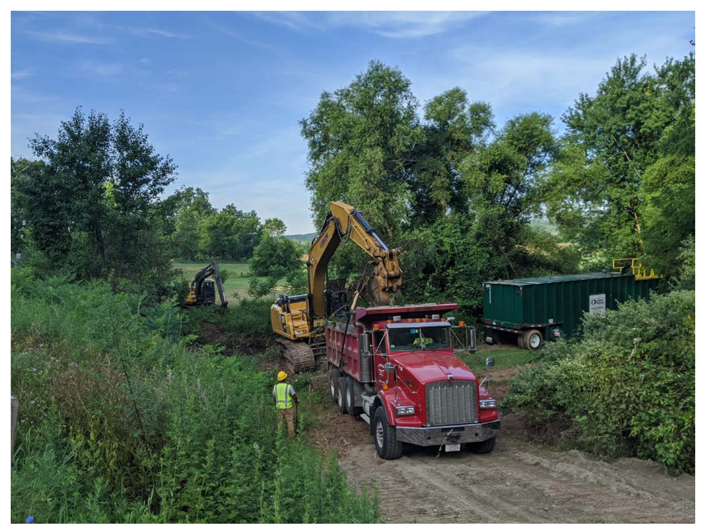
Picture 1: Ludlow construction removing brush, Maple Avenue, Station 905. View to the south.