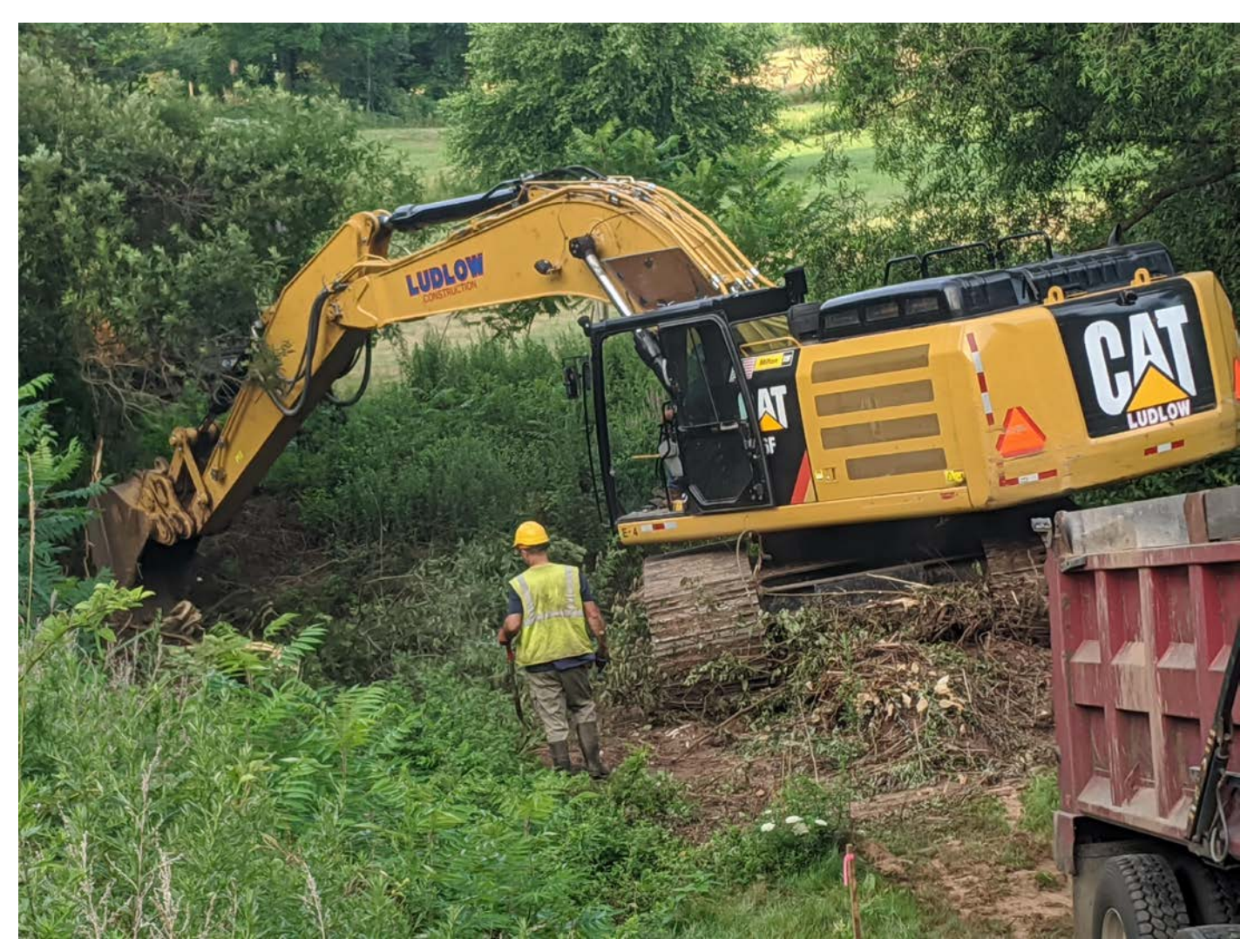
Picture 2: Ludlow construction removing brush, Maple Avenue, Station 905. View to the south.