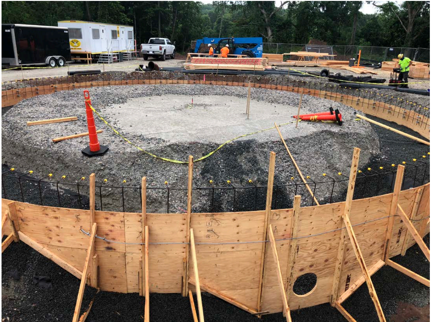
Picture 1: Frost wall cement form at the water tank footprint, east end of the Shared Access Road, Middletown. View to the east.