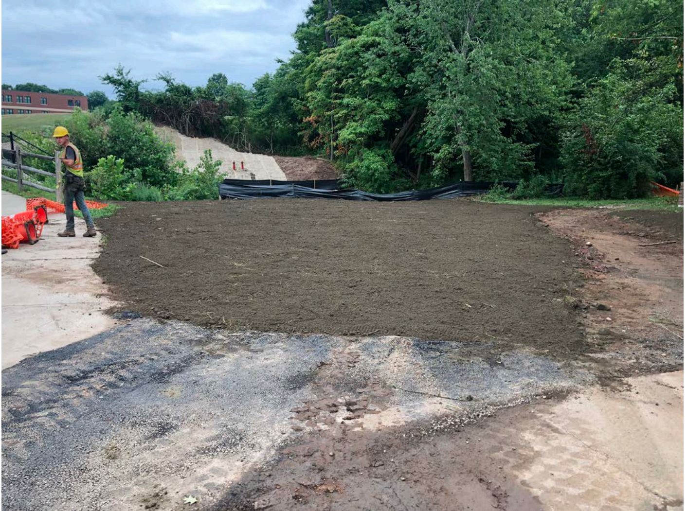
Picture 6: Ludlow loaming and seeding the work area located due east of the Pickett Lane stream crossing at Station ~511+00. View to the northwest.