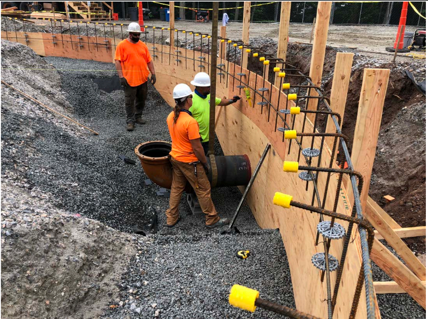
Picture 2: DN Tanks installing the water tank's main line through a hole cut through the wall of the concrete form for the frost wall. View to the south.