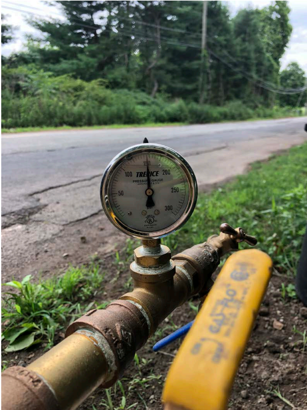
Picture 8: Beginning pressure on the test performed on the Pickett Lane water line from a valve at Station 531+00 to a valve located at the intersection of Pickett Lane and Maiden Lane.