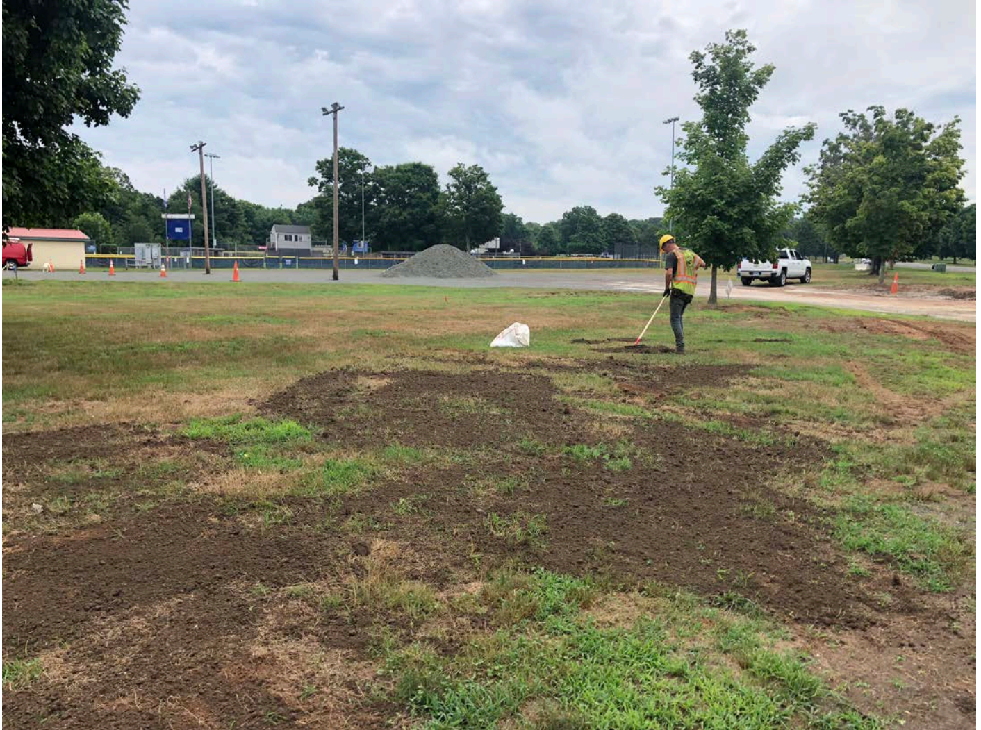
Picture 7: Ludlow loaming and seeding at the Station 514+00 staging area on Pickett Lane, Durham. View to the northeast.