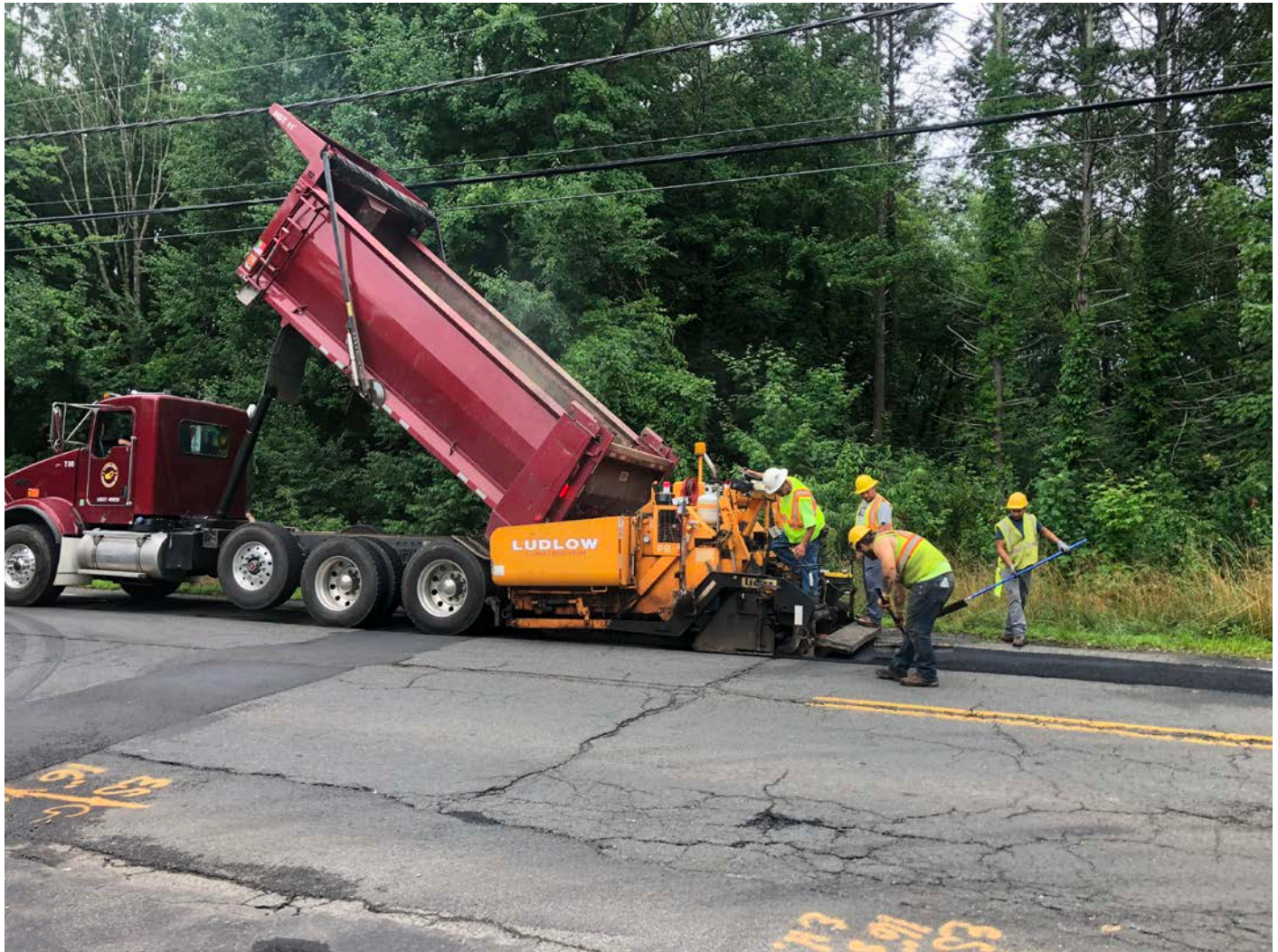
Picture 5: Ludlow begins to shim coat the southbound section of S. Main Street in Middletown from Stations 136+50 to 138+00. View to the west.