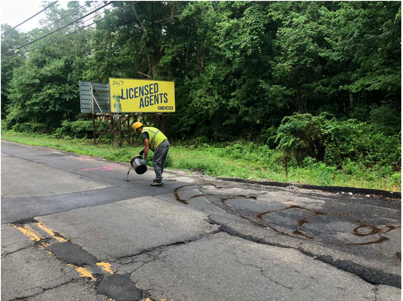
Picture 3: Ludlow applying tack coat to asphalt surface, preparing to shim coat trench footprint on S. Main Street in Middletown from Stations 136+50 to 138+00. View to the west.