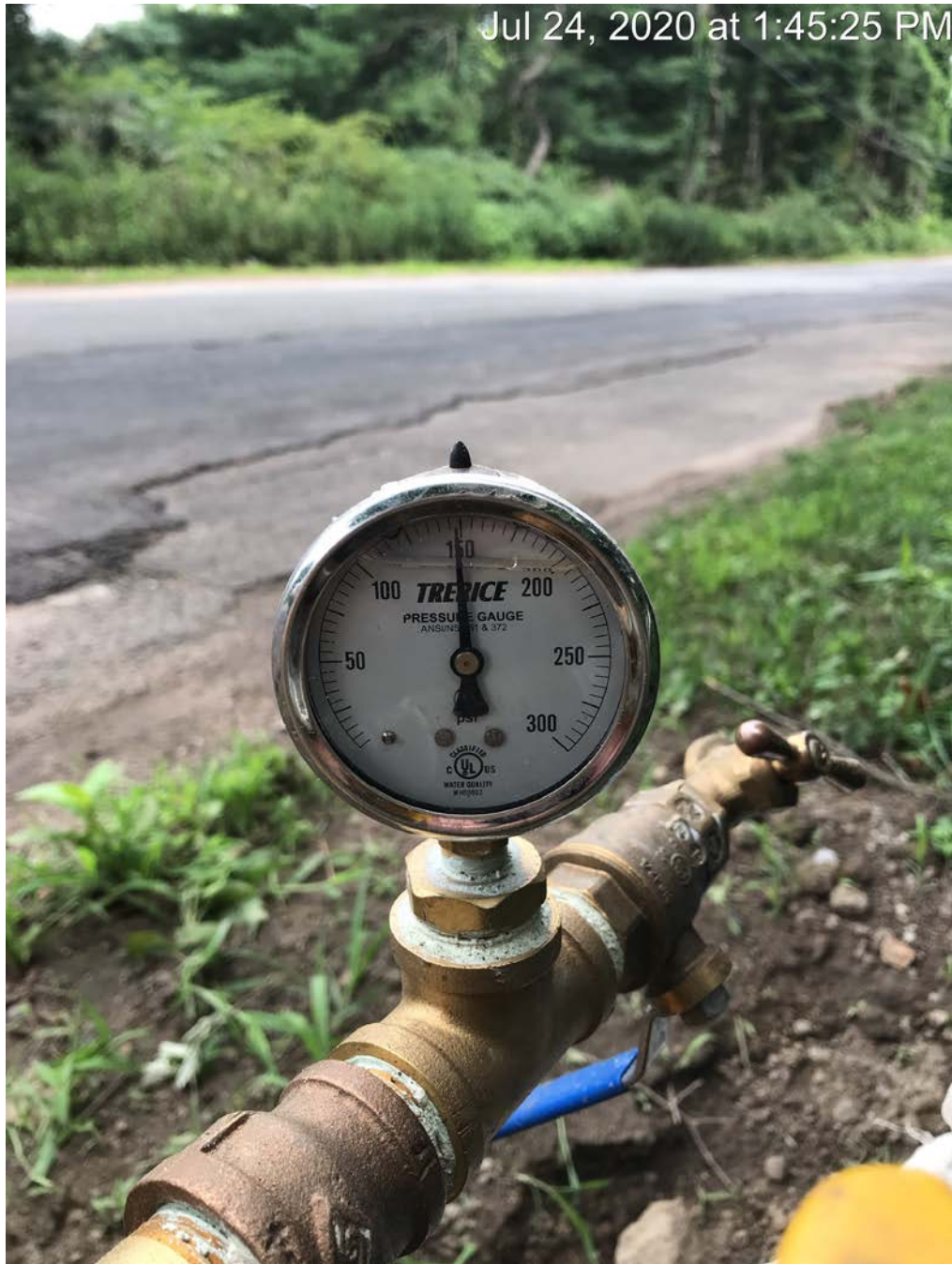
Picture 9: End pressure on the test performed on the Pickett Lane water line from a valve at Station 531+00 to a valve located at the intersection of Pickett Lane and Maiden Lane.