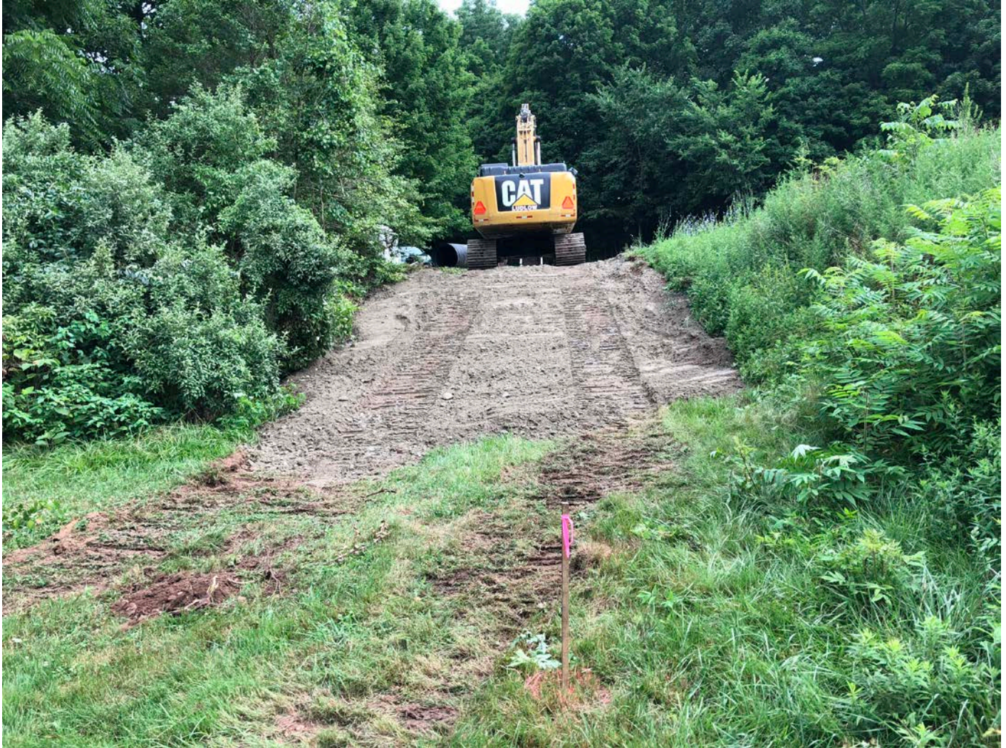
Picture 12: View of where Ludlow cleared brush on the north side of the Allyn Brook stream crossing on Maple Avenue, Durham. View to the north.