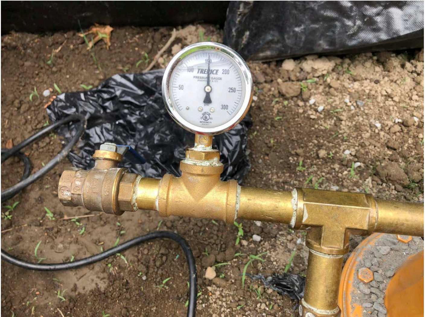
Picture 10: Beginning pressure on the test performed on the Maiden Lane water line from a gate valve at Station 412+14 and gate valve at the intersection of Maiden Lane and Pickett Lane.