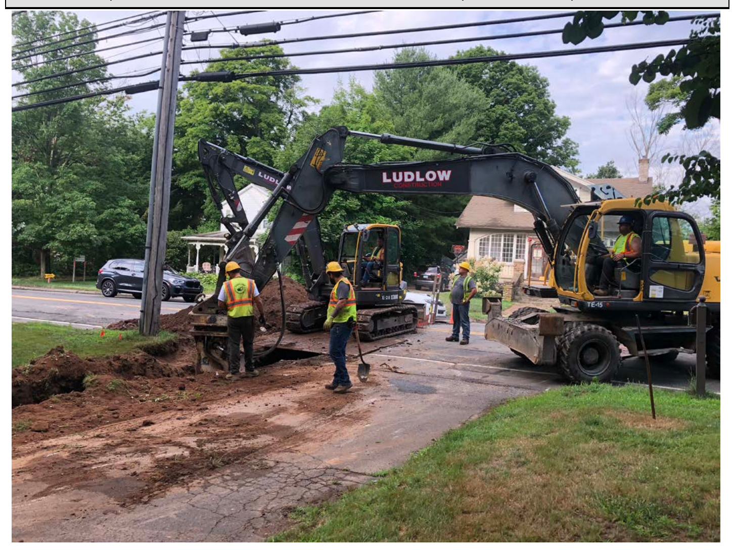
Picture 4: Ludlow hammering rock at Station 178+55. Main Street, Durham. View to the east.

Project: Date: July 23, 2020 Durham Meadows Pipeline Installation Location: Day of Week: Thursday Maiden Lane, Main Street, and the Shared Access Driveway Report No: 126 Project #: AECOM: 6061487 Contractor: Ludlow Construction Page: 7 of 11