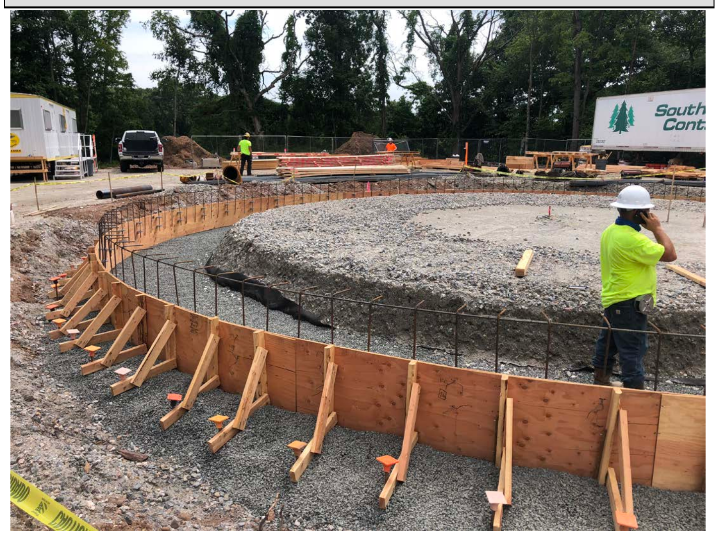
Picture 5: DN Tanks placing rebar on the top of the hook bars on the concrete form surrounding the water tank footprint to the east of the Shared Access Road. View to the east.

July 23, 2020 Project: Durham Meadows Pipeline Installation Date: Day of Week: Thursday Location: Maiden Lane, Main Street, and the Shared Access Driveway Report No: 126 Project #: AECOM: 6061487 Contractor: Ludlow Construction Page: 8 of 11