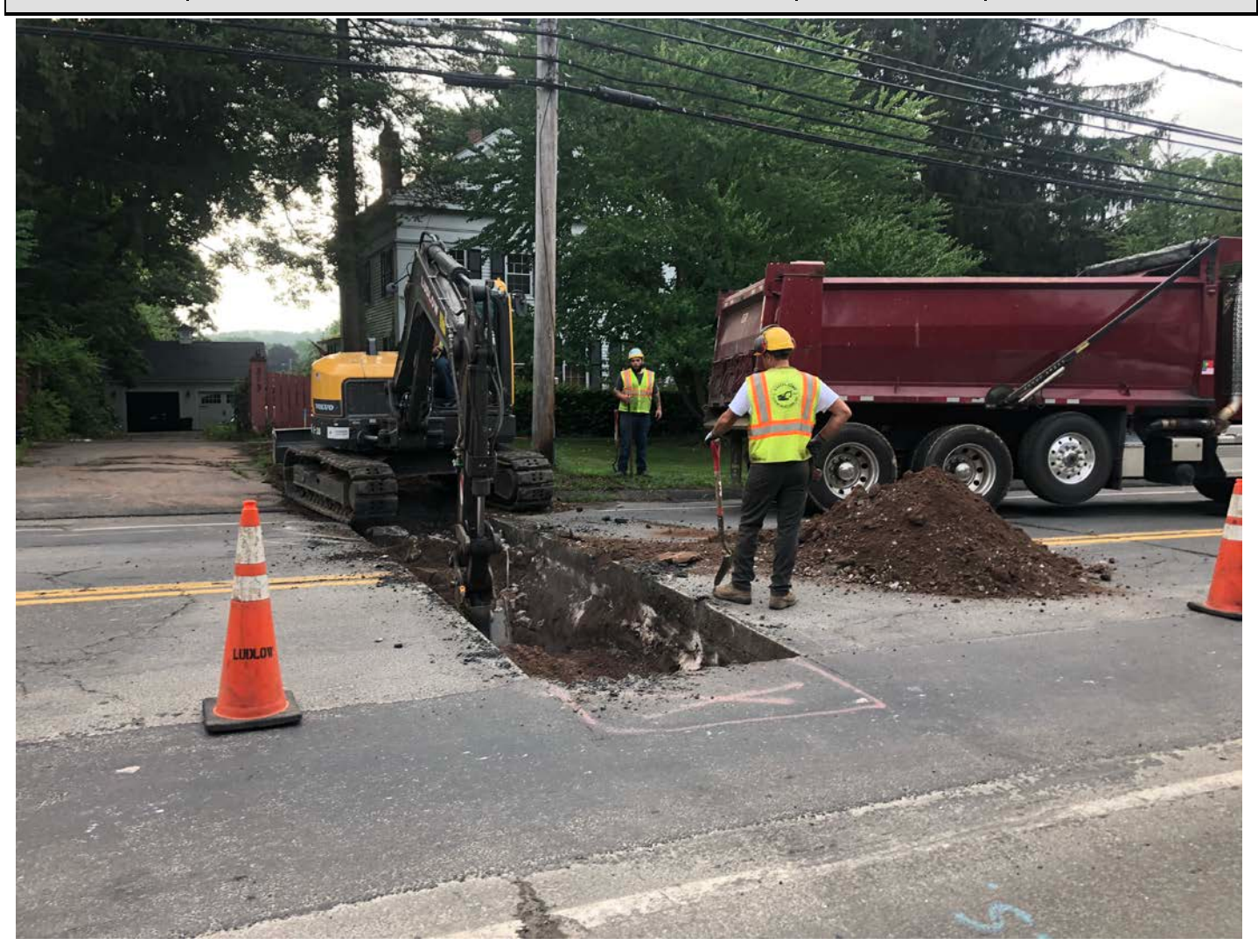
Picture 2: Ludlow excavating on the east side of Main Street at Station 177+10 for the installation of a curb stop at 313 Main Street, Durham. View to the east.

Date: July 23, 2020 Project: Durham Meadows Pipeline Installation Day of Week: Thursday Location: Maiden Lane, Main Street, and the Shared Access Driveway Report No: 126 Project #: AECOM: 6061487 Contractor: Ludlow Construction Page: 5 of 11