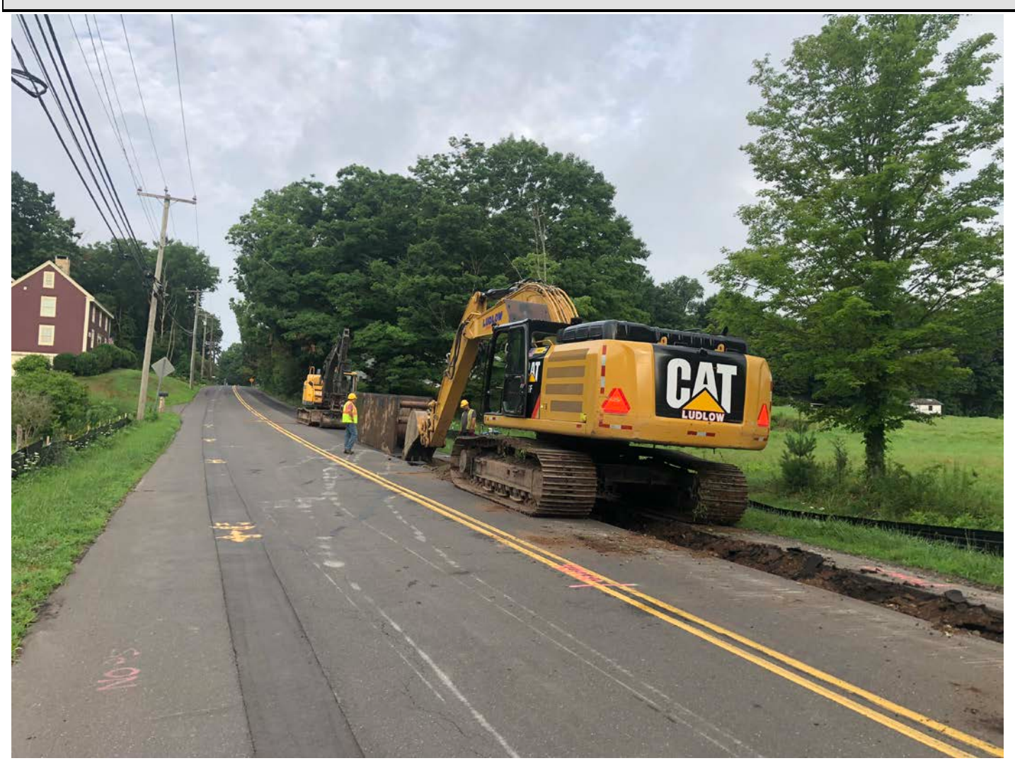
Picture 1: Ludlow beginning to excavate on Maiden Lane to begin installing 12" DIP. View to the west.

Project: Date: July 23, 2020 Durham Meadows Pipeline Installation Thursday Location: Maiden Lane, Main Street, and the Shared Access Driveway Day of Week: Report No: 126 Project #: AECOM: 6061487 Contractor: Ludlow Construction Page: 4 of 11