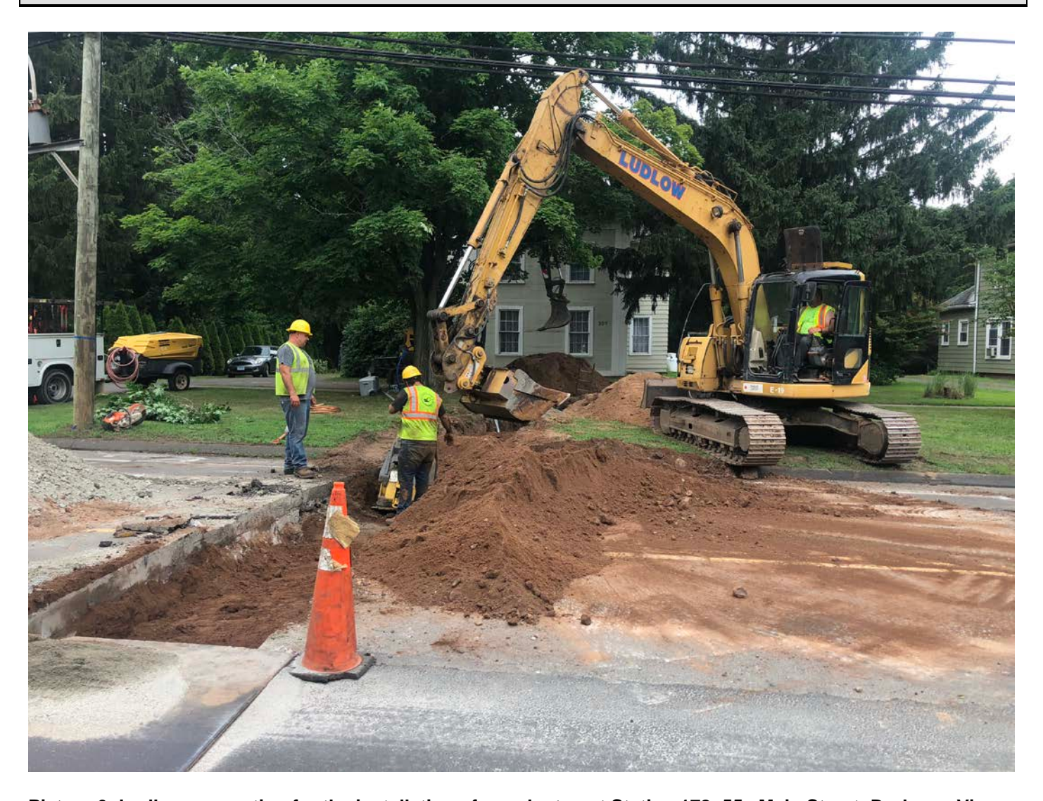
Picture 6: Ludlow excavating for the installation of a curb stop at Station 178+55. Main Street, Durham. View to the east.

Project: Date: July 23, 2020 Durham Meadows Pipeline Installation Location: Day of Week: Thursday Maiden Lane, Main Street, and the Shared Access Driveway Report No: 126 Project #: AECOM: 6061487 Contractor: Ludlow Construction Page: 9 of 11