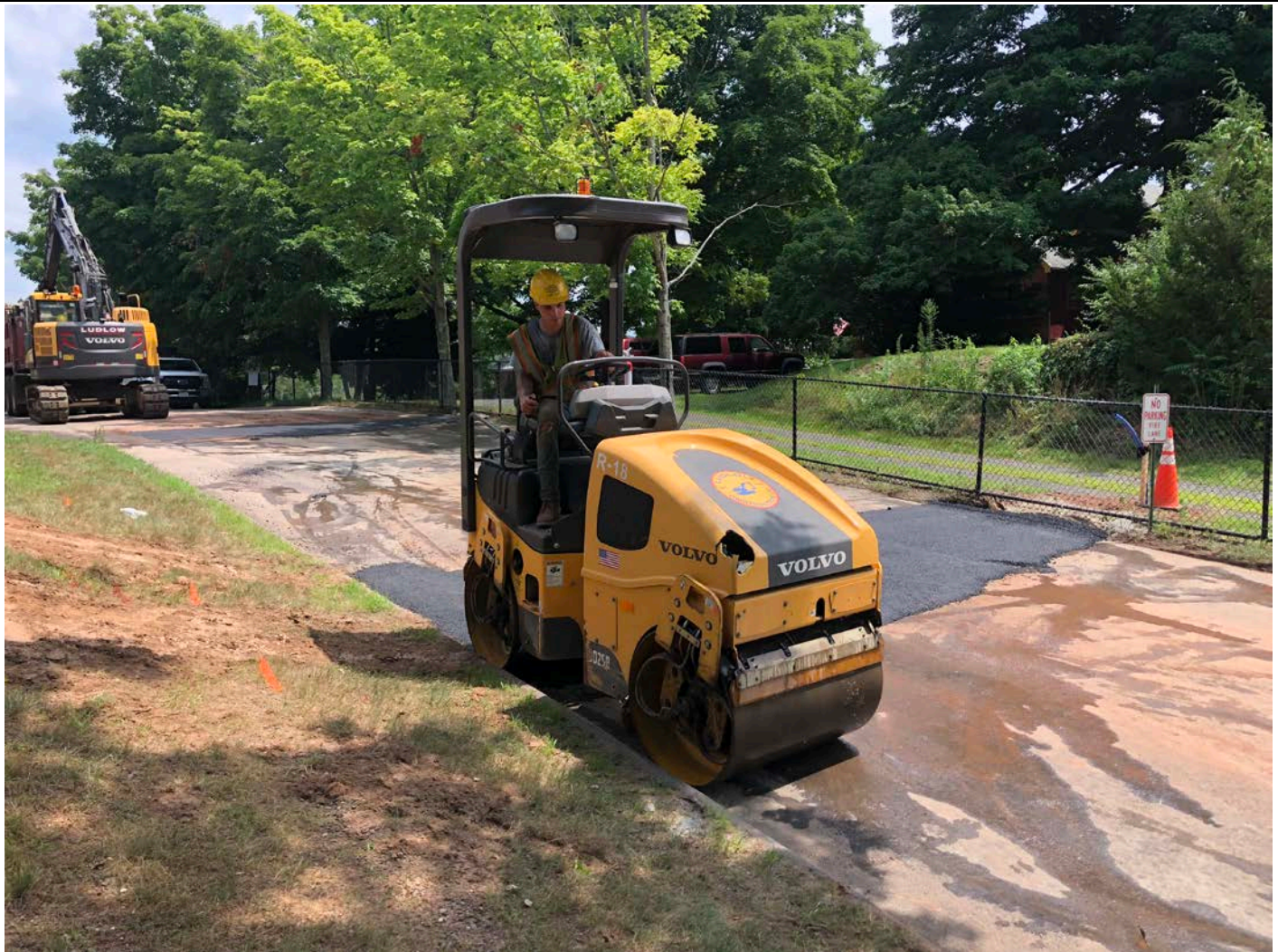
Picture 4: Ludlow compacting hot patch at Station 502+48. Pickett Lane, Durham. View to the east.