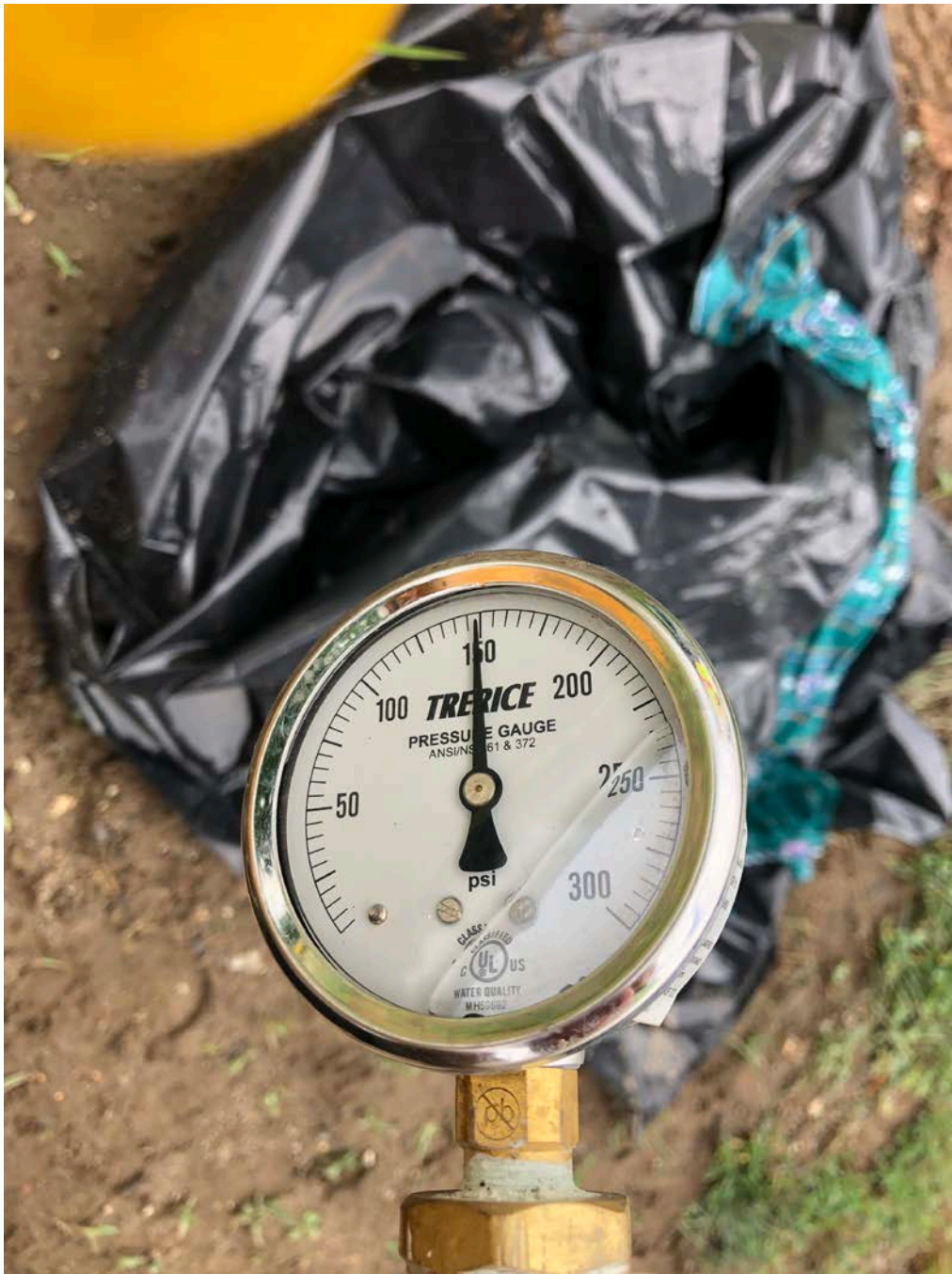
Picture 9: End pressure on the pressure test run on the Pickett Lane water line from a valve located near Station 511+00 to a valve located near Station 532+00. Pickett Lane, Durham.