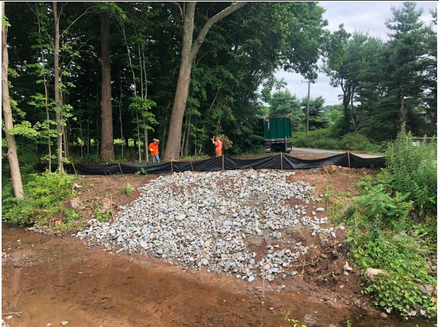
Picture 3: Ludlow installing silt fence on the north side of the Hersig Brook stream crossing. Pickett Lane, Durham. View to the north.