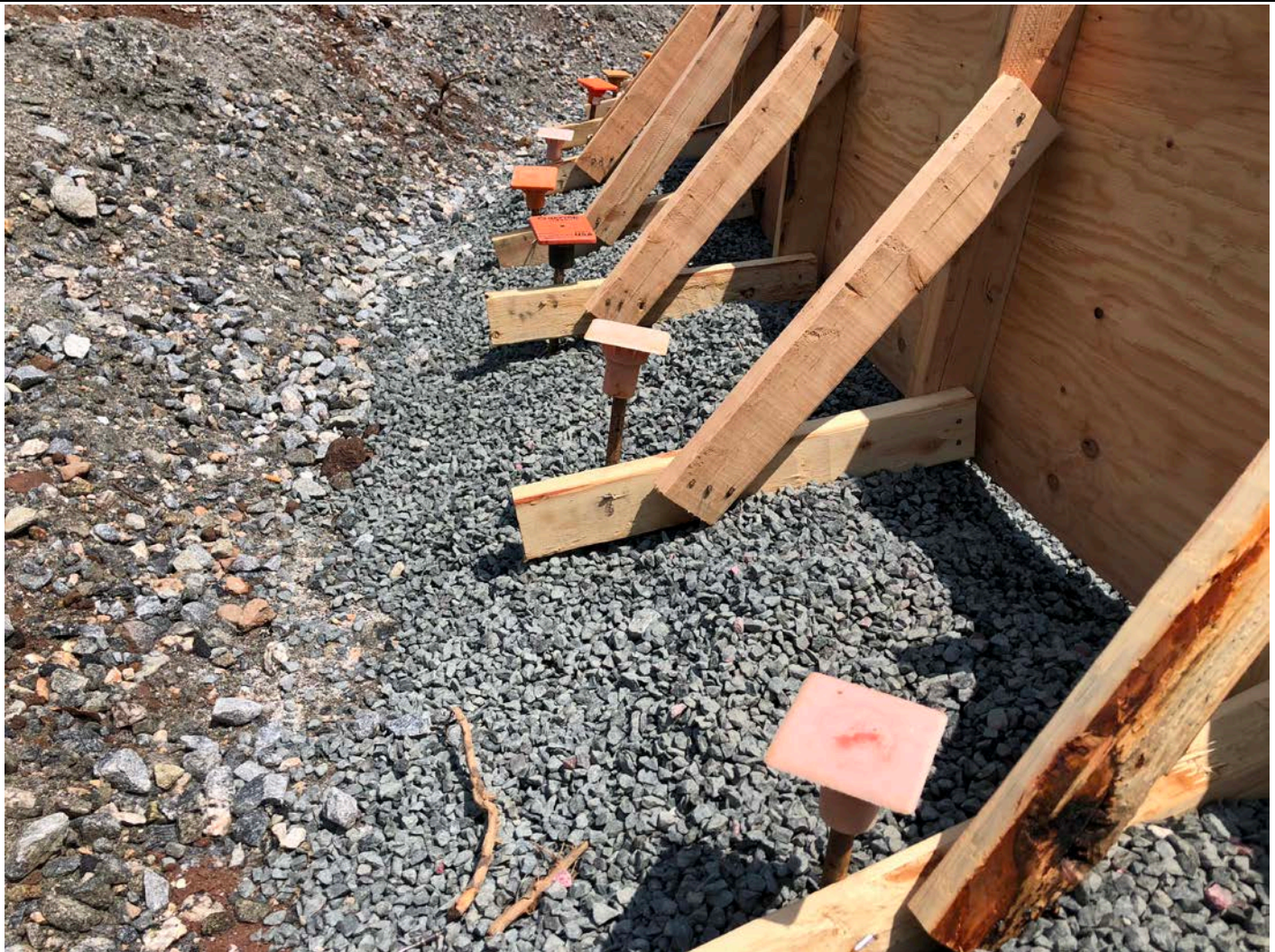
Picture 5: Safety caps that DN Tanks placed on exposed rebar ends. Water tank footprint, Shared Access Driveway, Middletown.