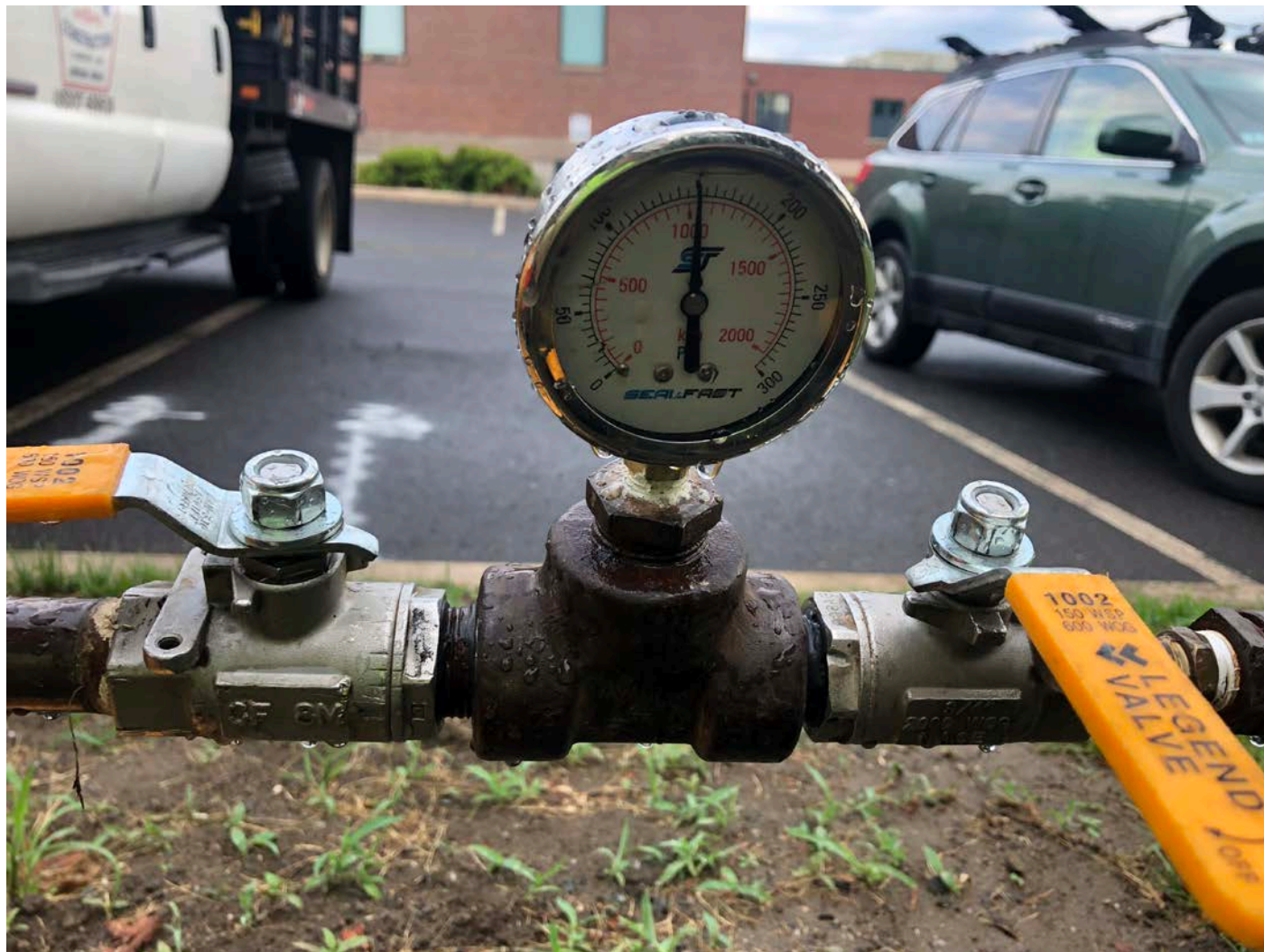
Picture 6: Beginning pressure on the pressure test run on the Pickett Lane water line from Main Street to a valve located near Station 511+00. Pickett Lane, Durham.