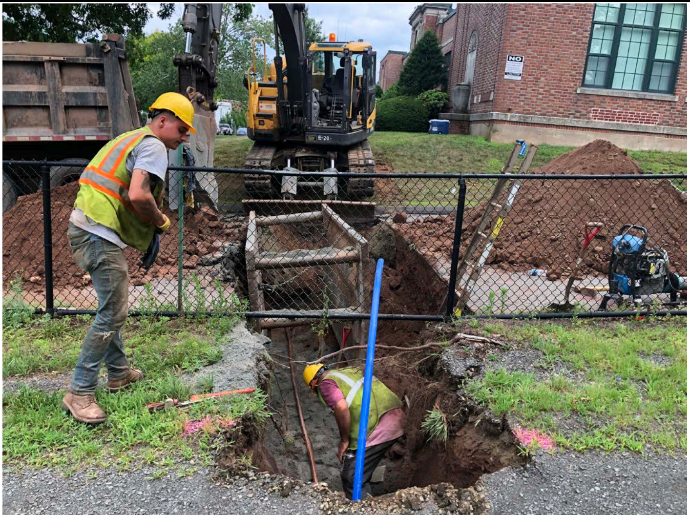
Picture 1: Ludlow installing 1" curb stop at Station 502+95. Pickett Lane, Durham. View to the north.