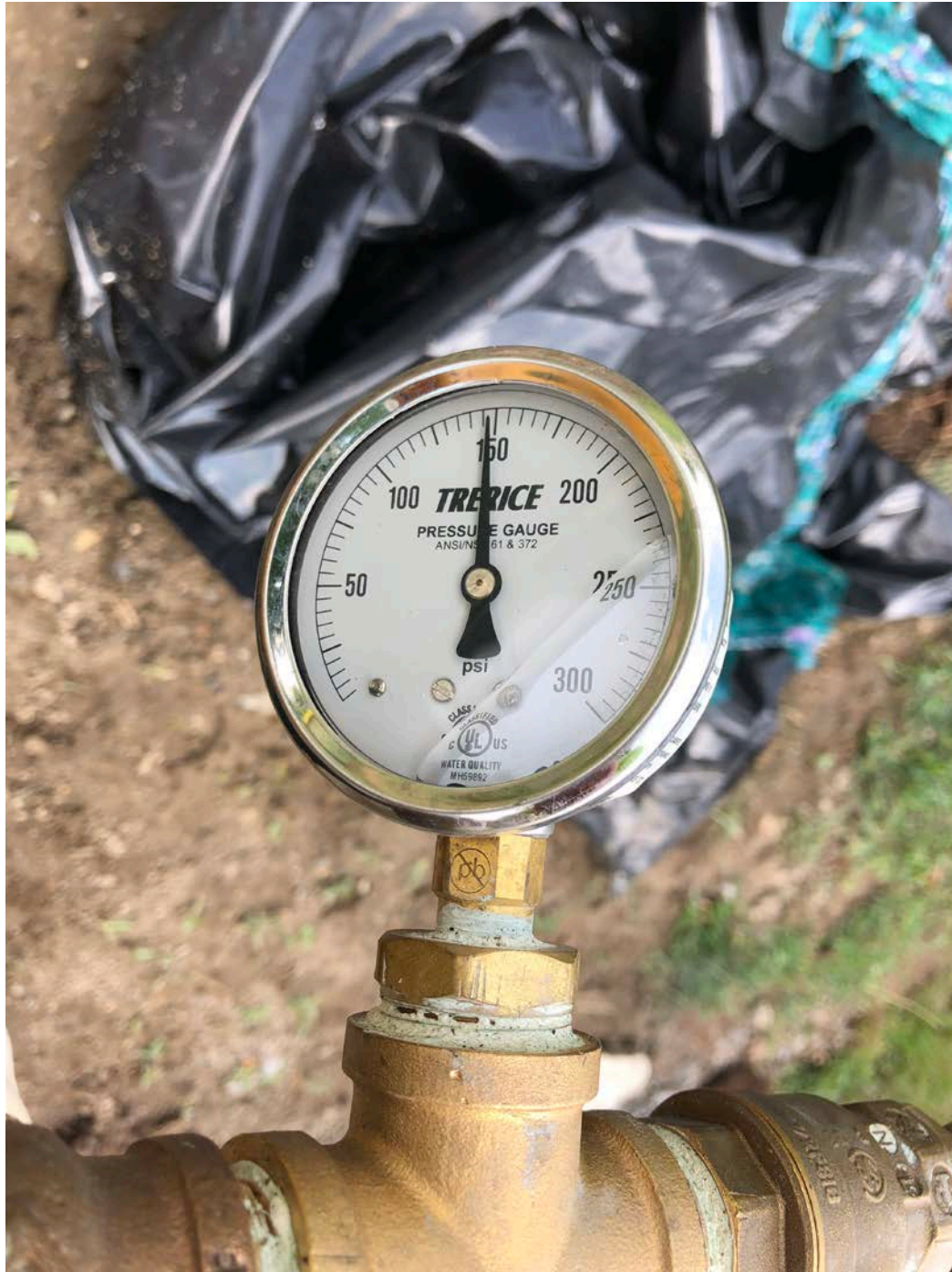
Picture 8: Beginning pressure on the pressure test run on the Pickett Lane water line from a valve located near Station 511+00 to a valve located near Station 532+00. Pickett Lane, Durham.