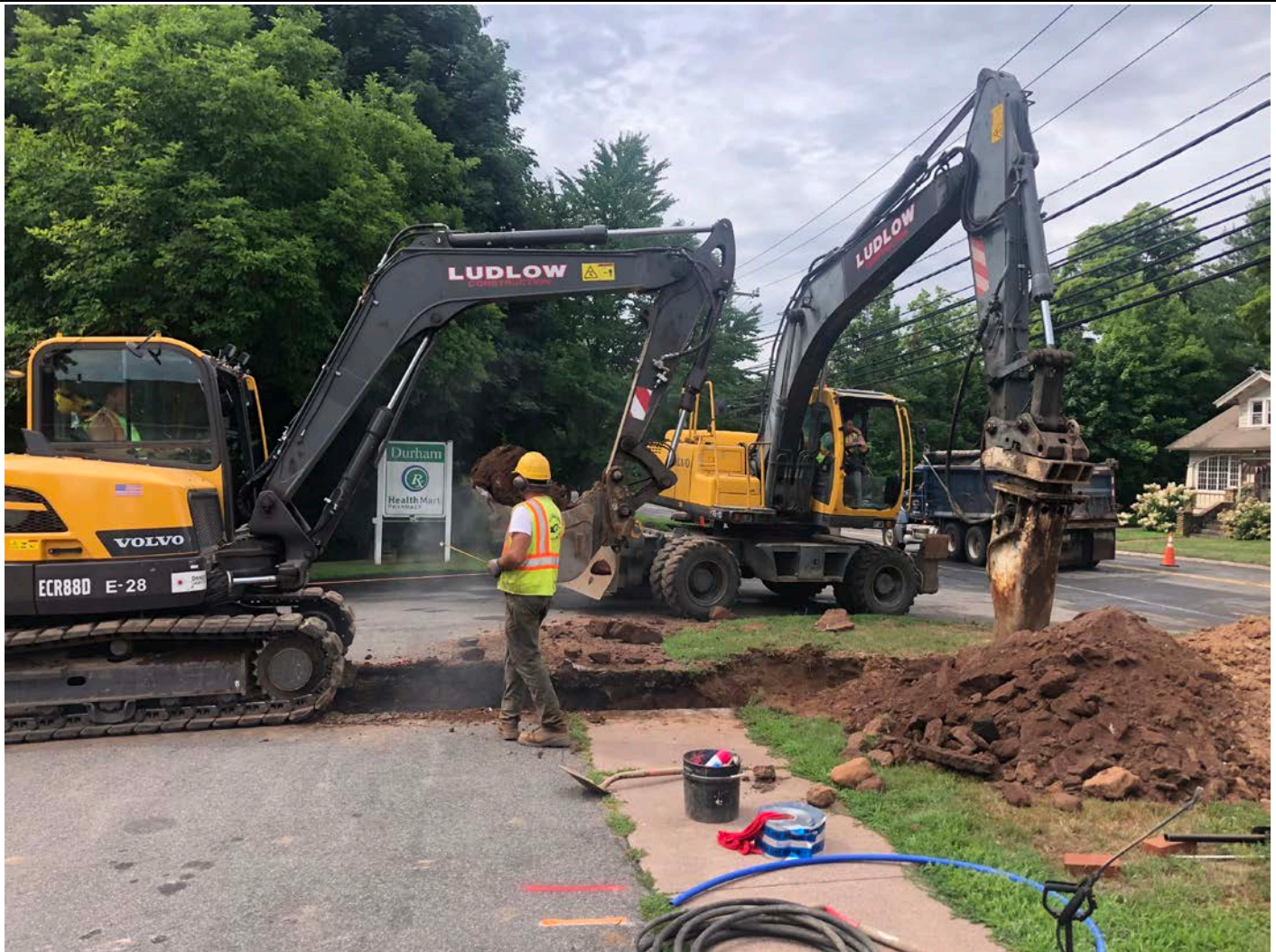
Picture 2: Ludlow hammering rock at Station 176+03. Main Street, Durham. View to the south.