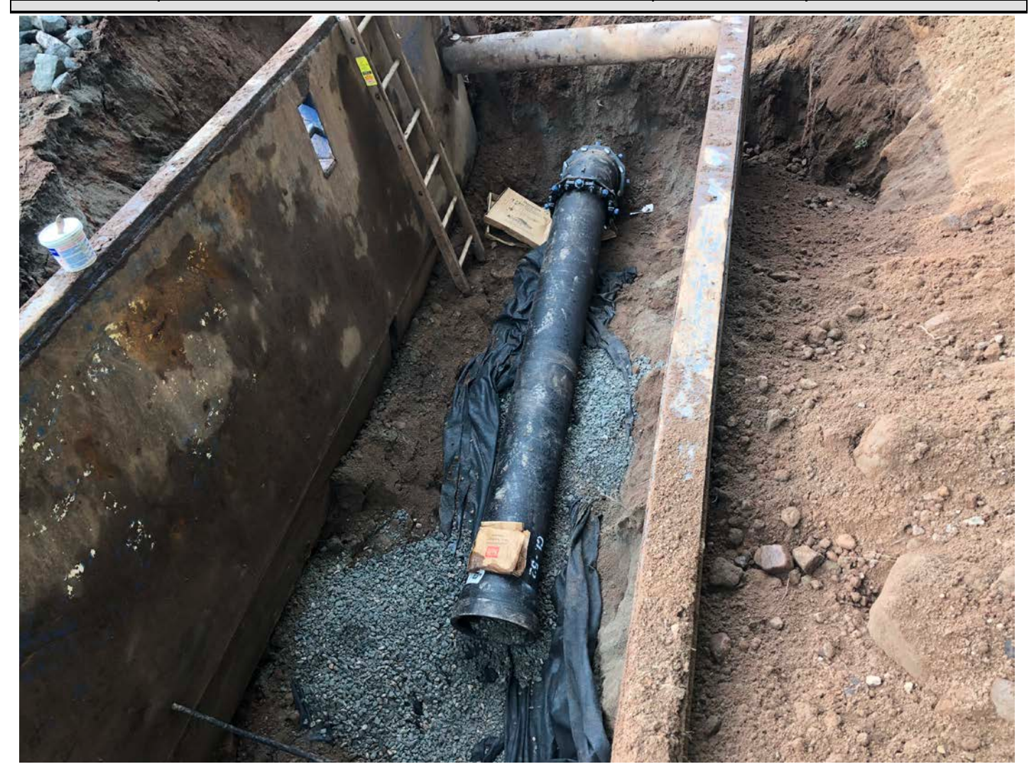
Picture 1: 9' section of 12" DIP and 45° bend that Ludlow installed on the north side of the Hersig Brook stream crossing. Pickett Lane, Durham; Station ~532+00.

July 20, 2020 Project: Durham Meadows Pipeline Installation Date: Monday Day of Week: Location: Pickett Lane, Main Street, and the Shared Access Driveway Report No: 123 Project #: AECOM: 6061487 Contractor: Ludlow Construction Page: 4 of 10