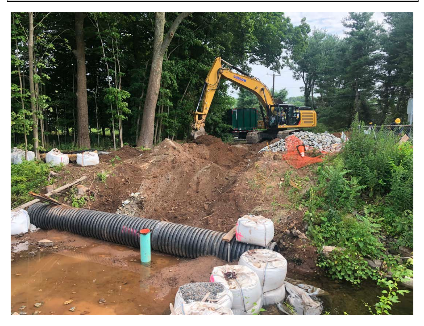
Picture 7: Ludlow backfilling trench on the north bank of Hersig Brook after the installation of 12" DIP. Pickett Lane, Durham; Station ~532+00. View to the northeast.