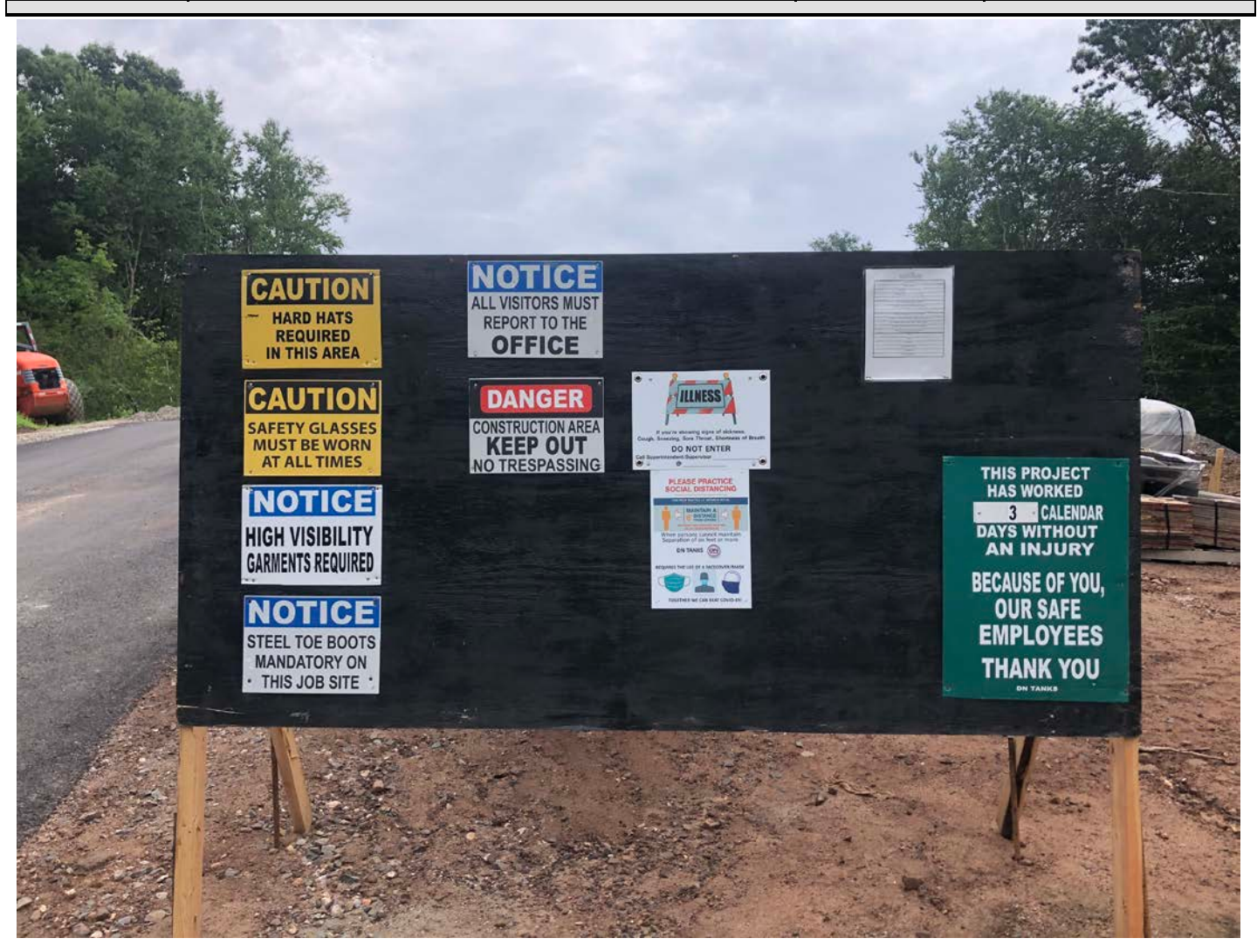
Picture 4: Sign board erected by DN Tanks on the Shared Access Driveway leading up to the water tank footprint. Middletown; view to the east.

Project: Durham Meadows Pipeline Installation Date: July 20, 2020 Day of Week: Monday Location: Pickett Lane, Main Street, and the Shared Access Driveway Report No: 123 Project #: AECOM: 6061487 Contractor: Ludlow Construction Page: 7 of 10