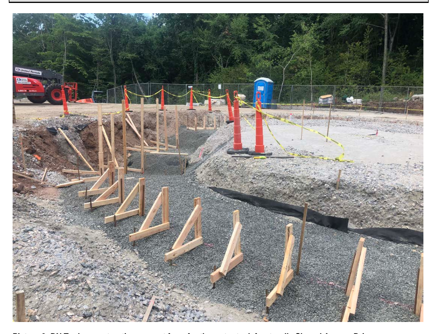
Picture 6: DN Tanks constructing cement form for the water tank frost wall. Shared Access Driveway, Middletown. View to the north.