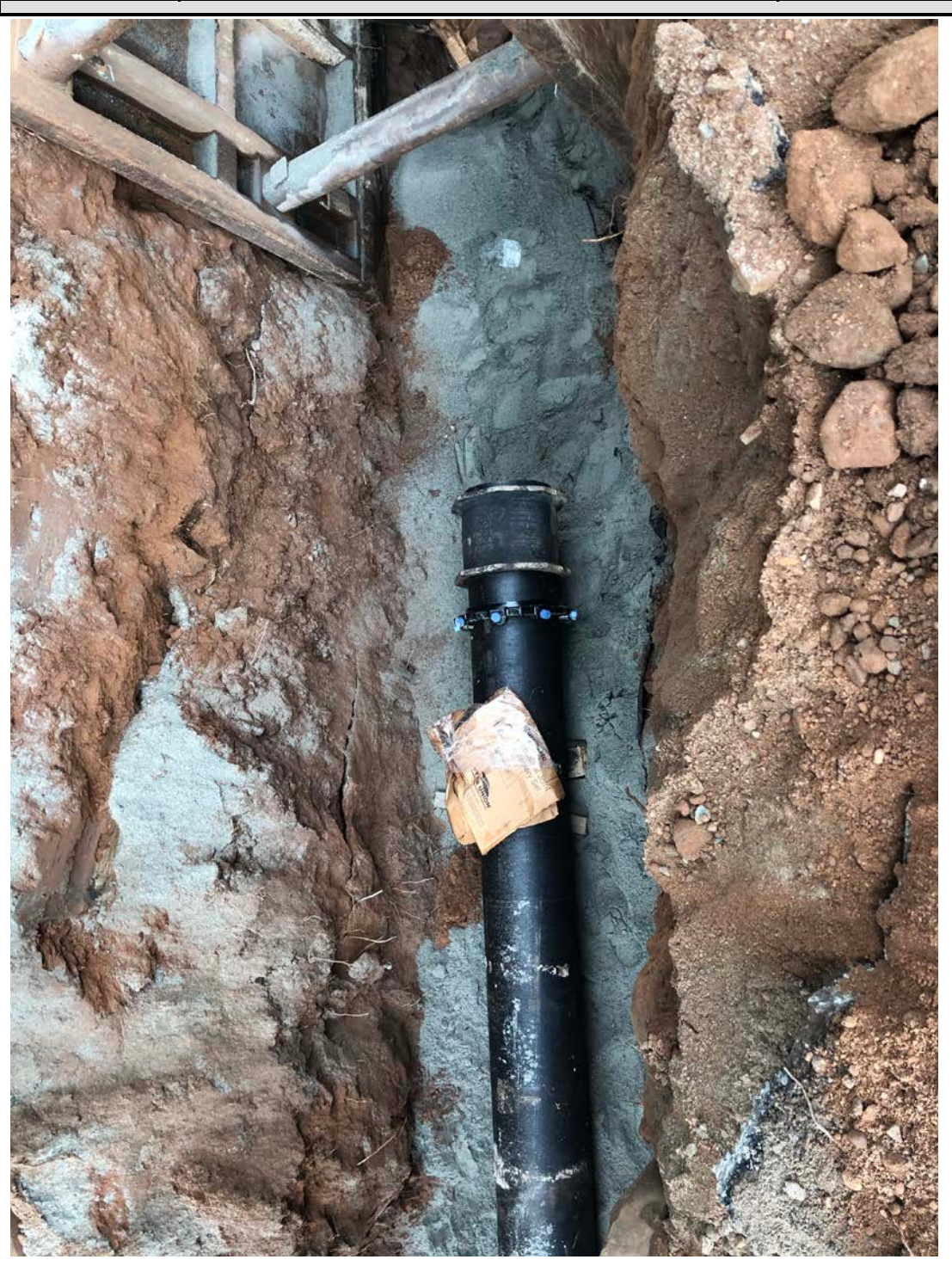
Picture 2: 20' section of 12" DIP and a female-female 12" DIP sleeve that Ludlow installed on the north side of the Hersig Brook stream crossing. Pickett Lane, Durham; Station ~532+00.