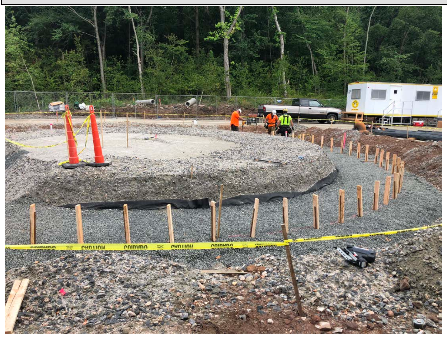
Picture 5: DN Tanks constructing cement form for the water tank frost wall. Shared Access Driveway, Middletown. View to the northeast.

Project: Date: July 20, 2020 Durham Meadows Pipeline Installation Monday Day of Week: Location: Pickett Lane, Main Street, and the Shared Access Driveway Report No: 123 Project #: AECOM: 6061487 Contractor: Ludlow Construction Page: 8 of 10