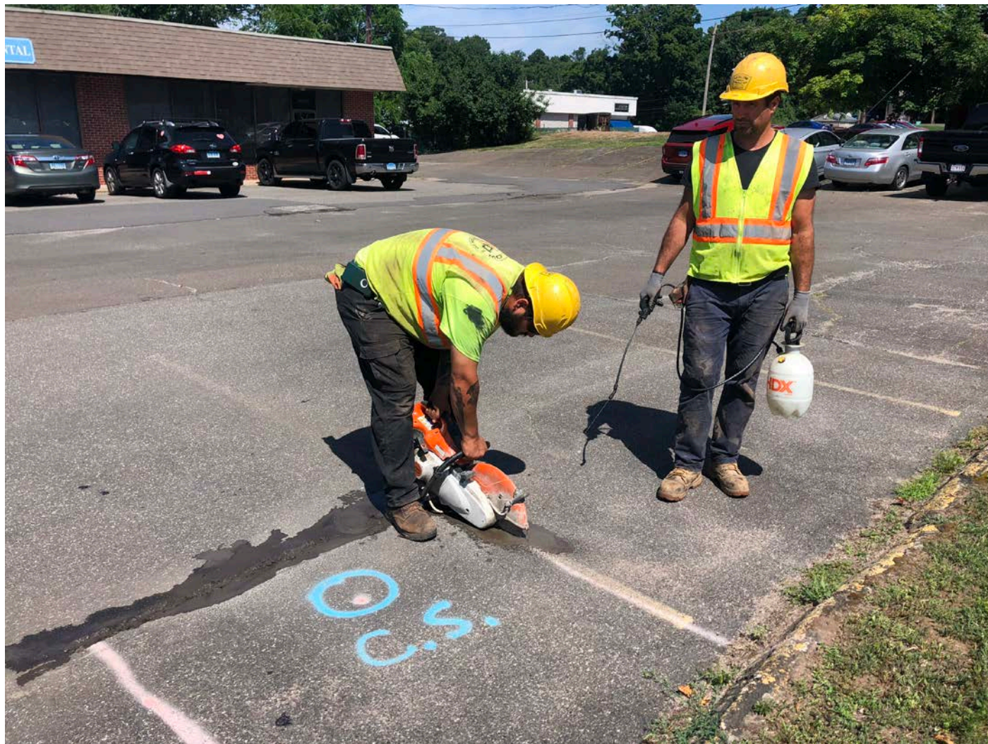
Picture 2: Ludlow saw cutting pavement at 360 Main Street for the installation of a curb stop at Station 169+70. View to the northwest.