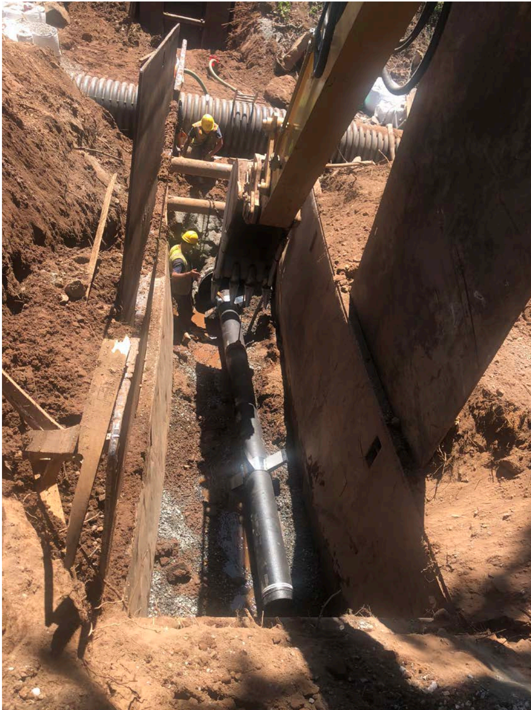
Picture 7: Ludlow sliding 12" DIP into the 36" conduit at the Hersig Brook stream crossing. Station ~532+00, Pickett Lane, Durham. View to the south.