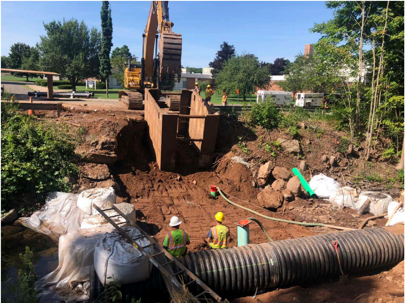
Picture 4: Work zone at the Hersig Brook stream crossing. Ludlow has backfilled over the 36" conduit that the 12" DIP will be placed inside of. Station ~532+00, Pickett Lane, Durham. View is to the south.