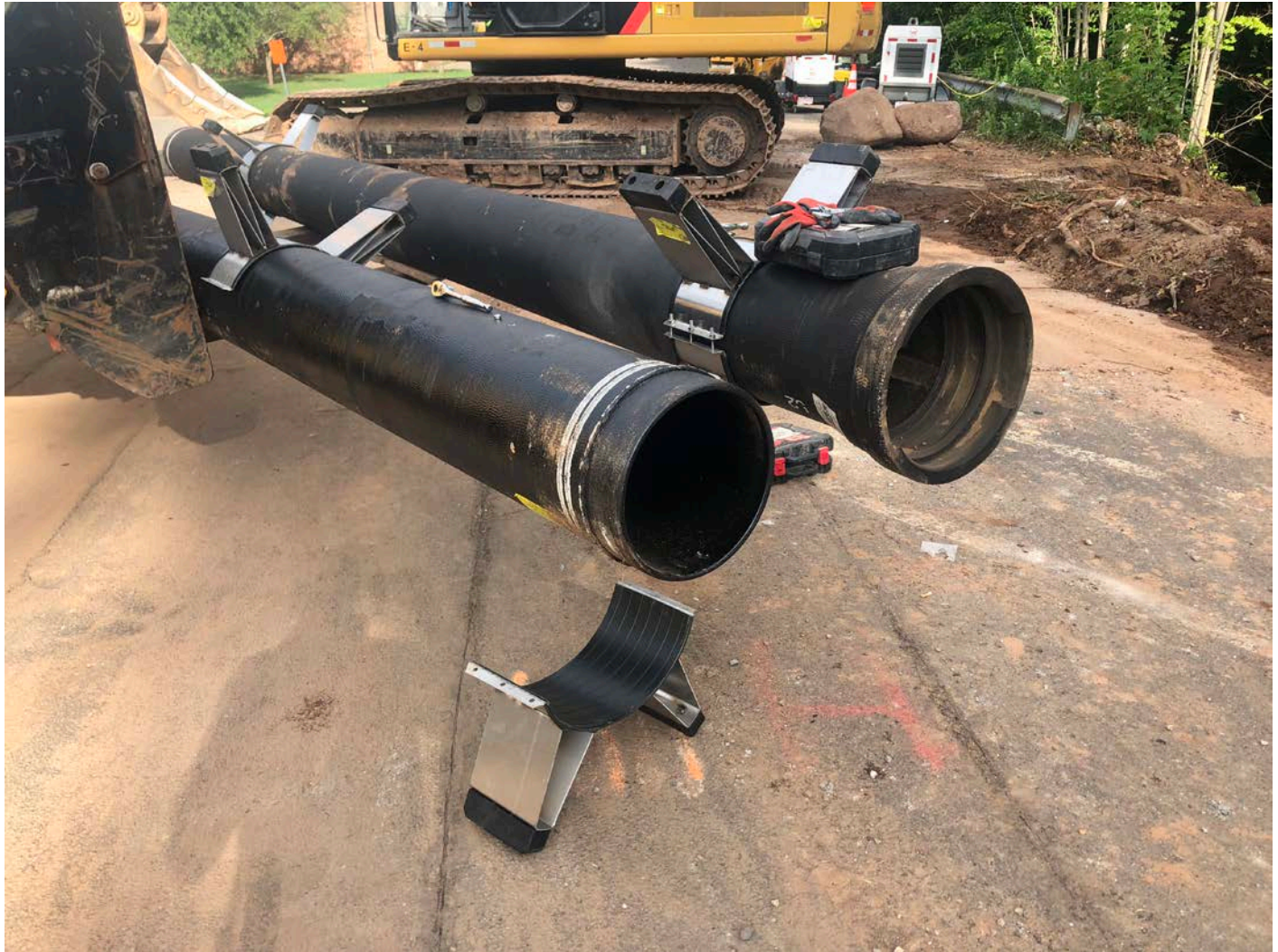
Picture 6: Casing spacers attached to the 12" DIP that Ludlow will slide into the 36" conduit at the Hersig Brook stream crossing. Station ~532+00, Pickett Lane, Durham.