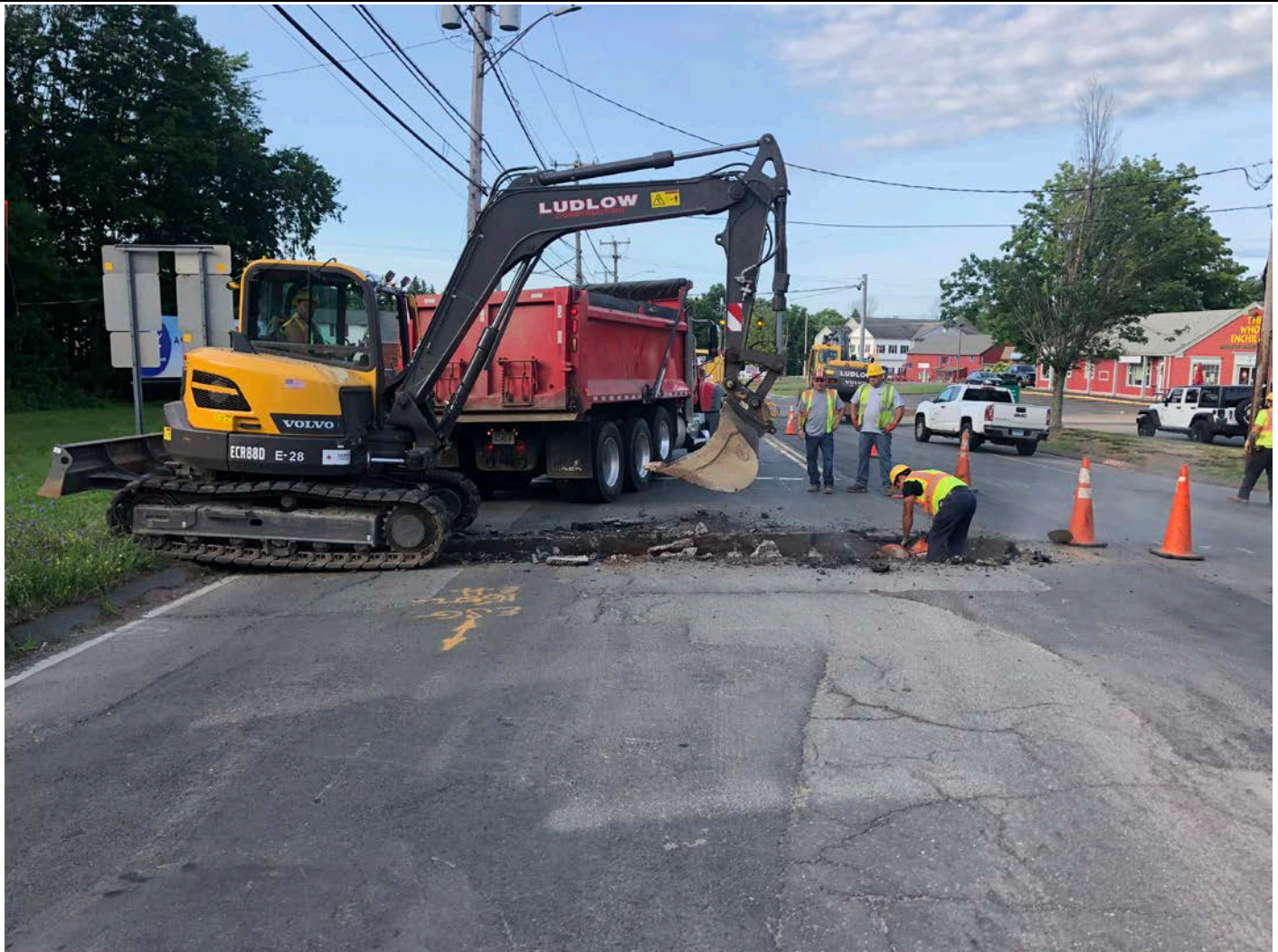
Picture 1: Ludlow begins to excavate across the northbound lane of Main Street to install a curb stop at Station 164+48. View to the south.