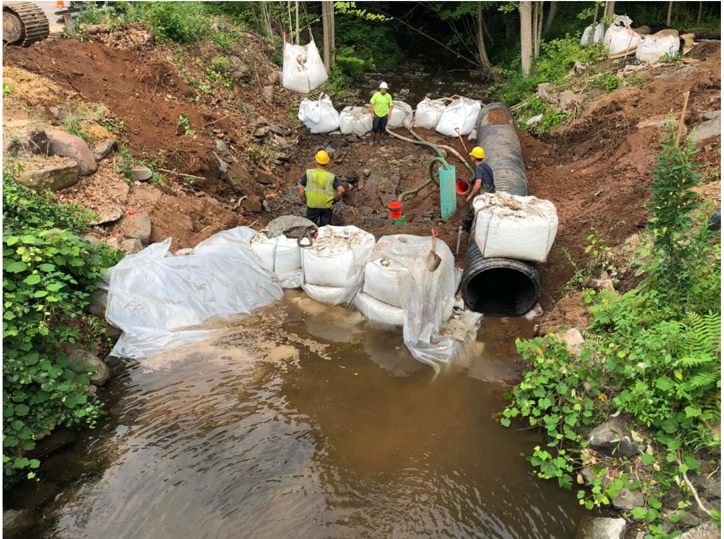
Picture 2: Work zone at the Hersig Brook stream crossing after Ludlow moved the stream flow bypass culvert to the north bank of the brook. Pickett Lane, Durham. Station ~532+00. View to the west.