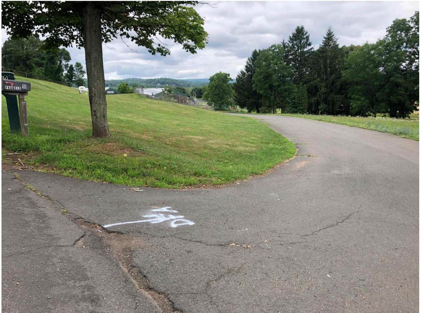
Picture 3: New location for Durham Fair Association 8" water service. Station ~900+80, Maple Avenue, Durham. View to the southwest.