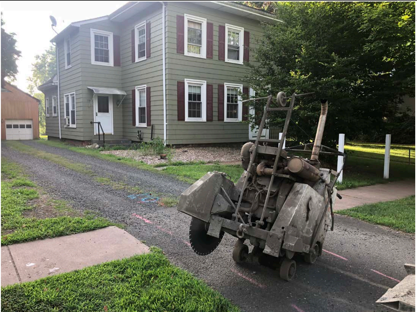
Picture 1: Ludlow staged to begin saw cutting pavement on the driveway of 303 Main Street in Durham at Station 179+49. View is to the southeast.