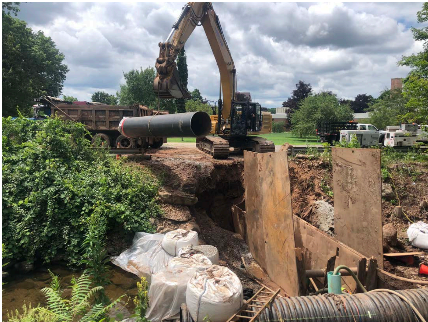
Picture 8: Ludlow placing 36" pipe sleeve in the bed of Hersig Brook. View to the south. Pickett Lane, Durham. Station ~532+00.