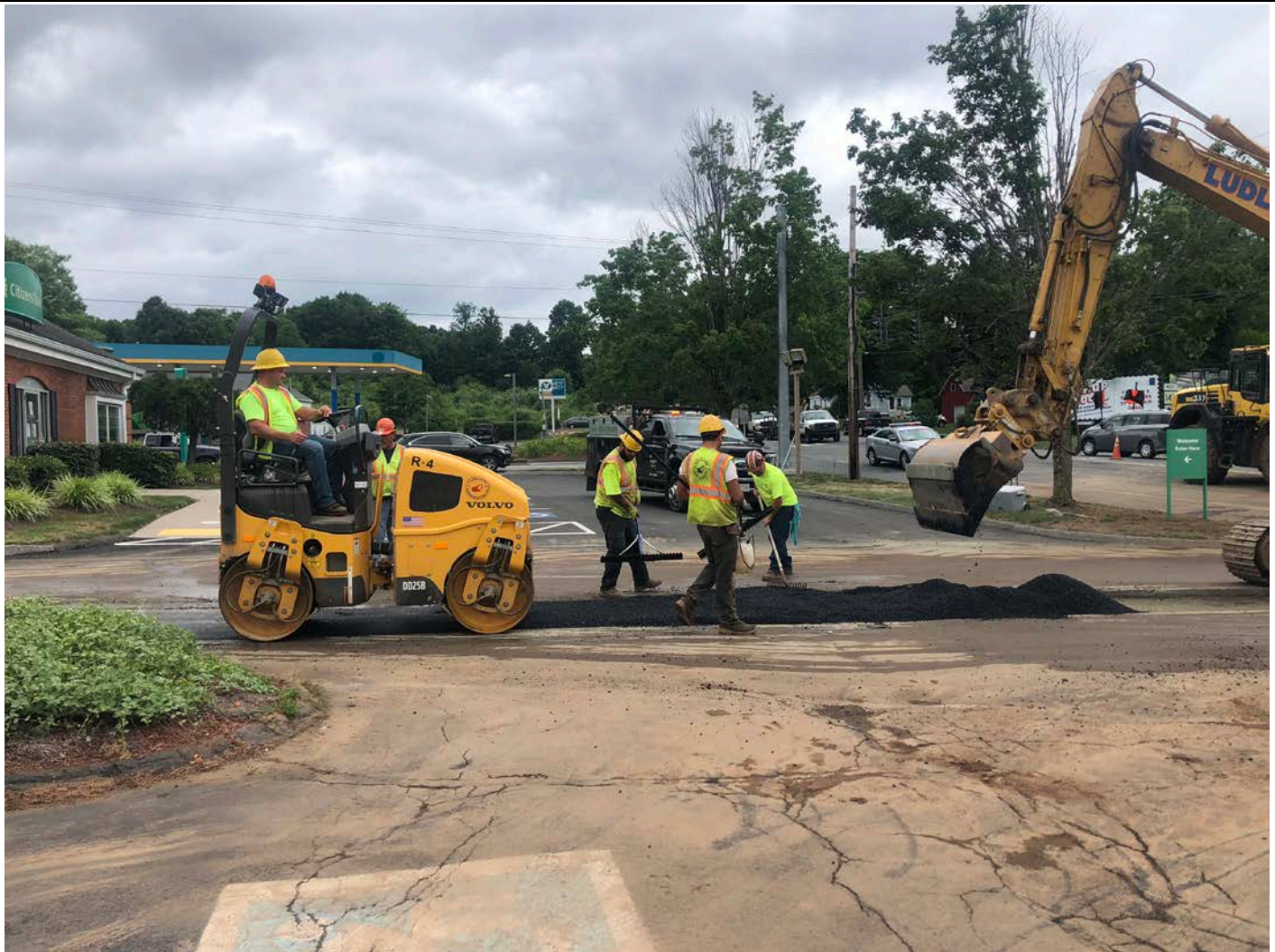
Picture 6: Ludlow placing and rolling hot patch to close up trench at Station 165+58. View is to the north. 370 and 376 Main Street, Durham.