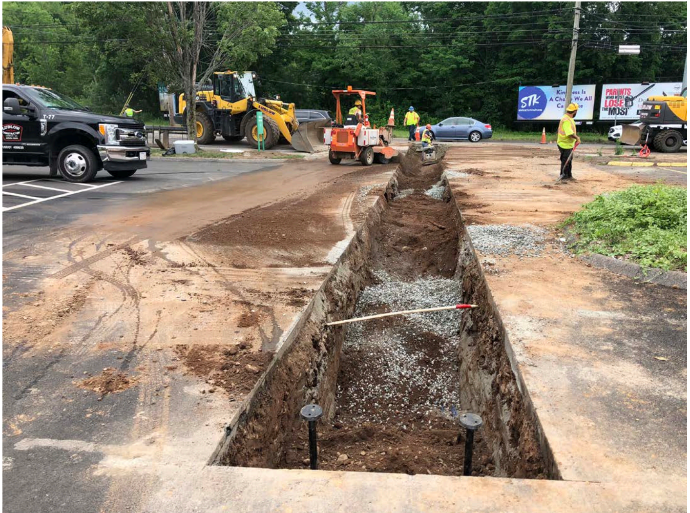
Picture 4: Two curb stops installed at Station 165+58; servicing 370 and 376 Main Street, Durham. View is to the east.