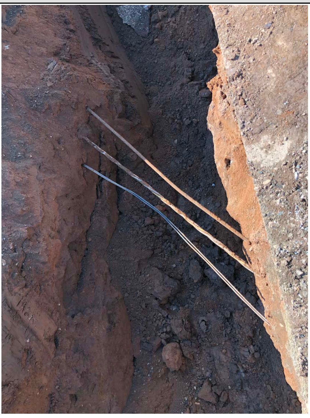
Picture 3: Subsurface utilities daylighted by Ludlow as they excavated near Station 512+00 while installing 12" DIP. Pickett Lane, Durham.

Project: Date: July 13, 2020 Durham Meadows Pipeline Installation Day of Week: Monday Location: Pickett Lane and Main Street, Durham Report No: 118 Project #: AECOM: 6061487 Contractor: Ludlow Construction Page: 6 of 9