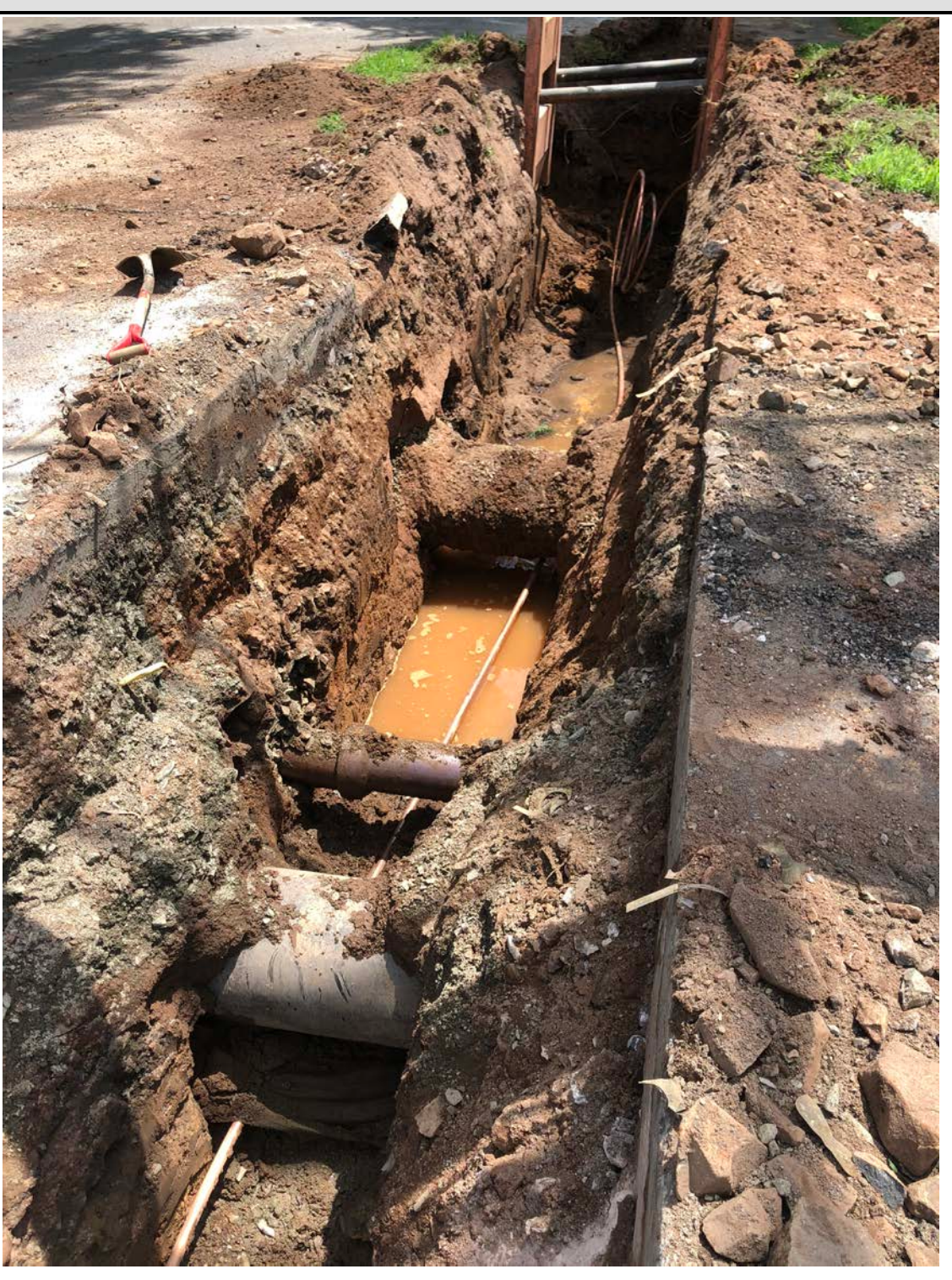
Picture 5: Water observed in trench as Ludlow installed a corporation stop and a curb stop at Station 163+01. Main Street, Durham. View to the east.

Project: Date: July 13, 2020 Durham Meadows Pipeline Installation Day of Week: Monday Location: Pickett Lane and Main Street, Durham Report No: 118 Project #: AECOM: 6061487 Contractor: Ludlow Construction Page: 8 of 9