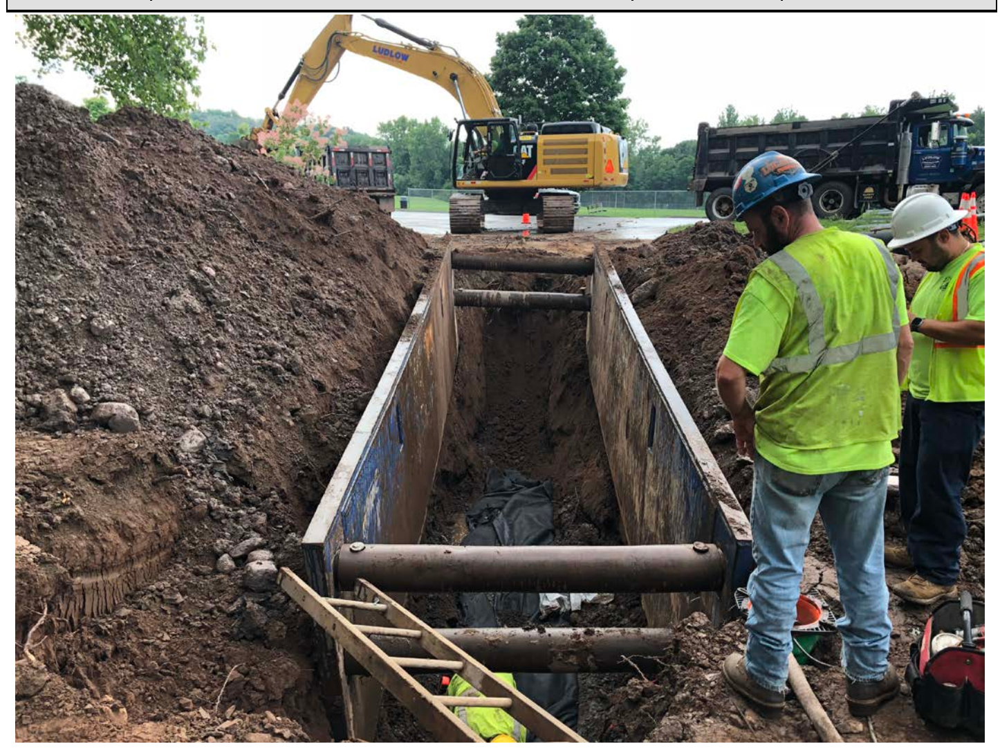
Picture 1: Ludlow installing 12" DIP to the east of Allyn Brook. They are placing the next 20' section in the direction of Pickett Lane, which can be seen in the background. View is to the southeast, looking towards Station 512+00.

July 13, 2020 Date: Project: Durham Meadows Pipeline Installation Day of Week: Monday Location: Pickett Lane and Main Street, Durham Report No: 118 Project #: AECOM: 6061487 Contractor: Ludlow Construction Page: 4 of 9