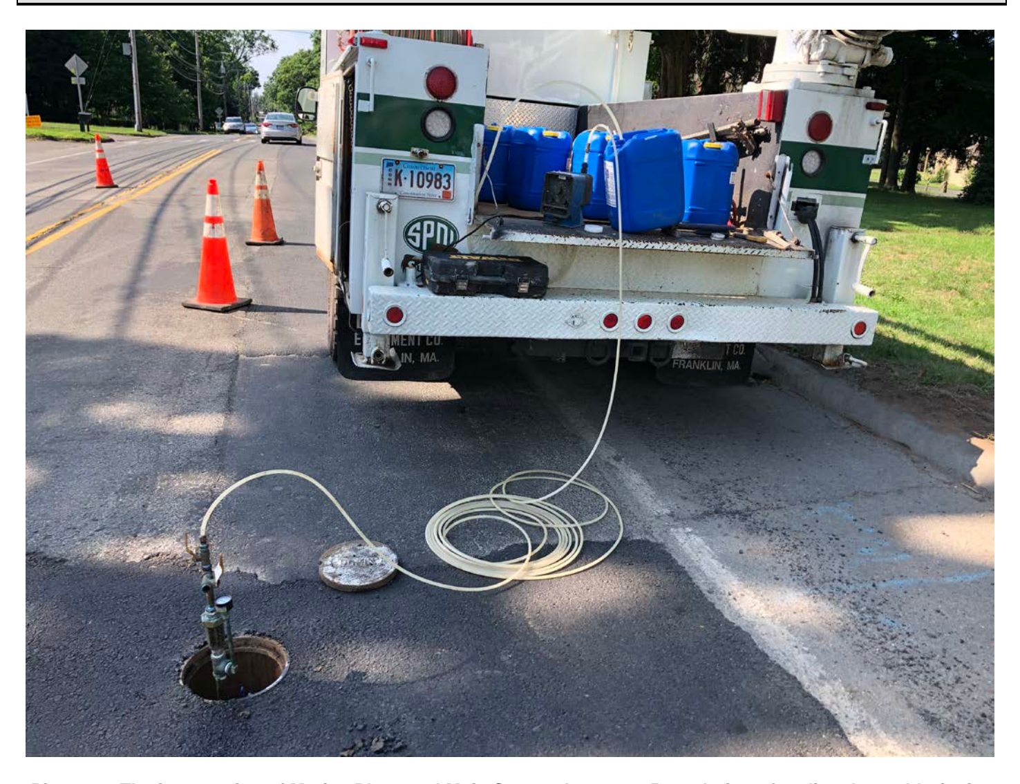
Picture 4: The intersection of Marina Place and Main Street where a 12.5% solution of sodium hypochlorite is introduced into the Main Street water line as part of chlorination activities. View to the south.

July 13, 2020 Durham Meadows Pipeline Installation Date: Project: Day of Week: Monday Location: Pickett Lane and Main Street, Durham Report No: 118 Project #: AECOM: 6061487 Contractor: Ludlow Construction Page: 7 of 9