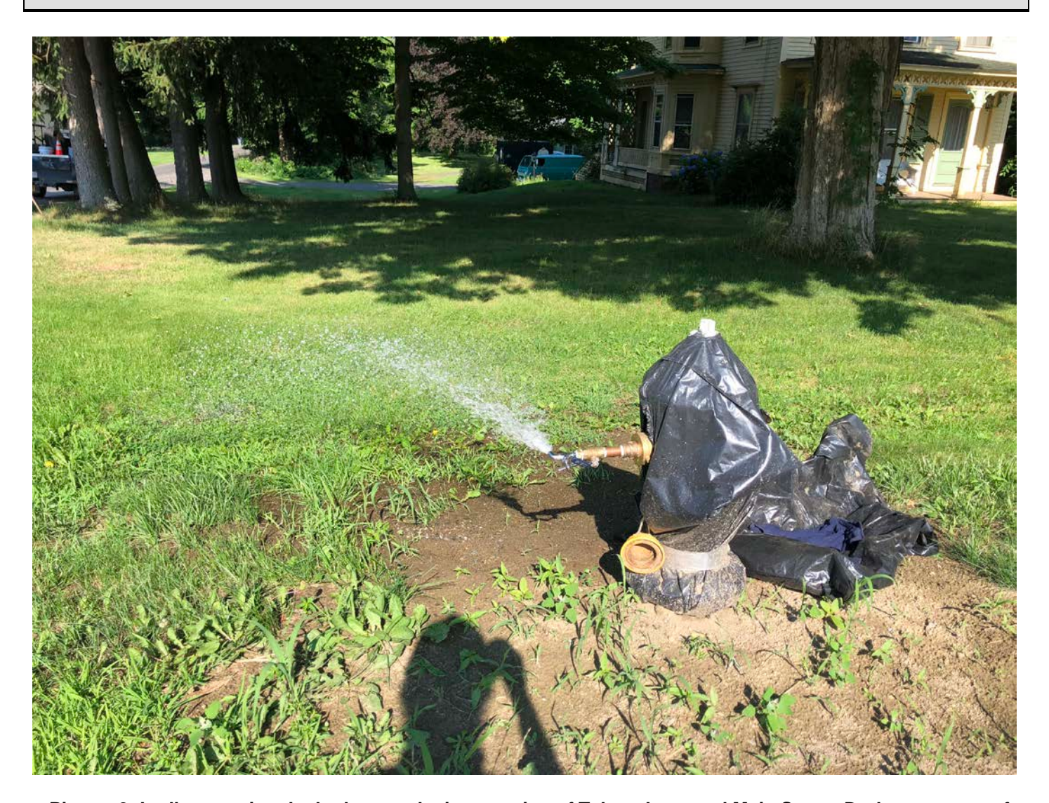
Picture 2: Ludlow venting the hydrant at the intersection of Talcott Lane and Main Street, Durham, as part of water line chlorination activities. View to the northwest.

Date: July 13, 2020 Project: Durham Meadows Pipeline Installation Day of Week: Monday Location: Pickett Lane and Main Street, Durham Report No: 118 Project #: AECOM: 6061487 Contractor: Ludlow Construction Page: 5 of 9