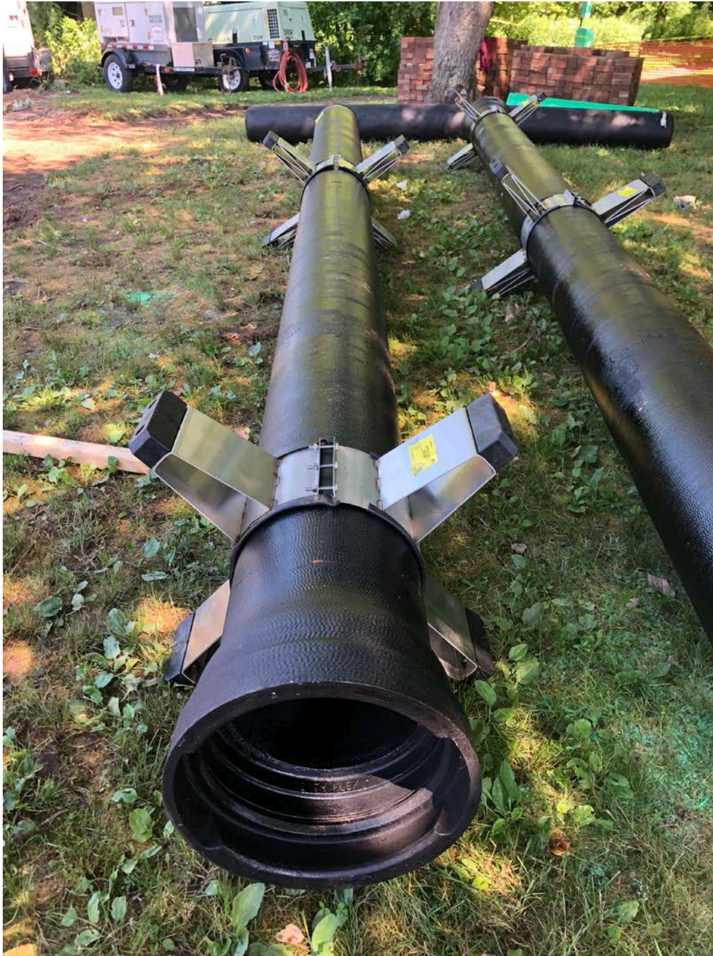
Picture 10: Spacers placed around 12" DIP for insertion into the 36" conduit Ludlow has placed beneath the stream bed of Allyn Brook at Station ~511+00. Pickett Lane, Durham.