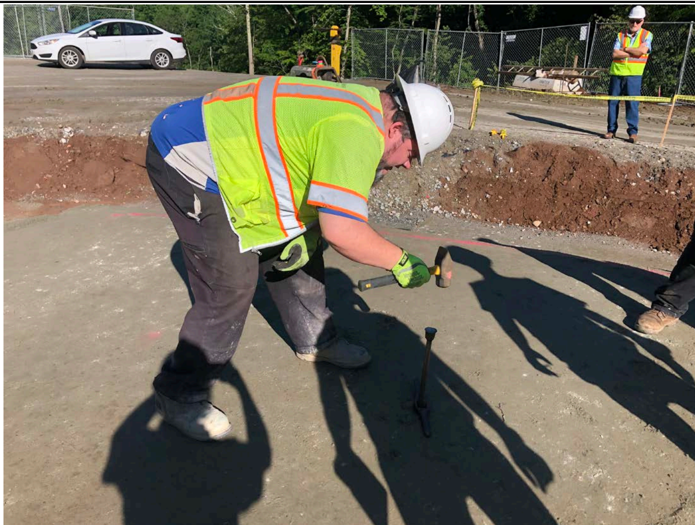
Picture 6: JTC preparing to collect soil compaction data at the water tank footprint at the Shared Access Driveway, Middletown, Durham. View to the west.