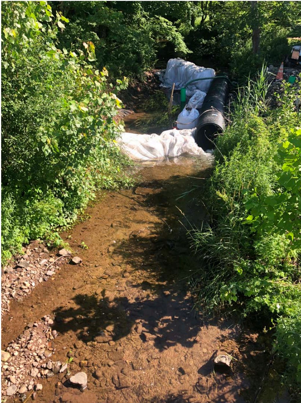
Picture 7: Stream crossing work zone at Allyn Brook at Station ~511+00. Pickett Lane, Durham. View to the north.