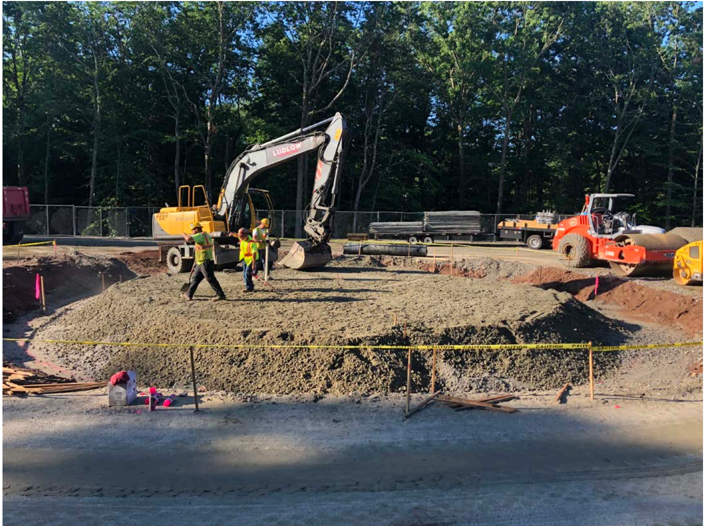
Picture 2: Ludlow placing structural fill at the water tank footprint on the Shared Access Driveway, Middletown, Durham. View to the south.