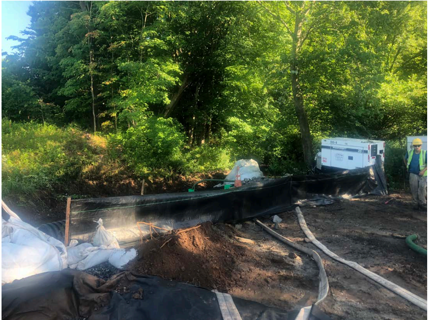
Picture 5: Silt fence installed along the east side of Allyn Brook at Station ~511+00. Pickett Lane, Durham. View to the northwest.