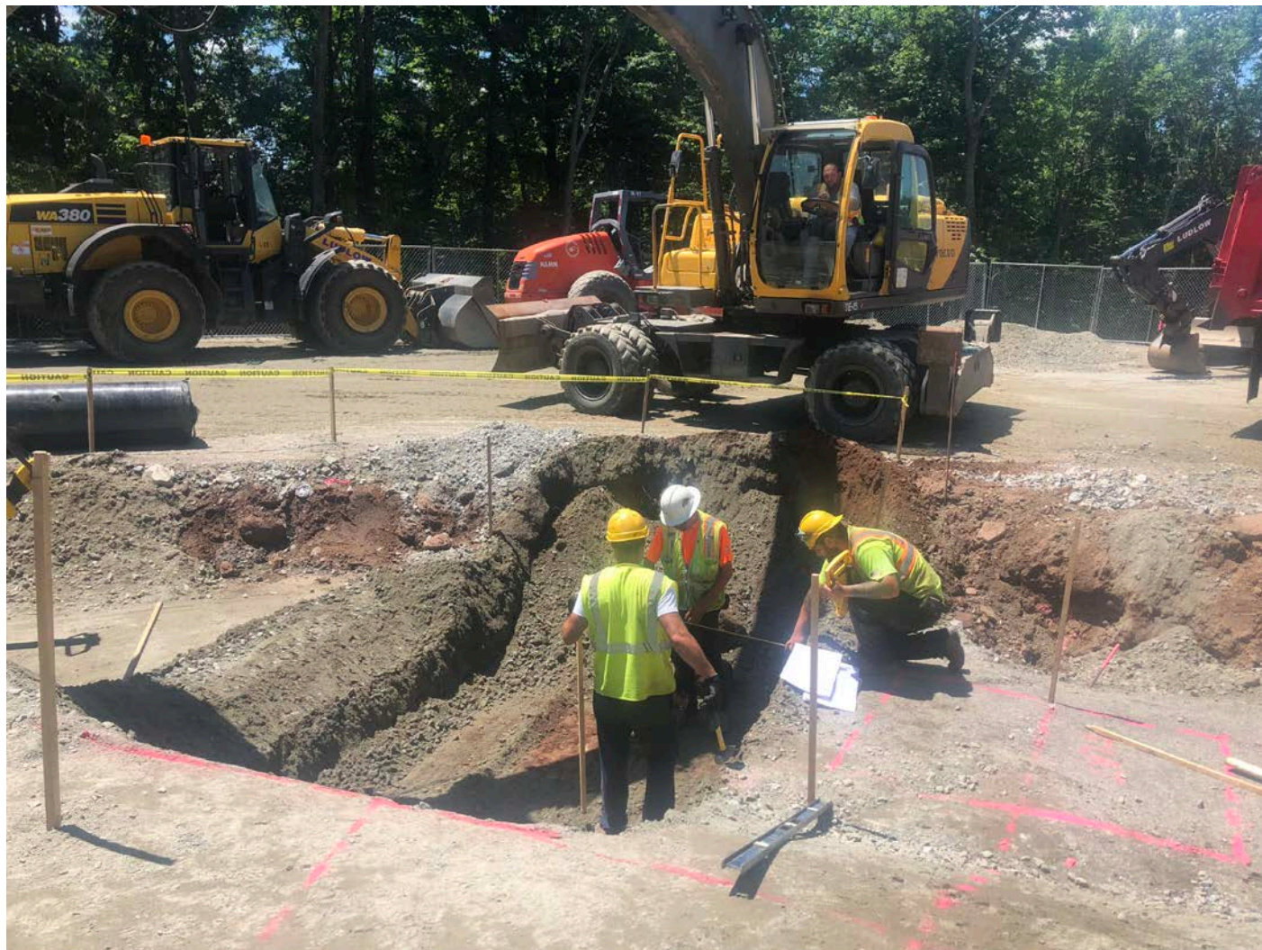
Picture 12: Ludlow excavating trench for the placement the water tank supply pipe at the water tank footprint. Shared Access Driveway, Middletown. View to the southwest.