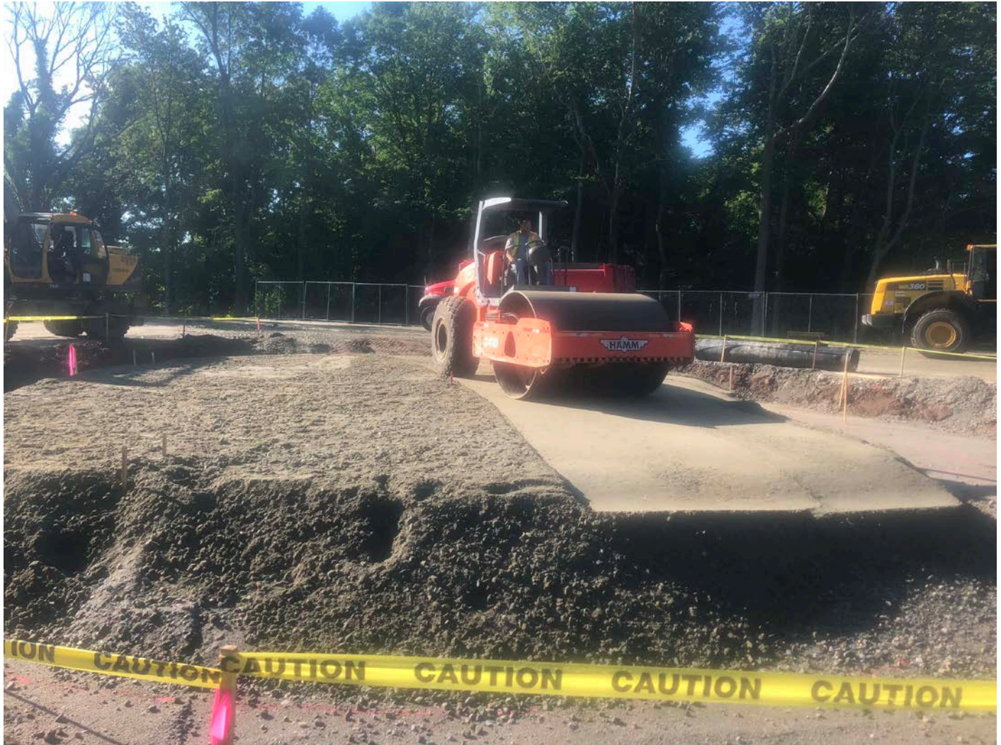
Picture 3: Ludlow compacting structural fill at the water tank footprint on the Shared Access Driveway, Middletown, Durham. View to the south.