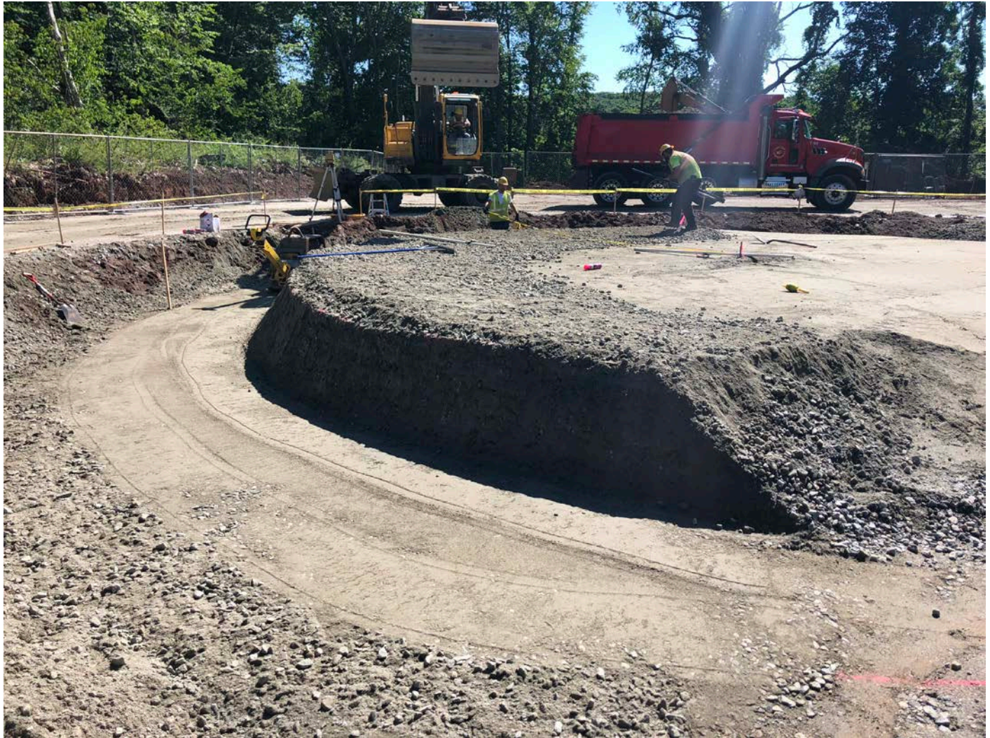
Picture 8: Ludlow shaping soils at elevation 437 and 439.67 at the water tank footprint. Shared Access Driveway, Middletown. View to the east.