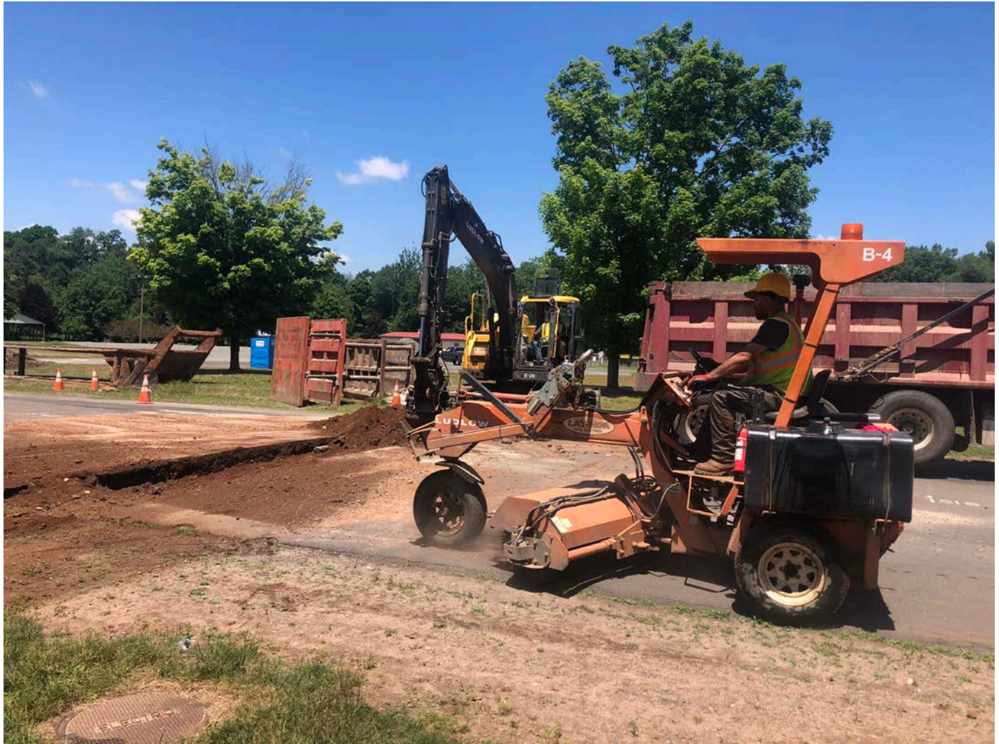
Picture 13: Ludlow cleaning up work zone at Station 517+75. Pickett Lane, Durham. View to the southeast.