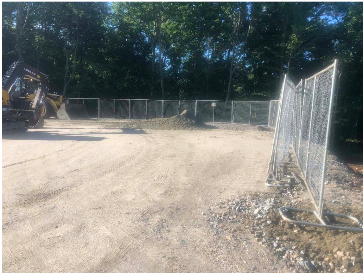
Picture 4: Temporary fencing erected around the water tank footprint at the Shared Access Driveway, Middletown, Durham. View to the south.