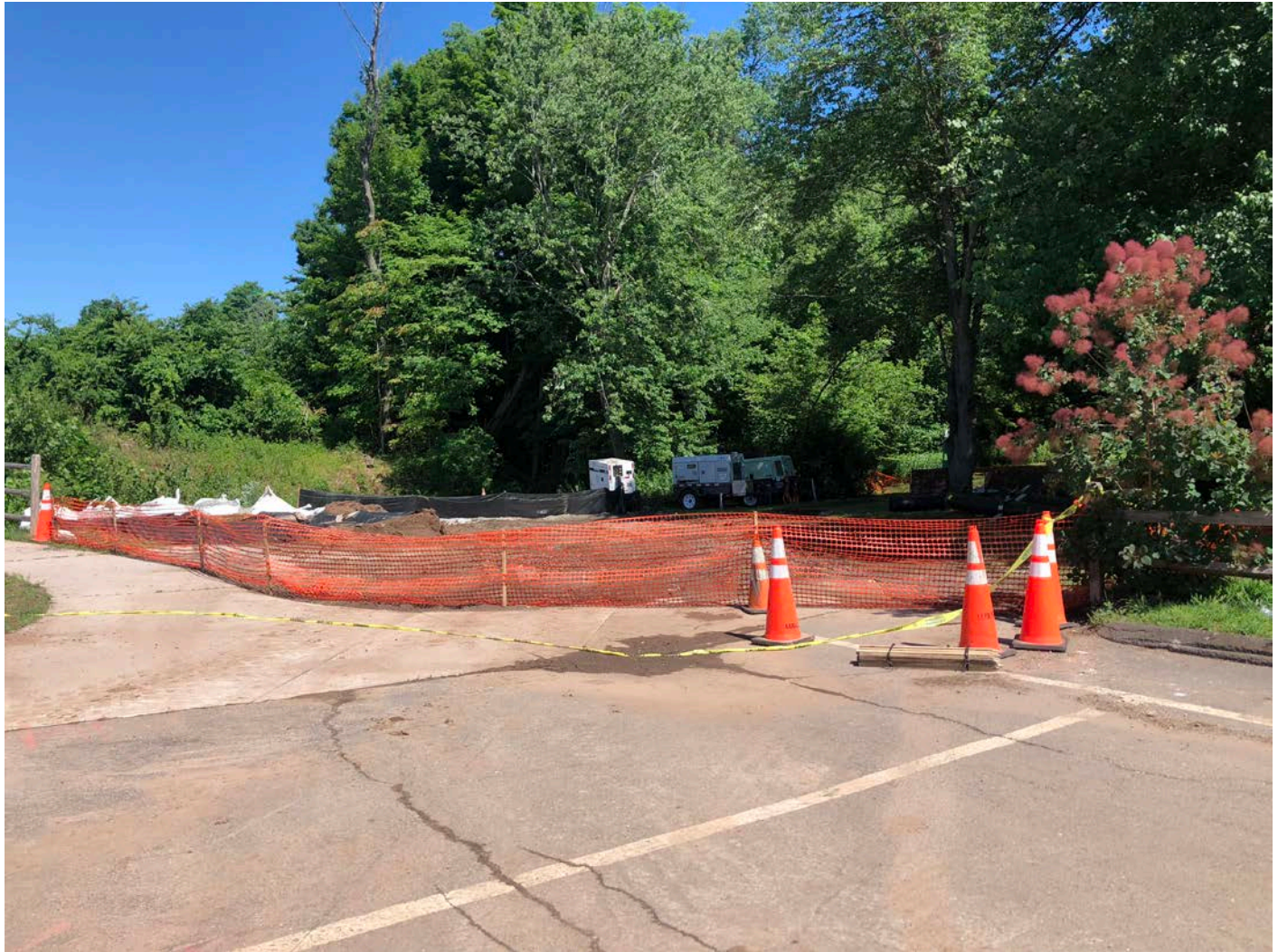
Picture 9: Snow fence placed around work zone on the east side of Allyn Brook at Station ~511+00. Pickett Lane, Durham. View to the northwest.