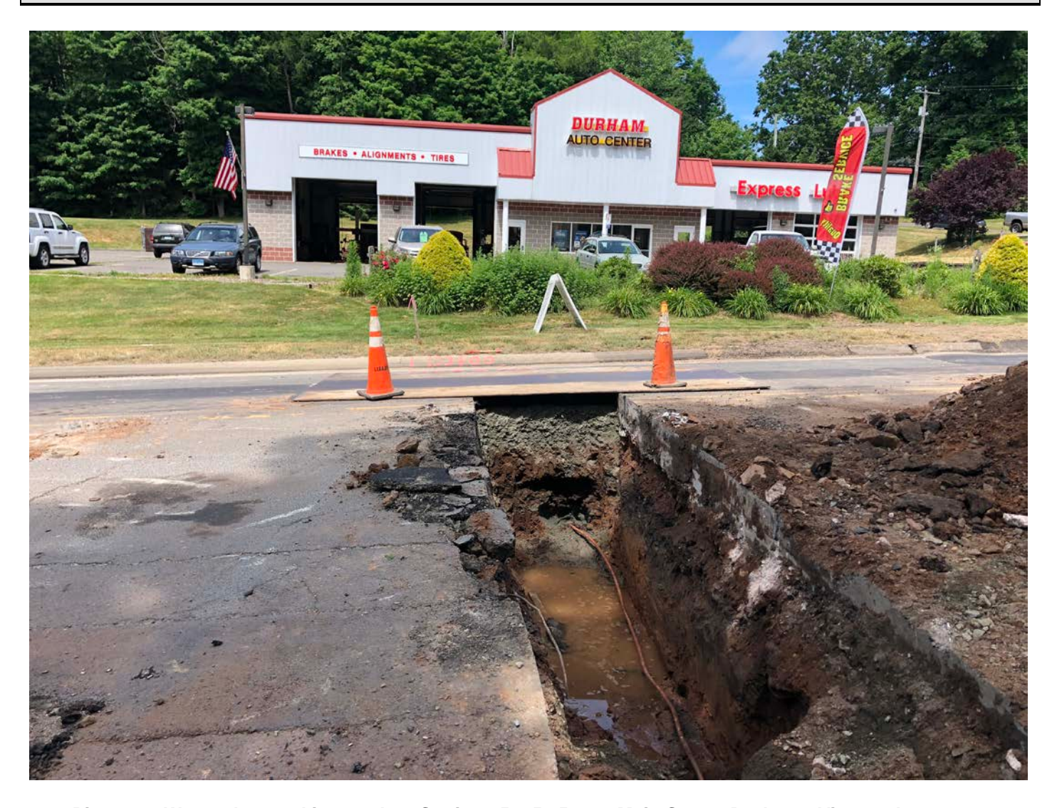
Picture 3: Water observed in trench at Station 153+57.5; 431 Main Street, Durham. View to the west.

Project: Date: June 18, 2020 Durham Meadows Pipeline Installation Location: Day of Week: Thursday Maiden Lane, Main Street, and Route 68, Durham Report No: 101 Project #: AECOM: 6061487 Contractor: Ludlow Construction Page: 6 of 7