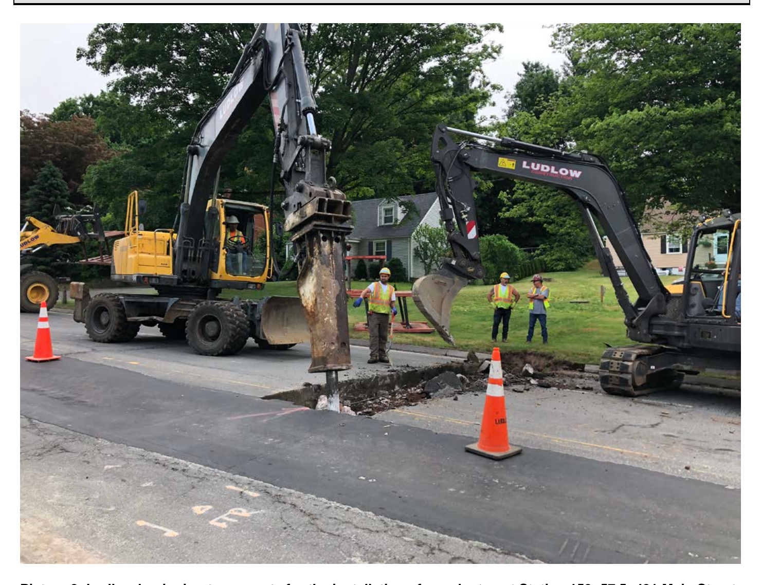
Picture 2: Ludlow beginning to excavate for the installation of a curb stop at Station 153+57.5; 431 Main Street, Durham. View to the east.

Date: June 18, 2020 Project: Durham Meadows Pipeline Installation Location: Day of Week: Thursday Maiden Lane, Main Street, and Route 68, Durham Report No: 101 Project #: AECOM: 6061487 Contractor: Ludlow Construction Page: 5 of 7