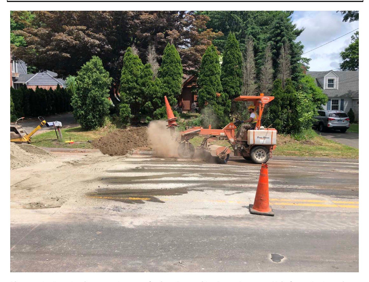
Picture 4: Ludlow cleaning up work zone at Station 151+69 with a Bocce Broom on Main Street, Durham after the installation of a curb stop. View to the east.

Date: June 18, 2020 Project: Durham Meadows Pipeline Installation Day of Week: Thursday Location: Maiden Lane, Main Street, and Route 68, Durham 101 Report No: Project #: AECOM: 6061487 Contractor: Ludlow Construction Page: 7 of 7