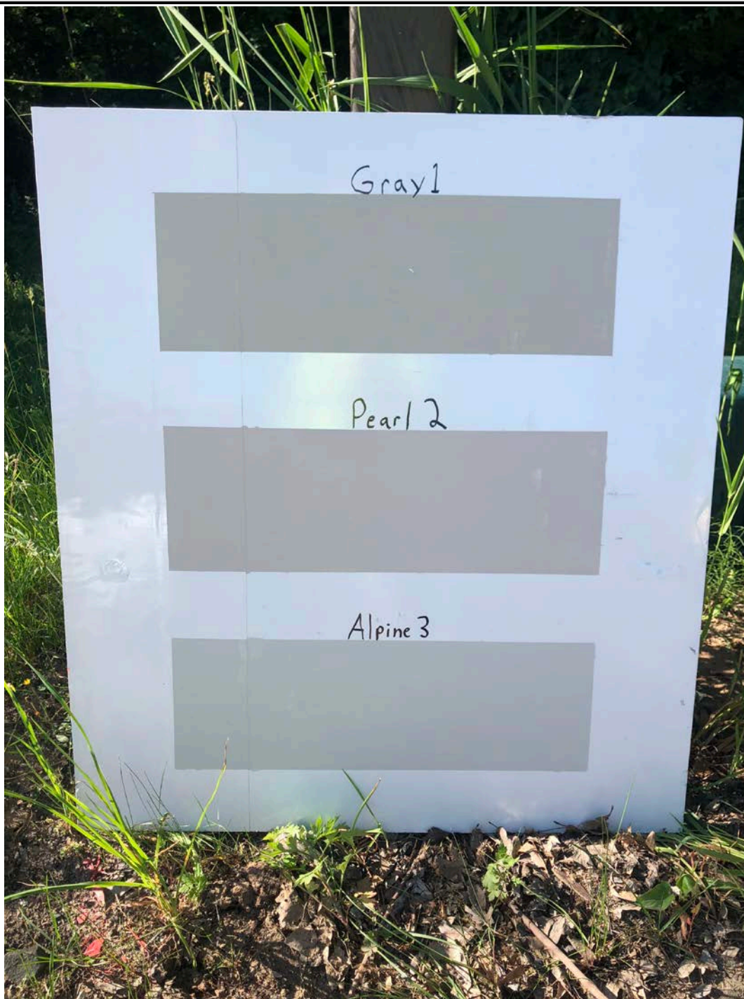
Picture 3: Coating color samples for the water tank that will be installed on the shared access driveway in Middletown.