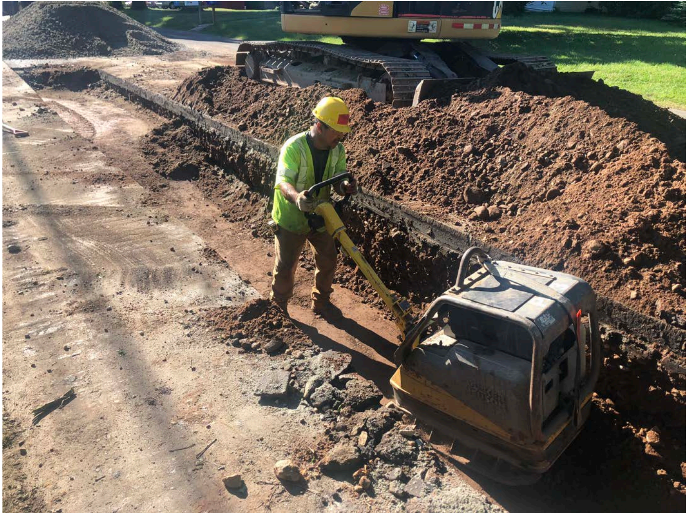
Picture 2: Ludlow compacting fill after the installation of 12" DIP. Maiden Lane, Durham. View to the east.