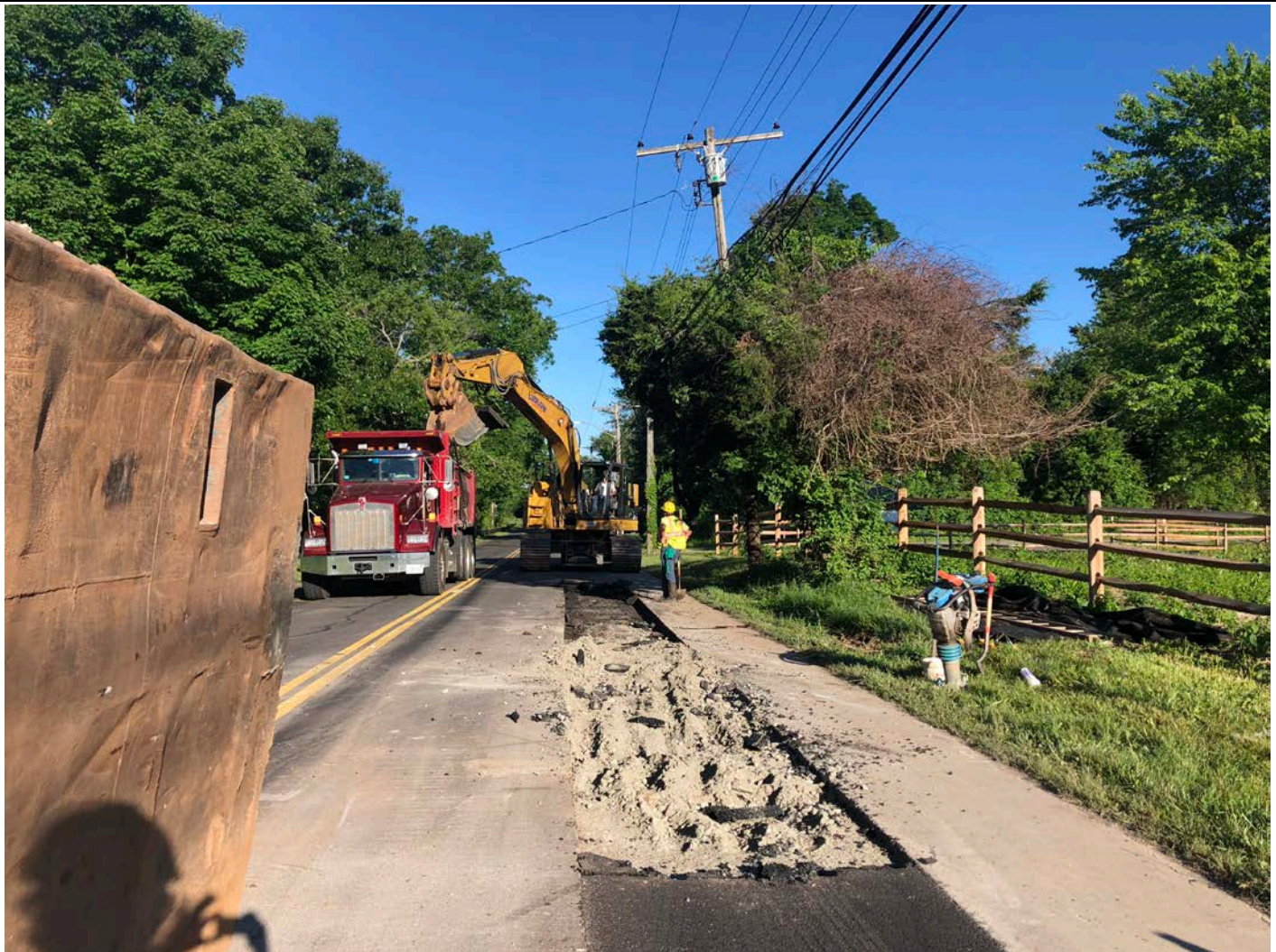
Picture 1: Ludlow begins to excavate Maiden Lane for the placement of 12" DIP, starting at Station 424+00. View to the west.