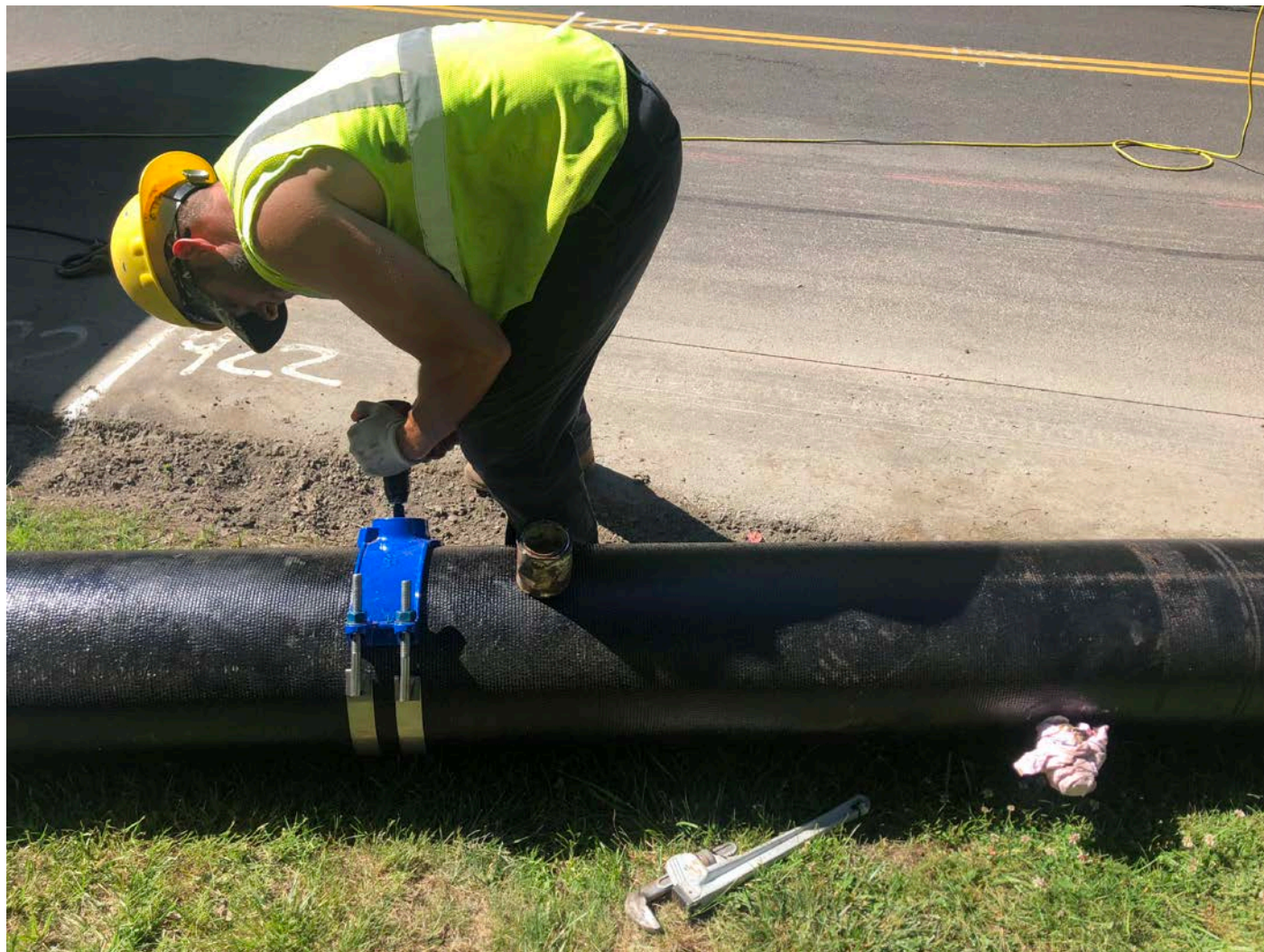
Picture 5: Ludlow tapping 12" DIP for the addition of a 2" corporation stop to be placed at Station 422+50. Maiden Lane, Durham.