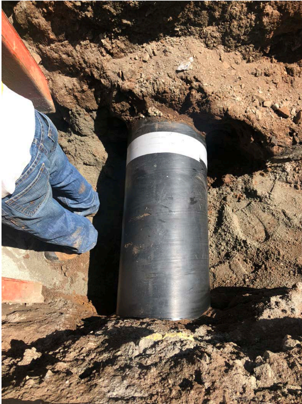
Picture 6: Eversource repairing the pryopex coating with tapecoat tape on the gas line that Ludlow scratched while excavating for the installation of a curb stop at Station 156+63. Main Street, Durham.