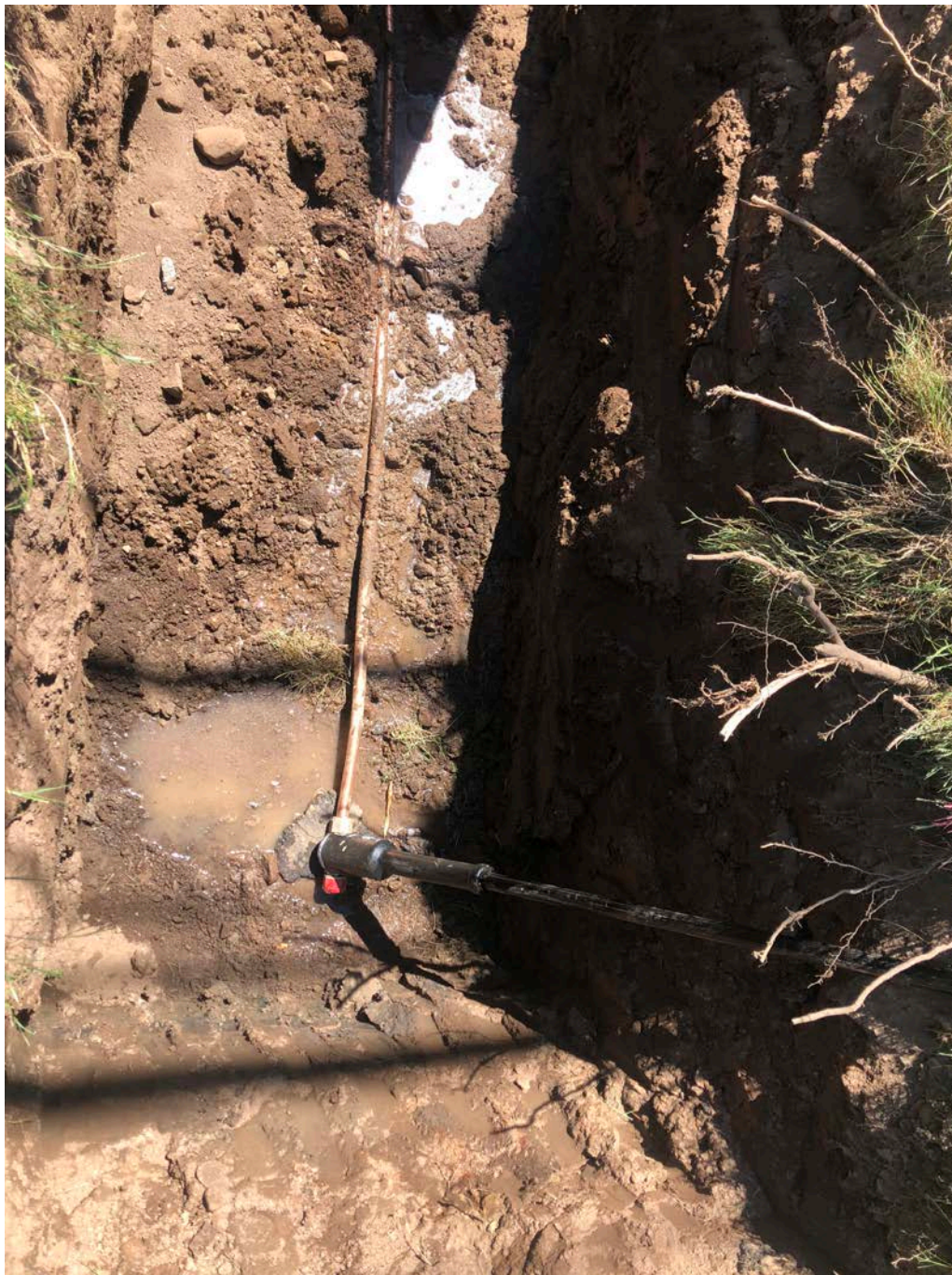
Picture 4: Water observed in trench while excavating for the installation of a curb stop at Station 152+71. Main Street, Durham. View to the west.