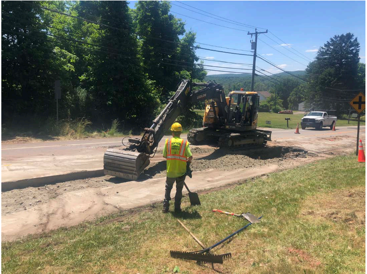
Picture 7: Ludlow grading final lift of fill at the trench on Route 68, Durham. View to the southwest.