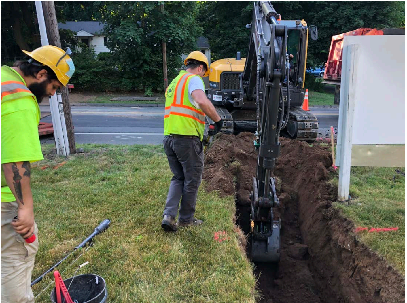
Picture 1: Ludlow excavating on the southbound lane of Main Street at Stations 148+98 to install a curb stop. View to the east.