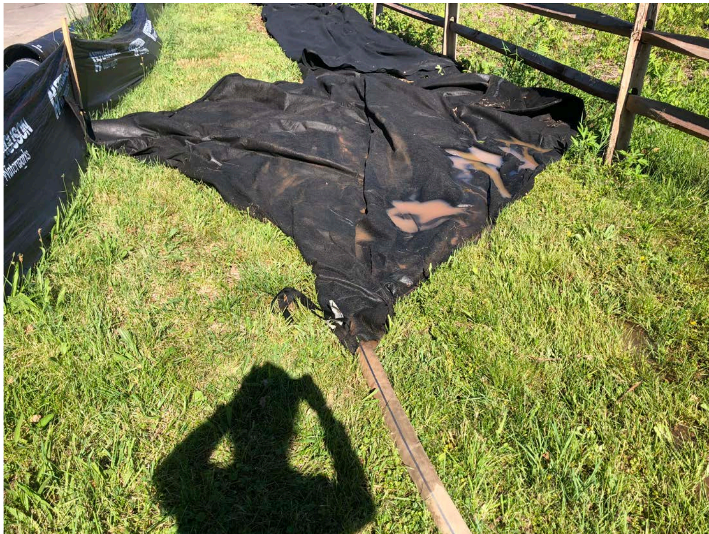
Picture 3: Silt bag used to filter water pumped out of the trench at ~Station 425+90. Maiden Lane; view to the west.