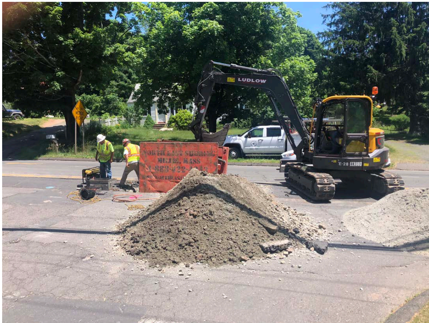
Picture 8: Ludlow excavating to install a 1" chlorination inlet on the main water line at Station 157+64 (the intersection of Winsome Road and Main Street). View to the east.