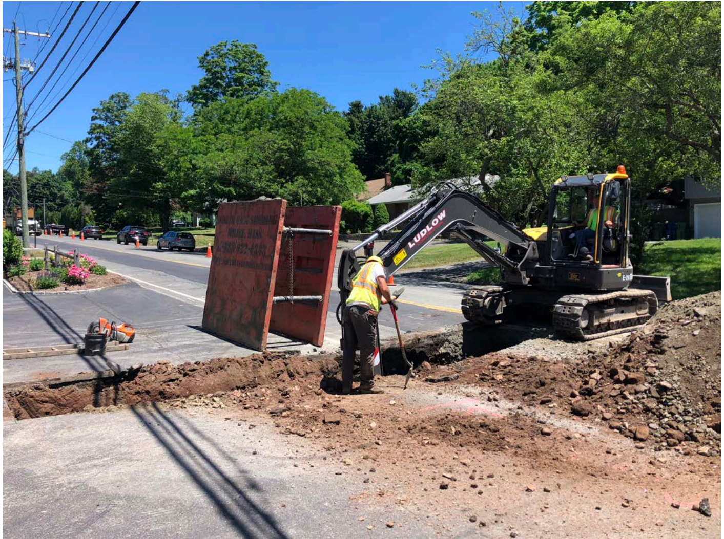
Picture 5: Ludlow installing a curb stop at Station 424+65, southbound lane of Main Street, Durham. View to the northeast.