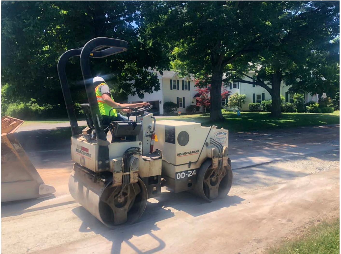
Picture 6: Ludlow cleaning up work area at Station 425+00 with a Bocce Broom. Maiden Lane, Durham. View to the southwest.