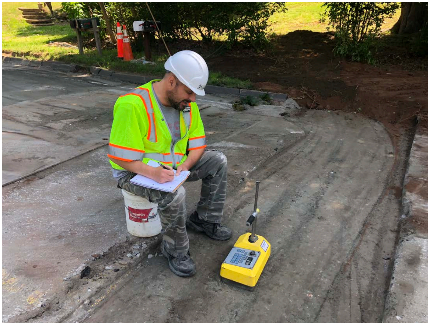
Picture 3: JTC performing soil compaction test at Station 148+60; Main Street, Durham. View to the east.