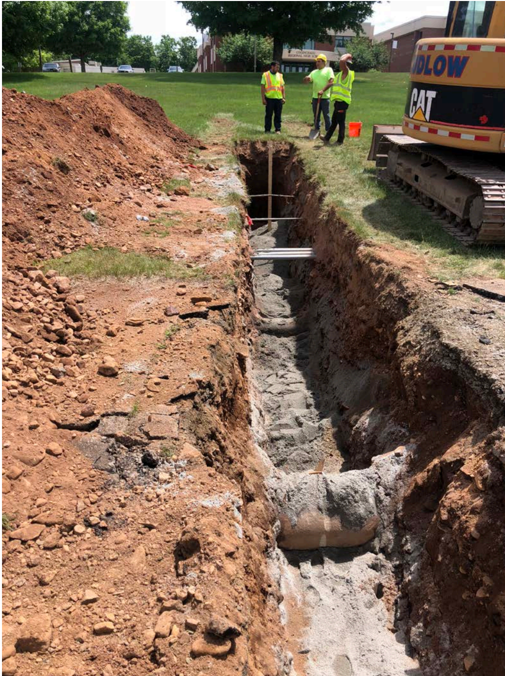
Picture 5: Utilities exposed when Ludlow was installing 4" DIP at Station 529+64. Pickett Lane, Durham; view the east.