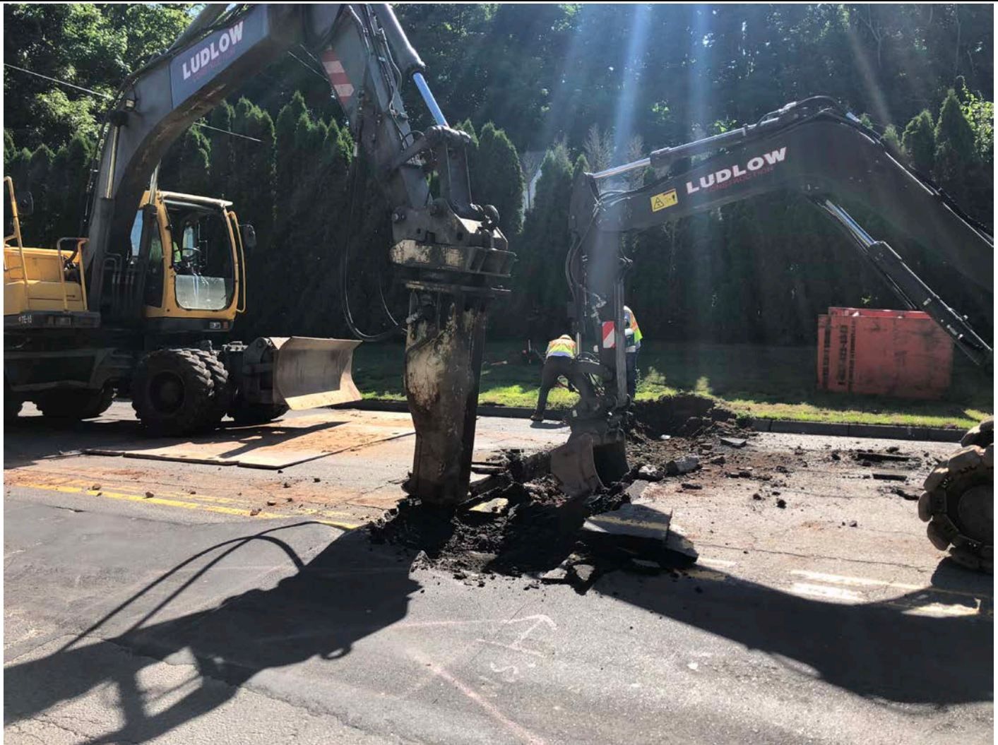
Picture 1: Ludlow excavating on the northbound lane of Main Street at Station 148+60 to install a curb stop. View to the east.