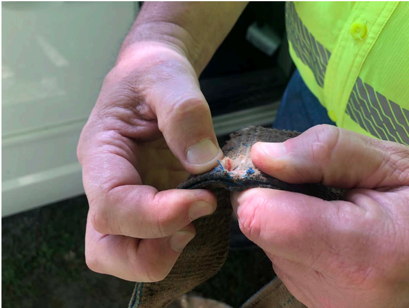
Picture 2: Ludlow inspected web strap used to lift DIP and found it to be worn. Ludlow discarded the web strapping.