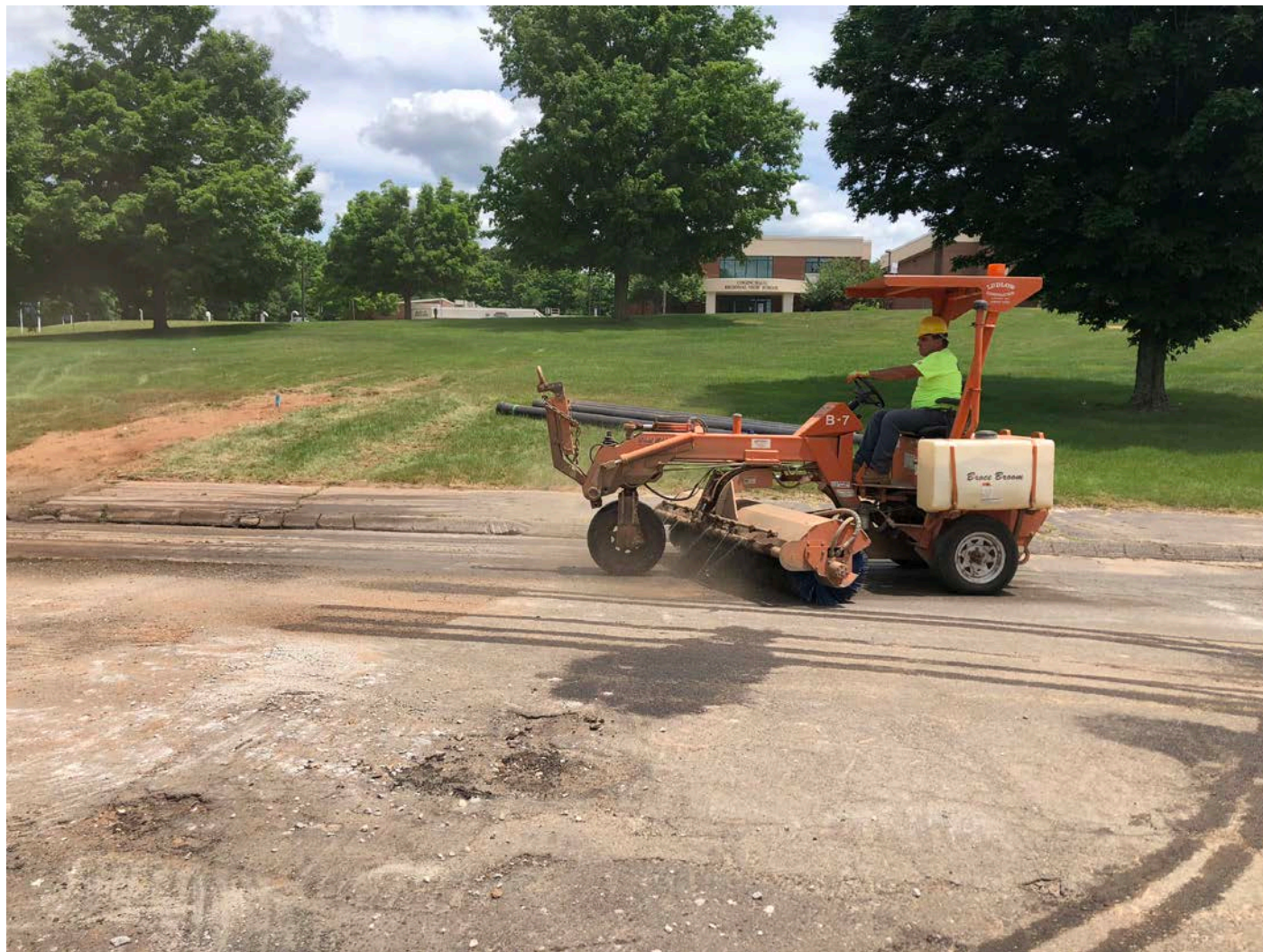
Picture 6: Ludlow cleaning up work area at Station 529+64 with a Bocce Broom. Pickett Lane, Durham; view to the east.