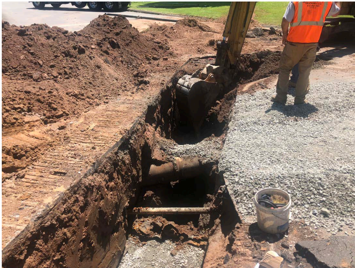
Picture 7: More utilities daylighted by Ludlow as they installed 4" DIP today at Station 525+75. Pickett Lane, Durham. View to the southeast.