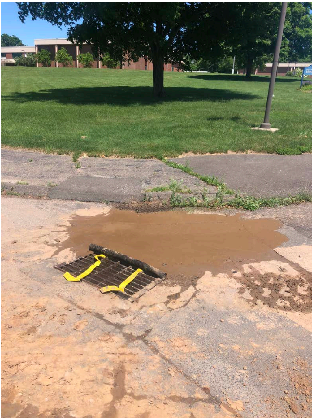
Picture 8: Catch basin outfitted with a silt sock that Ludlow discharged water into that was pumped from the trench during the installation of 4" DIP. Pickett Lane, Durham. View to the east.