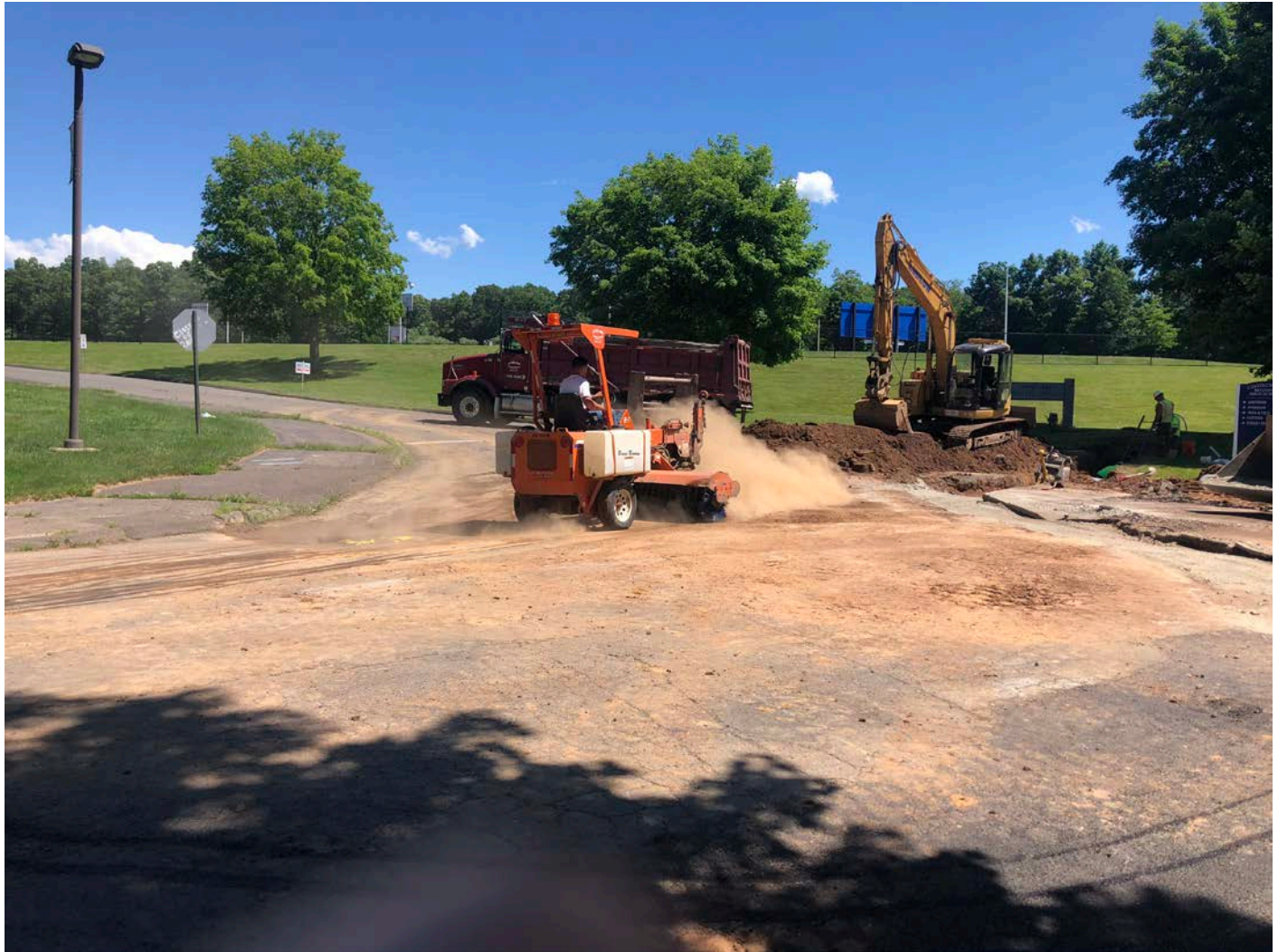
Picture 10: Ludlow cleaning up work area at Station 525+75 with Bocce Broom. Pickett Lane, Durham. View to the east.