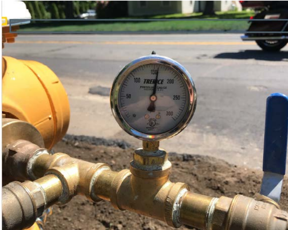
Picture 2: Ending pressure of today's pressure test conducted on the main water line from Stations 195+26 to 175+29. Gauge was placed on the hydrant located at Station 179+07.