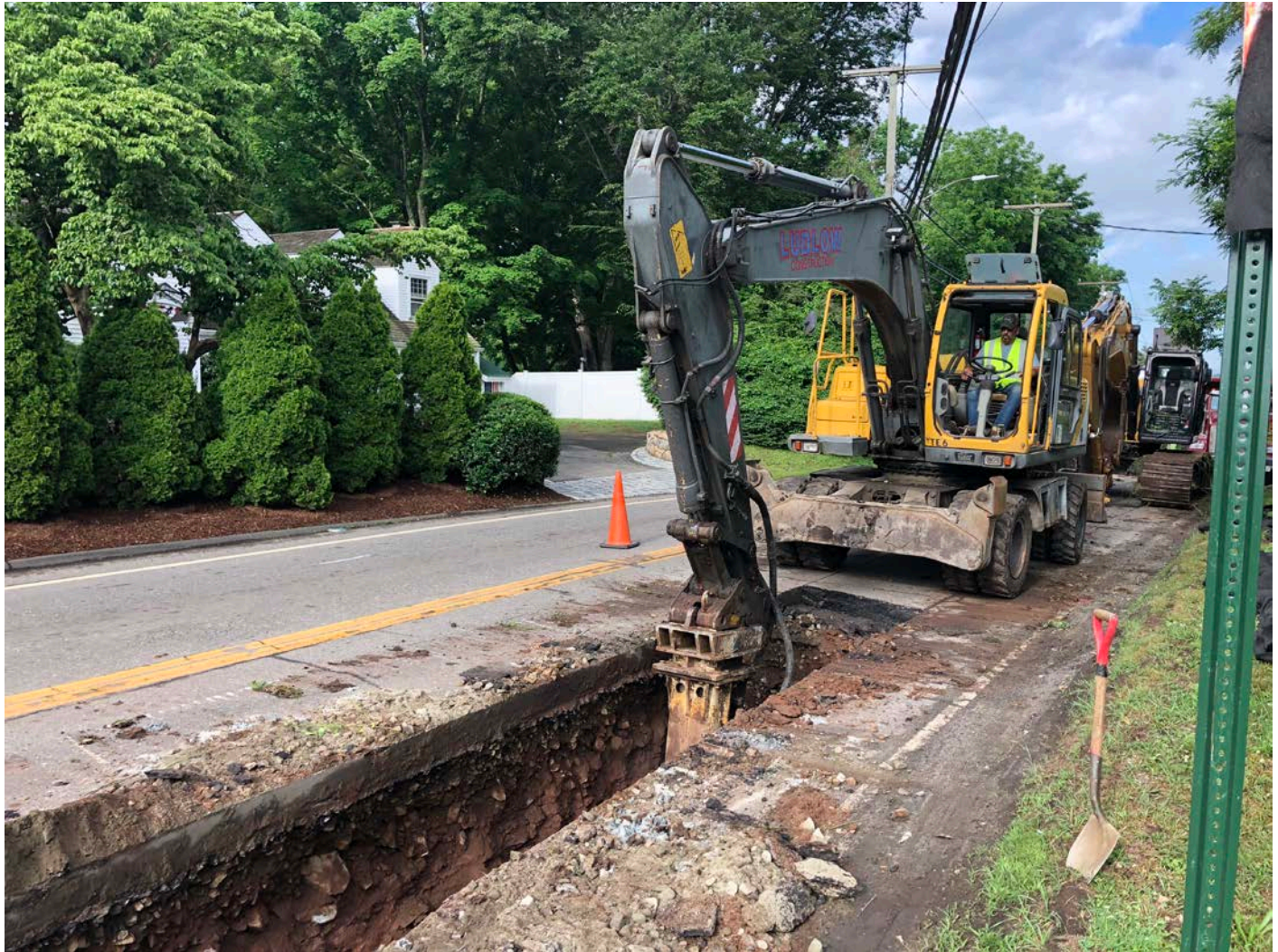
Picture 3: Ludlow hammering rock at ~Station 600+70. Route 68, Durham. View to the southeast.