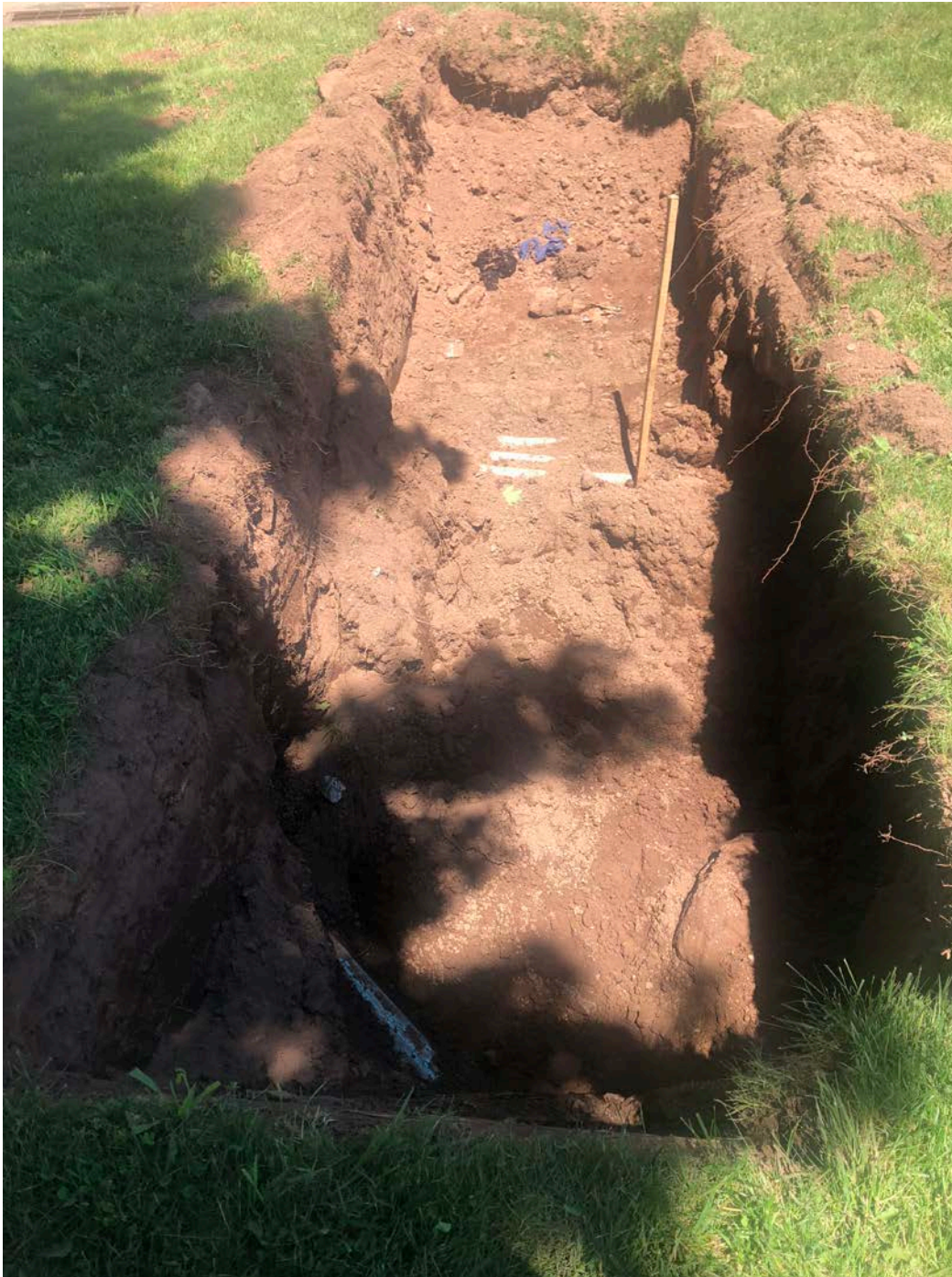
Picture 6: Utility conduits daylighted by Ludlow as they installed 4" DIP today at Station 525+75. Pickett Lane, Durham. View to the northwest.