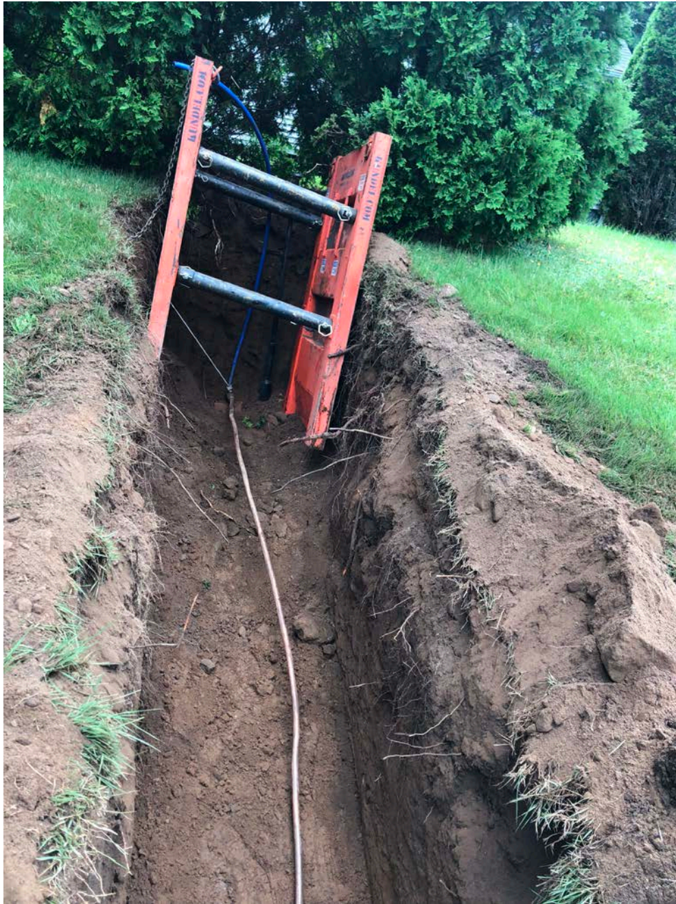
Picture 4: Curb stop being installed at Station 146+52. View to the east. Main Street, Durham, CT.