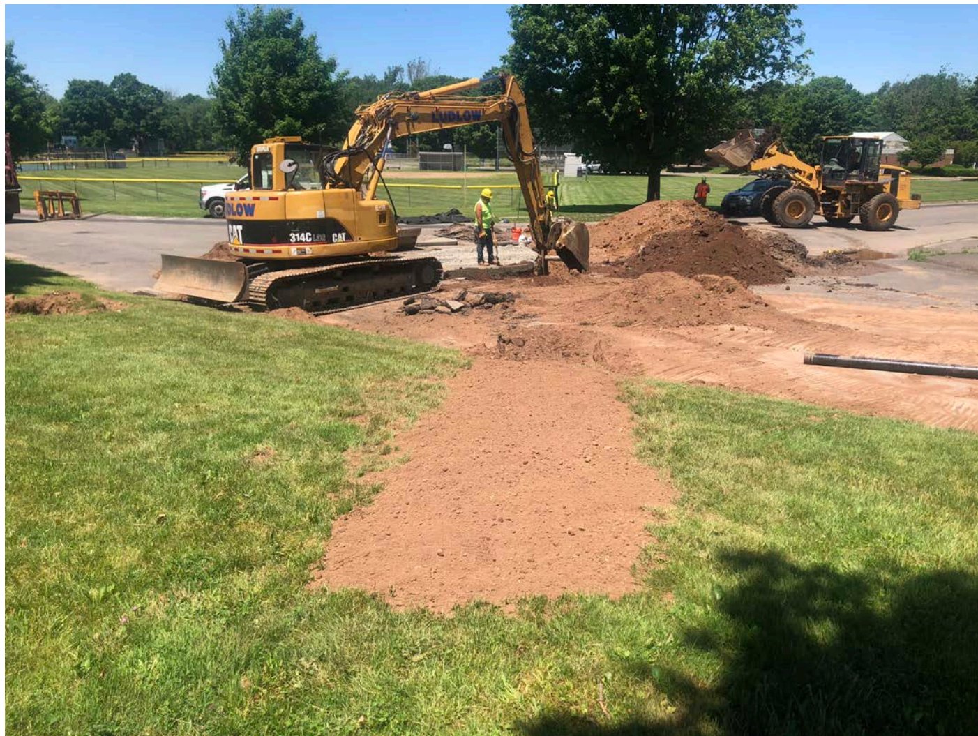
Picture 5: Ludlow placing 4" DIP across Pickett Lane at Station 525+75. In the foreground is the section of lawn that was repaired after Ludlow began excavating this morning in the incorrect location. View to the northwest.