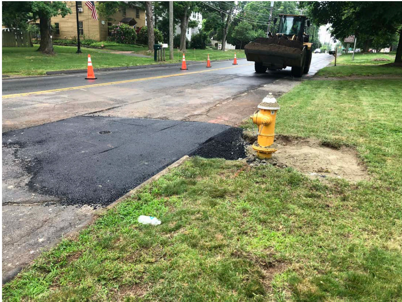
Picture 4: Newly installed hydrant at Station 187+44. View to the south. Main Street, Durham.