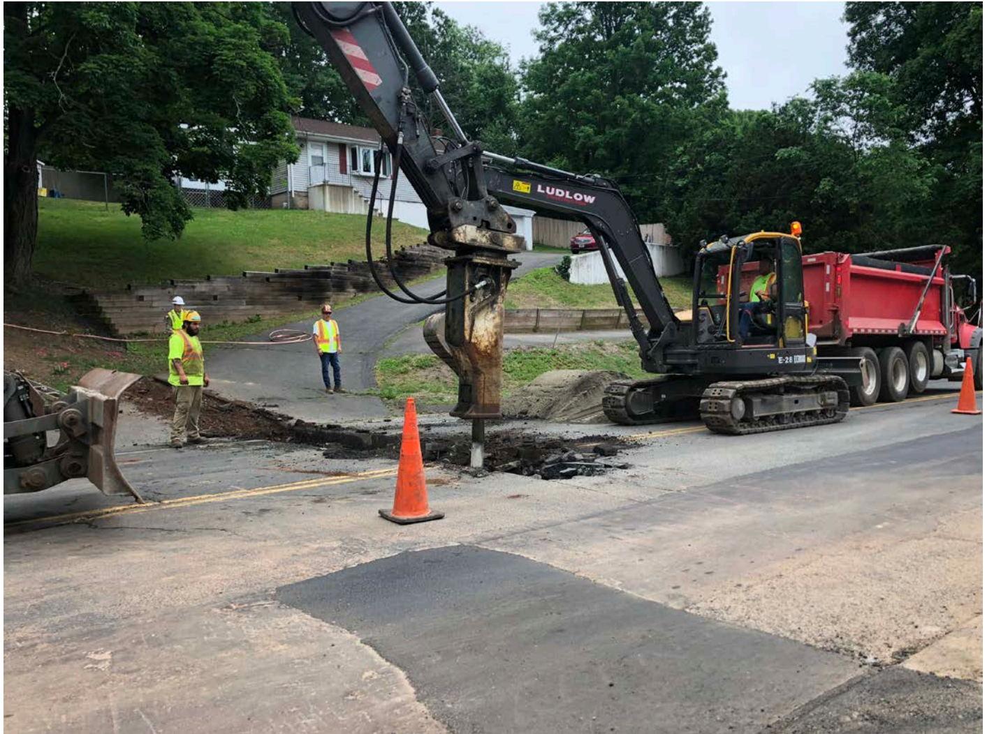
Picture 1: Ludlow breaking up pavement and underlying concrete at Station 144+59.5 to place a curb stop 21' from edge of pavement. Northbound lane of Main Street, Durham. View to the southeast.