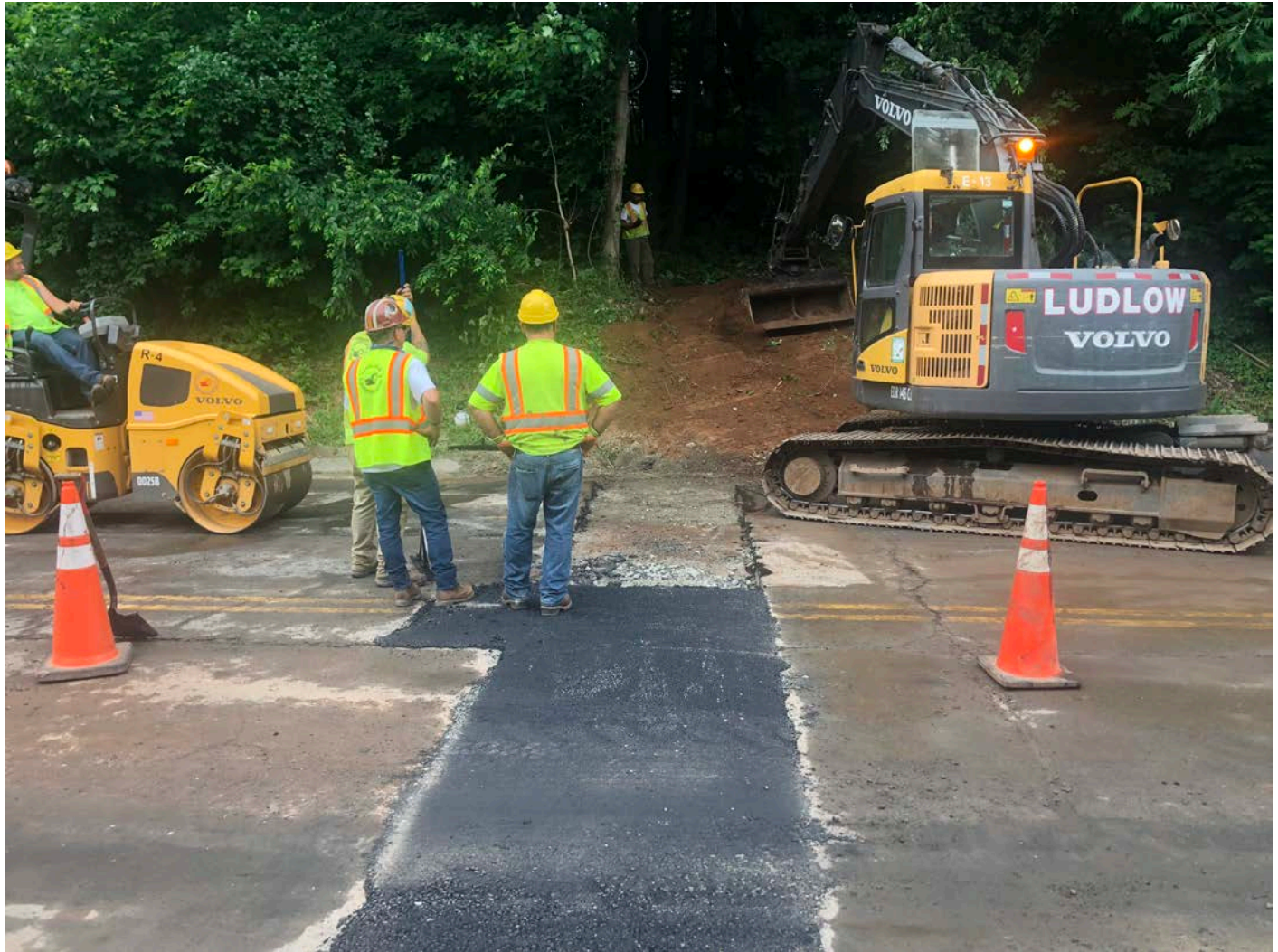
Picture 6: Ludlow backfilling the trench after placing a curb stop at Station 143+34. Main Street, Durham. View to the east.