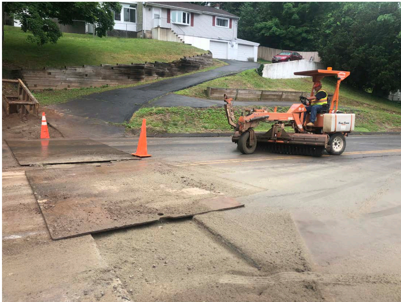
Picture 5: Ludlow cleaning up pavement with Broce Broom at Station 144+59.5. View to the east. Main Street, Durham.