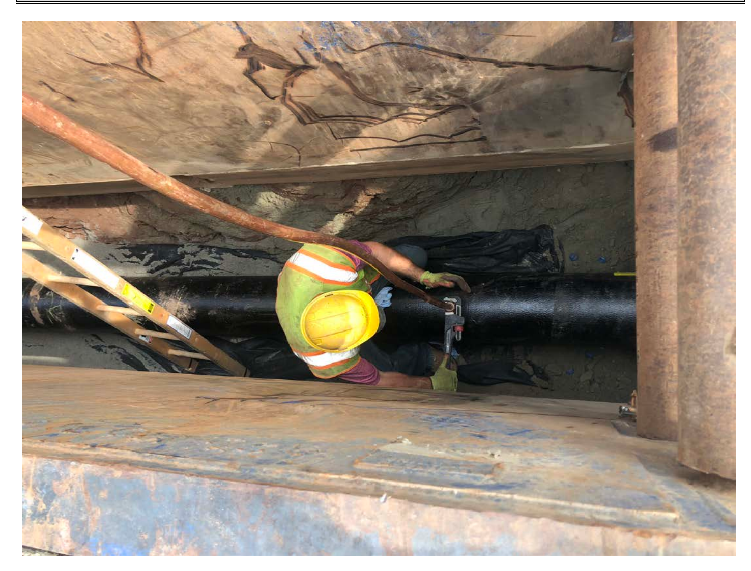
Picture 2: Ludlow installing a 1" copper chlorination inlet at Station 600+02, Route 68, Durham.