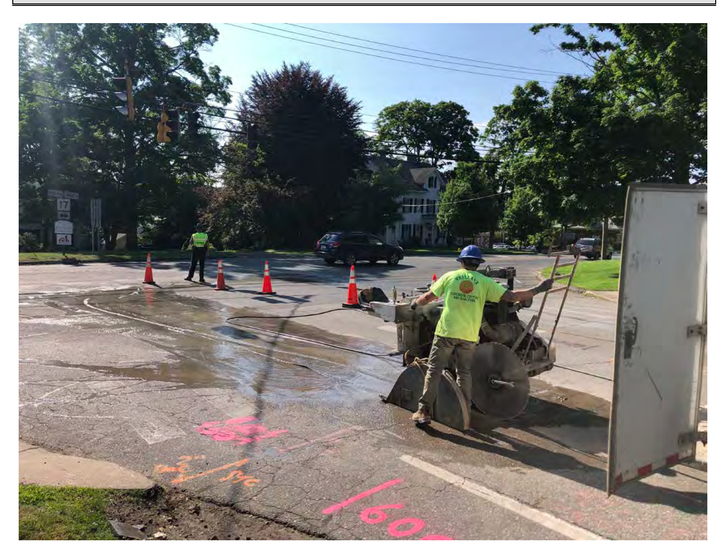
Picture 2: Veilleux saw cutting pavement on Route 68 next to where it intersects with Main Street at ~Station 600+25, Durham, CT.

Project #:AECOM: 6061487Report No:94Contractor:Ludlow ConstructionPage:5 of 9