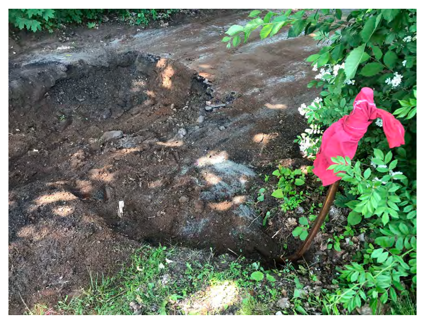
Picture 5: Air bleed line located at the west end of the 6" DIP that Ludlow placed today on Marina Place. View to the southwest, Durham, CT.