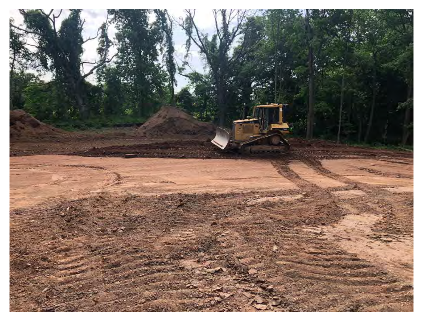
Picture 3: Ludlow grading fill to the east of the water tank footprint. View to the southeast. Middletown, CT.

Project #:AECOM: 6061487Report No:94Contractor:Ludlow ConstructionPage:6 of 9