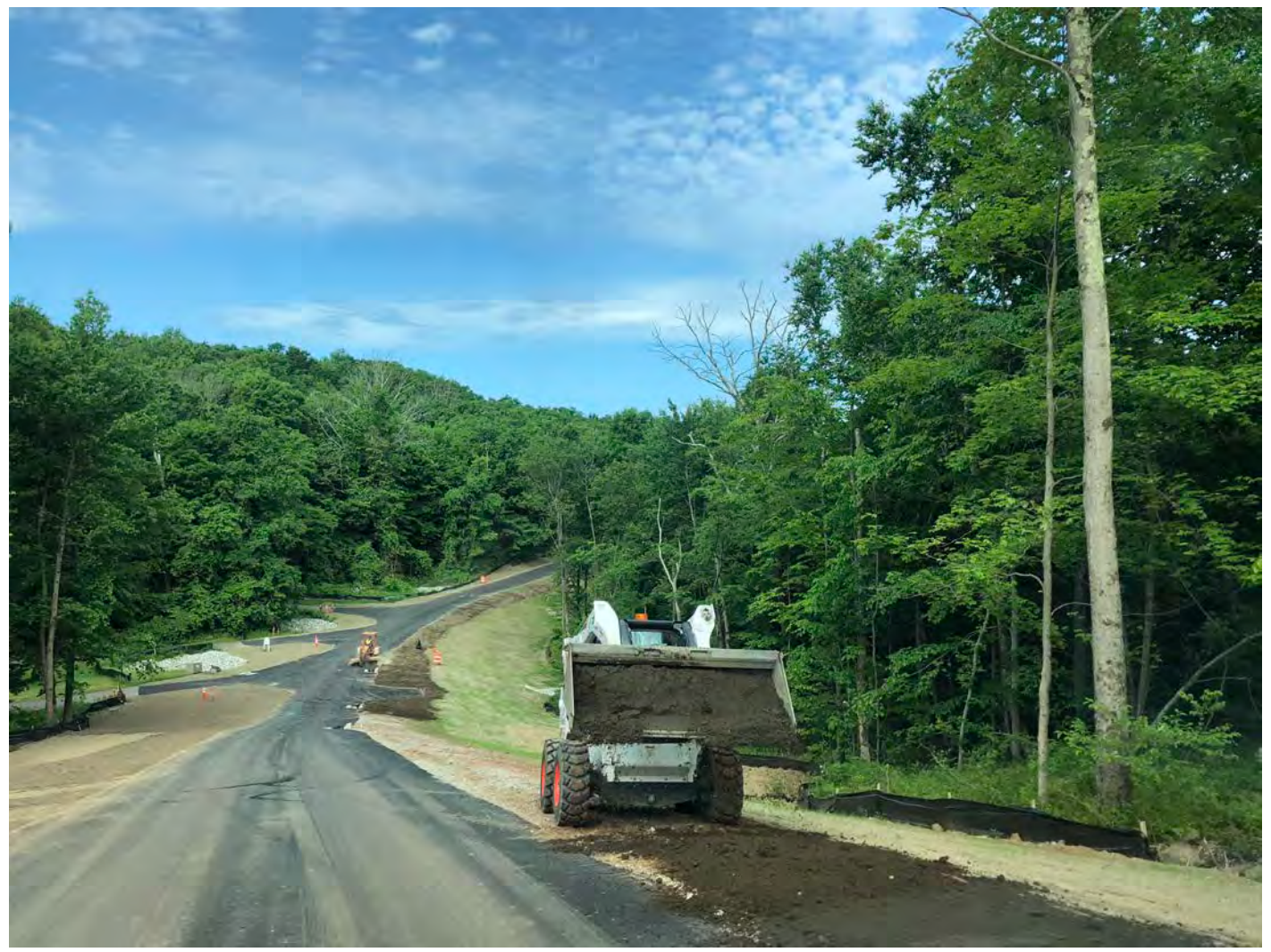
Picture 4: Ludlow placing loam on the north side of the Shared Access Road. View to the west. Middletown, CT.