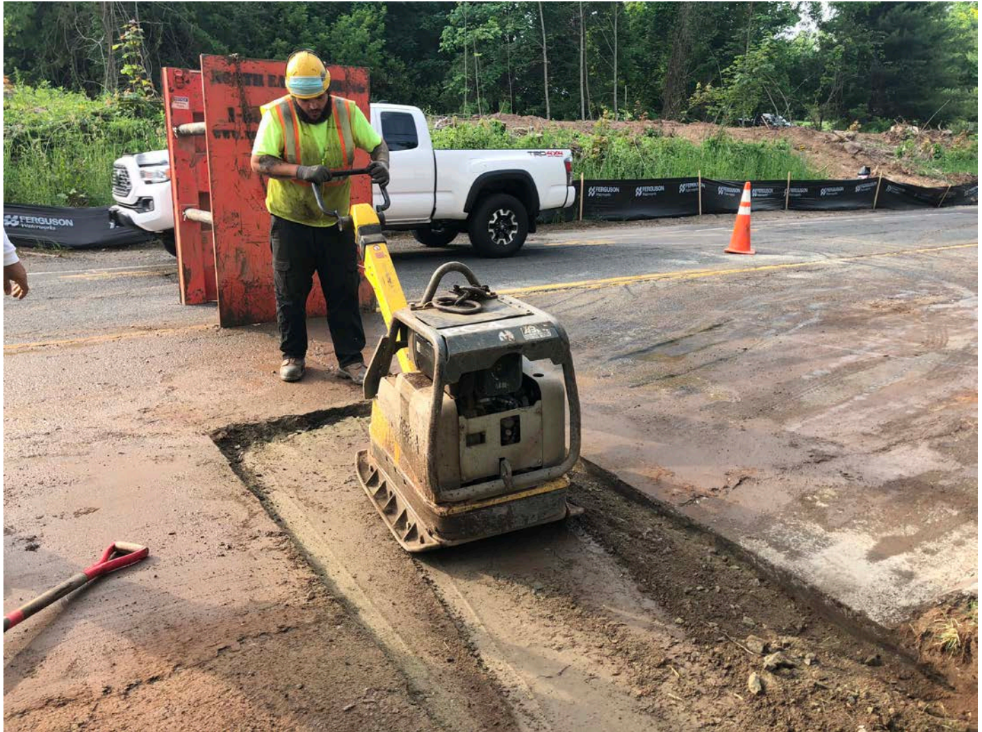
Picture 5: Ludlow compacting fill at Station 128+50 after installing a curb stop on the west side of Main Street, Middletown. View to the east.