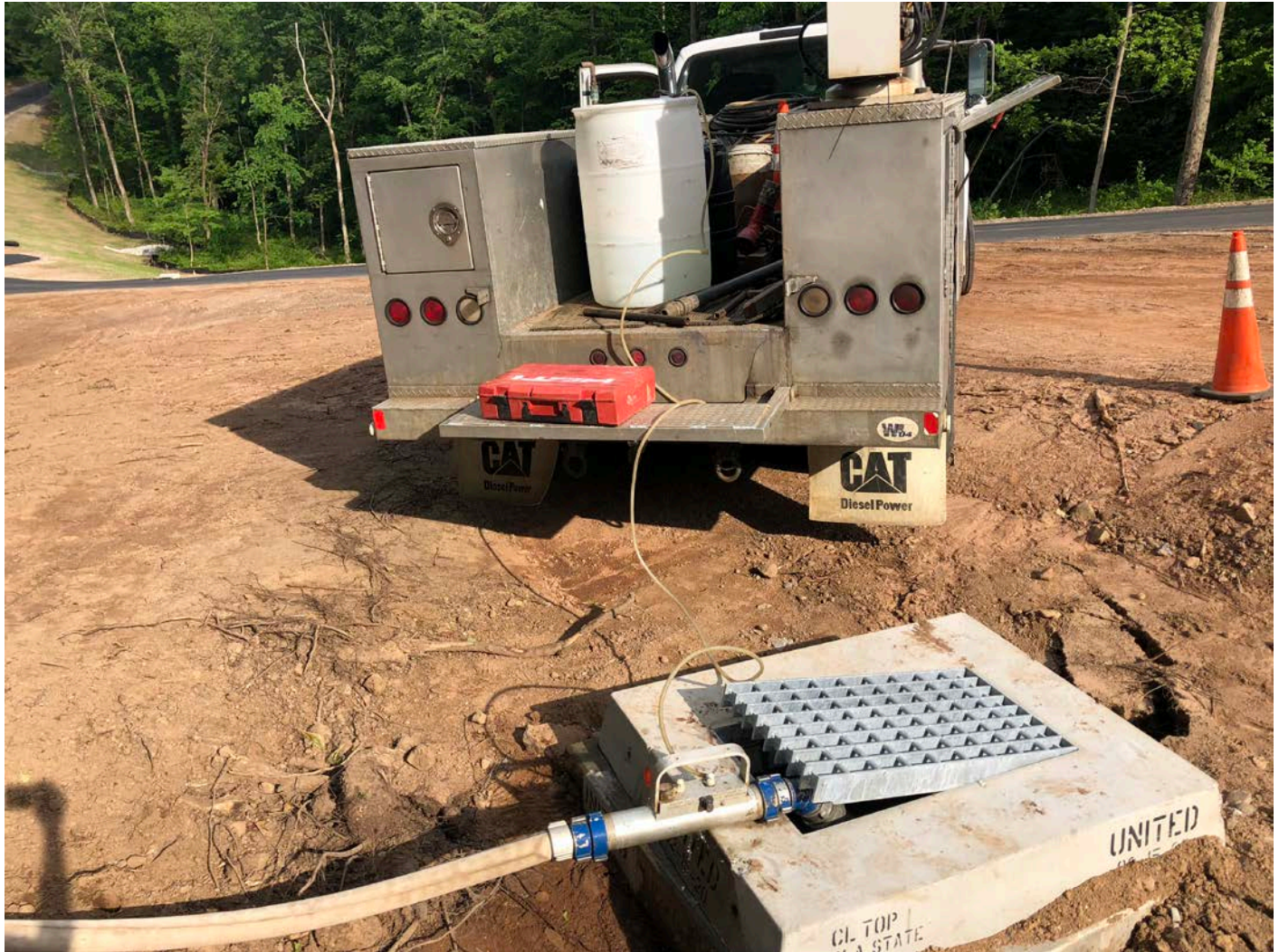
Picture 2: Calcium thiosulfate being added to chlorinated water that is being discharged from the temporary fire hydrant located upslope from the catch basin. Just south of Station 11+00, Shared Access Road, Middletown, CT.