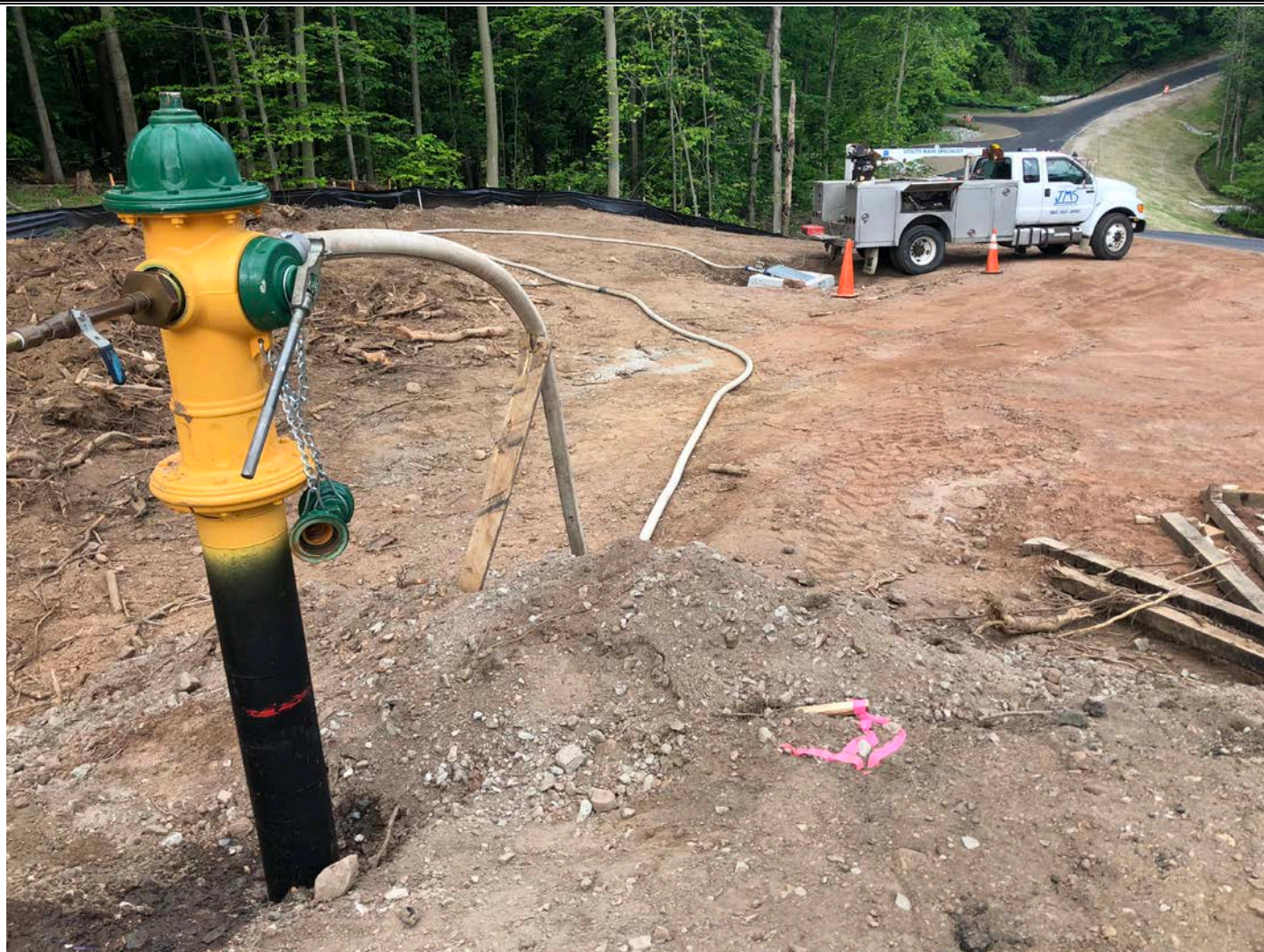
Picture 1: Dechlorination in progress at ~Station 11+00 on the Shared Access Driveway. Water is pushed up to the hydrant, where it is discharged to the catch basin down slope where it will be dechlorinated with calcium thiosulfate. View to the west, Middletown, CT.