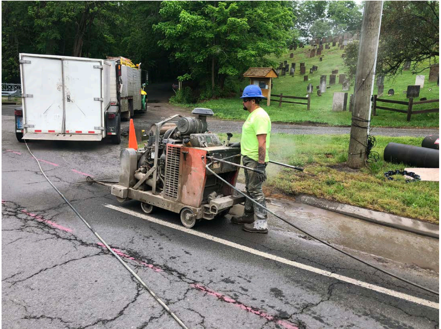
Picture 3: Ludlow subcontractor saw cutting pavement at the intersection of Main Street and Old Cemetery Road in Durham, CT. View to the southwest.