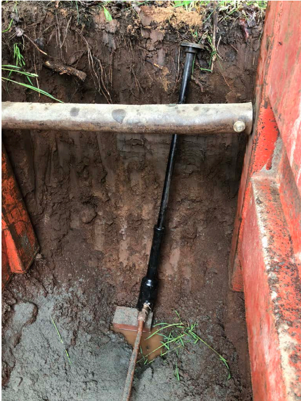
Picture 2: Curb stop and box for the 1" curb stop placed at Station 115+92. View to the east. South Main Street, Middletown, Durham.