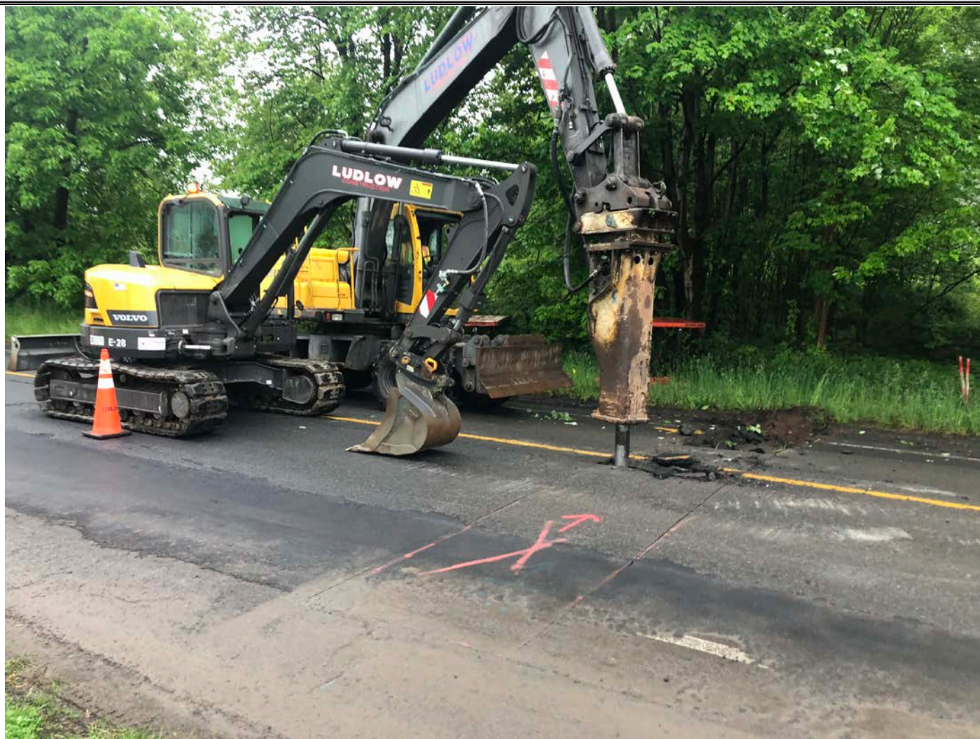
Picture 1: Ludlow hammering pavement and underlying concrete to open up a trench at Station 115+92. View to the east. South Main Street, Middletown, Durham.