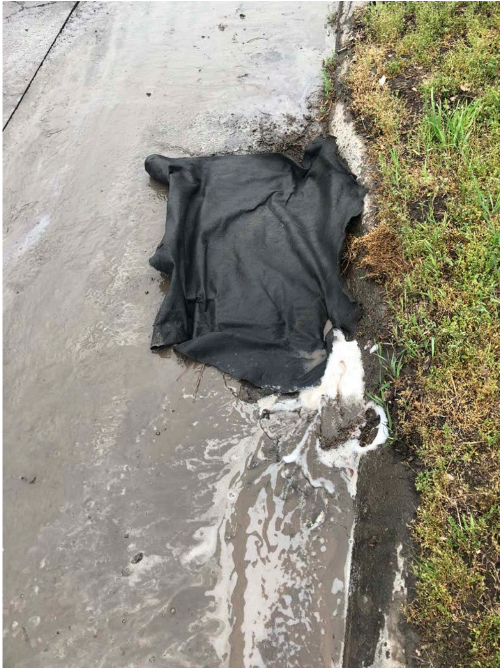
Picture 6: Catch basin on Main Street at ~Station 208+80 where water pumped from excavation was observed to bypass filter fabric. Correction to the issue is depicted in Picture 7 below. Main Street, Durham, CT. View to the south.