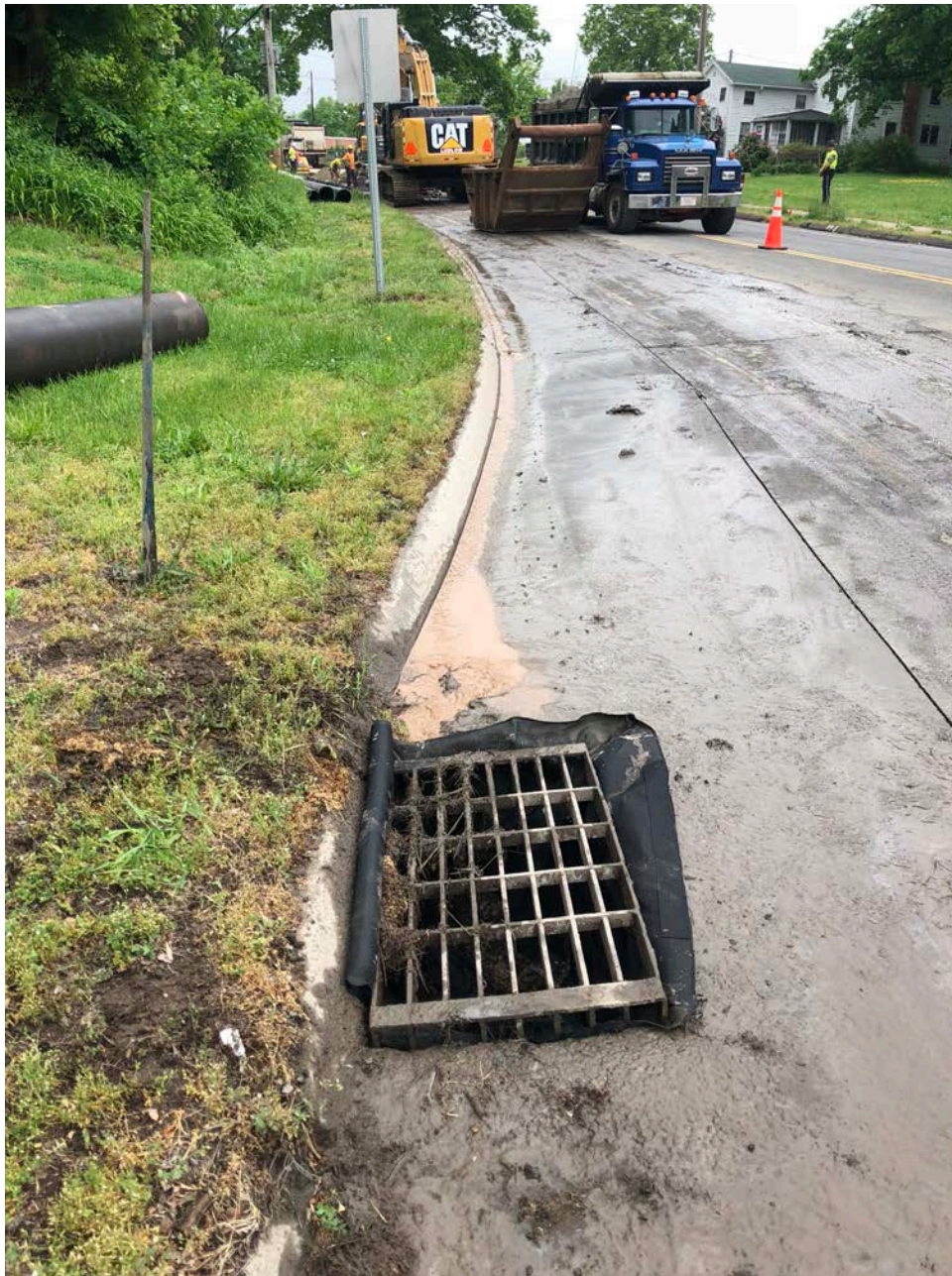
Picture 7: Catch basin on Main Street at ~Station 208+80 after filter fabric was replaced with silt sock. Main Street, Durham, CT. View to the north.