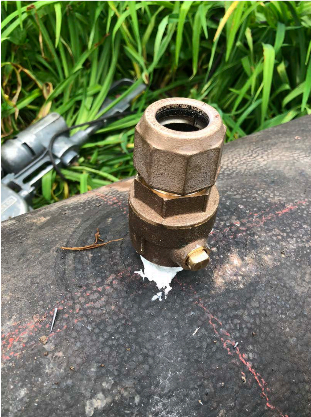
Picture 4: 1" corporation stop placed on 16" DIP for installment at Station 206+38. Main Street, Durham, CT.