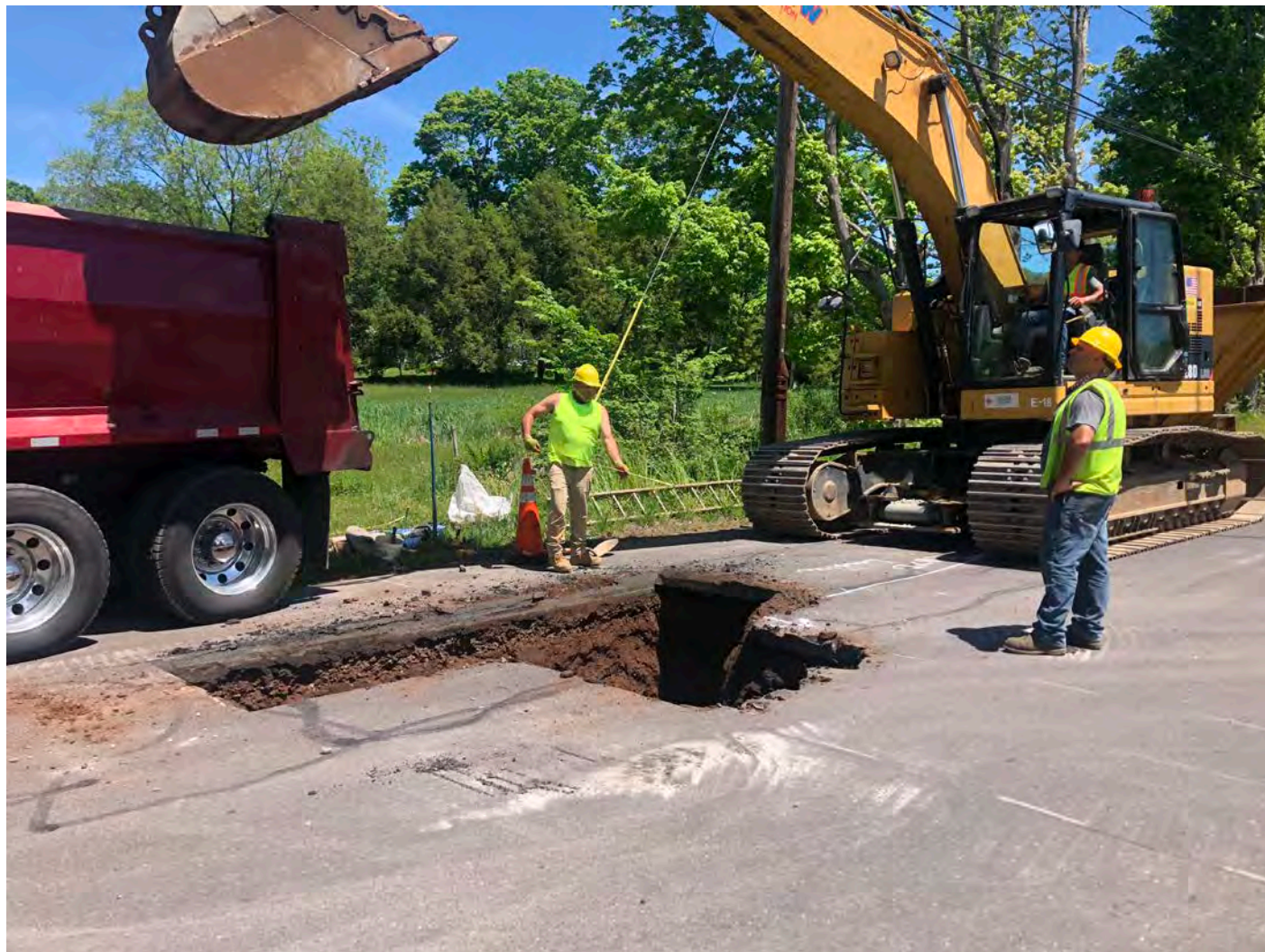
Picture 7: Ludlow excavating on Maiden Lane to place a 12"x12"x12" M.J. C.L.D.I. TEE with three 12" M.J. valves and valve boxes at Station 426+03. View to the northeast, Durham, CT.