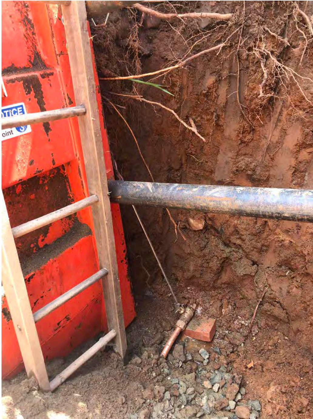
Picture 5: Copper 1" water service connection with curb stop and curb stop stem. Station 104+40. View to the east. Main Street, Middletown, CT.