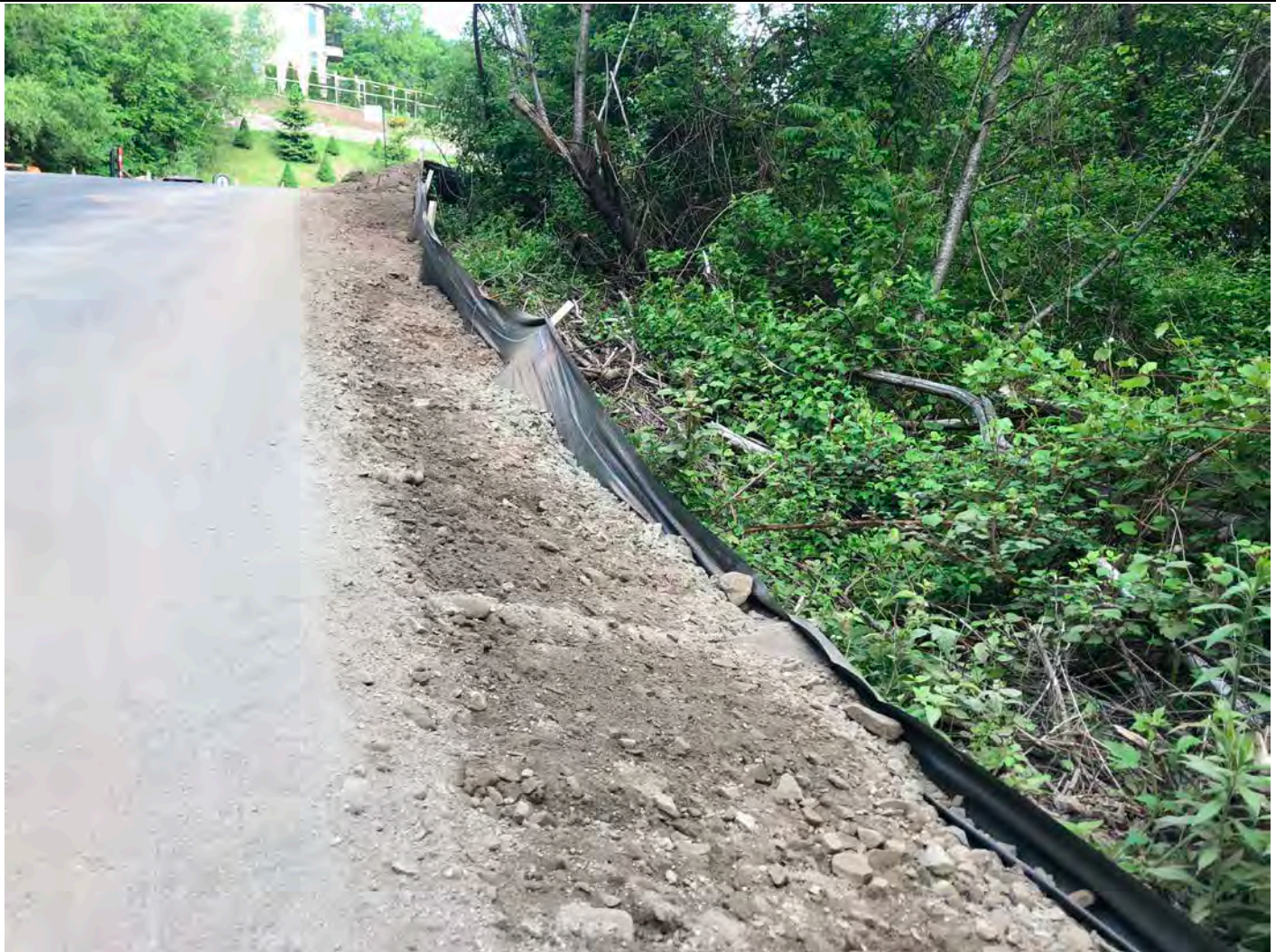
Picture 1: Soil encroaching on the silt fence along on north side of the Shared Access Road. ~Station 22+00. View to the northwest. Middletown, CT.