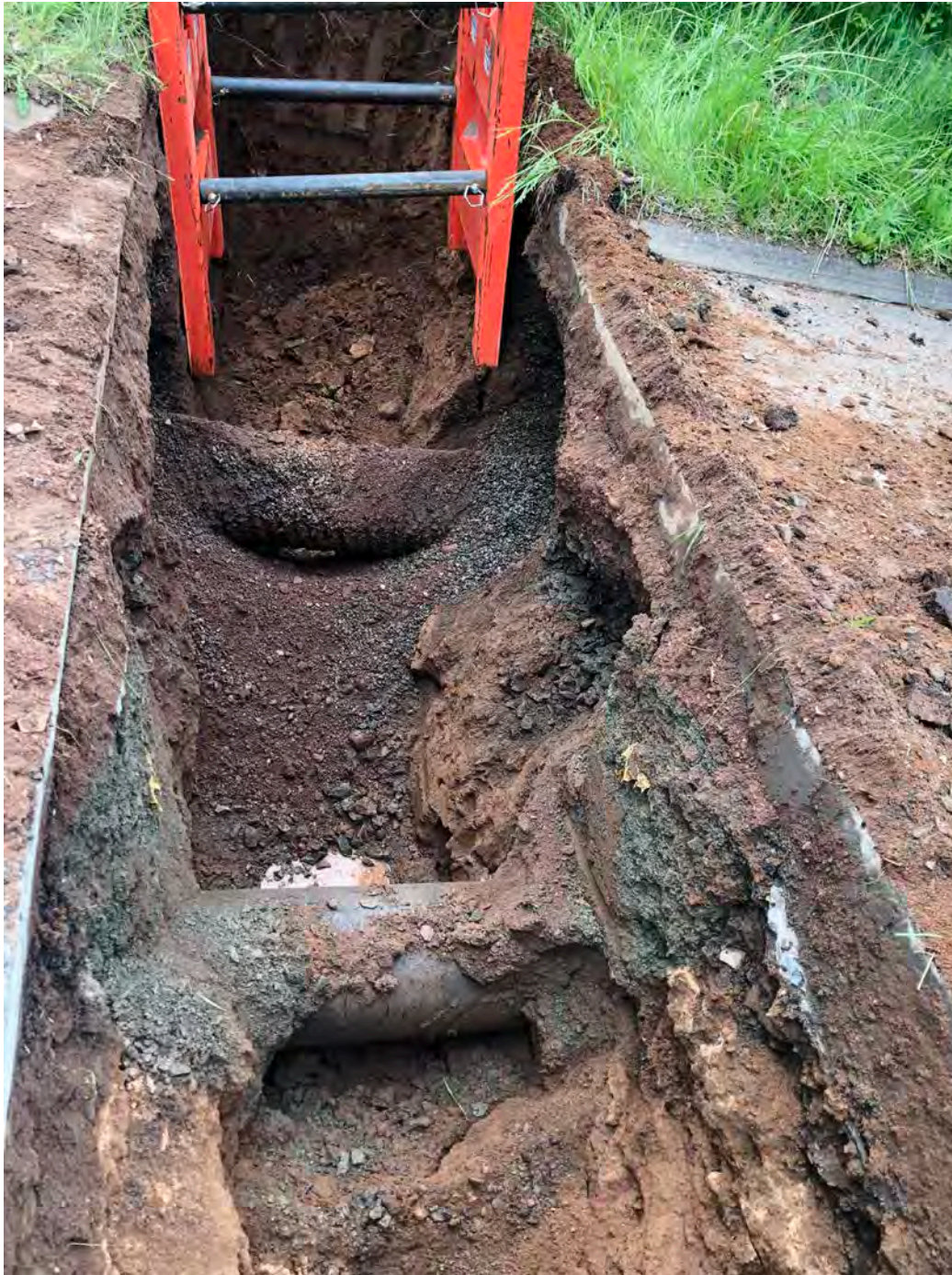
Picture 3: Ludlow daylighting gas line (foreground) and storm drain (background) at Station 104+40. View to the east, South Main Street, Middletown, CT.