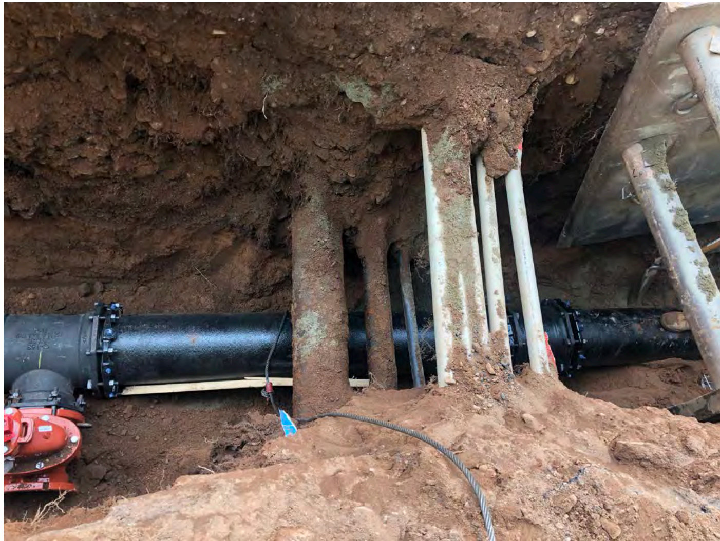
Picture 4: 12" DIP placed beneath utilities located at Station 530+56, Pickett Lane, Durham, CT.