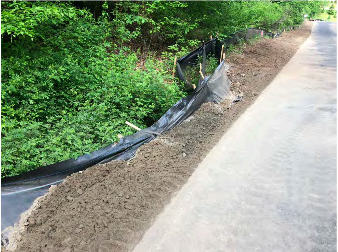
Picture 2: Soil encroaching on the silt fence along on south side of the Shared Access Road. ~Station 21+25. View to the west. Middletown, CT.