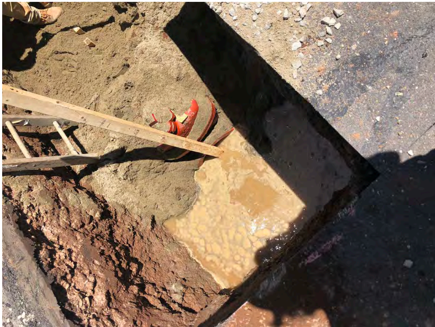
Picture 9: Water observed in excavation at Station 426+03. Maiden Lane, Durham, CT.