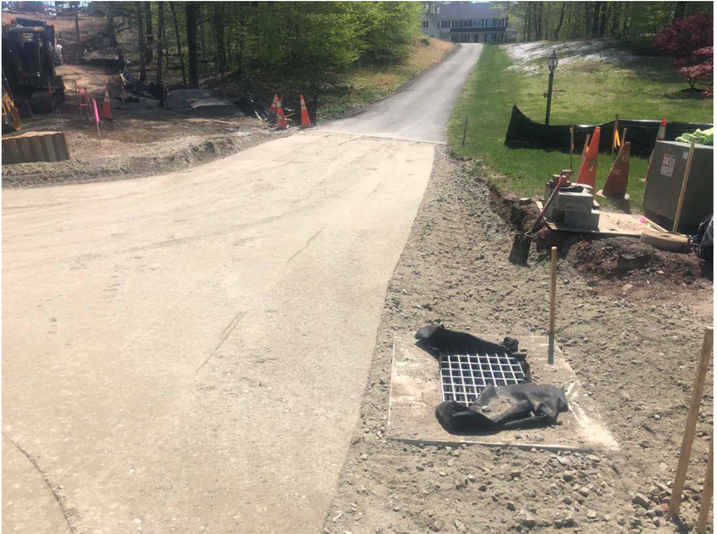
Picture 5: Catch basin located between the driveways of 214 and 216 Talcott Ridge Drive after it was raised 5" and gravel was backfilled and compacted around it. Driveway for 214 Talcott Ridge Drive visible in the background. Middletown, CT.