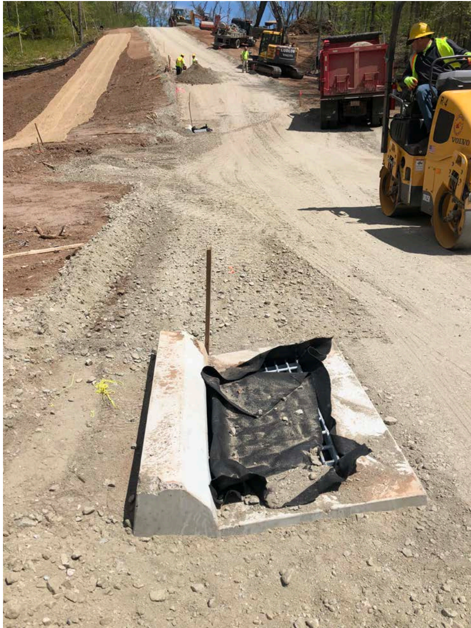
Picture 7: Catch basins that Ludlow raised elevation on. View to the east. Shared access driveway, Middletown, CT.