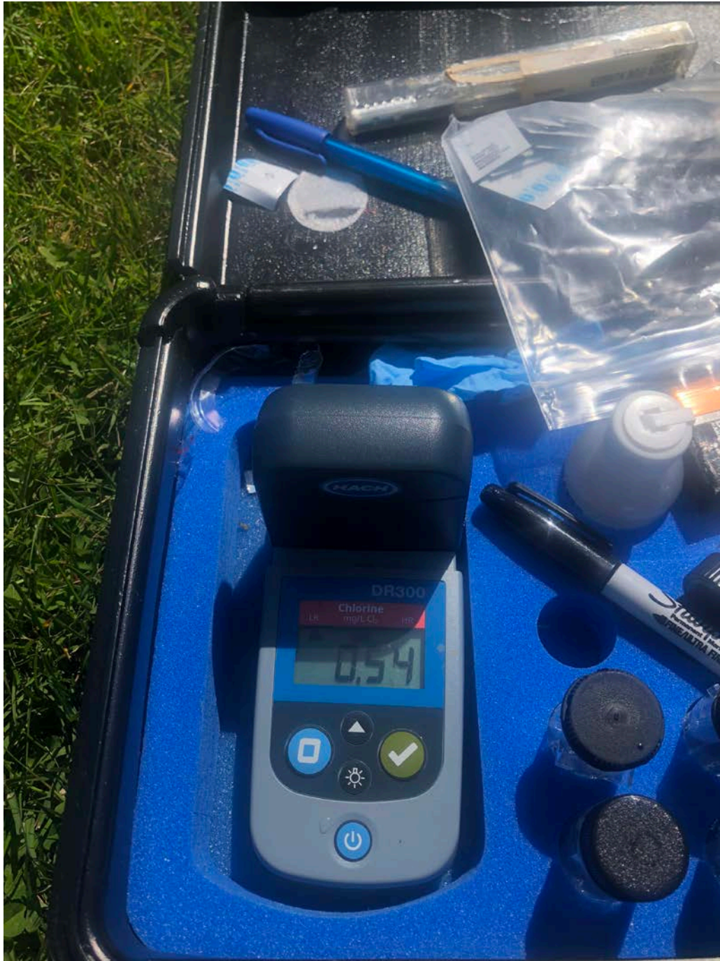
Picture 4: Hach DR300 used to field analyze water for residual chlorine Middletown, CT.