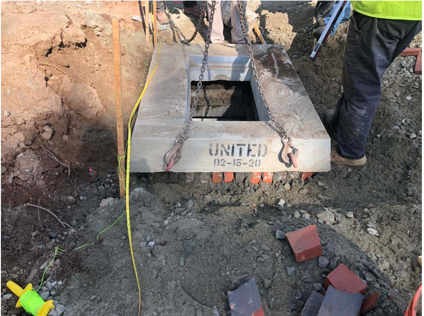
Picture 2: Ludlow raising the elevation of catch basin located between the driveways for 214 and 216 Talcott Ridge Drive. Shared access driveway, Middletown, CT