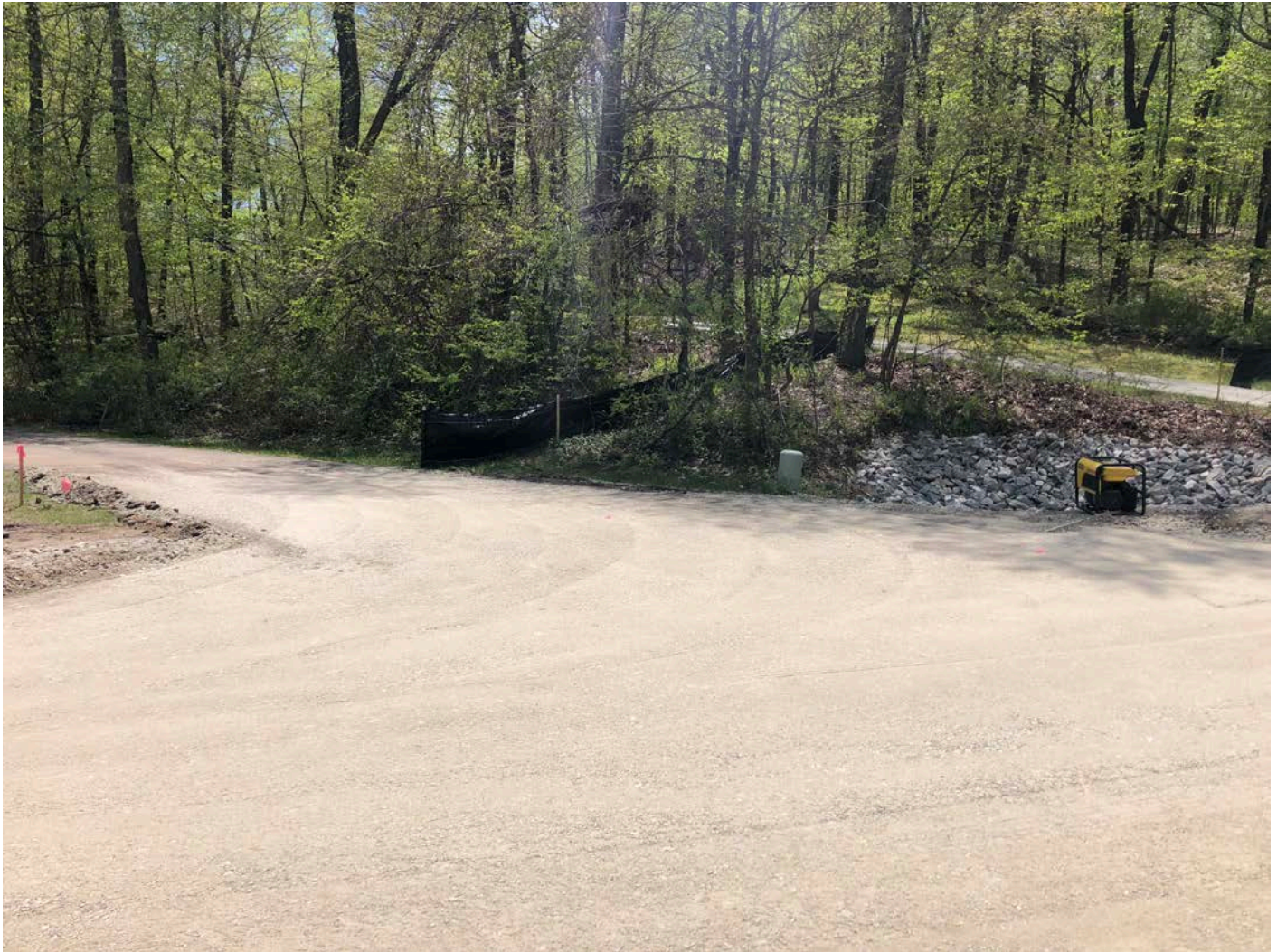
Picture 8: Modified radius of driveway entrance to address 216 Talcott Ridge Drive per resident's request. View to the south. Shared access driveway, Middletown, CT.