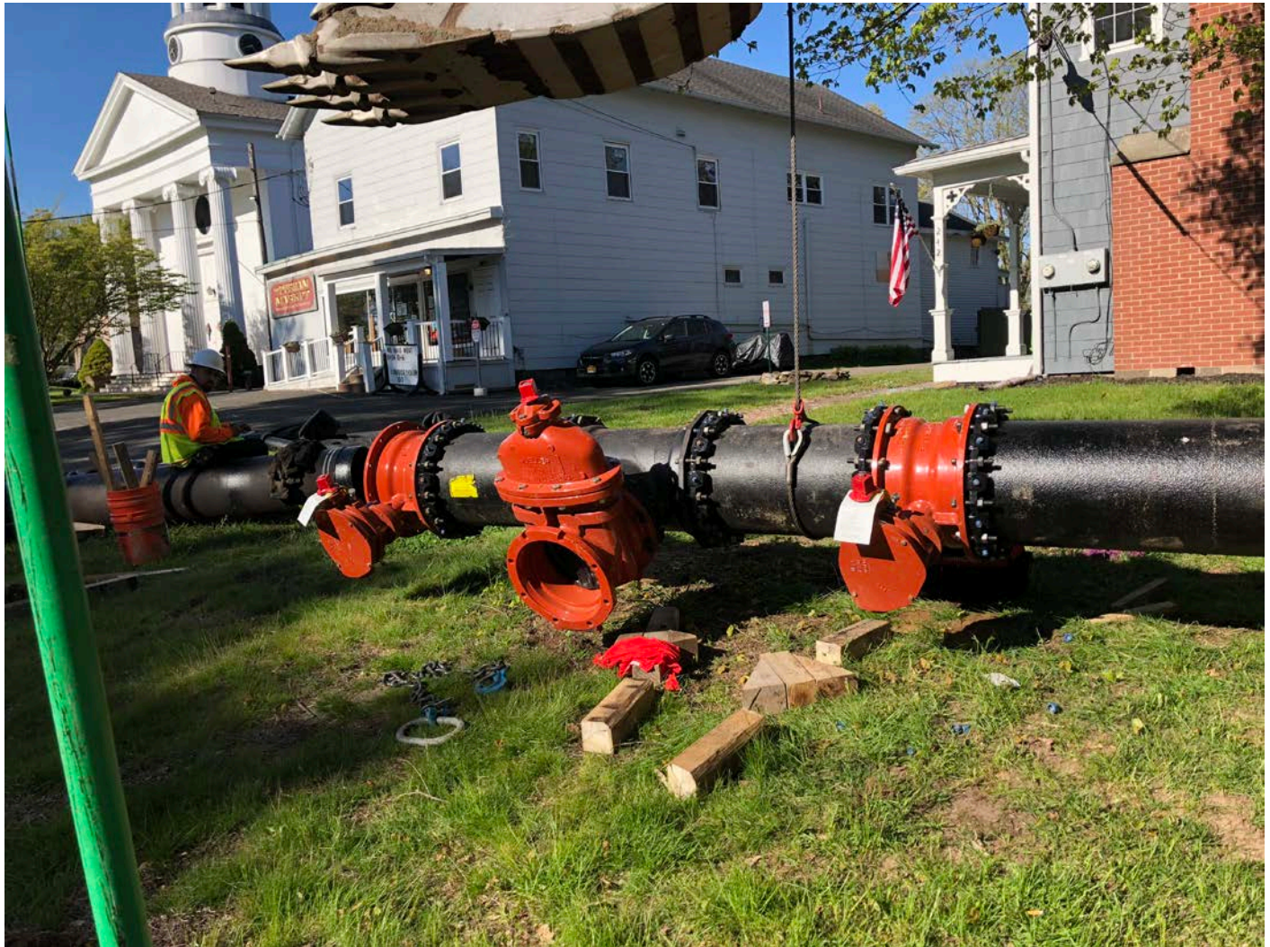
Picture 1: 16"x16"x12" M.J. C.L.D.I. TEE with two 16" M.J. butterfly valves and a 12" M.J. gate valve and gate box installed at Station 191+63 (across from Maiden Lane, Durham, CT).