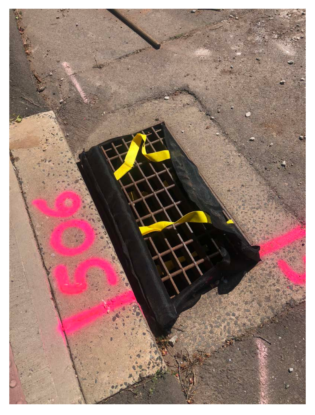
Picture 5: Silt sock placed in catch basin at Station 506+00. Picket Lane, Durham CT.