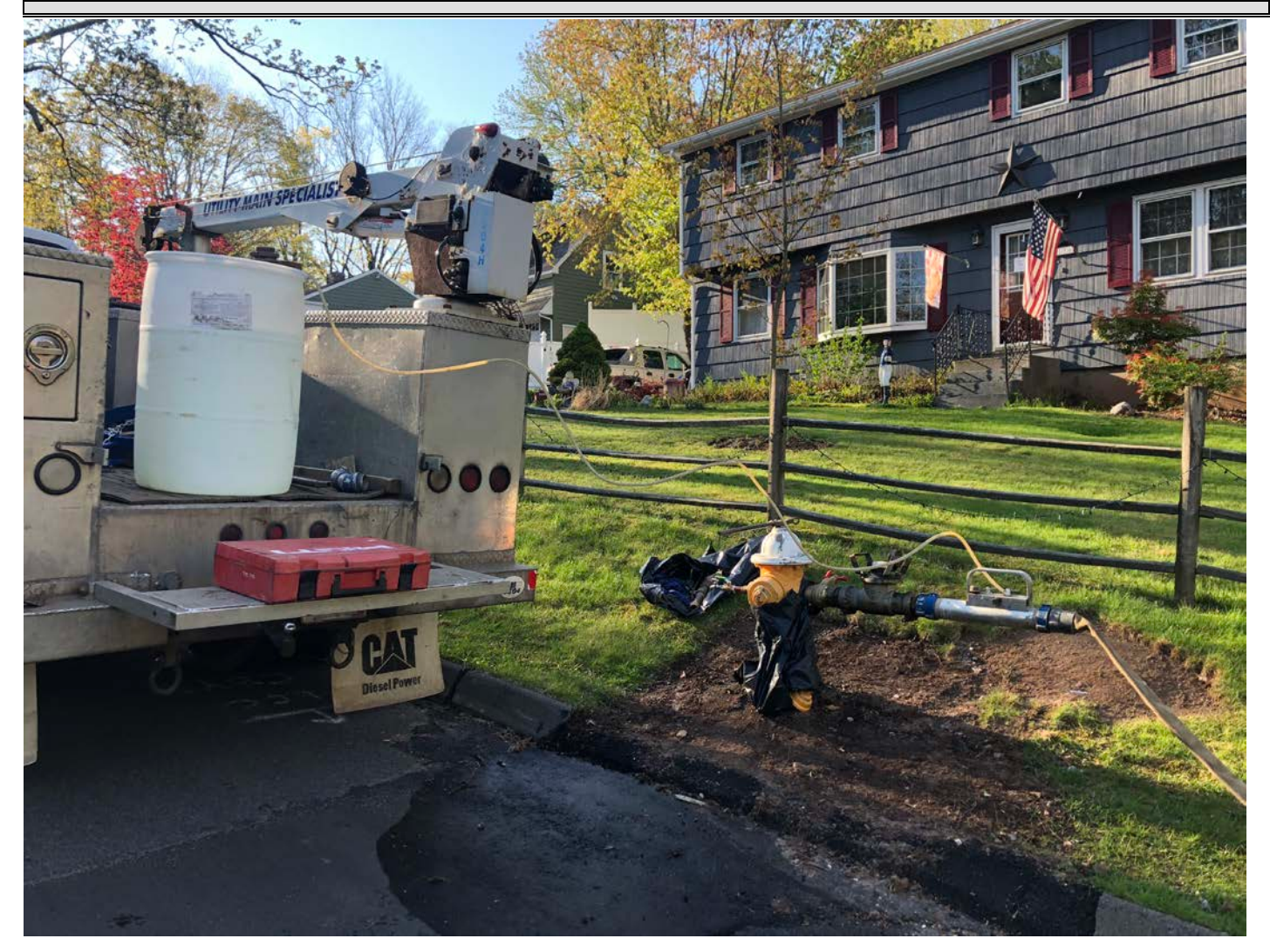
Picture 1: Disinfection of water line running from the intersection of Main Street and Talcott Ridge Drive to the intersection of Main Street and Oak Terrace.

Project #:AECOM: 6061487Report No:77Contractor:Ludlow ConstructionPage:4 of 8