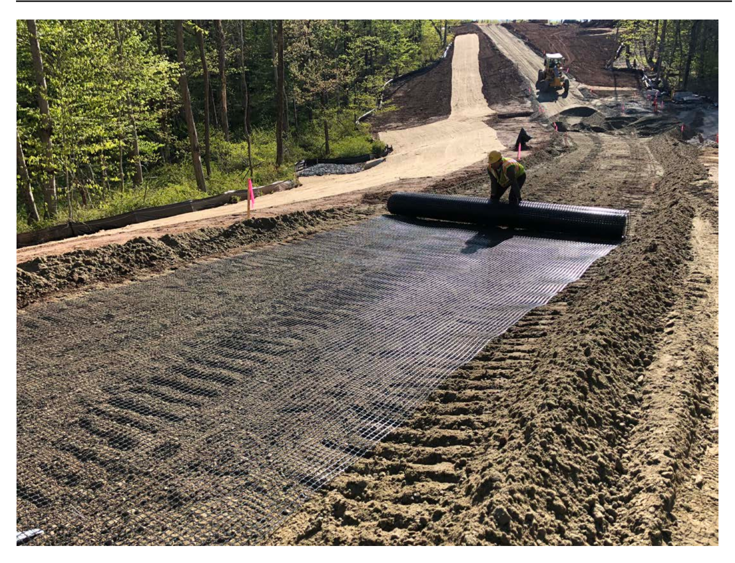
Picture 3: Ludlow places plastic soil stabilization grid between stations 16+00 and 14+40. View to the east. Middletown, CT.