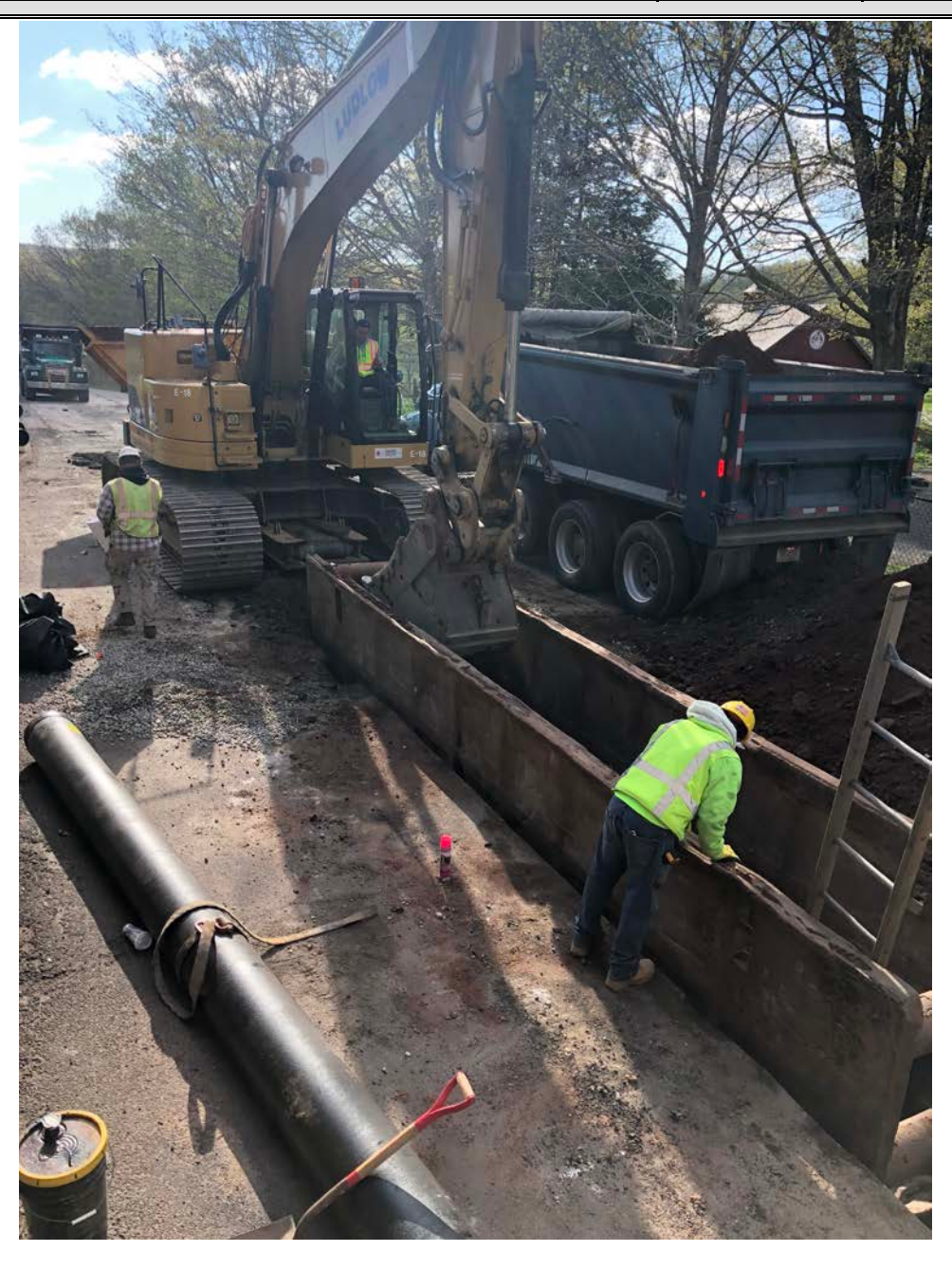
Picture 3: Ludlow placing 12" DIP. View to the southeast. Pickett Lane, Durham, CT.