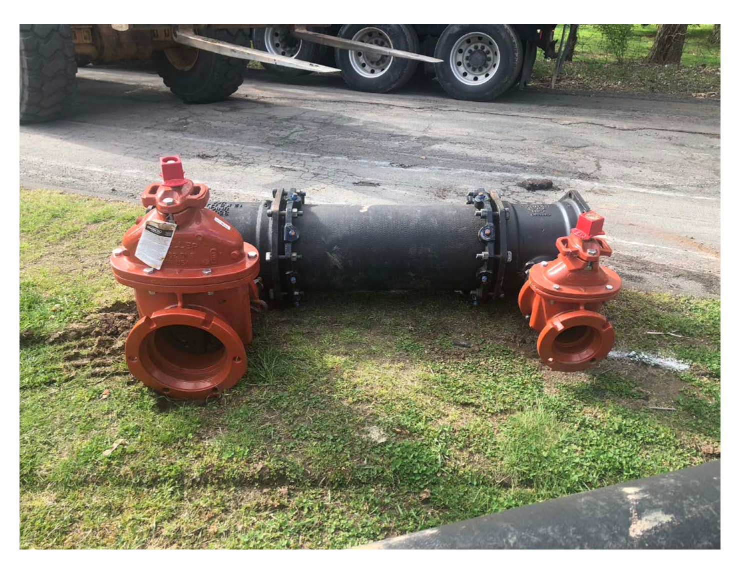
Picture 4: 12"x12"x4" M.J. TEE with 4" M.J. R.S. gate valve and gate box that Ludlow installed at Station 503+70 and a 12"x12"x8" TEE with 8" M.J. R.S. gate valve and gate box that Ludlow installed at Station 503+77. Pickett Lane, Durham, CT.