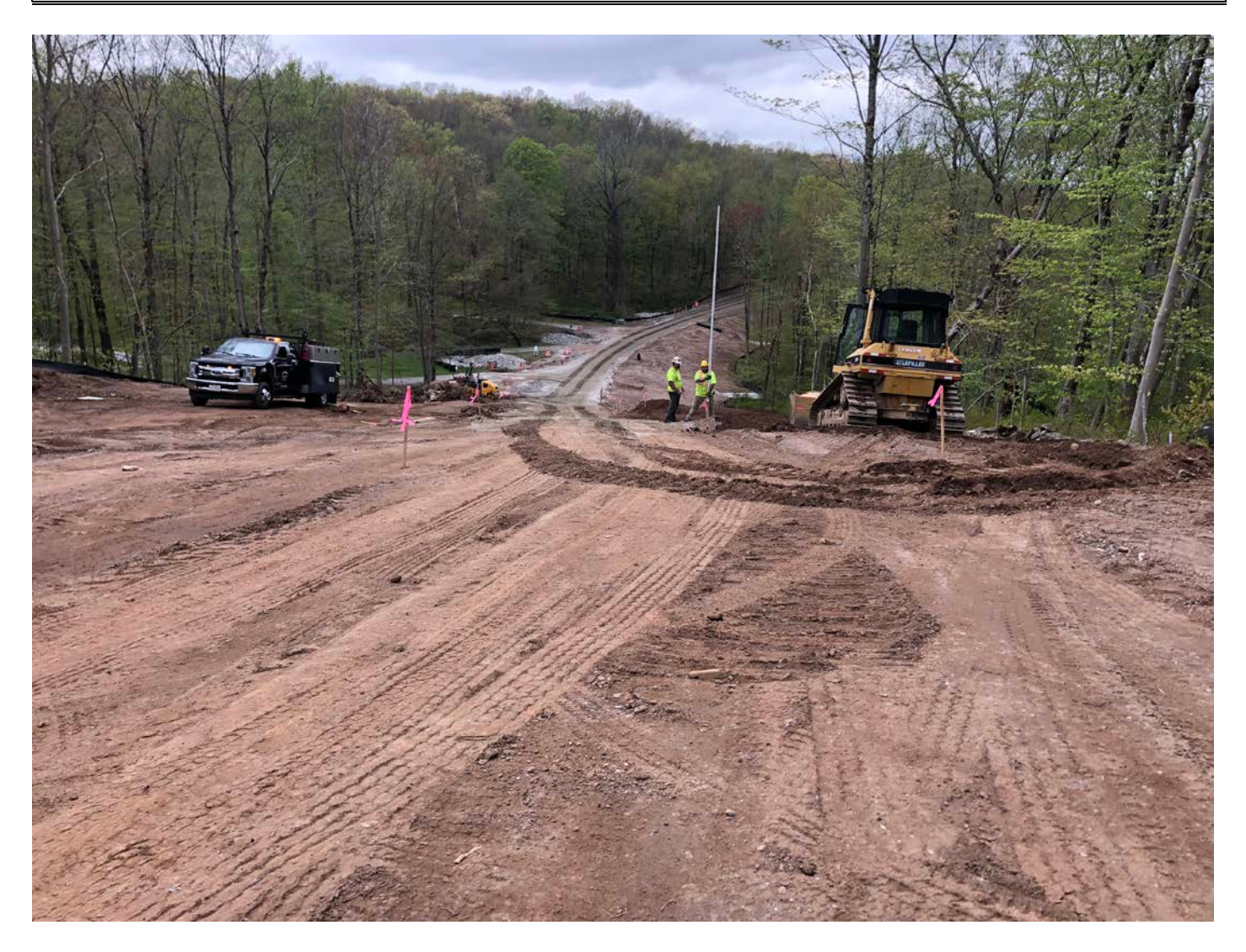
Picture 7: Overview of progress on the shared access driveway from ~10+00. View to the west. Middletown, CT.