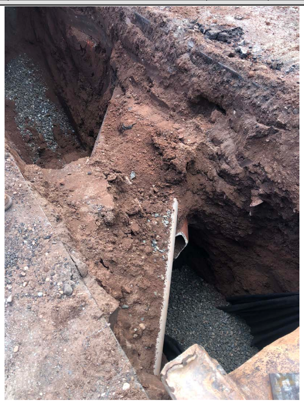
Picture 5: Utilities daylighted at Station 503+50: two conduits of 4" PVC and an 8" clay pipe beneath the PVC that was damaged during excavation. Durham, CT.