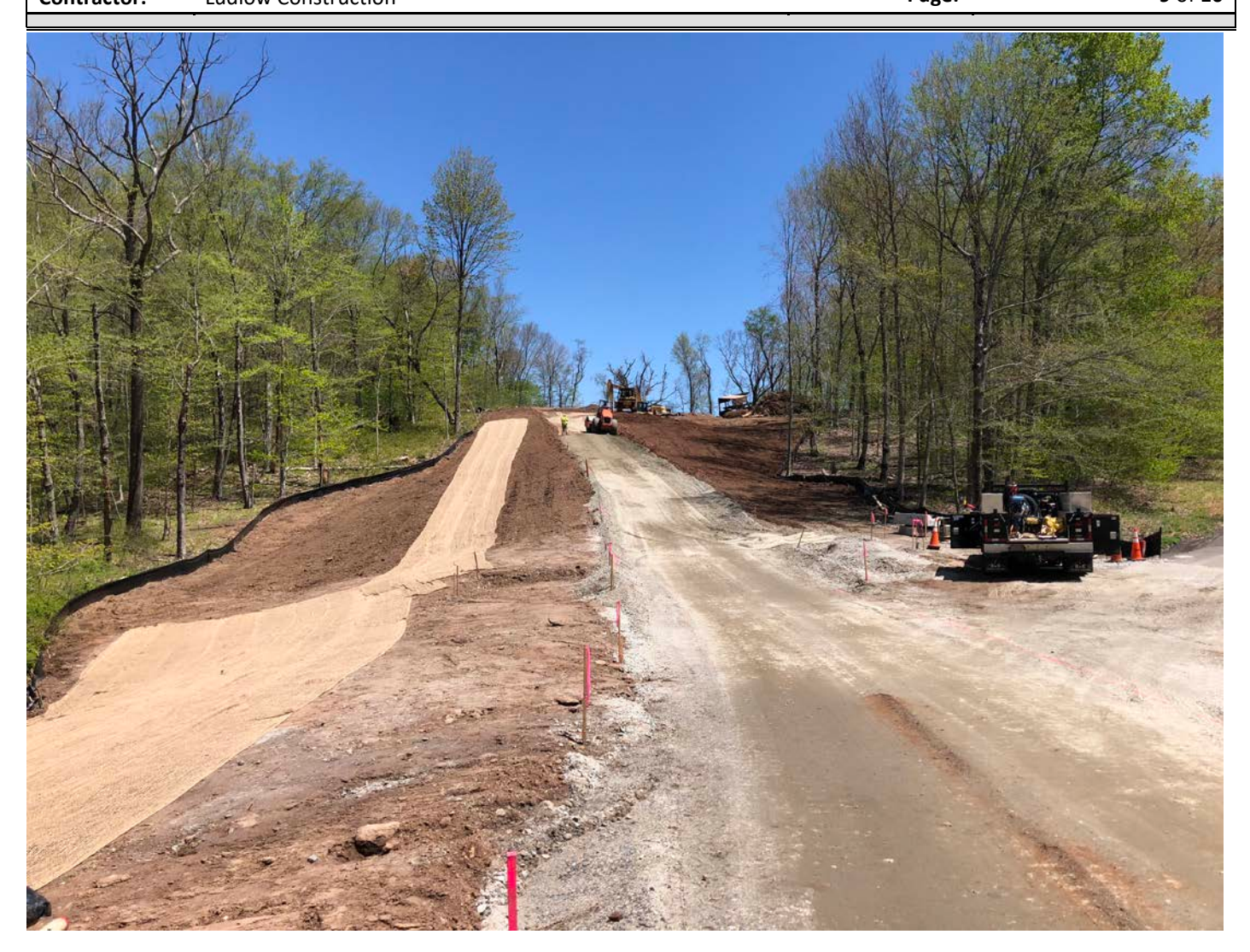
Picture 6: Overview of progress at the shared access driveway. View to the east from ~Station 15+00. Durham, CT.