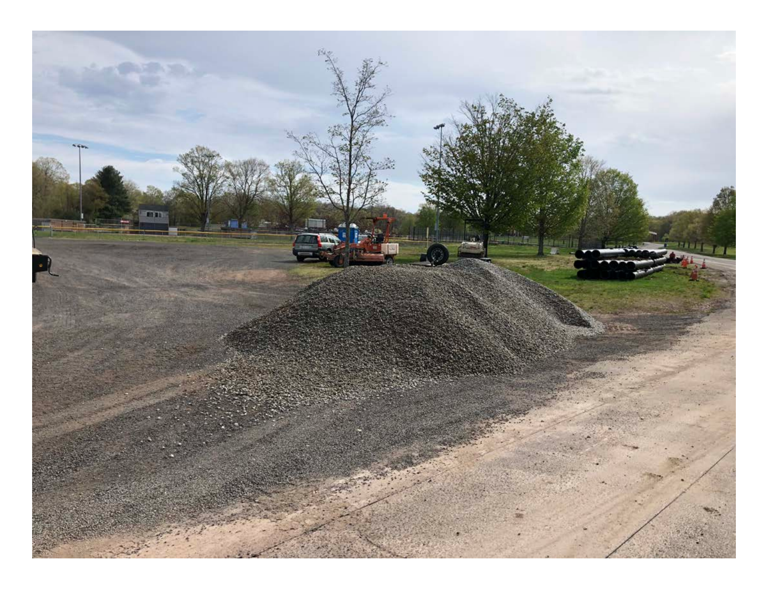
Picture 4: Gravel stockpile located at the Station 518+00 staging area. View to the east. Pickett Lane, Durham, CT.