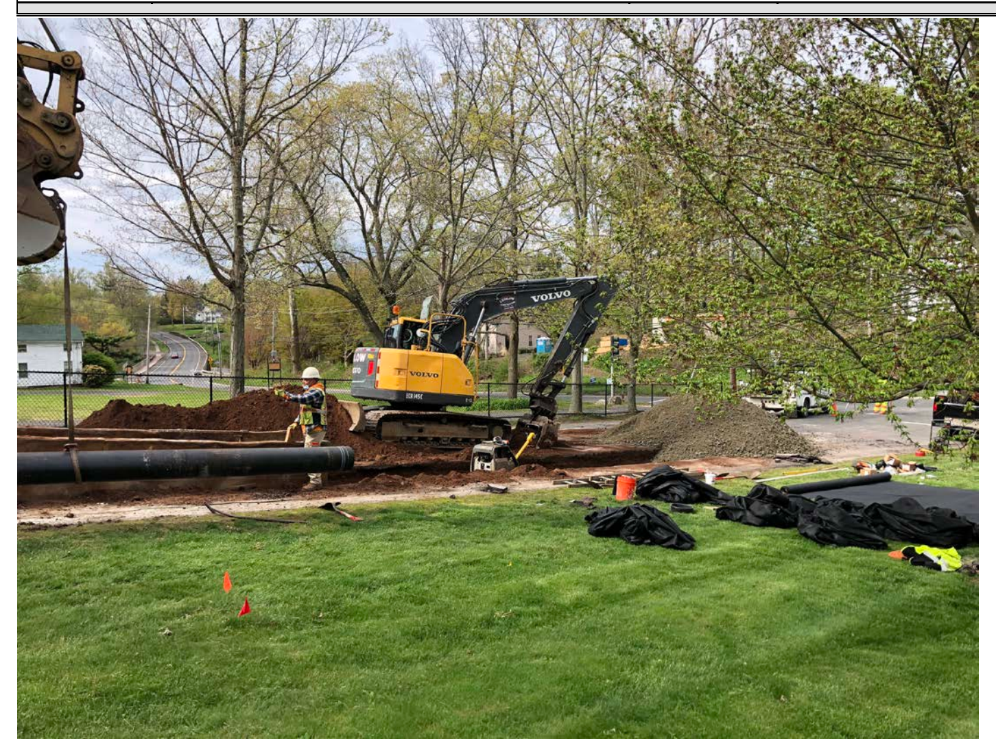
Picture 5: Ludlow placing 12" DIP on Pickett Lane at ~Station 501+40. View to the southwest. Durham, CT.