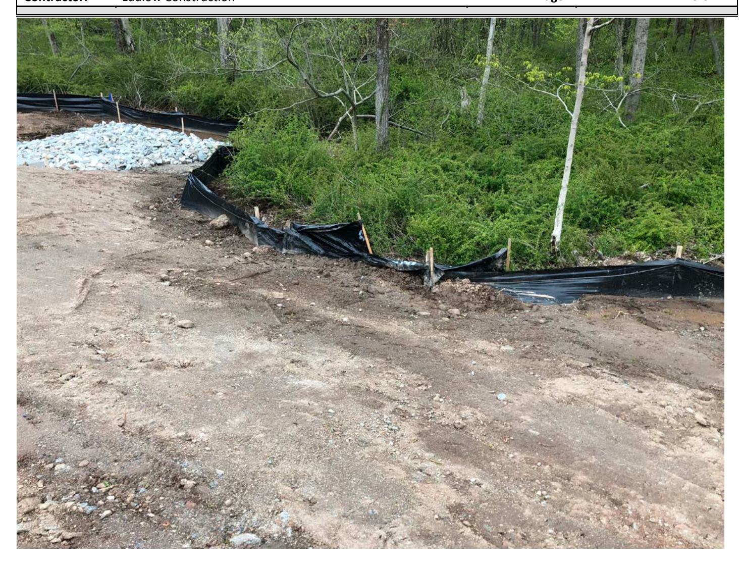
Picture 6: Minor break in silt fence north of 14+40. View to the northwest. Middletown, CT.

Project #:AECOM: 6061487Report No:75Contractor:Ludlow ConstructionPage:9 of 12