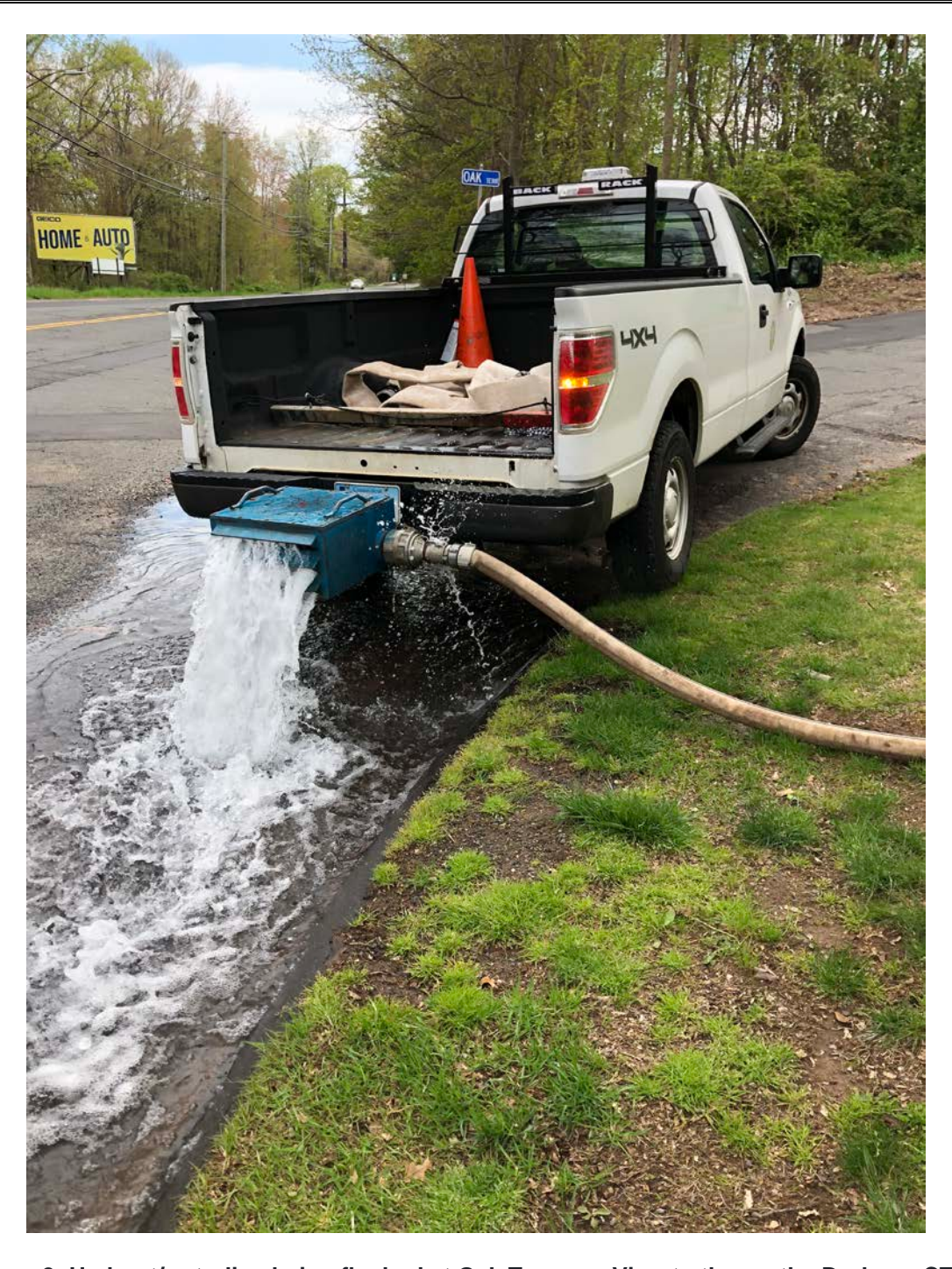
Picture 2: Hydrant/waterline being flushed at Oak Terrace. View to the north. Durham, CT.