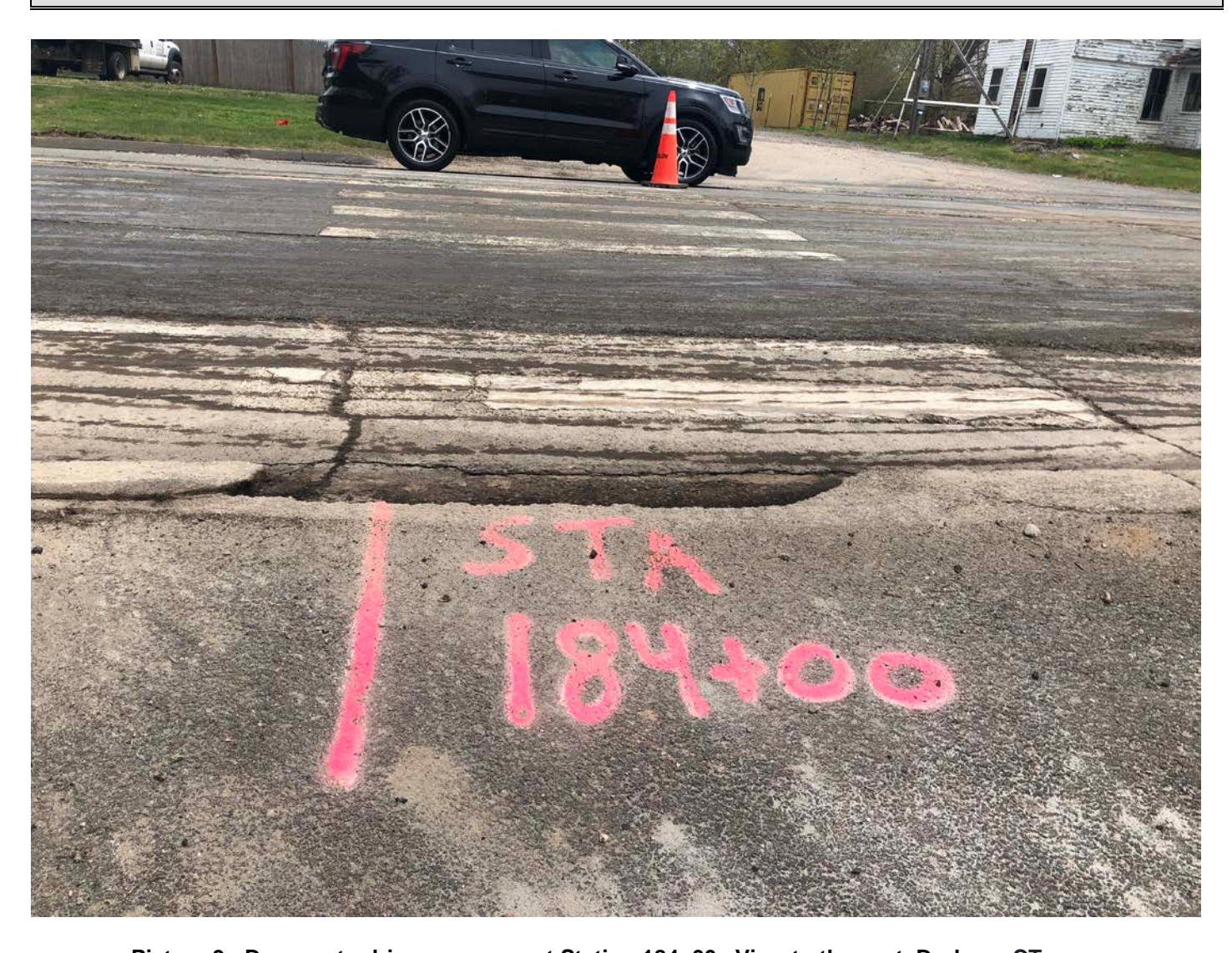
Picture 9: Damage to driveway apron at Station 184+00. View to the east, Durham, CT.