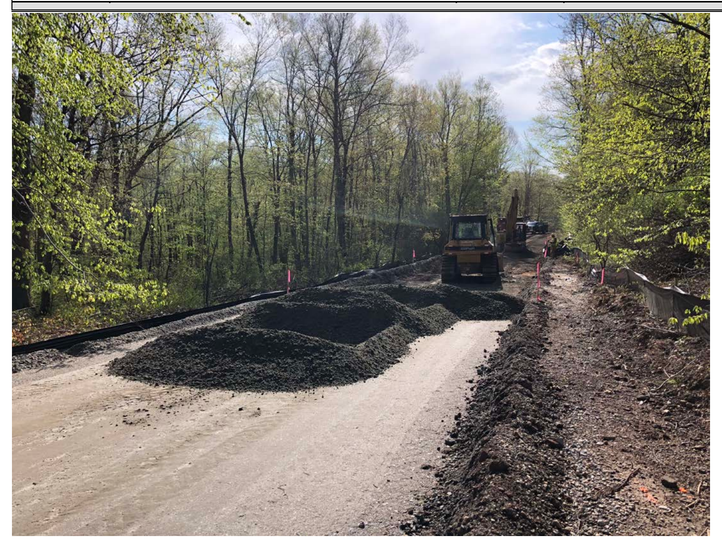
Picture 1: Ludlow filling and grading on the shared access driveway at Station 21+00. View to the east. Middletown, CT.