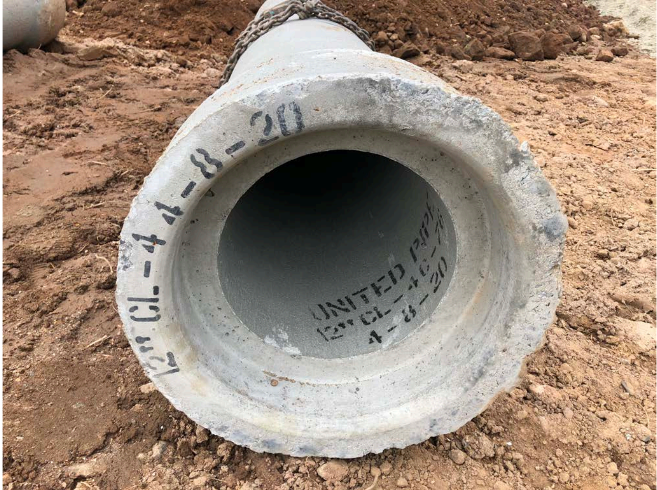
Picture 4: Example of 12" RCP placed between Stations 13+00 and 11+73 today. Middletown, CT.