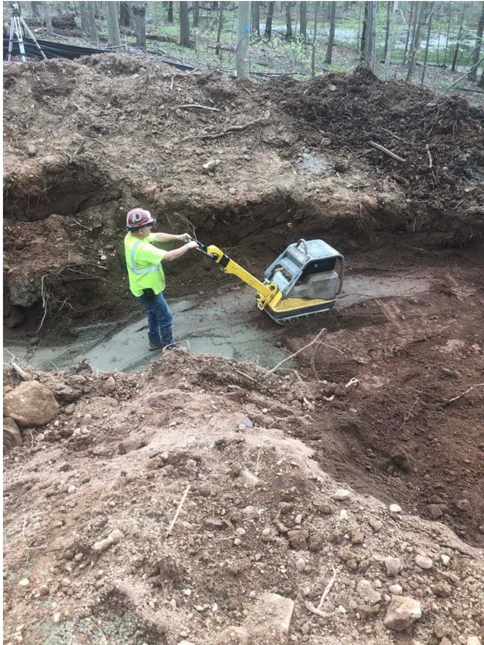
Picture 7: Ludlow compacting sand over 12" RCP that was placed northwest of the catch basin that was installed at Station 11+73 today. View to the south. Middletown, CT.