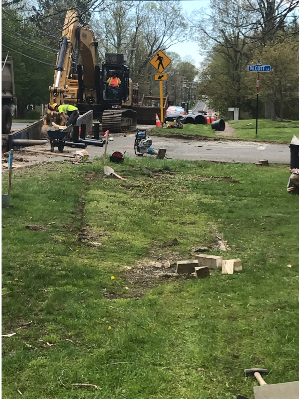
Picture 9: Ludlow installing a 16"x16"x8" M.J. C.L.D.I. TEE with two 16" butterfly valves and one M.J. gate valve at Station 175+29. Ludlow placed 16" DIP through, and south of, the intersection of Main Street and Talcott Lane today. View to the south. Durham, CT.