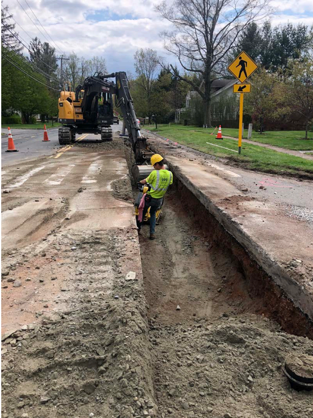
Picture 6: Ludlow compacting -3" gravel at Station 175+29. Main Street, Durham, CT. View to the south.