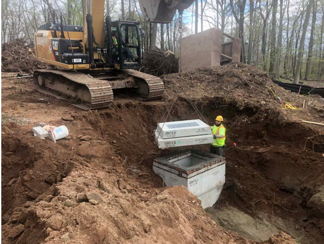
Picture 8: Ludlow installing a Type CL catch basin at Station 11+73. View to the southeast. Middletown, CT.