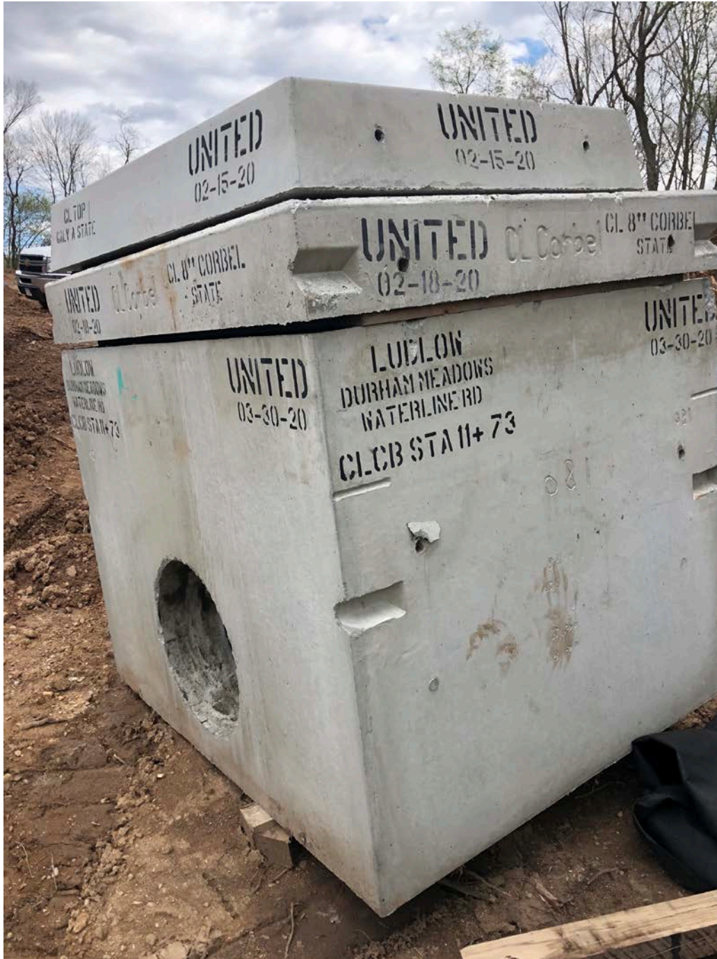
Picture 5: Type CL catch basin installed at Stations 11+73 today. Middletown, CT.