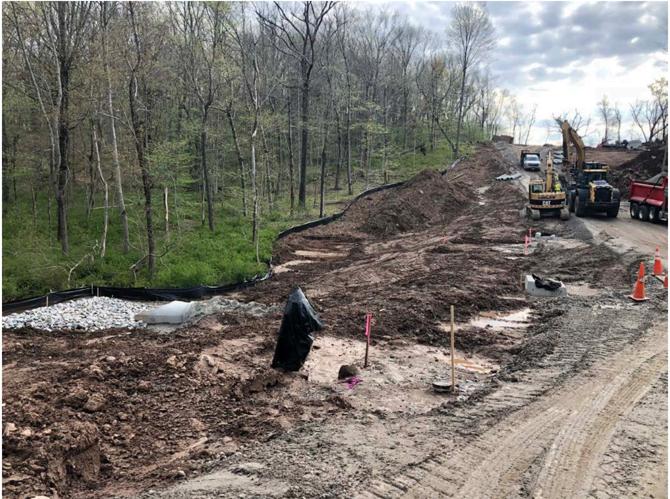
Picture 2: Overview of progress. Shared access road, View to the east. Middletown, CT.