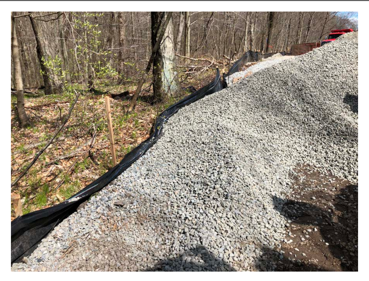
Picture 8: \frac{3}{4} " stone crowding silt fence located on the north side of the shared access road. View to the northeast. Middletown, CT.

Res. Representative: J. Meunier Date: 4/28/20