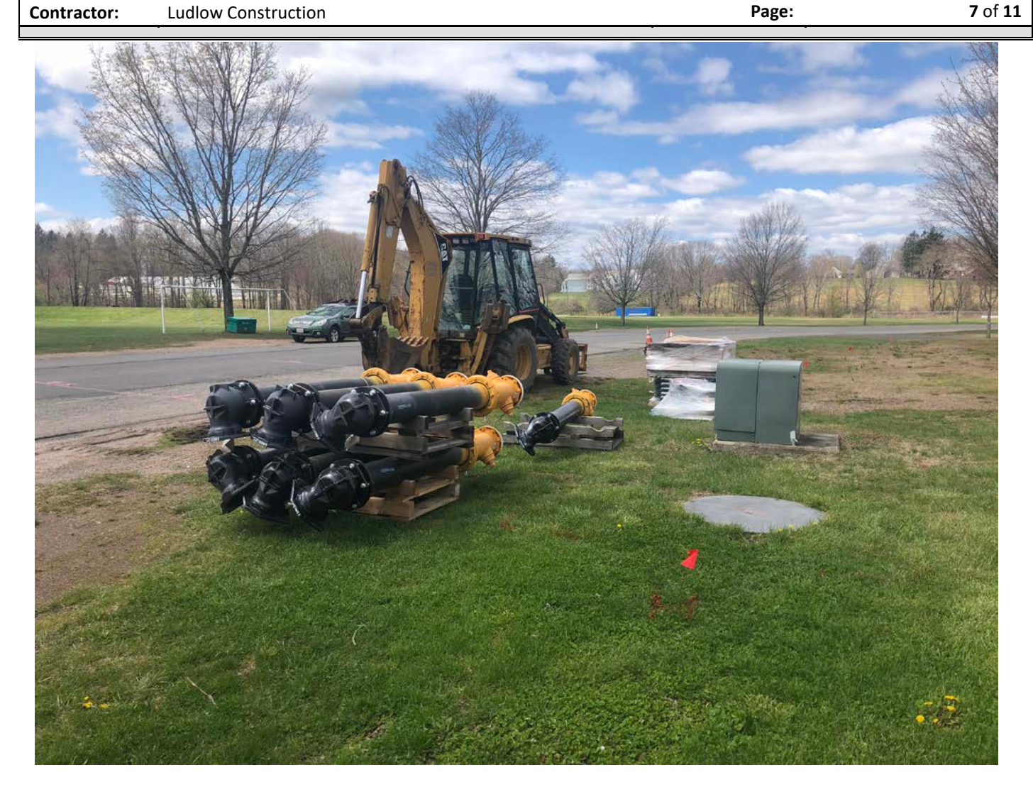
Picture 4: Equipment and materials Ludlow staged today at Station 518+00. View to the southwest. Pickett Lane, Durham, CT.