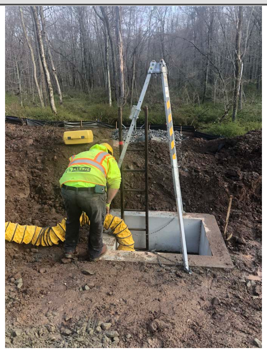
Picture 1: Ludlow preparing to make a confined space entry into the catch basin located on the north side of the shared access road at Station 14+40. View to the north. Middletown, CT.