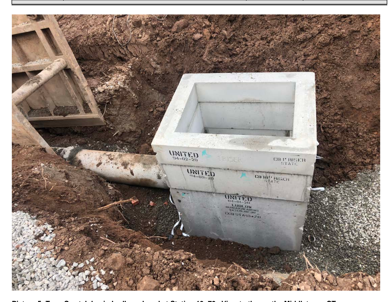
Picture 5: Type C catch basin Ludlow placed at Station 13+70. View to the north. Middletown, CT.