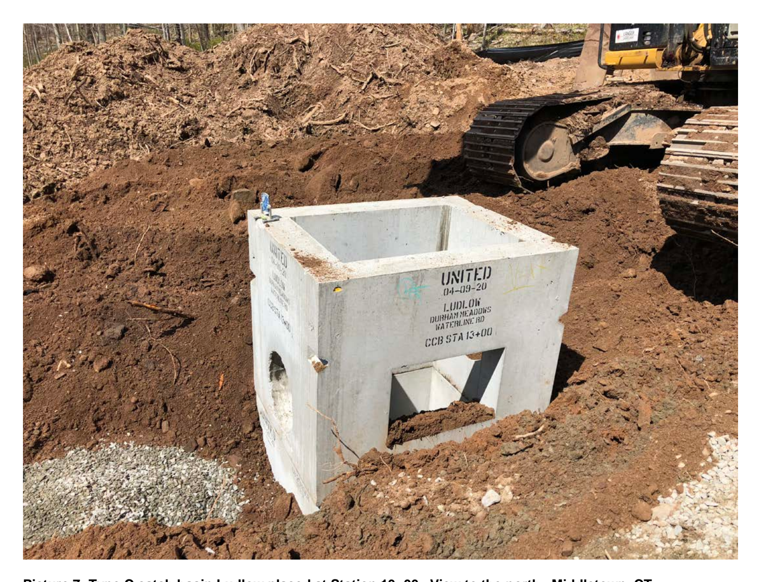
Picture 7: Type C catch basin Ludlow placed at Station 13+00. View to the north. Middletown, CT.