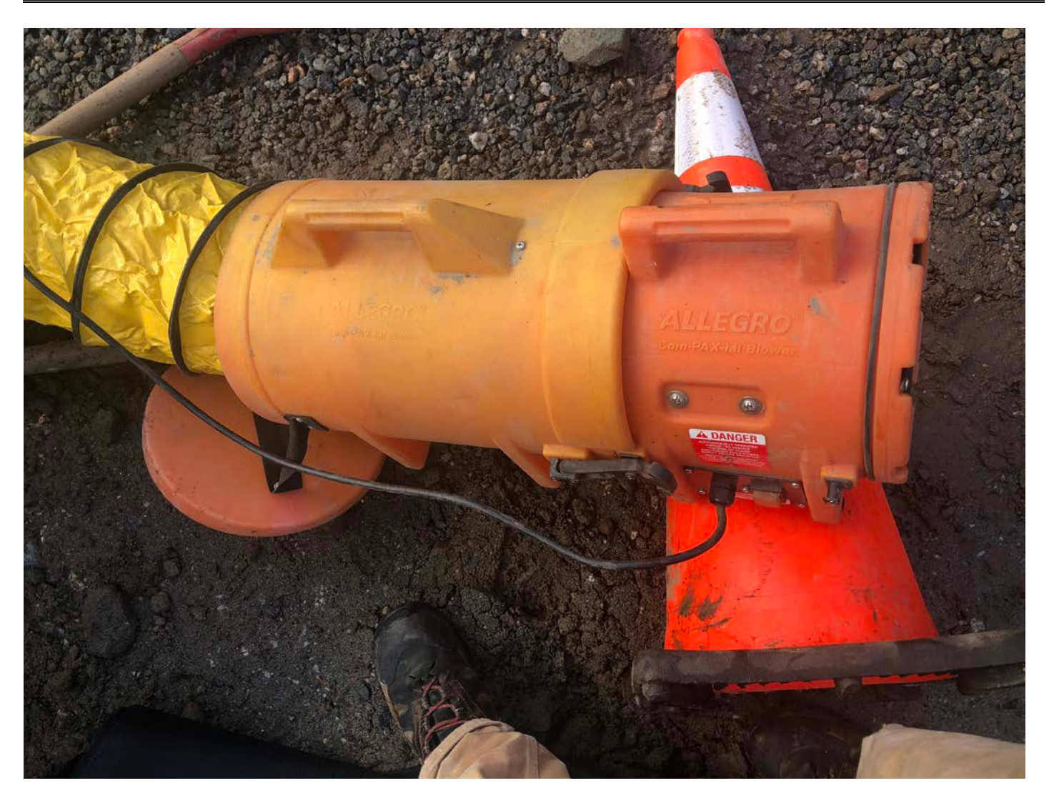
Picture 2: The blower Ludlow used to evacuate air from the catch basin while performing the confined space entry. North side of the shared access road at Station 14+40. Middletown, CT.