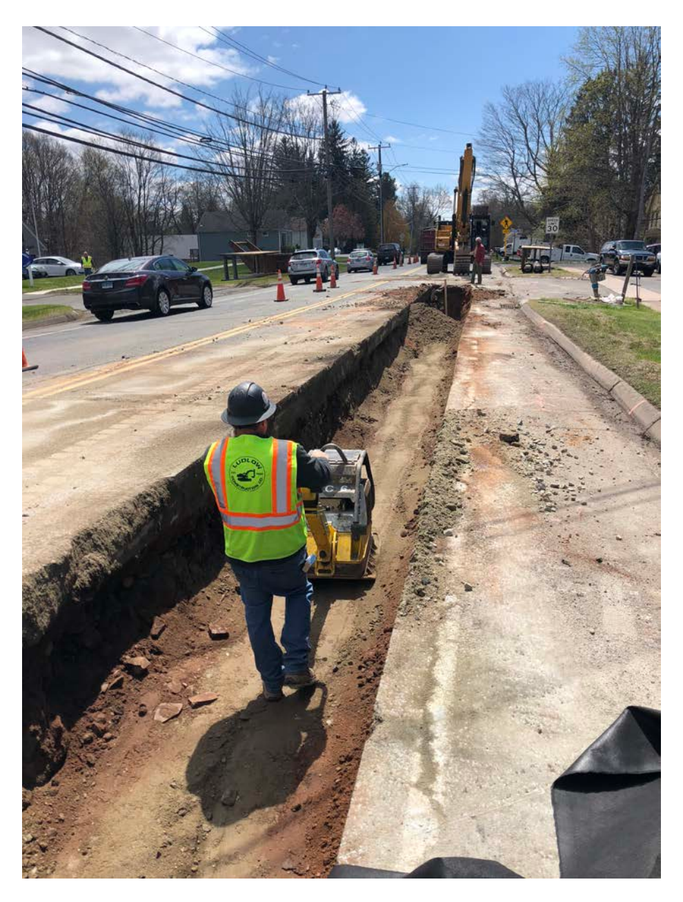
Picture 6: Ludlow compacting -3" gravel along the southbound lane of Main Street. View to the south. ~Station 171+50. Durham, CT.